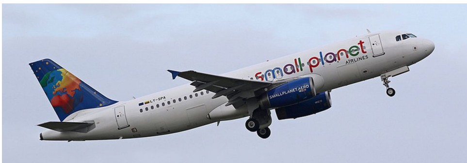
5 March LY-SPA Airbus A320 Small Planet Airlines