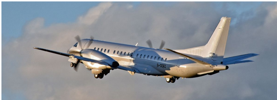
G-CERZ Saab 2000 Eastern 25 April 2016 Rod Hudson

Additional flights:-1/4 G-CERZ(517P) positioned out to Manchester, 3/4 G-CERZ(518P) positioned in from Manchester, 4/4 G-CDEA(016P/017P) positioned in from Aberdeen, positioned out to Southampton, 5/4 G-CERZ(021P/022P) positioned out to/in from Aberdeen, 25/4 G-CERZ(78H) arrived from Norwich, 26/4 G-CISK(021P) positioned in from Bristol, G-CERY(024P) positioned out to Aberdeen, 29/4 G-CHMR(817P/056P) positioned in from Bristol/out to Manchester.