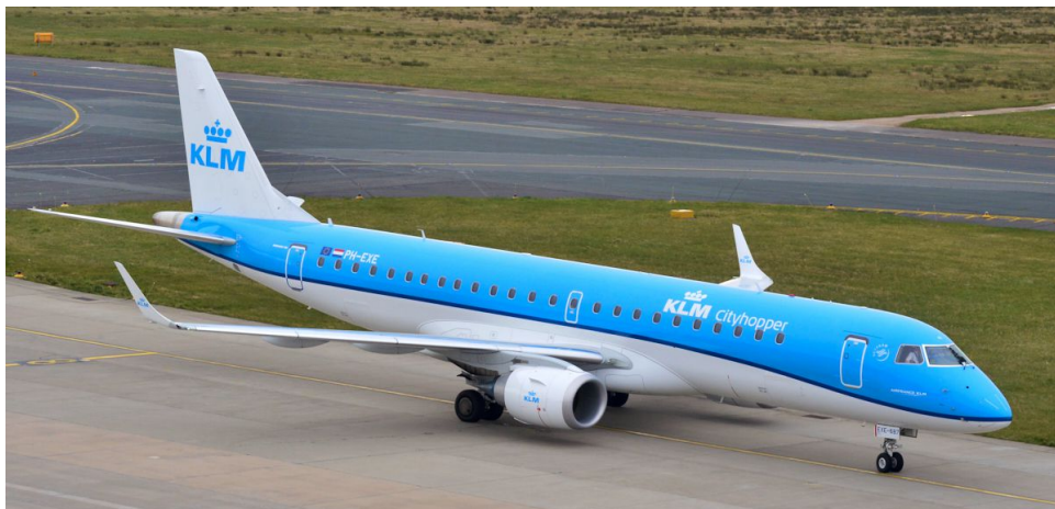
PH-EXE Embraer 190 KLM 1 April 2016

Amsterdam (1551/1540, "69W/78E", aircraft night stops) :-1/4 PH-EZM, 2/4 PH-EZA, 3/4 PH-EZI, 4/4 PH-EZU, 5/4 PH-EZF, 6/4 PH-EZP, 7/4 PH-EZC, 8/4 PH-EZR, 9/4 PH-EZS, 10/4 PH-EZA, 11/4 PH-EZY, 12/4 PH-EZW, 13/4 PH-EZR, 14/4 PH-EZF, 15/4 PH-EZF, 16/4 PH-EZO, 17/4 PH-EZO, 18/4 PH-EZF, 19/4 PH-EXC, 20/4 PH-EZR, 21/4 PH-EZU, 22/4 PH-EZR, 23/4 PH-EZW, 24/4 PH-EZK, 25/4 PH-EZH, 26/4 PH-EZA, 27/4 PH-EXA, 28/4 PH-EZL, 29/4 PH-EZE, 30/4 PH-EZI.