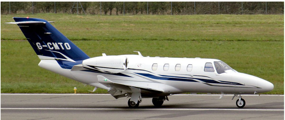
G-CMTO Citationjet 525 MS 22/04