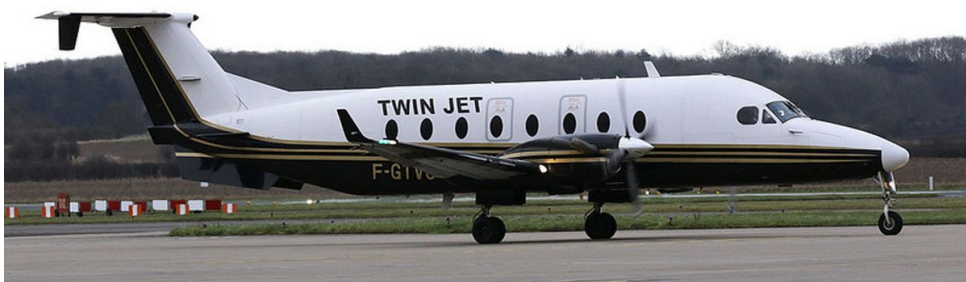
2 March F-GTVC Beech 1900

ALL Photographs courtesy of Rich Grimley Photography unless stated otherwise