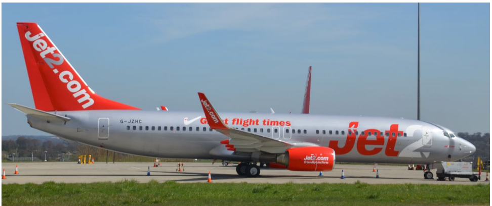
G-JZHC Boeing 737-800 Jet2.com 21 April 2016