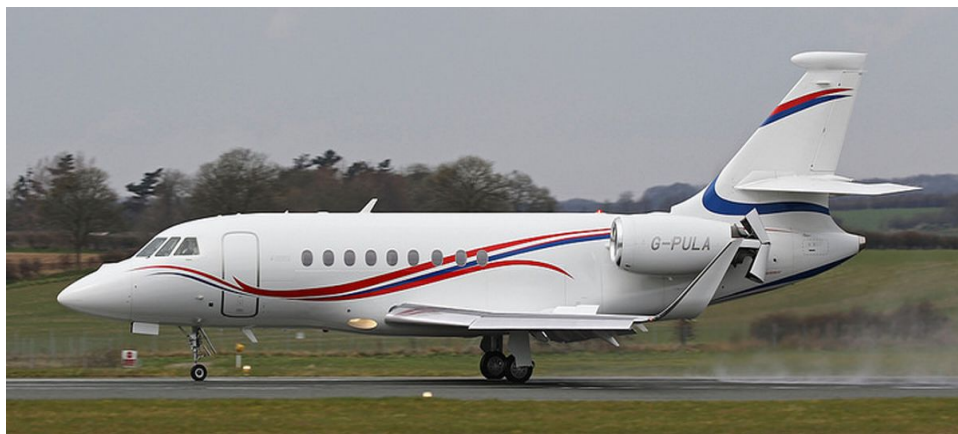
2 April G-PULA Falcon 2000EX