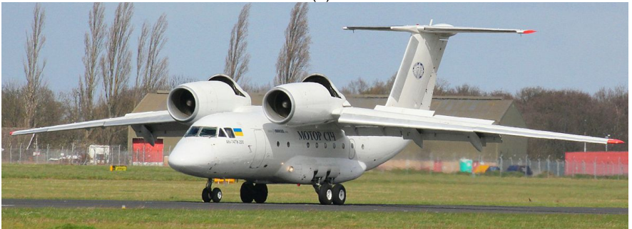
UR-74026 Antanov AN-74 Moto Sich Airlines 06/04