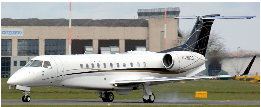
G-WIRG Embraer ERJ-135BJ Legacy 29/04

22nd N841WS Gulfstream IV-X (G450) Advanced Air Management (T) (FV) 26th G-SENT BD-700 Global Express Hangar 8 Management Ltd (T) 28th G-HUBY Embraer EMB-135BJ Legacy 600. London Executive Aviation (T) 28th 9A-DWA CitationJet CJ2+ Winair (Orest-Immorent Leasing GmbH. Wien AT) (FV) +29th 28th CS-GLF BD-700 Global Express Netjets Europe Ltd (FV) 28th OE-FZC Citation 510 Mustang GlobeAir+29th 29th G-WIRG Embraer ERJ-135BJ Legacy 650 Air Charter Scotland (T) (FV)