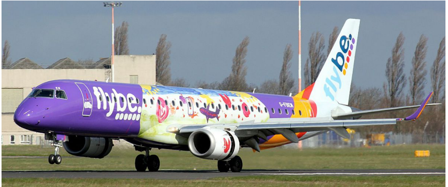
G-FBEM ERJ-195 Flybe taken 06/04