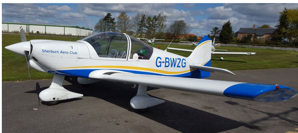
G-BWZG Robin R2160 Sherburn 23/04/16