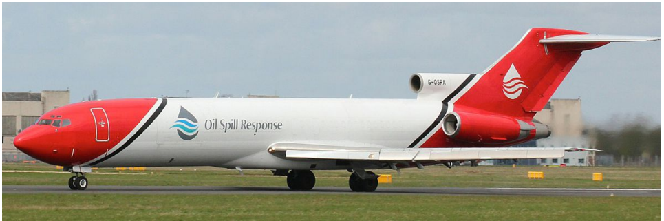
G-OSRA Boeing 727 T2 Aviation 06/04

(FV) First Visit. (T) Training. (H) Helicopter. (F) Freighter. (M) Maintenance (RTB) Return to Base