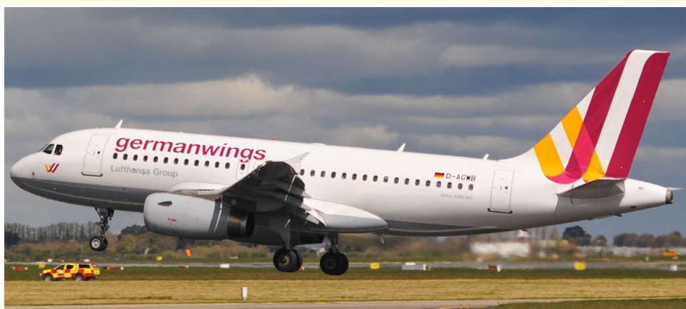
D-AWGB Airbus A319 Germanwings Dublin 27/04/16 (Steve Lord)