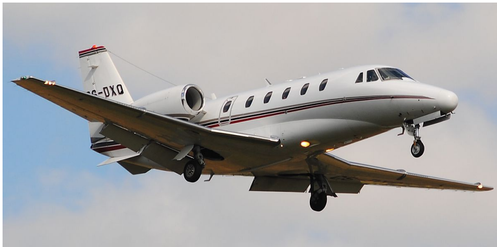
CS-DXQ Cessna 560XL Citation 09/04 Steve Lord

Cessna 560 Excel CS-DXQ arr 11:22 from Palma as NJE986C dep 12:55 to Le Bourget as NJE382C, Beech 200 Super Kingair G-ZVIP arr 12:05 fr Faro dep 14:59 to Exeter, Hawker 800 G-VIPI arr 12:24 fr Chambery-Savoie dep 13:19 to Biggin Hill,