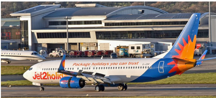
G-JZHF Boeing 737-8K2 Jet2.com 25 April 2016 Rod Hudson