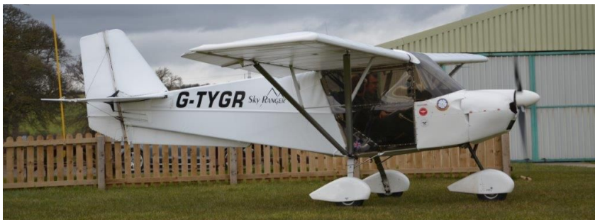
N370WC PA-32-300 Cherokee Six from Bagby for work with RS