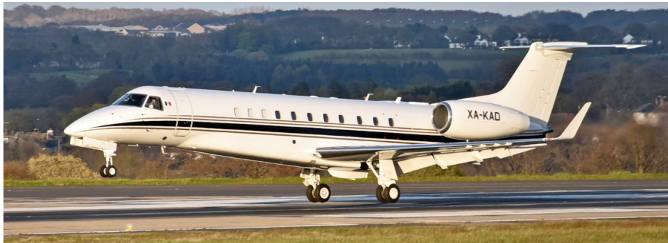
XA-KAD ERJ-135BJ Legacy 600

Beech Kingair 350 M-CRAO arr 08:25 fr Bielefeld dep 09:06 to Manchester, Cessna 404 Titan G-MIND arr 12:55 fr EMA, Gulfstream G550 CS-DKI arr 15:23 fr Dublin as NJE226E n/s, Legacy XA-KAD arr 18:36 from Barcelona.