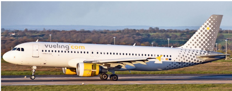
EC-KHN Airbus A320-216 Vueling 25 April 2016 Rod Hudson

Barcelona (8794/8795) :-1/4 EC-MKM, 4/4 EC-JFF, 8/4 EC-MBS, 11/4 EC-LML, 15/4 EC-LOB, 18/4 EC-LZN, 22/4 EC-MJC, 25/4 EC-KHN.