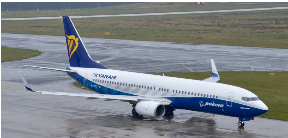
EI-DCL Boeing 737-800 Ryanair 2 April 2016

Tenerife (2493/2492 "56ZW/47JH" -various):-2/4 EI-DCL, 9/4 EI-EKZ, 16/4 EI-EKZ, 22/4 EI-DHP, 23/4 EI-EKZ, 30/4 EI-ENG.