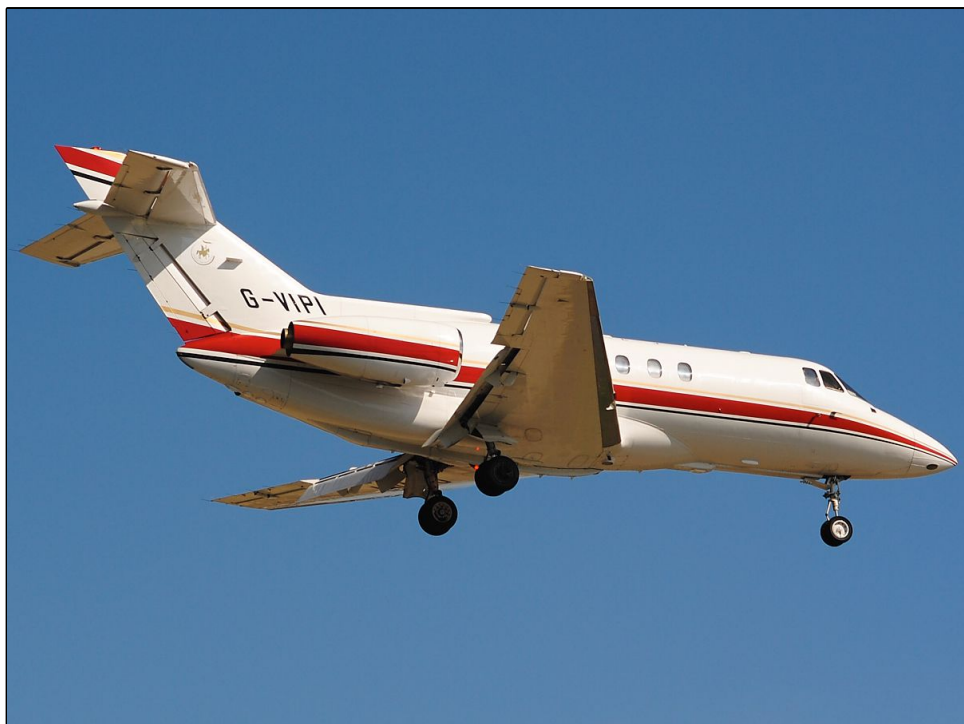
G-VIPI BAe 125-800B Executive Jet Charter Leeds/Bradford 9 April 2016