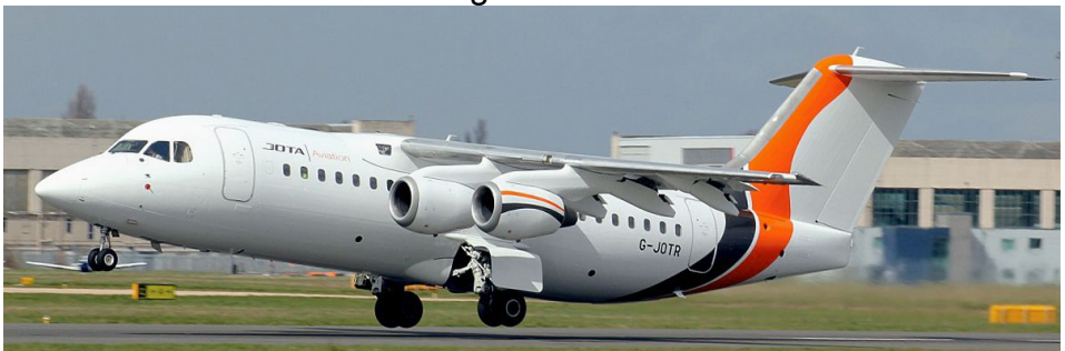
G-JOTR Avro RJ-85 Jota Aviation 06/04