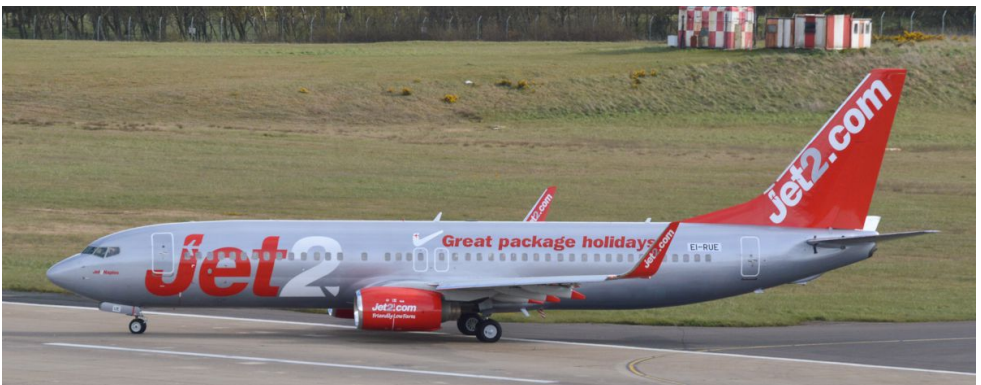
EI-RUE Boeing 737-800 Jet2.com 29 April 2016