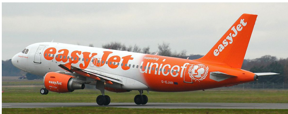
G-EJAR Airbus A319 Easyjet Doncaster 08/04/16