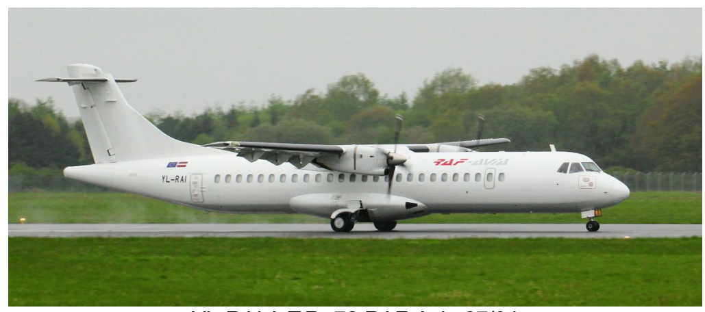
YL-RAI A.T.R.-72 RAF-Avia 27/04