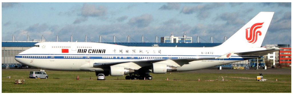
Prague B2472 Boeing 747-4J6 Air China