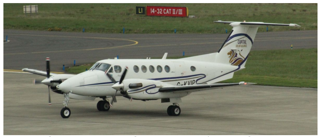
G-KVIP Beech 200 Super Kingair 23/04 Mike Storey

Cessna 560 Encore D-CAWR dep 02:21 to Luton, Aerospool WT9 Dynamic SP-SPID arr 16:00 dep 16:47 to Elstree, Learjet 75 G-ZNTH arr 17:52 fr Glasgow dep18:23 to Biggin Hill, Beech 200 Kingair G-KVIP arr 17:56 fr Faro dep 19:53 to Exeter,