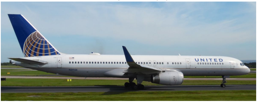
N29124 Boeing 757-200