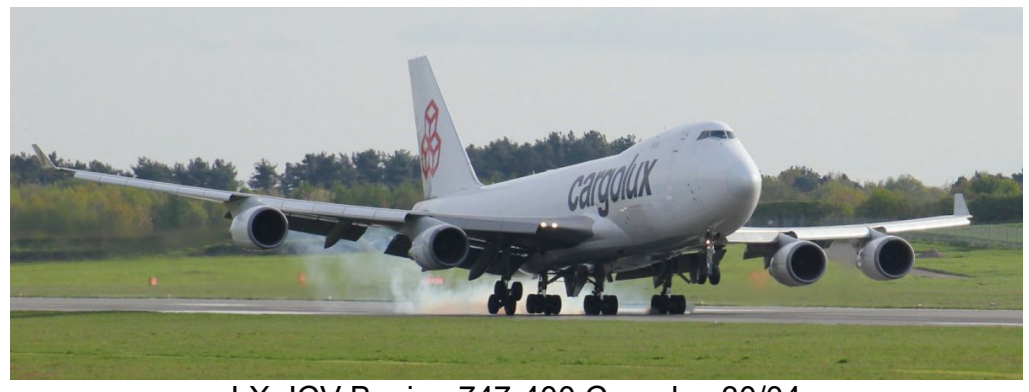
LX-JCV Boeing 747-400 Cargolux 30/04