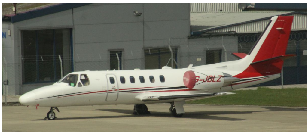
G-JBLZ Citation N550 Bravo 14/04 Mike Storey

Challenger 350 CS-CHG dep 12:19 to Oporto as NJE219D.