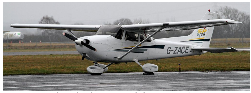
G-ZACE Cessna 172S Skyhawk 01/04

01/04 G-ZACE Cessna 172S Skyhawk arrived 30/03 t/f Local flight t Sywell Sywell Aerodrome Ltd