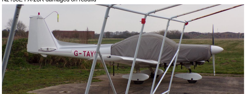
G-TAYI G.115 08/04

G-OAJS PA-39, G-TAXI PA-23 wfu, G-TAYI G.115, G-WLGC PA-28, N39TA Beech C24R wreck, N131MP PA-31P (to be G-BWDE on rebuild), N337UK F.337G, N808CA PA-32R, N2136E PA-28R damaged on rebuild