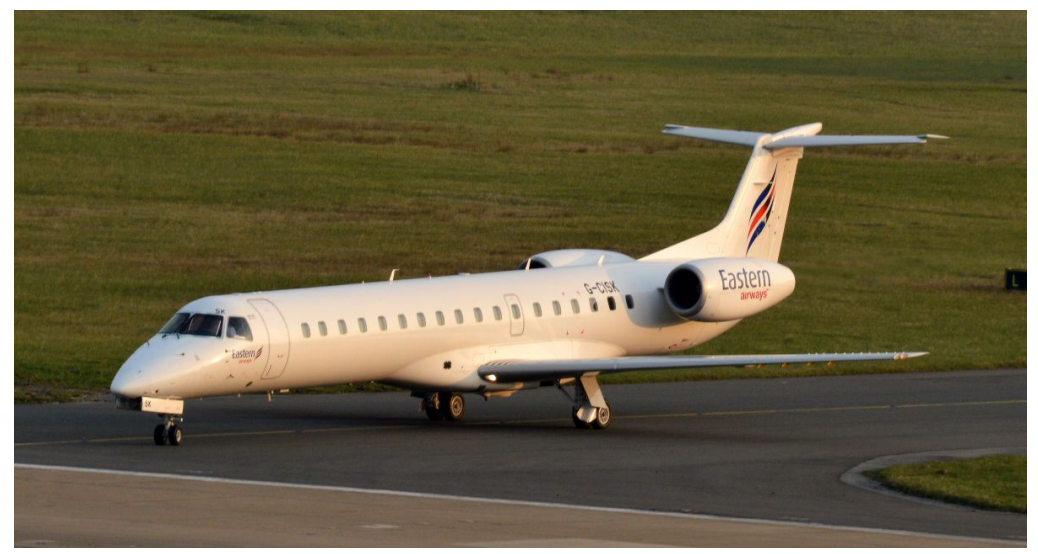
G-CISK Embraer 145 Eastern Airways 14/04

Additional flights:-3/4 G-MAJD(022P) positioned in from Aberdeen, 6/4 G-CDKB(056P/9610) positioned in from East Midlands/operated charter out to Biggin Hill, G-IACY(051P) positioned out to Aberdeen, 7/4 G-MAJK(962P/963P) positioned out to/in from Luton, G-CERY(9611/062P) operated charter in from Biggin Hill/positioned out to Aberdeen, 9/4 G-CIEC(031P) positioned in from Aberdeen, 11/4 G-CEERY(033P) positioned in from Humberside, 12/4 G-MAJB(12W) positioned in from Humberside, 13/4 G-CDKB(052P) positioned out to Aberdeen, G-CISK(959P) positioned in from Liverpool, G-CERY(947P) positioned in from Oxford, 14/4 G-CDKB(061P) positioned out to Saint Brieuc, 14/4 G-CERY(062P) positioned out to Aberdeen, G-CISK(9627) operated charter to Luton, G-CFLU(972P) positioned in from Newcastle, 17/4 G-MAJZ(022P/023P) positioned out to Aberdeen/n from Hawarden, 19/4 G-MAJD(045P) positioned in from Southampton, 20/4 G-CERZ(053P) positioned out to Humberside, 24/4 G-MAJK(7646) arrived from Humberside, 25/4 G-CERY(10W) positioned in from Humberside,