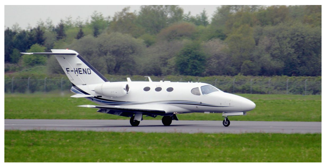
F-HEND Cesna 510 Citation Mustang 27/04