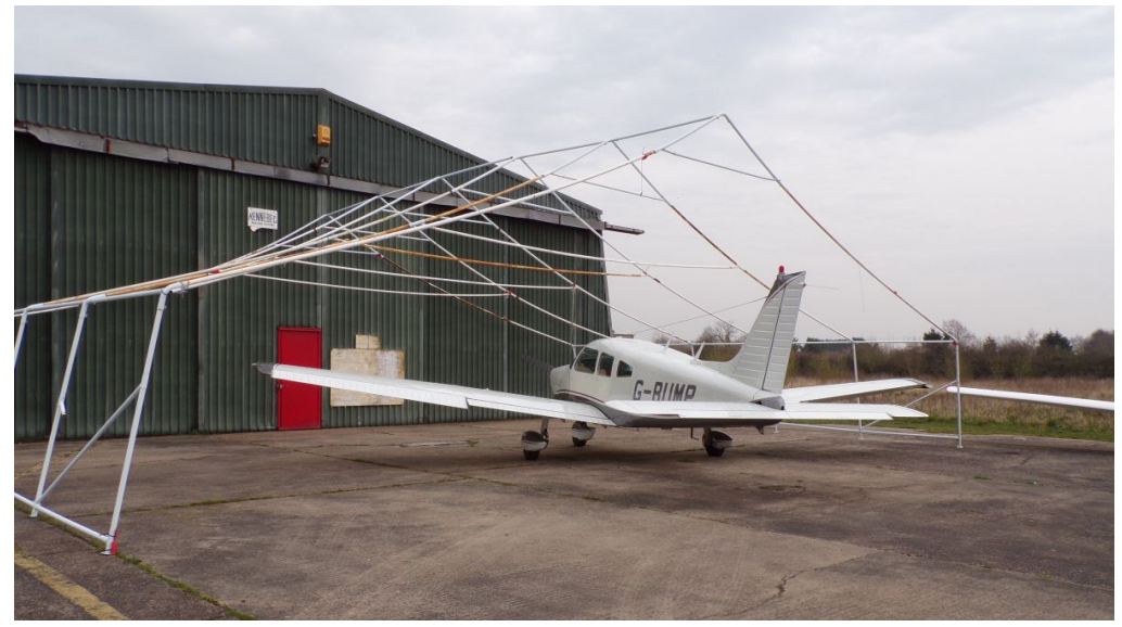
G-BUMP PA-28 07/04