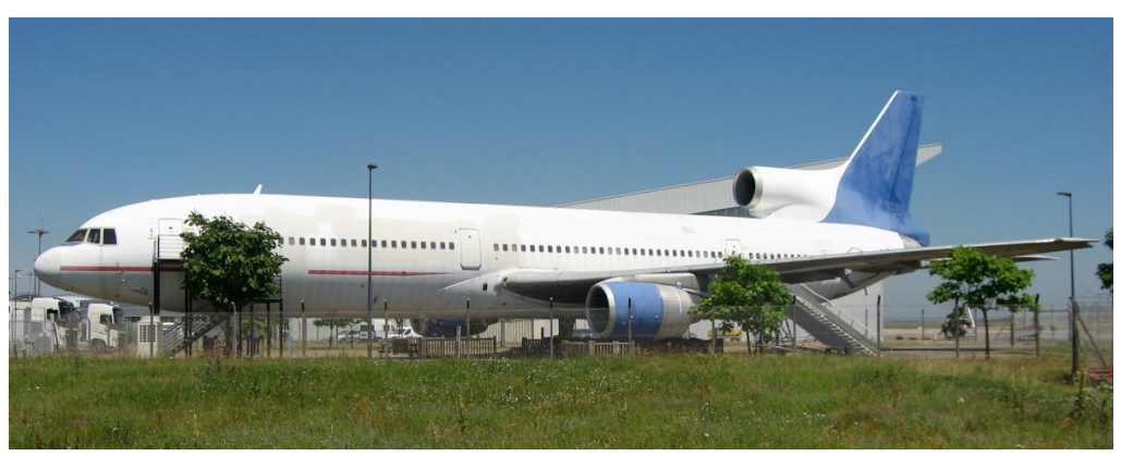
Lyon - Saint Exupéry C-DTNA Lockhead L1011 Tristar