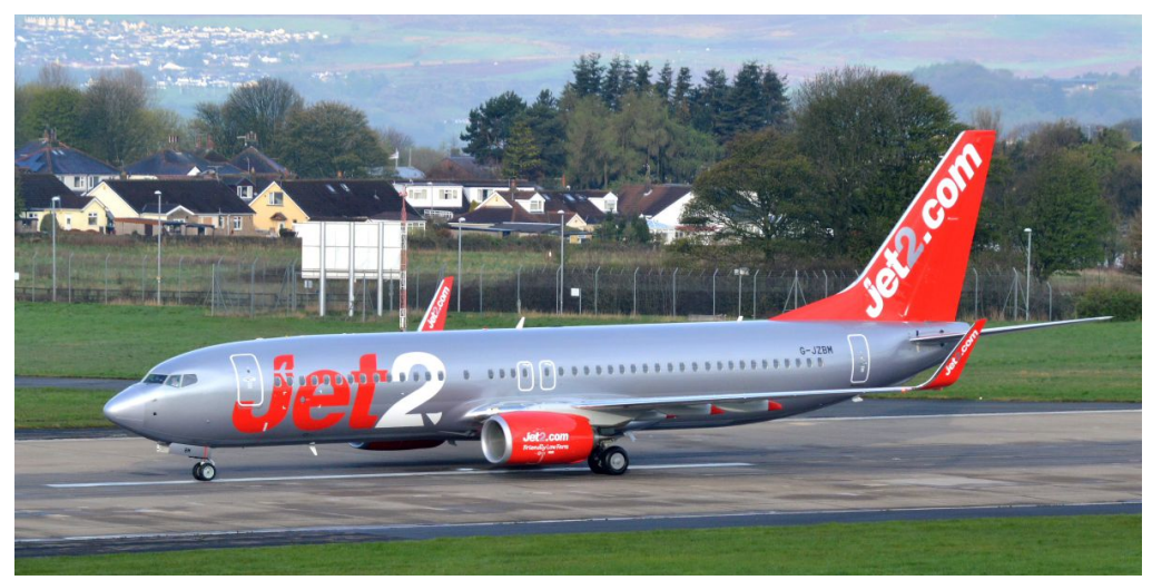
G-JZBM Boeing 737-800 Jet2.com 28/04

positioned out to Manchester, G-GDFB(031E) positioned in from Bournemouth, 27/4 G-GDFB(041A) positioned out to Belfast, G-GDFM(049A) positioned out to Belfast, G-JZHB(043A) positioned in from Prague, G-GDFN(051B) test flight, 28/4 G-JZBM(737) delivery flight from Boeing Field, G-GDFM(035E) positioned in from Belfast, 29/4 G-LSAA(059B) test flight, G-LSAG(031R) positioned out to Manchester, 30/4 G-GDFE(031E) positioned in from East Midlands, G-GDFL(035E) positioned out to Belfast, G-GDFM(033E) positioned out to East Midlands, G-LSAG(031R) positioned in from Manchester.