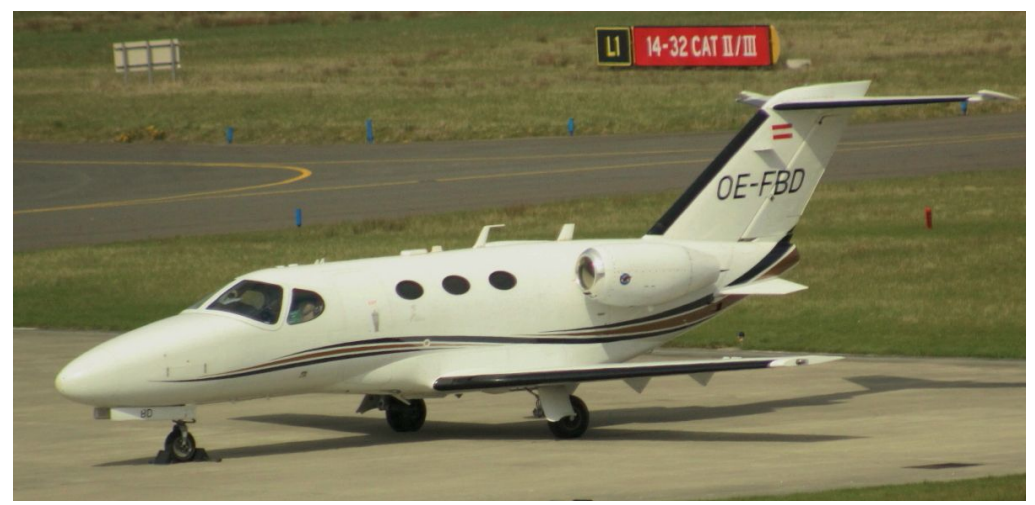
OE-FBD Cessna 510 Mustang 14/04 Mike Storey

Cessna 550 Bravo G-JBLZ arr 09:50 fr IOM until 16<sup>th</sup>, Cessna 210M G-TOTN dep 10:00 to IOM, Cessna 510 Mustang OE-FBD arr 11:24 fr Luton ret at 17:45, Cirrus SR20 N203CD (csn 1451) arr 13:05 fr Liverpool for maint until 30<sup>th</sup>,