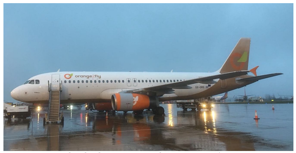
SX-ORG Airbus A320 Orange2Fly 02/04

The company operates one off charters using A320 aircraft 1/4 SX-ORG(182P) positioned in from Ben Gurion, 2/4 SX-ORG(1804/1803/183P) operated charter to/from Perpignan, then positioned out to Athens