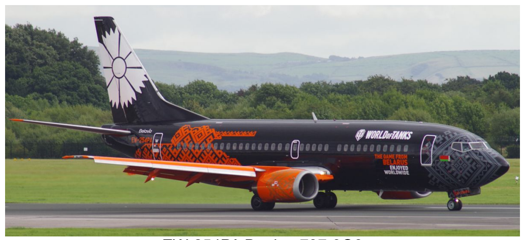
EW-254PA Boeing 737-3Q8