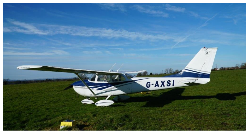
G-AXSI F172H Skyhawk

Southside – private hangar (1 off 2) G-CCEJ EV-97 Eurostar G-CTDH Flight Design CT2K