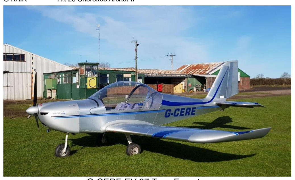
G-CERE EV-97 TeamEurostar

ARC exp 25-8-2017 ARC exp 24-7-2017 permit exp 16-1-2018