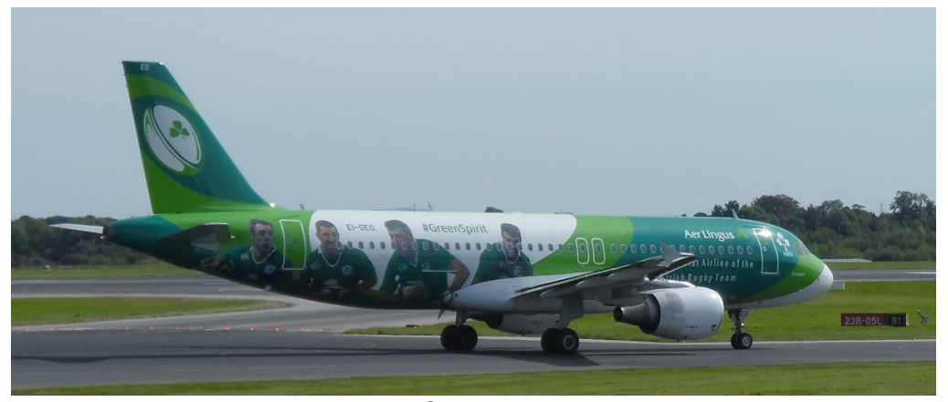
EI-DEO Airbus A320