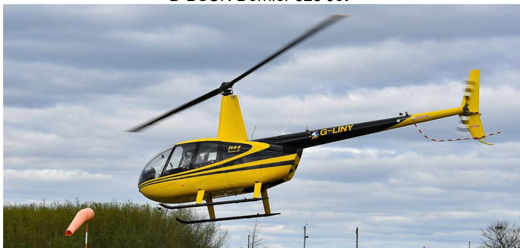
G-LINY Robinson R44