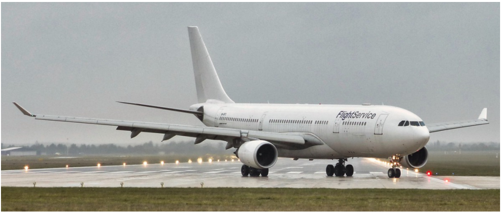
9H-BFS Airbus A330-200 Maletth-Aero 29/04