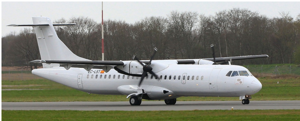
EC-LST A.T.R. 72 Swift Air 03/04