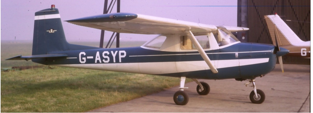
Long term resident trainer Cessna 150 G-ASYP with the square tail went to Henlow and is now short of a home