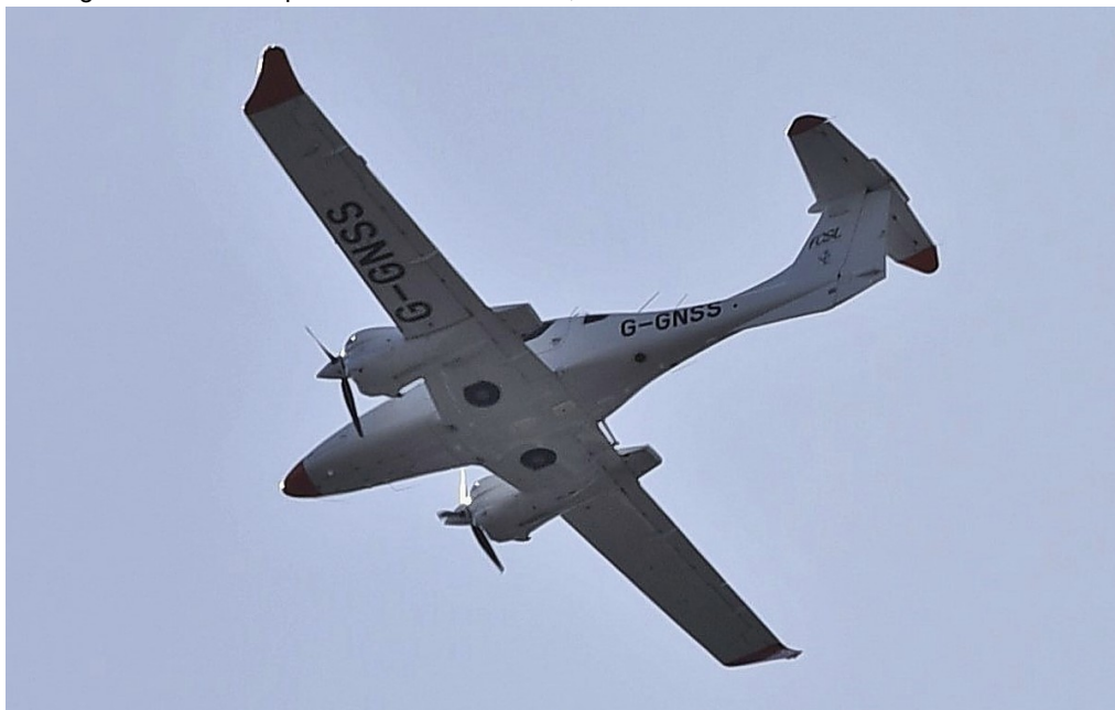
G-GNSS Diamond DA-62 09/04

Beechjet 400 SP-TTA arr 09:19 fr Tallinn dep 10:05 to Malaga, Cirrus SR22 N590CD 09:23 fr Sherburn n/stop, Diamond DA-62 G-GNSS arr 0932 fr Blackpool dep 10:56 ret at 13:08 & dep 14:15 to Shoreham (Flight Calibration), R/C F406 Caravan II G-SMMA dep 09:56 to Inverness, Diamond DA-40 Star G-EMDM f/t Oxford (11:50/16:51), Cessna 525C CJ 4 D-CEFE arr 14:19 fr Zurich dep 15:02 to Stuttgart, Cessna 404 Titan G-BWLF dep 14:48 to EMA, Bell 505 Jetranger X G-JRXV dep 14:49 to Cumbernauld,