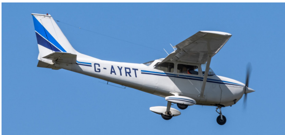
G-AYRT Cessna F172K Skyhawk 16/04