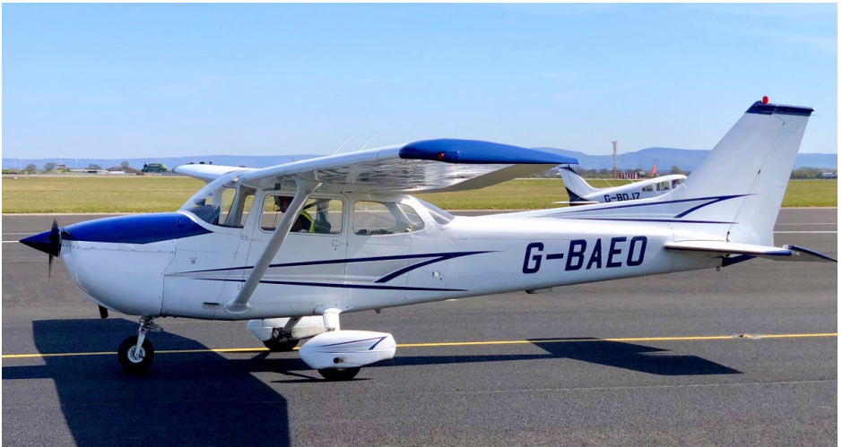
G-BAEO Cessna F172M 23/04