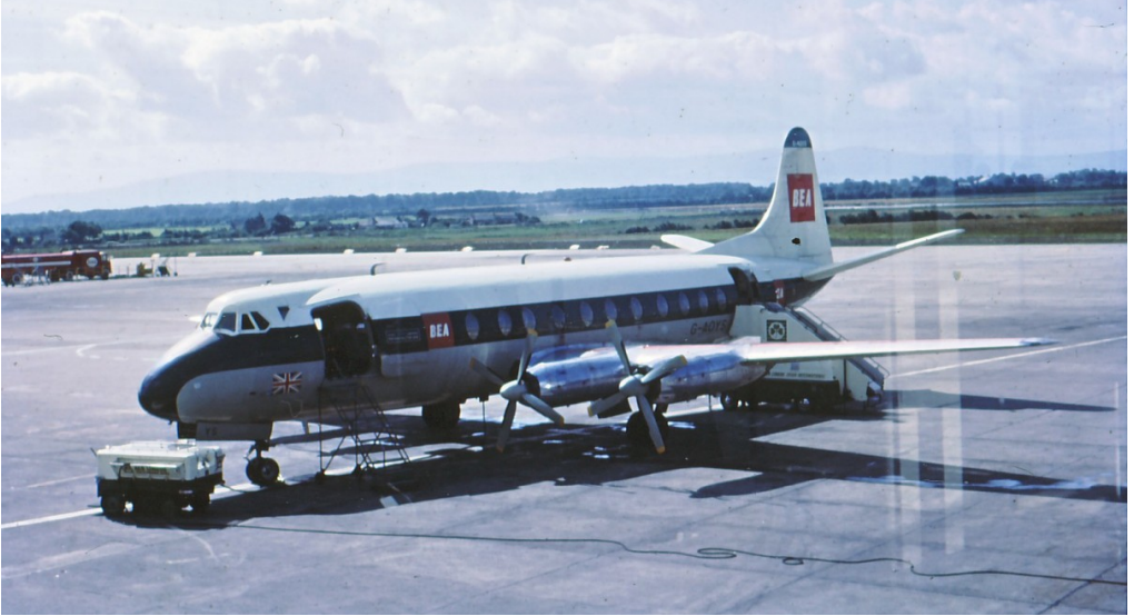
G-AOYS BEA Viscount John Gibbon