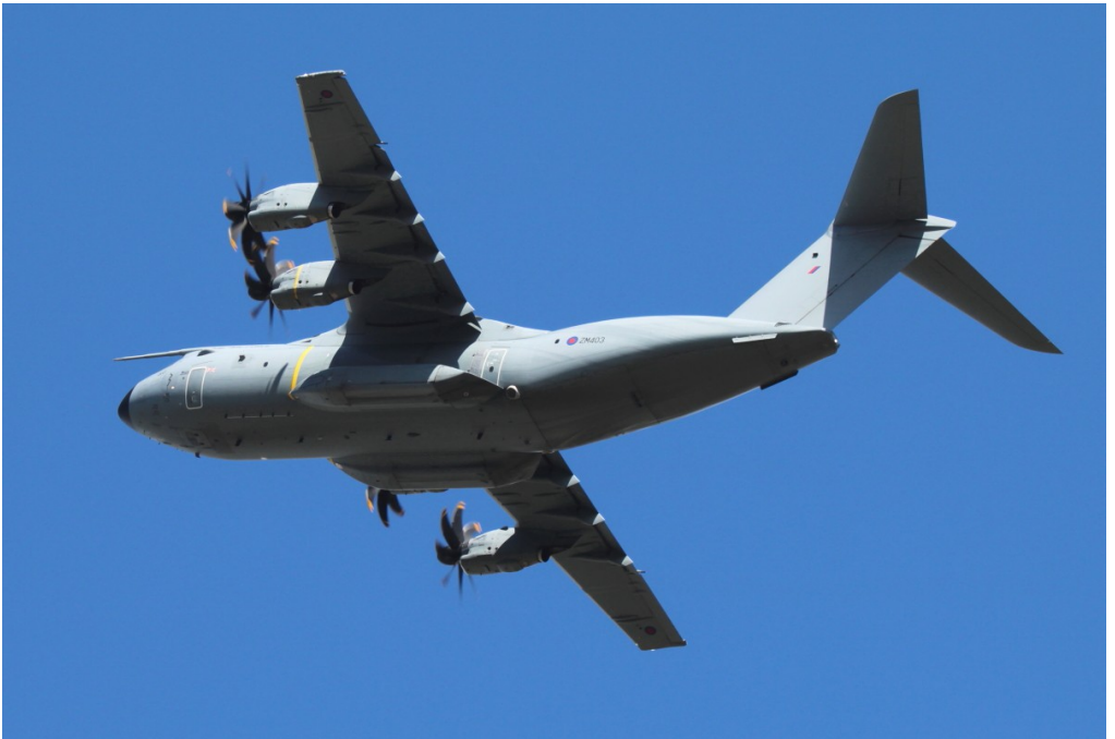
Atlas A400 ZM403 12/04