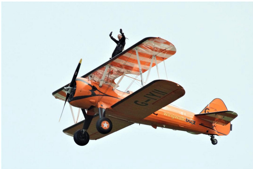
G-IYII Boeing Kaydet 24/04