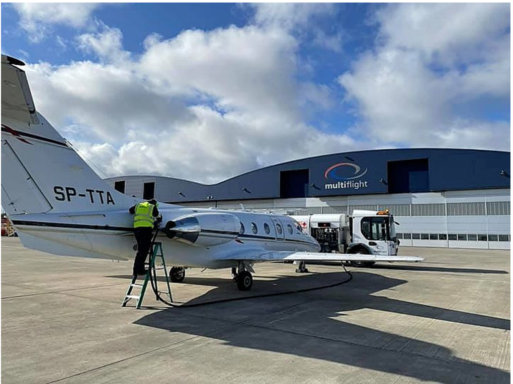
Beechjet 400 SP-TTA