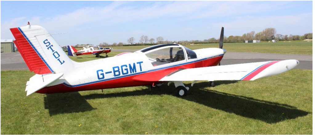
G-BGMT MS Rallye 24/04