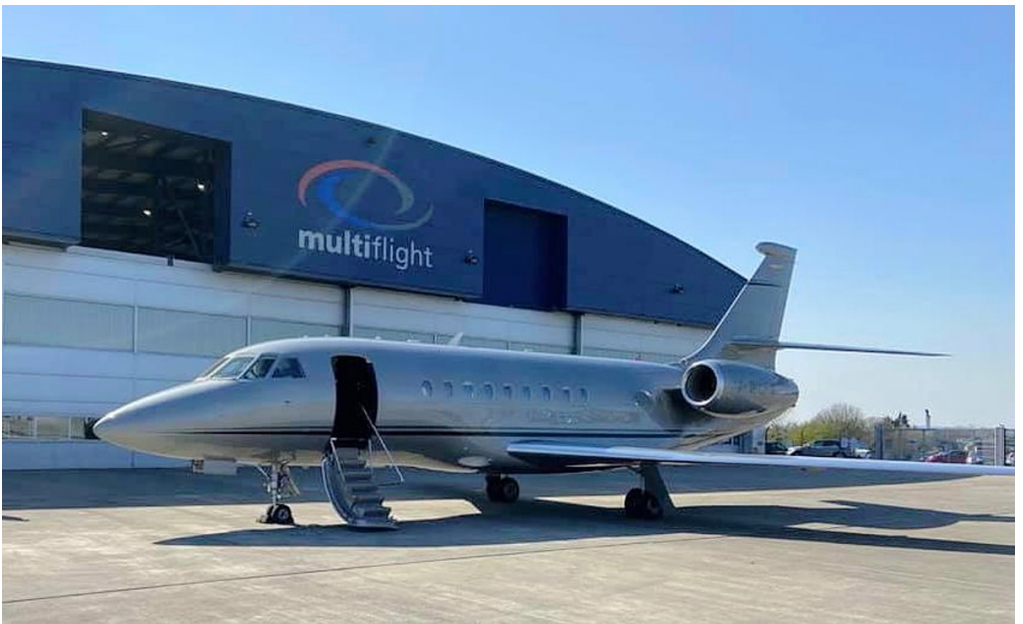
I-WLFX Falcon 2000 Aliserio Miles Beecham via Facebook group 19/04