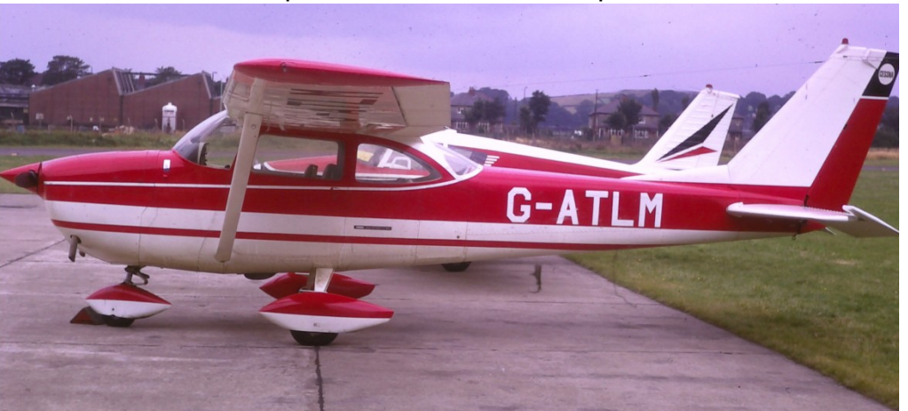
Reims Cessna F172G G-ATLM currently resident at Sandoft