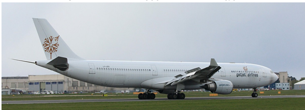
LY-LEO Airbus A-330-300 GetJet Airlines 10/04