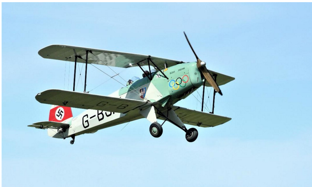
G-BJAL CASA Jungman 24/04