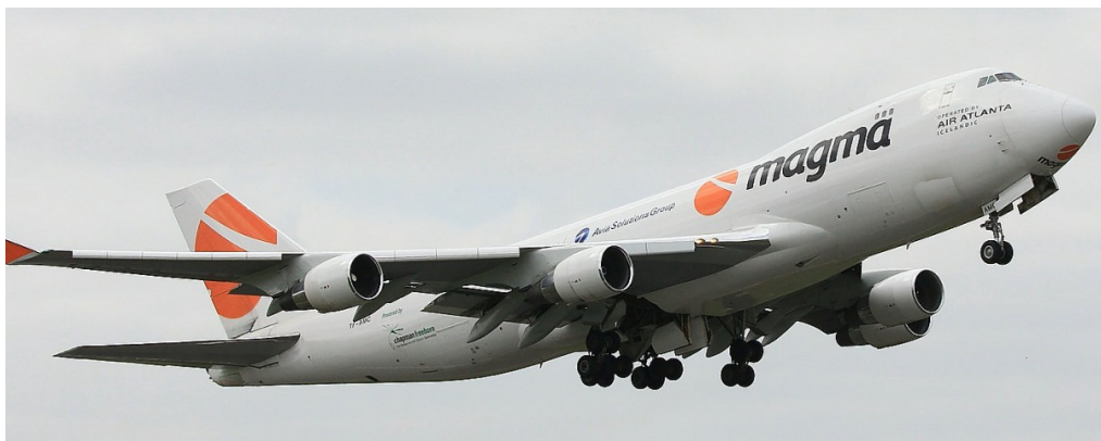
TF-AMC Boeing 747-400 Air Atlanta Icelandic Magma Aviation 03/04