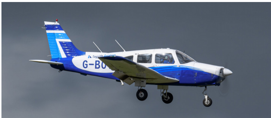
G-BOVK PA28-161 Warrior II 09/04