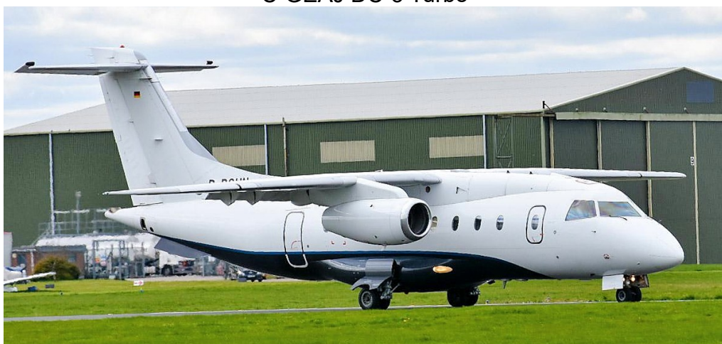
D-BSUN Dornier 328 Jet