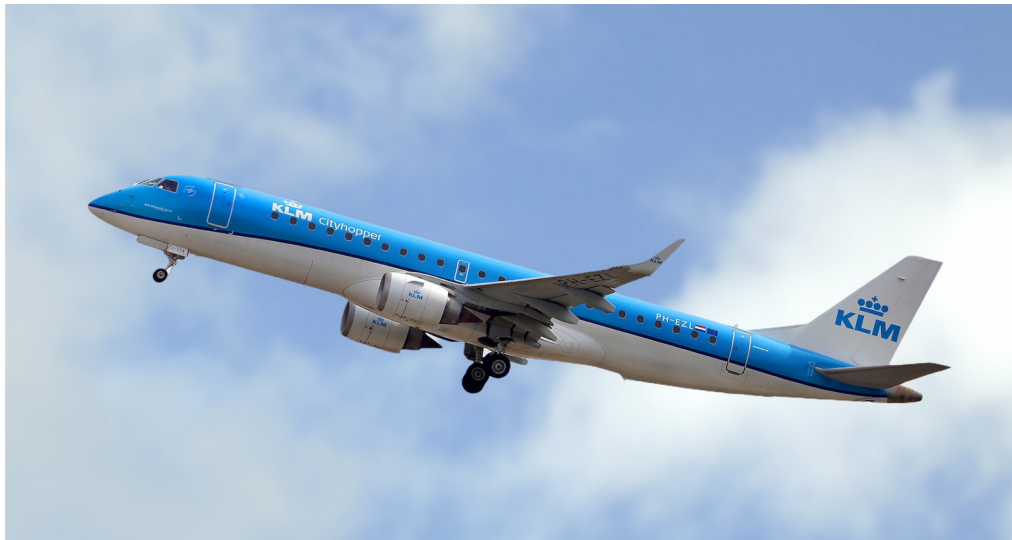
PH-EZL Embraer E190 KLM Cityhopper 1st Arrival on Restart Paul Whincup 24/04

Amsterdam (1541/1542, "1541/1542"):-24/4 PH-EZY, 25/4 PH-EZZ, 27/4 PH-EXS, 30/4 PH-EXS.