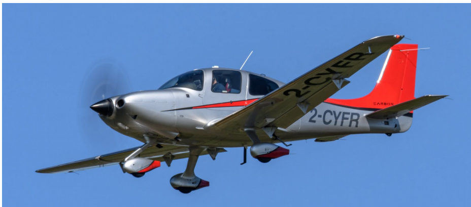
2-CYFR Cirrus SR22T 01/04

02/04 G-WVIP Beech 200 Super King Air f/t Exeter Nowfly Ltd, N9FJ AS350B Astar f/t Private site 03/04 None 04/04 None 05/04 N9FJ AS350B Astar f/t Private site 06/04 G-WVIP Beech 200 Super King Air f/t Exeter Nowfly Ltd 07/04 None