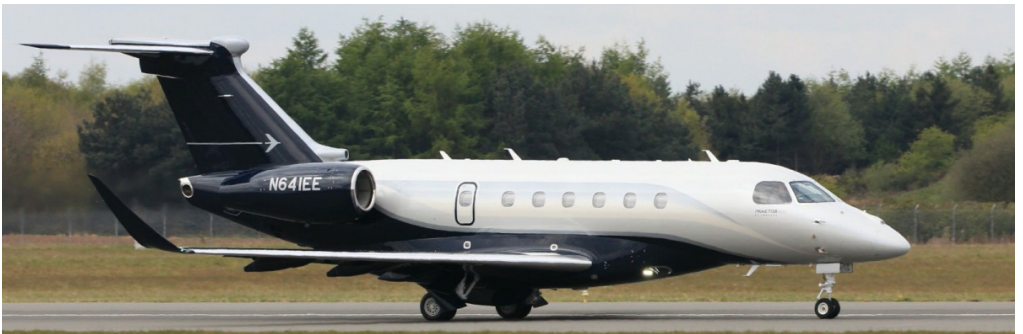
N641EE Embraer Legacy 550 Praetor 600 30/04