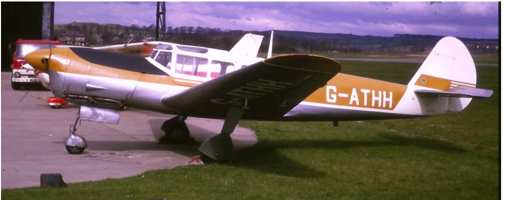
Nord 1101 Noralpa G-ATHH that was exported to the USA