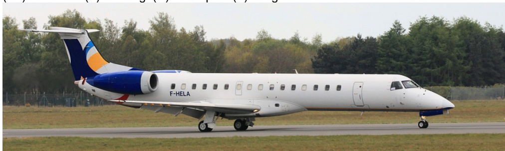
F-HELA Embraer 145 Valljet 30/04

(FV) First Visit. (T) Training. (H) Helicopter. (F) Freighter.