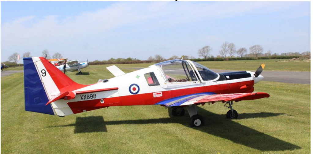
XX698/G-BZME SA Bulldog