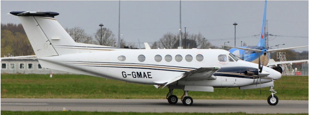
G-GMAE Beech 200 Super King Air 10/04