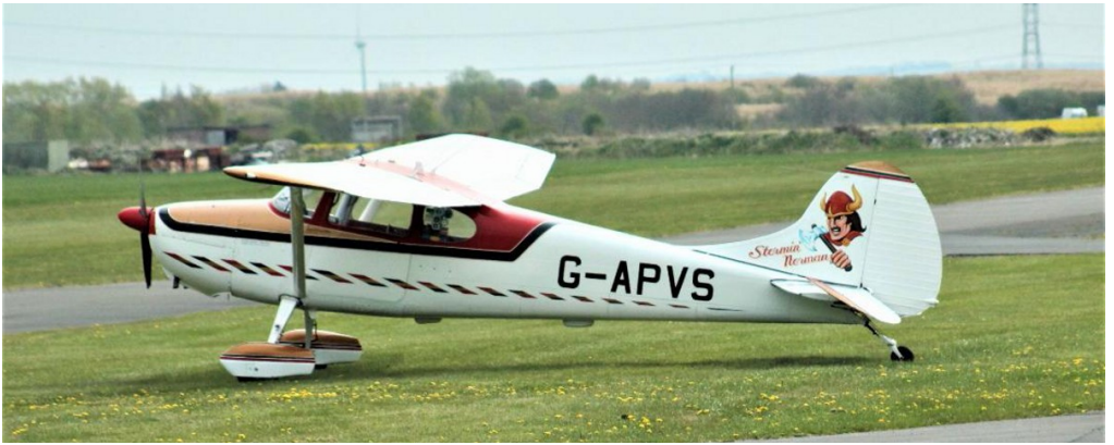
G-APVS Cessna 170B 24/04