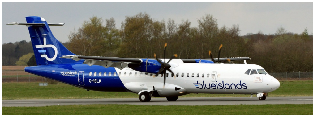
G-ISLM A.T.R. 72-500 Blue Islands 10/04