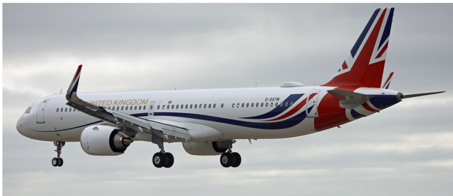
G-XATW Airbus A321-253NX(LR) Titan Airways 01/04

01/04 G-XATW Airbus A321-253NX(LR) f/t London Stansted Titan Airways, G-KARE Pilatus PC-12 arrived 30/3 t Duxford Flexify Aircraft Hire, 2-CYFR Cirrus SR22T f Gloucestershire t/f Local flight t Liverpool, N9FJ AS350B Astar f Private Site t Biggin Hill, G-GALB Piper PA-28 Warrior II f/t Gamston Retford Gamston Flying School