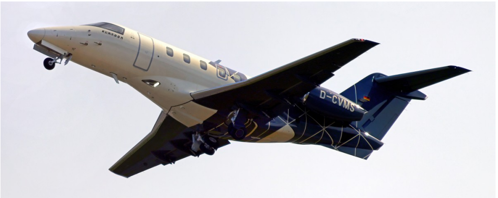
D-CVMS PC-24 09/04 Paul Whincup