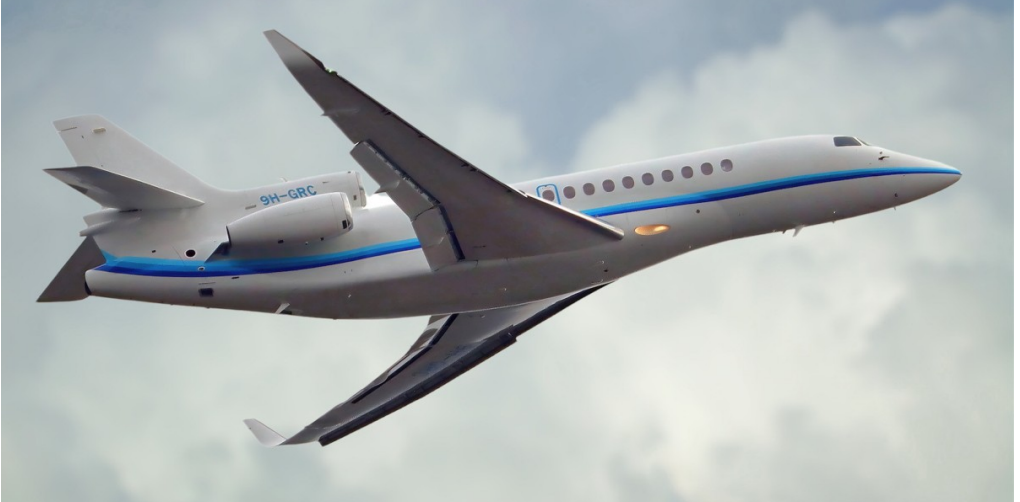
9H-GRC Falcon 8X 11/04 Paul Whincup

Cessna 425 Conquest M-MANX arr 08:54 dep 09:24, Beechjet 400 OK-NTU dep 09:57, Hawker 400XT OK-PFY dep 10:03, Phenom 300 2-EMBR dep 10:30, Falcon 8X 9H-GRC dep 10:47, Beechjet 400 SP-TAT dep 11:58, Cessna 680 Latitude CS-LTE arr 13:55 dep 14:59, Beechjet 500 SP-EAK arr 15:20 n/stop