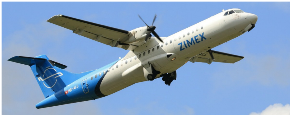
HB-ALL A.T.R. 72 Zimex 01/04