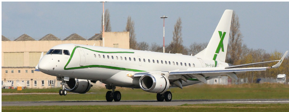
9H-FAB Embraer 190 Air-X 10/04