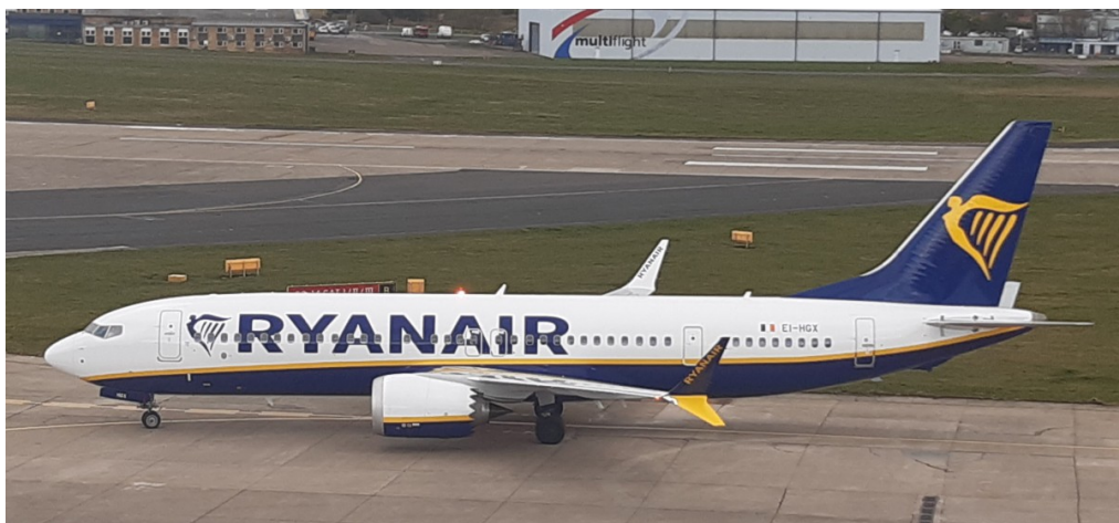
EI-HGX Boeing 737-8M Ryanair 06/04 Nigel Berry

Wroclaw (4108/4107, "1PV/1BR", Sun/Wed):-3/4 SP-RSR, 6/4 SP-RKC, 10/4 SP-RSH, 13/4 SP-RKR, 17/4 SP-RKI, 20/4 SP-RSE, 24/4 SP-RKS, 27/4 SP-RKS.