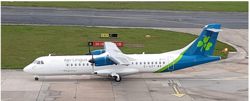
EI-GZY ATR72 Emerald 19/04

Other flights:-16/4 EI-FSL(71P) positioned in from Manchester,