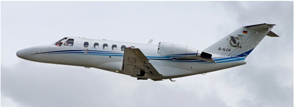
D-ILCG Cessnae Citation 525A CJ2 18/04 Paul Whincup