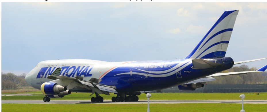
N919CA Boeing 747-400 National Airlines 13/04