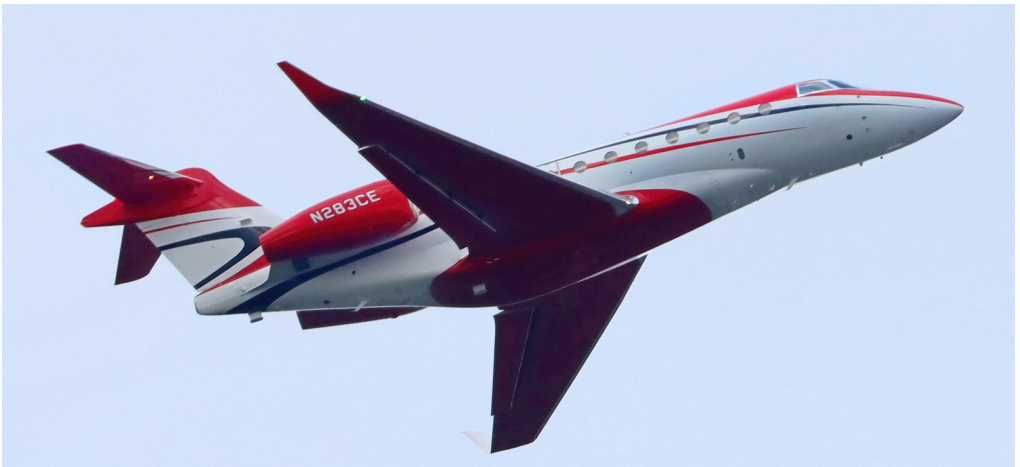
N283CE Gulfstream G280 Cummins 20/04 Paul Whincup