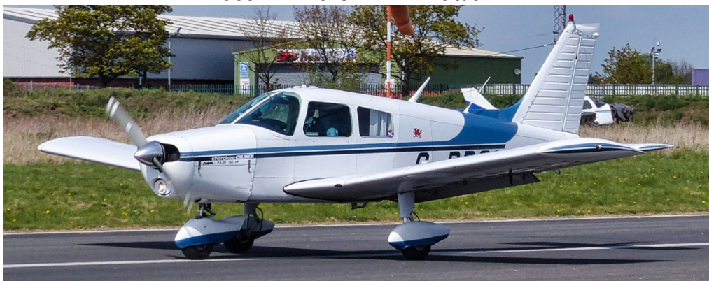
G-BDSH PA28 Cherokee 30/04