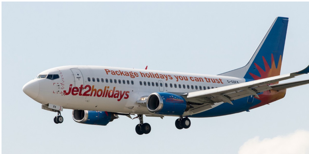
G-GDFK Boeing 737-300 Jet2.com 24/04 Stewart Robertshaw

JZBD(041A) positioned out to Newcastle, G-DRTT(049A) positioned in from Newcastle, 27/4 G-GDFG(051B) training flight, G-GDFG(232) positioned in from Barcelona, 28/4 G-DRTC(048A) positioned in from Newcastle, 29/4 G-DRTC(041A) positioned out to Belfast, 30/4 G-DRTC(041A) positioned in from Belfast.