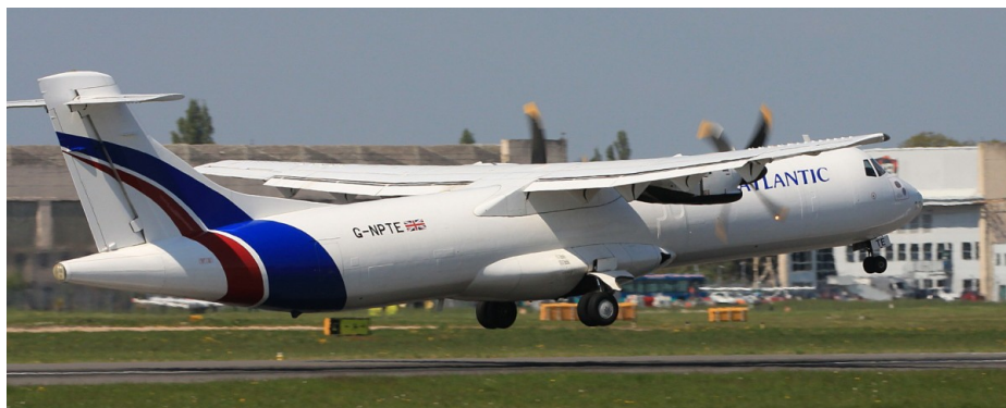
G-NPTE A.T.R. 72 West Atlantic 29/04