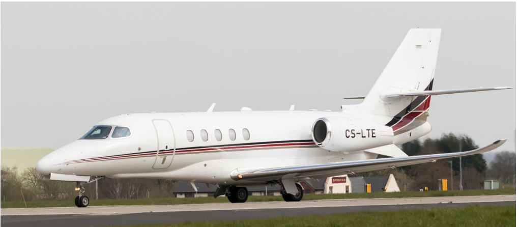
CS-LTE Citation Latitude 12/04 Stewart Robertshaw

Beechjet 400 SP-EAK dep 07:34 & ret LBA at 20:10 n/stop, Phenom 300 CS-PHG arr 16:04 n/stop, Cessna 680 Latitude CS-LTE arr 19:56 n/stop,