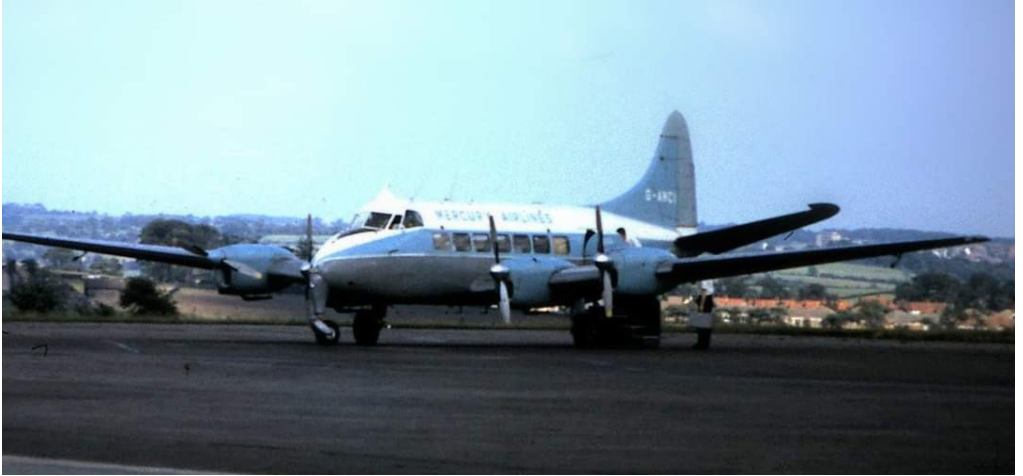
Heron G-ANCI, Mercury Airlines, Yeadon, 22 June 1963.