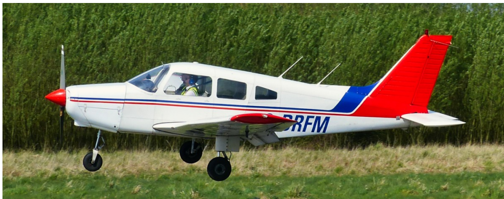
G-BRFM PA28 Cherokee 16/04