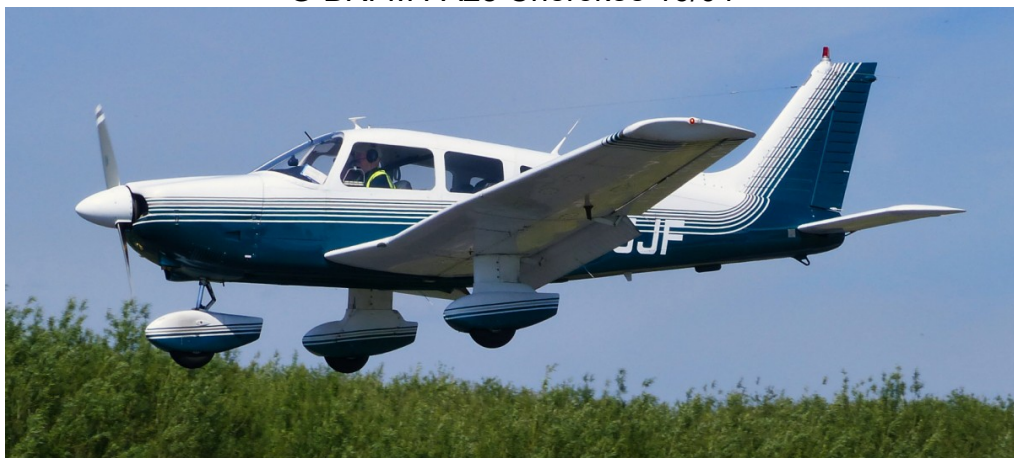
N65JF PA28 Cherokee 30/04