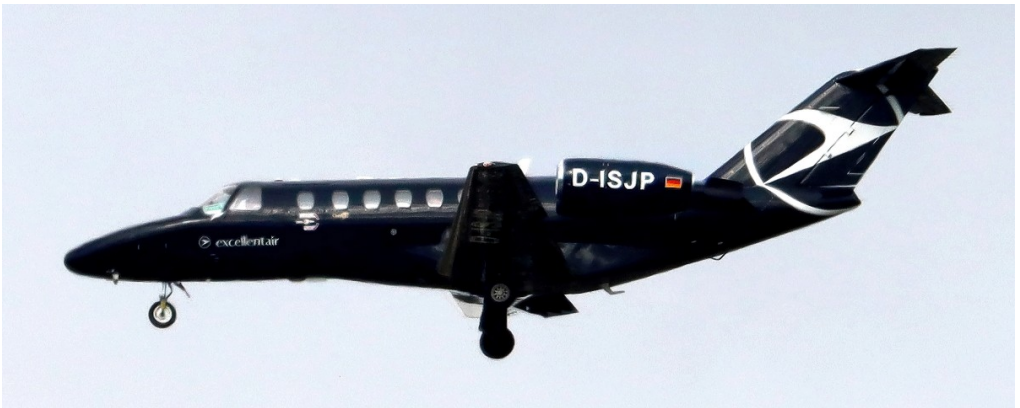
D-ISJP Citation 525 Excellent Air 26/04 Paul Whincup