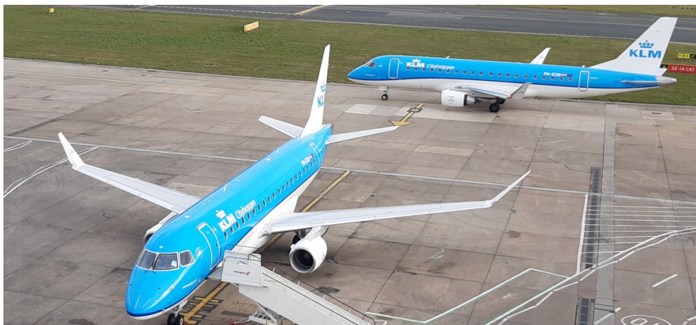
2 x Embraer 175 KLM 07/04 Nigel Berry