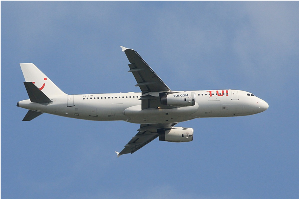
ES-SAM Airbus A320 Smart Lynx 30/04