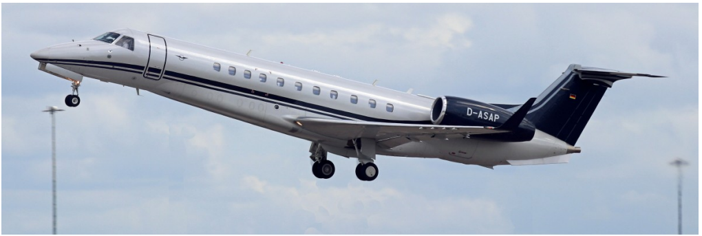
D-ASAP Embraer 135BJ Air Hamburg 18/04 Paul Whincup