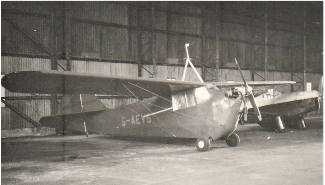
G-AEVS Aeronca 100 resplendent in overall red colour scheme. This photo is taken on the evening of 21 June, 1961 in one of the hangars used by Yorkshire Aeroplane Club at that time. Built in 1937 it is a two seater. Now based at Brighton with the Real Aeroplane Club, in an all white colour scheme. Behind 'EVS in this photo is Chilton DW1a G-AFSV.