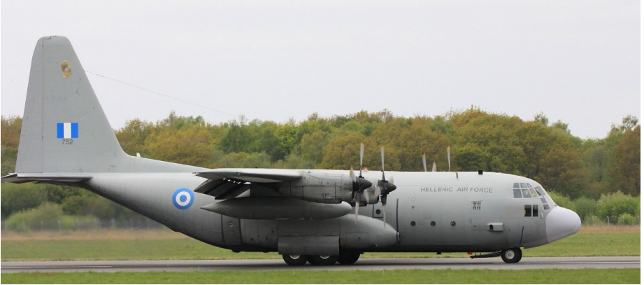
752 C-130 Hercules Hellenic Air Force 27/04