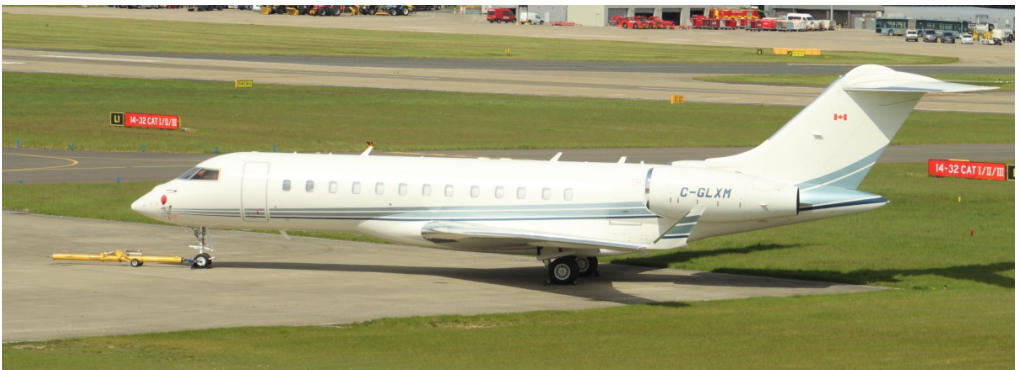
C-GLXM BD700 Skyservice 30/04 Ian Gratton

Embraer 145 F-HFCN arr 00:43 dep 01:25, Cessna 560 Excel D-CDCM arr 09:20 dep 10:14, Pilatus PC XII G-LUSO arr 11:39 dep 12:18, MD902 Explorer N906AF arr 12:05 dep 12:37. That's it for this month, as ever if you need further details, just email me your request