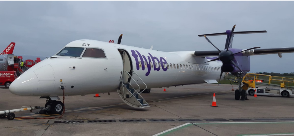
G-JECY DHC8 FlyBe 27/04 Nigel Berry

6/4 G-JECY(33T/34T) training flight from/to Birmingham, 12/4 G-JECX(023T/024T) training flight from/to Birmingham, 16/4 G-JECX(21T/22T/23T/24T) training flight from Birmingham/to & from Newcastle/to Birmingham, 20/4 G-JECY(21T/22T) training flight to/from Birmingham, 22/4 G-JECX(048T) training flight to/from Birmingham, 23/4 G-JECY(021T/022T/023T/024T) training flight from Birmingham/to & from Newcastle/to Birmingham, 27/4 G-JECY(031P) positioned in from Birmingham.