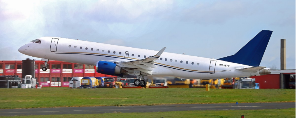
9H-NYC Embraer 190 Lineage 1000 Air X 09/04 Paul Whincup

Cessna 510 Mustang F-HIBF arr 07:51 dep 10:05, Cessna 560 Excel D-CJMK arr 09:02 dep 10:45, Lineage 1000 9H-NYC arr 09:07 dep 10:41, Pilatus PC XII D-CVMS dep 10:52, Cessna 182 Skylane G-ARAW arr 10:52 dep 11:56, Cirrus Sr22 N575PW dep 11:40, Cirrus Sr22 2-CYFR arr 11:50 dep 13:16, Phenom 300 D-CMXM dep 12:13, Beech 200 Kingair G-SASD arr 13:12 dep 15:07, Cirrus Sr22 N220AD dep 13:36, Cirrus 20 N203CD dep 13:38 ret at 13:47 n/stop, Beech 200 Kingair G-JASS dep 14:39 ret at 16:50 n/stop, Cessna 550 Citation 2 F-HMXL arr 17:51 dep 20:29, Cessna 560 Excel CS-DXN arr 18:22 n/stop.