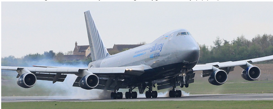
4K-BCI Boeing 747-400 Silkway West Cargo 25/04