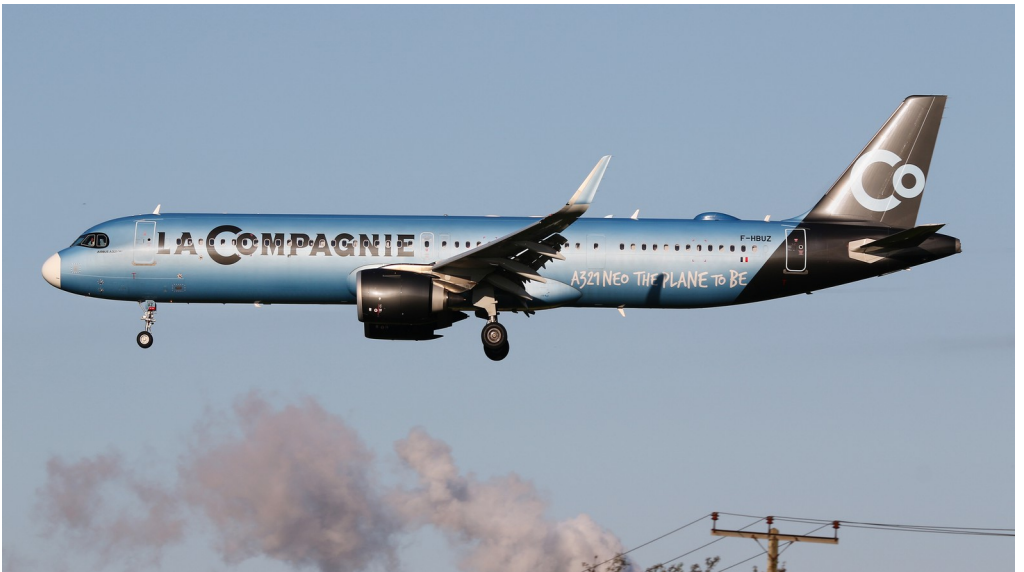
F-HBUZ Airbus A321neo Humberside 10/10 La Compagnie Paul Whincup