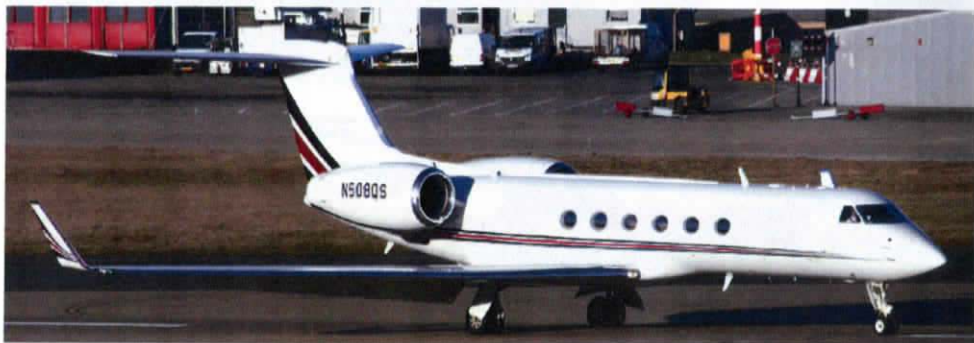
Netjets Gulfstream 5 N508QS arrived from Le Bourget on 20/1

GENERAL AVIATION:- PA-34 G-JDBC (Jaydee 43W) from Liverpool(1001), local flight 1053/1114 as "Exam 08", back to Liverpool(1246). TBM.850 G-PMHT f/t Thrupton(1113/1530). R.22B G-IPT arrived from its base at South Milford at 1535 and is a temporary resident for operations by Multflight. Dauphin EI-GJL from a private site near Shrewsbury(1652) to Doncaster(1700).