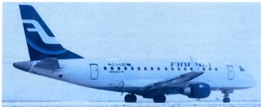
Embraer 170 OH-LEF of Finnair diverted from snowy Manchester to snowy LBIA

GENERAL AVIATION:- King Air 200 G-FPLD(Calibrator 476) ILS and overshoot(1049), f/t Teesside