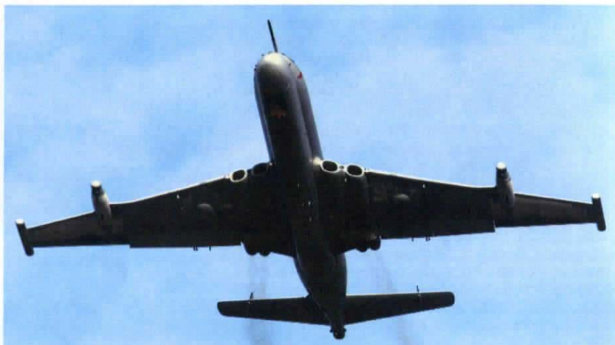
Nimrod R.1 XV249 overshooting at Linton, 17/1

Linton-on-Ouse:- The next Graduation Day will be held on March 14 th . For the record the following Vigilants are currently operating with 642VGS, ZH115/TA, ZH117/TC, ZH124/TK, ZH146/TT, ZH195/UH. On 2/2 the following Hawks arrived from Leeming for operations over the next two days due strong crosswinds at their base, XX184/CQ, XX202/CF, XX222/CI, XX289/CO, XX332/CD, XX346/CH. On 8/2 the following were noted XX203/CC, XX246/CK, XX339/CA and the following day XX167/167, XX245/245, XX263. Other visitors:- Typhoon ZJ937(Rampage 11, overshoot); 5/1 Lynx ZD280(Armchair 954); 17/1 Nimrod XV249(Vulcan 51, overshoot), Sea King ZE370; 26/1 Typhoon ZJ932(Typhoon 67, overshoot); 7/2 BAe.125 ZE396(Northolt 34, training); 10/2 Globemaster ZZ174(Overshoot), Bell 412 Griffin ZJ237(Shawbury 85).