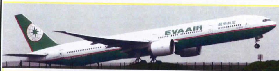
B-16712 Boeing 777-350ER EVA AIR Paris/Charles de Gaulle, 21/01/11