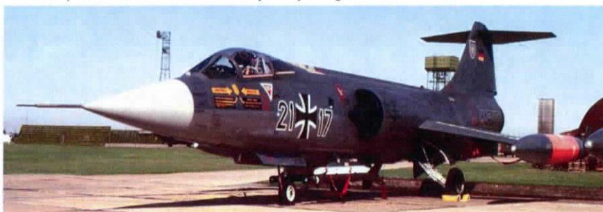
21+17 F-104G Starfighter of MFG3, West German Navy, taken at Finningley