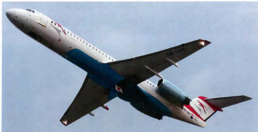
Ausrian Arrows Fokker 100 OE-LVK departing Runway 32 on 4/1

GENERAL AVIATION:- Cheyenne 3 G-GMED(Air Med 081) from Innsbruck(1537) to Oxford(1618).