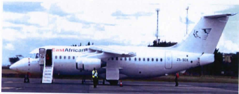
ZS-SDX BAe.146-200 East African Airways, Niarobi International 12/12/10