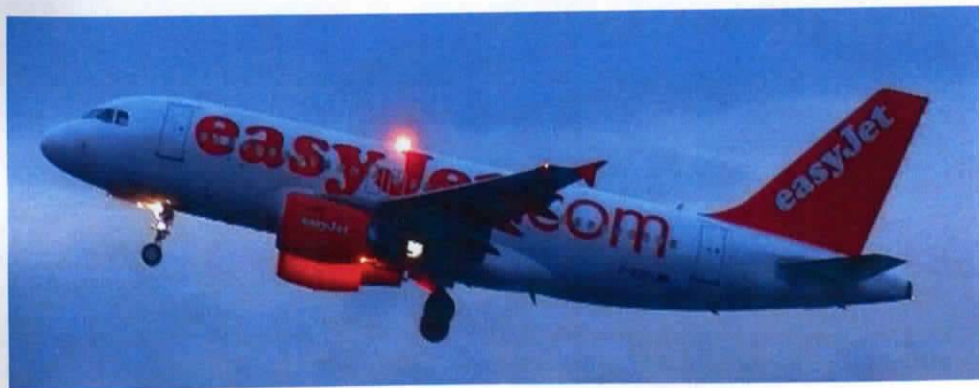
A.319 G-EZFI operated the company's last scheduled flight out of Doncaster on 04/01/11

Flybe pilots have rejected an offer from the regional budget airline on pay and conditions. They now could vote for industrial action if urgent talks, due to be held next week, fail to provide a breakthrough. Members of the British Airline Pilots Association (BALPA), the UK pilots union, rejected the offer by 81 percent in an indicative ballot, with an 85 percent turnout. The pilots will have to vote again - if formal ballot specifically on industrial action - before any strike is held. BALPA would also have to give seven days' notice of any strikes or other forms of action.