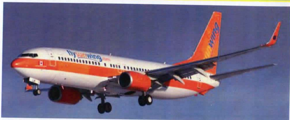
C-FTLK Boeing 737/800 Fly Sunwing.com. Toronto International 09/01/11(Ian Morton)