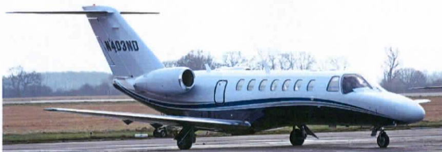
France based Citationjet 3 N403ND was a visitor to Teesside on 28/1

Waddington:- Nimrod R1 XV249 has acquired special markings prior to its retirement. A large red goose has appeared on the fuselage either side of the flight-deck while the Wyton and Waddington crests have been applied to the fin. The last operational flight of the Nimrod R1 will take place from here on 24 th March and on 31 st March a ceremonial flypast of two aircraft will take place. A rehearsal for the flight will take place the previous day. On 5/1 Dominie XS737(Cranwell 84) diverted in with oil pressure problems and similar type XS728(Cranwell 85) arrived later to collect the crew. Visitors have included:- 4/1 Sea Kings ZD479/ZE425(Avenger Formation, in arctic camouflage); 6/1 ZF622 PA-31(Gauntlet 61); 13/1 ZF289 Tucano(LOP 71); 14/1 ZF343 Tucano(LOP 51), XV108 VC-10(Tartan 51, training); 17/1 086/YI Xingu(FAF 6798), Merlins ZJ123/ZJ998(Rapier 1/2); 18/1 Apaches ZJ202/ZJ217; 20/1 078/YE Xingu(FAF 6793); 21/1 Apaches ZJ204/ZJ220(Ogre Formation); 23/1 XV106 VC-10(Ascot 849, training), 62-3551(Quid 51, circuits), 105/YU Xingu(FAF 6794), ZJ242 Bell 412(Shawbury 117); 28/1 98-133 F-15E(Card 31, overshoot); 31/1 G-DOIT/XX199 Squirrel(Shawbury 18). The following French Air Force Alpha Jets were also noted:- 18/1 E.47/705-AC, E.72/705-LA; 25/1 E.75/705-AL, E.90/705-TH, E.107/705-AD; 26/1 E.45/705-TF, E.82/705-LW, E.93/705-TX, E.121/705-LE.