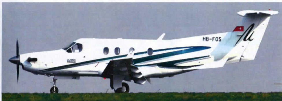
Pilatus PC-12 HB-FOS was on its first visit to LBIA when it arrived from Zurich on 18/1

MILITARY:- Gazelle ZB683 (Armyair 562) 2 radar approaches with overshoots(1451/1509), from Dishforth to Carlisle. King Air 200 ZK451 (Rafair 7094), ILS and overshoot(1501).