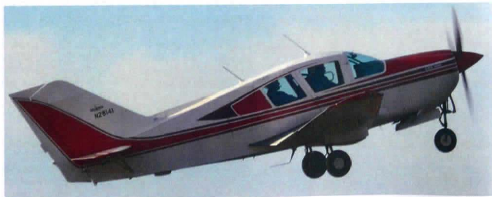
An unusual type to visit Doncaster was Bellanca Viking N28141(Clive Featherstone)