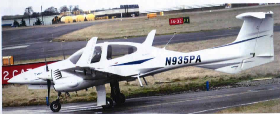
DA-42 N935PA eventually arrived, having earlier diverted to Doncaster with instrument problems on 26/1(Mike Storey)

MILITARY:- Tucano ZF293(LOP 46) ILS and overshoot(1419), f/t Linton.