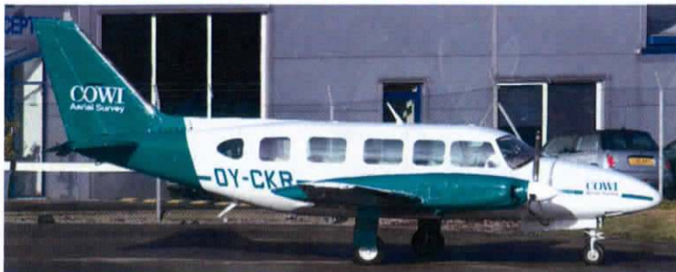
PA-31 Chieftain OY-CKR of Cowi Aerial Surveys is based with Multi- flight while carrying out local operations

R.22B G-IIPT is being used by Multiflight for training flights while their own example G-CCGF is on maintenance.