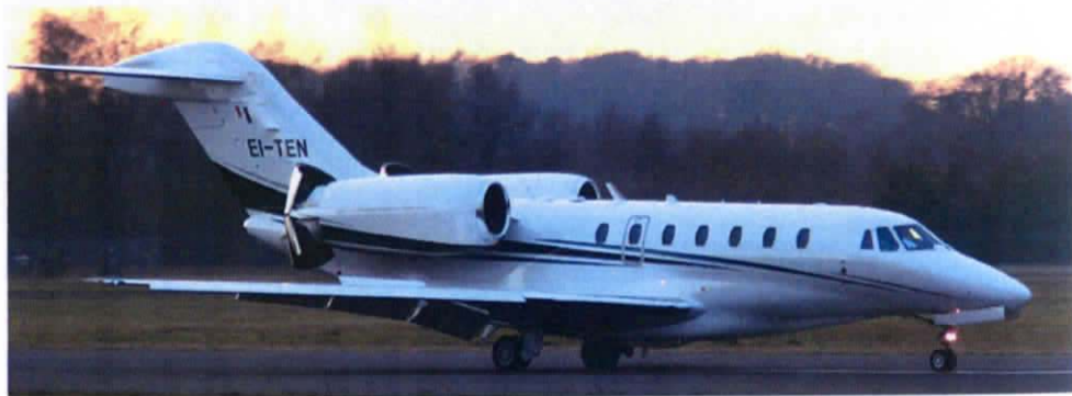
Citation X EI-TEN(ex. P4-LJG) arrived for attention from Kinch Aviation(Clive Featherstone)