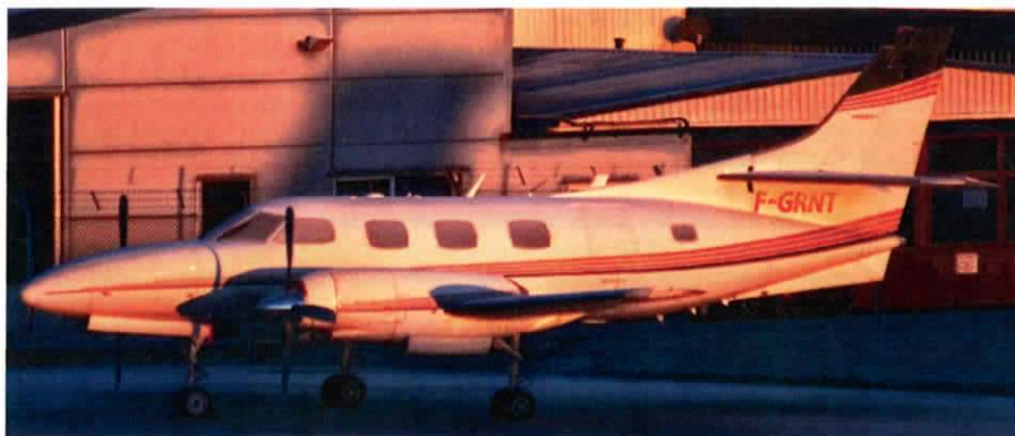
Metro IIIB F-GRNT parked at Multflight/East on a cold dawn, 20/1

GENERAL AVIATION:- King Air 200 G-BVMA from Cardiff(0747) to Dublin(0808).