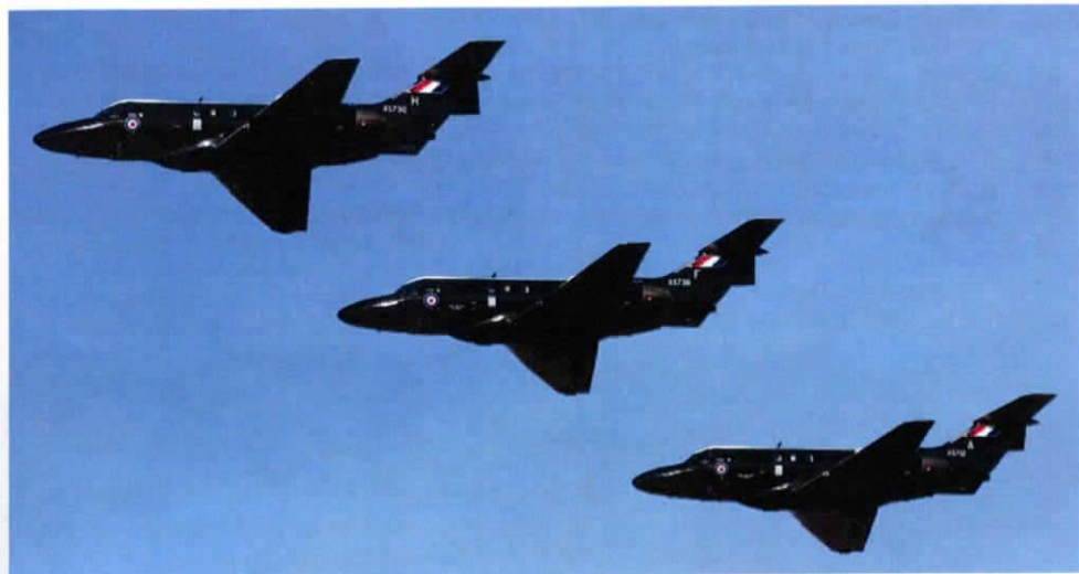
Dominies, XS730/XS739/XS712 run and break at Cranwell, 19/1(Robert Burke)

Cranwell:- For the record currently based here for apprentice training and high speed taxi tuition are XX747 Jaguar GR1, XX821Jaguar GR1, XX837 Jaguar T.2, XX965 Jaguar GR1A, XZ358 Jaguar GR1A, ZB615 Jaguar T2. To mark the end of operations by the Dominie fleet a 6 ship flypast took place on 20/1 comprising XS712, XS728, XS739, XS730, XS731, XS737. Two others were left on the ramp XS709(This aircraft was flown to Cosford on 8/2 for display in the museum) and XS727. Visiting for the occasion was A.109E ZE321(Ascot 1461). It is reported that two of the Dominies are to go to museums at Duxford and Newark.