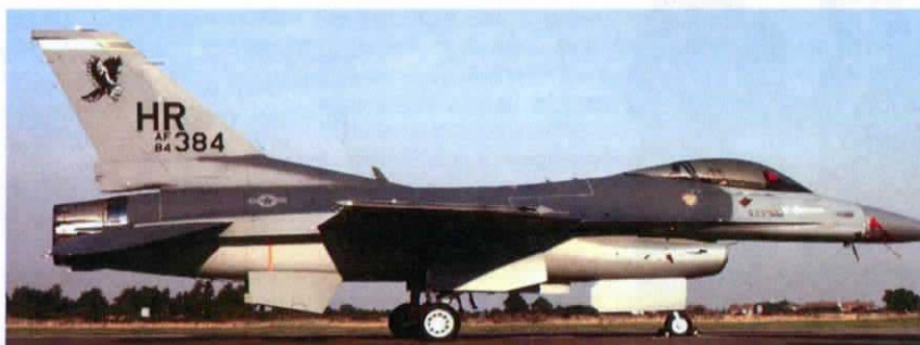
84-1384/HR F-16C Fighting Falcon, 50TFW based at Hahn, West Germany