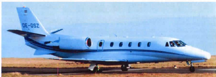
Citation XL OE-GSZ is becoming quite a regular visitor to LBIA(Ian Thorpe)

MILITARY:- King Air 200 ZK460 (Cranwell 68), ILS and overshoot(1535).