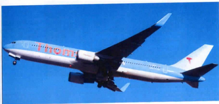
Boeing 767/300 G-OBYG positioning out to Manchester, 29/1

GENERAL AVIATION:- Hughes 369E G-JIVE f/t Shelf(1550/1638). Agusta A.109S G-ETOU f/t Pateley Bridge(1620/1018), n/s. PC-12 G-DAKI from Bournemouth(1716), n/s to Altonrhein(1030).