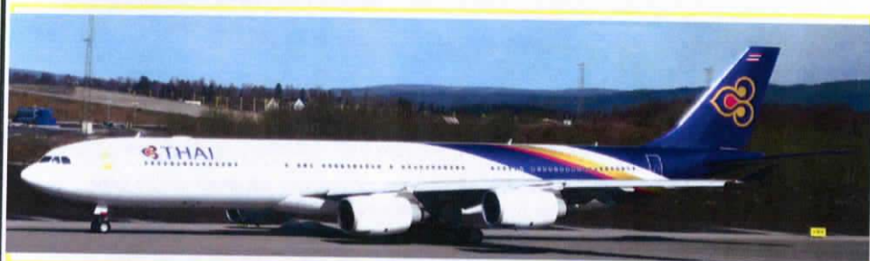
HS-TLA Airbus A.340-541 Thai International Oslo/Gardemoen. 22/04/10