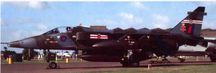
XZ363/A Jaguar GR.1 of 41 Squadron, taken at Finningley 1984