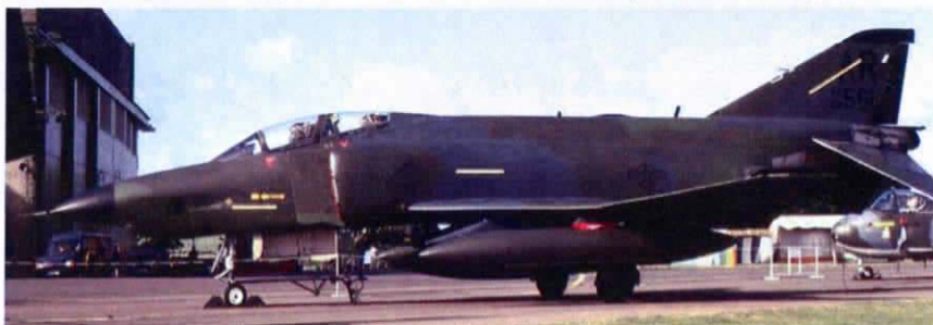
68-0561/AR RF-4C Phantom, 10TRW based at Alconbury, taken in 1984