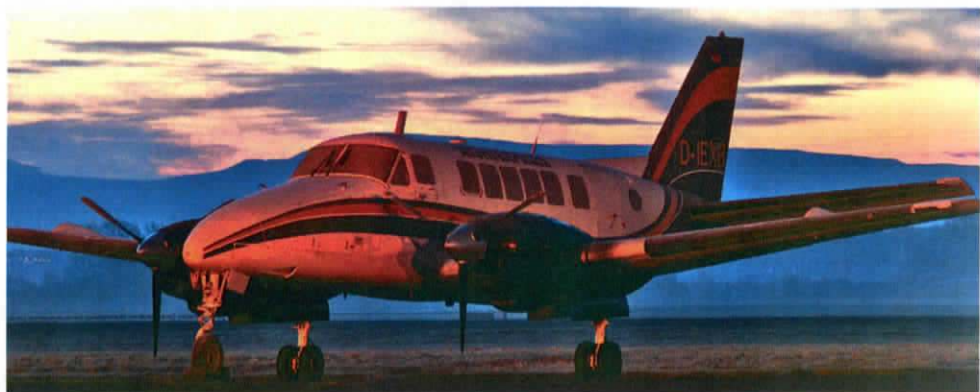
Beech 99 D-IEXB owned by Night Express on a very cold dawn, Durham/Tees Valley, 21/1

Sherburn:- G-CGRL newly registered to a Holme on Spalding Moor owner has been noted operating out of here recently, possibly on training flights for the new owner. From the Resident Review delete G-PHMG RV.8 which has departed following sale. A new resident is G-UANO/FAP1367 DHC.1 first noted in late January. Also reported is an accident to one of the Sherburn Aero Club PA-28's at Walton Wood on 29 or 30.1 when it failed to become airborne on takeoff and passed through a hedge.