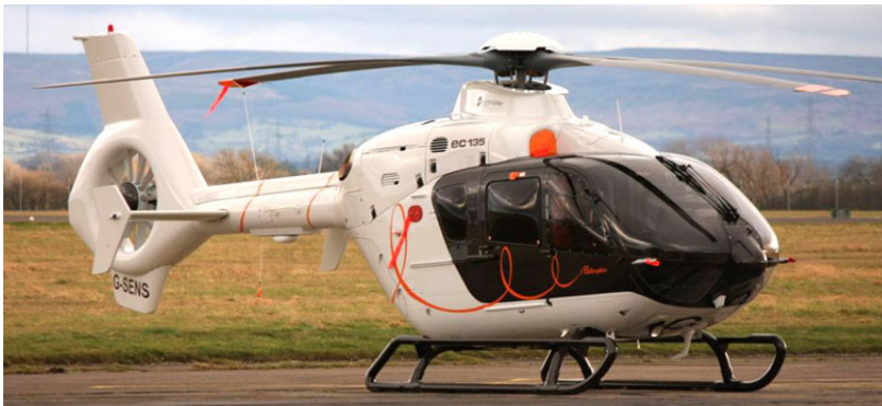
Brand new EC-135T G-SENS of Capital Air Services(Oxford) visited Teesside, 10/1

On 15/1 Monarch Airbus A.300 G-OJMR(Monarch 744P) arrived for an overnight stay before operating outbound to Nairobi. The aircraft returned on 18/1 for another trip. Another interesting visitor was Czech Air Force Challenger 5105(Czech Air Force 208) which called while on a training detail from Kbley to Prerov. Another airforce movement was Belgium Falcon 20 CM-02(BAF 613) on 12/1. More mundane were Jet2 737/300s which arrived for training:- G-CELH(9/1), G-CELJ(9/1), G-CELS(16/1, 19/1).