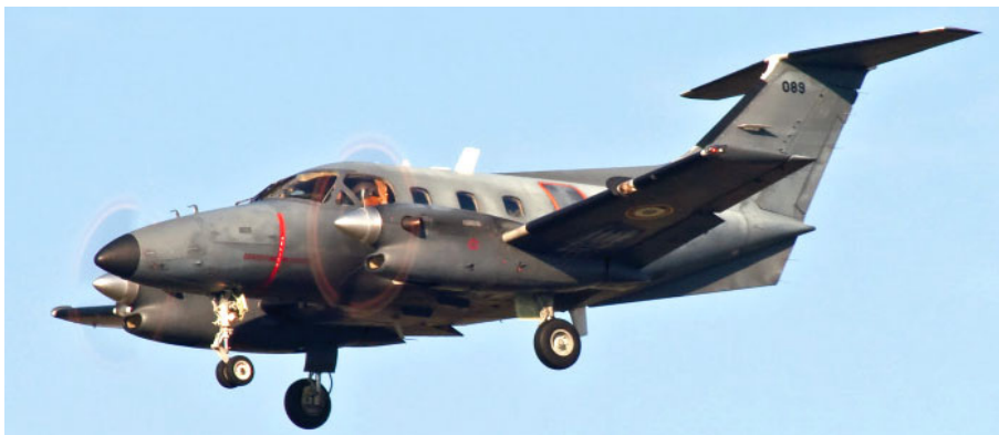
Rather frozen French Air Force Xingu 089/YJ landing at Waddington

WADDINGTON:- Resident E.3A ZH102(Ascot 7062) departed to the USA on 13/1 on exercise. The Saudi Hercules 475(RSAF 900) arrived from Doncaster on 27/1, where it had diverted a week earlier and made an emergency landing on 3 engines. Other movements included:- 4/1 F-15Es 91-0602/01-21003(Rumble 81/82, overshoot), Typhoon ZJ946(Monkey 1, ILS); 5/1 KC-135R 57-1488(Quid 43, circuits), A.109E ZR322(Ascot 1411); 6/1 Hercules ZH884(Ascot 601), E.3A LX-N90445(NATO 10, circuits), BAe.146 ZE701(Northolt 18, training), Tucano ZF489(Cranwell 08, ILS); 9/1 Xingu 072/YA(FAF 6794), C.17A ZZ175(Ascot 184, circuits), Hawk XX162(Gauntlet 20), Apaches ZJ175(Camelot 01), ZJ202(Camelot 02), ZJ211(Machete 01), ZJ210(Machete 02); 10/1 Tornado ZA404(Marham 80, ILS); 11/1 Hercules ZH884(Ascot 053)/ZH895(Ascot 440), Typhoon ZJ812(Typhoon 05, overshoot), Tornado ZA412(Marham 23, ILS); 18/1 Red Arrows Hawks overshoots XX253/XX264/XX308/XX323; 19/1 Hercules ZH886(Ascot 035)/ZH874(Ascot 215); 23/1 Xingu 089/YJ(FAF 6798), Sea King ZE418(Navy 810); 25/1 Hawk XX174(VYT 29), Islander ZG845(Armyair 582); 26/1 Lynx ZD261(Skua 312)/ZF563(Seacat 101); 30/1 Xingu 078/YE(FAF 6746), Alpha Jets 705-LF/E.137 and 705/RS/E.149(French Air Force 6444/6442, both night stop).