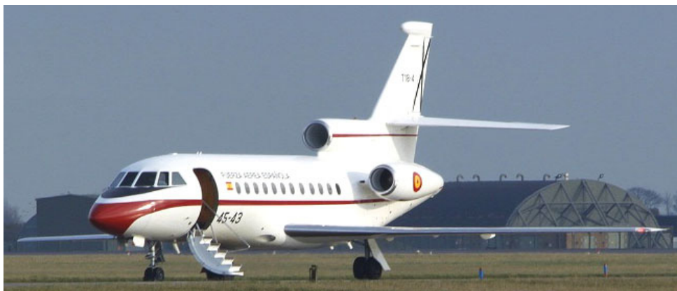
Falcon 50 T.18-4/45-43 of the Spanish Air Force at Coningsby, Dec 2011(Kevin Nape)

Other movements included:- 5/1 A.109E ZR322(Ascot 1411); 6/1 BAe.146 ZE701(Northolt 18, training), 9/1 Apaches ZJ174/ZJ210(Ogre 1/2), Falcon 20s G-FRAT/G-FRAU(Zodiac 1/2); 10/1 Puma ZA937(Vortex 035); 11/1 Lynx XZ215(Armyair 905), Sentinel ZJ692(Snapshot 1, training); 12/1 Shadow ZZ419(Snake 49, overshoots); 13/1 Hawk XX184(Pirate 10); 17/1 Falcon 20s G-FRAW/G-FRAP/G-FRAH(Asprin 71/72/73); 26/1 PA-32RT G-OJCW, PA-28 G-DIXY, C.172N G-BRBI, F.172N G-DUVL; 27/1 BAe.125 ZD620(Ascot 1367), Sentinel ZJ690(Snapshot 1, overshoots); 30/1 French Air Force Alpha Jets 705-RS/E.149 and 705-LJ/E.137; Hawks XX199(VYT 63), XX250(Stingray 1), XX218(Stingray 2).