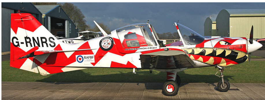
Colourful Bulldog G-RNRS is operated by Power Aerobatics, based at Kemble