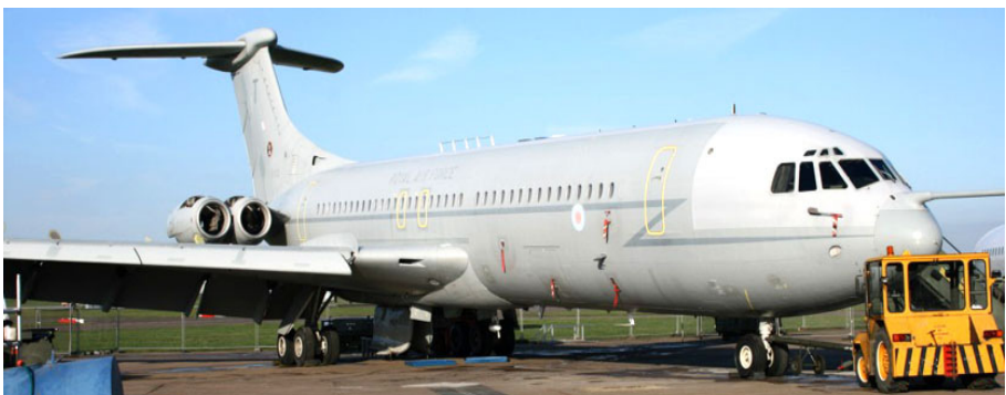
XV102 looks a little forlorn, minus engines and awaiting its fate