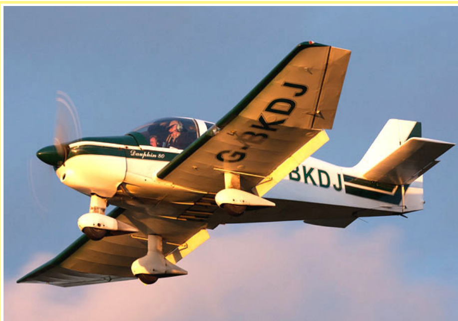
G-BKDJ Robin DR.400 Petit Prince Gloucester/Staverton, 18/01/12