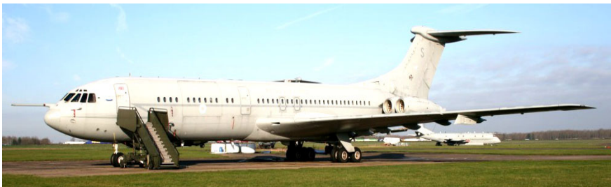
XV101, the latest to arrive looks as though it could still be sat at Brize Norton awaiting the next crew to whisk it off to foreign climes