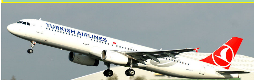
TC-JRU Airbus A.321 of Turkish Airlines. Manchester International, 22/10/11