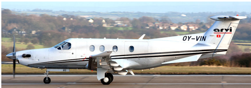
Pilatus PC-12 OY-VIN lining up for departure to Vilnius, Poland on 6/1(Robert Burke)

GENERAL AVIATION:- Dauphin G-NHAC (Helimed 58) f/t Langwathby(0824/1132) to Multiflight Engineering. King Air 200 G-FPLD (Calibrator 489) from Teesside(0920), local flight calibrating 1018/1407 and back home to Teesside(1507). Cessna TU.206G G-NIME from Sturgate(1410) to Saltergate/Whitby(1520).