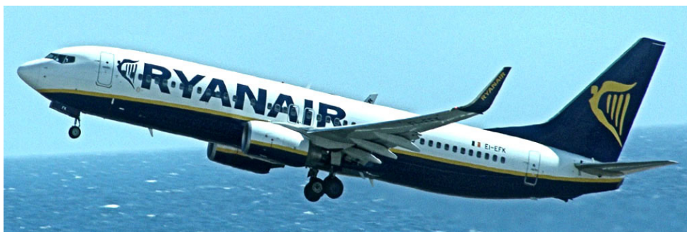
EI-EFK Boeing 737/800 of Ryanair. Departing Fuerteventura, 20/10/11