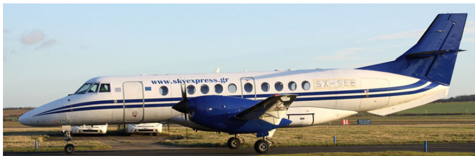
Jetstream 41 SX-SEB(ex G-MAJK) at Humberside prior to delivery back to Sky Express following a re-paint