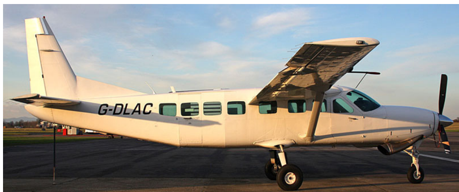
Seen at Staverton was Cessna 208 Caravan G-DLAC of Aero Dynamic Ltd from IOM