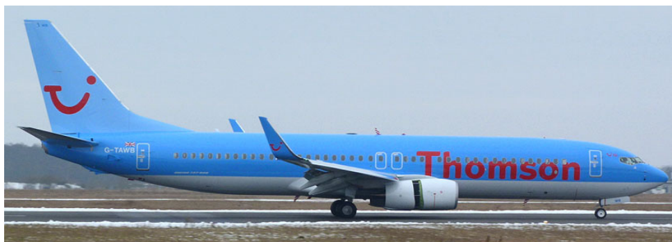
Newly delivered 737/800 G-TAWB on a recent visit to Doncaster

EI-EVB & EI-EVC arrived at Dublin on delivery on 28/1, followed by EI-EVD (40287) on 31/1, which had made its 1 st flight on 21/1. EI-EVE made its first flight on 28/1, and arrived at Dublin on 9/2. EI-EVF & EI-EVG made their 1 st flights on 2/2, with EI-EVH taking to the air for the 1 st time on 9/2