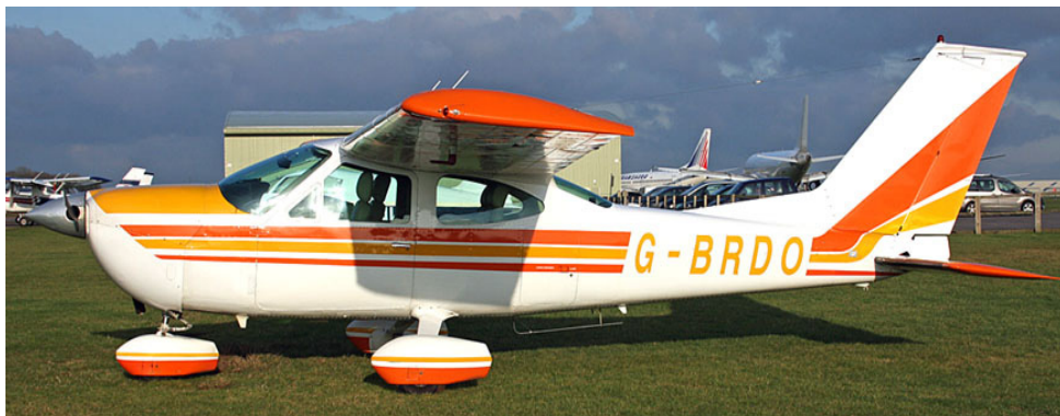
The mount for the trip, Cessna 177 Cardinal G-BRDO sitting in the sun at Kemble

Southside:- Former RAF Dominies N19CQ, N19CU, N19EK, N19YG, N19UK, N19XY. Boeing 747/200s G-MKCA, G-MKGA and around 20 light aircraft residents.