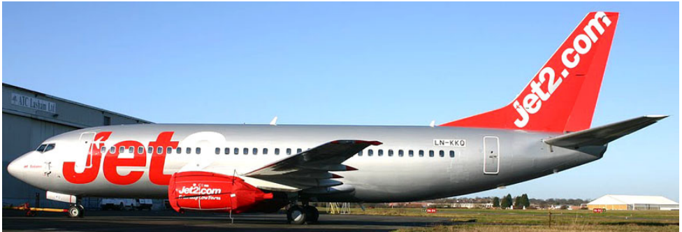
Boeing 737/300 LN-KKQ, which is due to be delivered to Jet2 shortly as G-GDFG

Durham / Tess Valley owner Peel Airports Limited has sold its 75% majority share holding in Durham Tees Valley Airport to Peel Investments (DTVA) Limited, the BBC reports. Peel Investments is owned by the Manchester based Peel Group. It sold a 65% stake in Peel Airports to Vancouver Airport Services in 2010, but has now bought Durham Tees Valley out of this arrangement. The BBC says that the move will allow the airport to continue operational activities without change to workers or airlines, although whether this is the case long term is in some doubt. Peel Airports Limited has been asked by the Peel Investments to act in an advisory role to assist with the day to day operations at the airport.