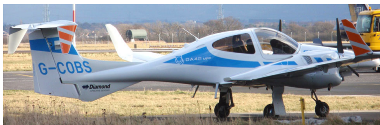
A new reesident at Teesside is DA-42 Twin Star G-COBS operated by Cobham Aviation

YEARBY:- Noted visiting on 29/1 was Robin R.1180 G-BIRT, f/t Cambridge.