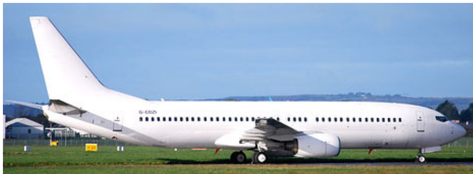
Boeing 737/800 G-CDZI is currently at Norwich being prepared for service with Jet2

CREDITS , ACW, ATW, AV Flash, Civil Spotters, IFW, LBA WEB Site, Teletext, Telegraph and Argus, TTG,