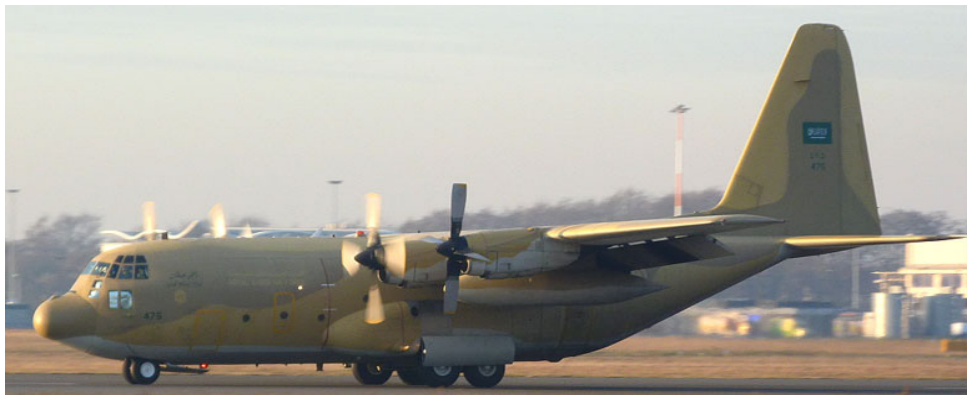
Saudi Air Force Hercules 475, arriving at Doncaster on 3 engines(Clive Featherstone)

USA the following day. It departed on 27/1 and routed via Keflavic, Goose Bay, Bangor/Maine to Richmond International, Virginia. The following day the epic journey continued via Columbia Metropolitan, Defuniak Springs to its new home Ferguson Field, West Virginia. Having been on rebuild for nearly 15 months LBA based Citationjet N646VP finally took to the skies again on 4/1 for an Air Test. The aircraft returned to LBA later in the month but as can be seen in the above listing it is back with Kinch for further rectification.