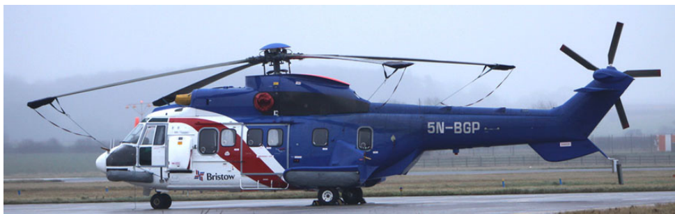
Bristow' Puma 5N-AGP on it way home to Nigeria at Humberside 24/1(Richard Grimley)

2/1 G-TBEA Citationjet(Clifton 068) 5/1 N516GH Gulfstream 5(n/s) 6/1 ZE701 Bae.146/200(Northolt 18, training) 12/1 G-JMED Lear Jet 35(Air Med 053) 19/1 G-VIPX PA-31(Prestige 99R, Ambulance flight), ZK454 King Air 200(Cranwell 81, ILS) G-URSA Sikorsky S.76C(Sparrowhawk 1R), ZK456 King Air 200(Cranwell 66, training) 20/1 EI-SPB Cessna TU.206H(f/t Dublin, n/s) 24/1 G-WNCH King Air 200(Synergy 329), G-WOWA/B Dash 8s(LBIA Diversions) 26/1 G-EVRD Premier 1 27/1 D-CAPO Lear Jet 35(Jet Executive 456), G-YPOL MD.902 Explorer(Police 42) 28/1 G-HPPY Lear Jet 45(Manhattan 066)