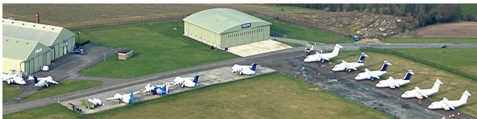
Chevron Storage Area at Kemble with numerous stored BAe. RJ85 and RJ100 aircraft