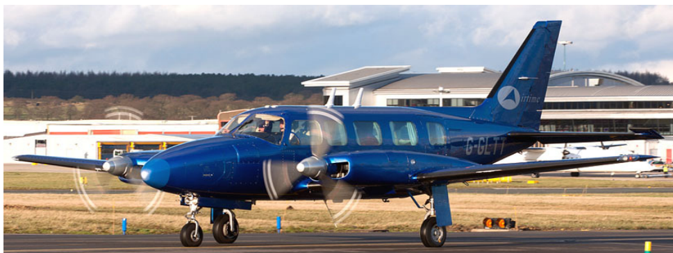
Ambulance flight, PA-31 Chieftain G-GLTT taxiing on Multiflight/East, 27/1(Robert Burke)

GENERAL AVIATION:- PA-31 Chieftain G-GLTT (Causeway 999B/C) from Oban(1454) ambulance flight, to Belfast International(1553). Baron N64VB from Northampton(1646) to Sleep(1655).