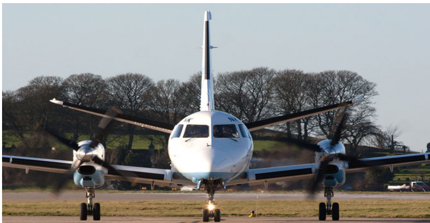
Leeds United chartered Loganair SAAB 340 G-LGNK on 13/1, 14/1(Robert Burke)

GENERAL AVIATION:- King Air 200 G-ZVIP (Prestige 670) from Biggin Hill(1019) to Southend(1057).