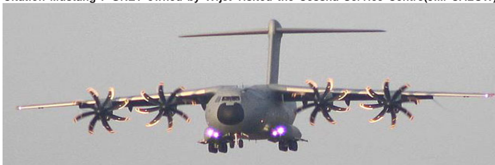
RAF Airbus A.400M ZM400 visited a couple of times in January on crew training details