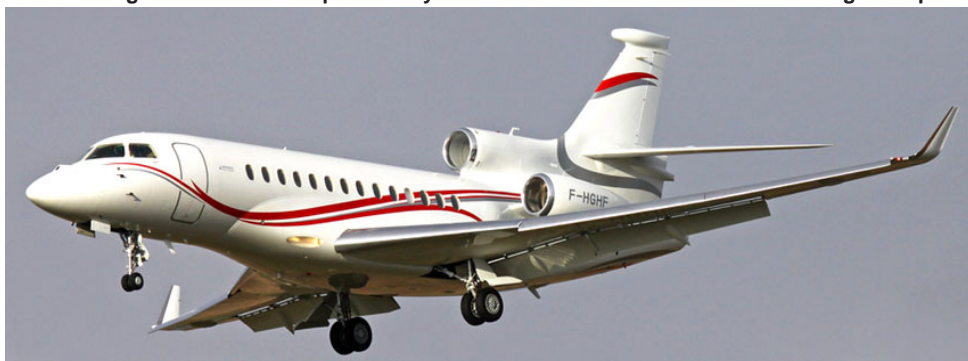
Falcon 7X F-HGHF operated by Dassault Aviation on final approach, 17/1