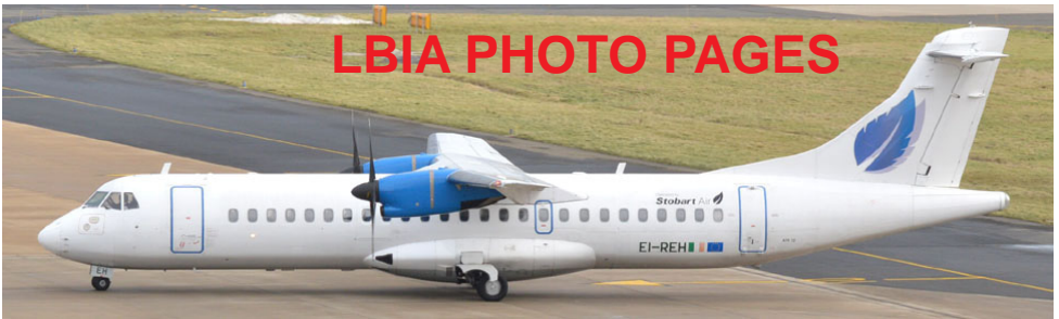
ATR-72 EI-REH of Aer Lingus/Stobart Air taxiing onto stand, arriving from Dublin, 24/1