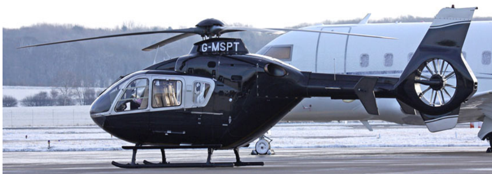
Owned my M Sport Ltd, EC-135 G-MSPT on a wintery day, 30/1