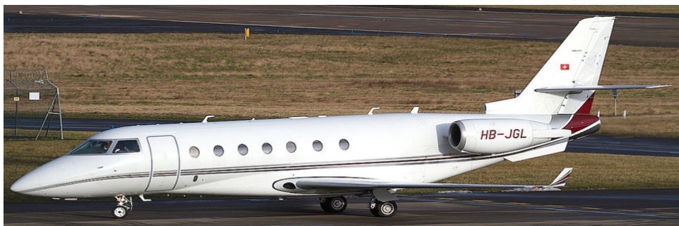
Gulfstream 200 Galaxy HB-JGL operated by TAG Aviation visited 26/1 (David Blaker)