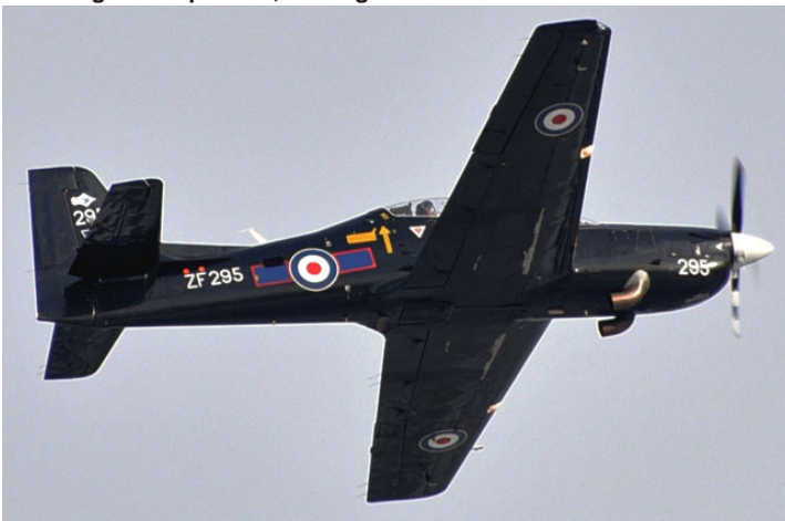
Tucano ZF295 carrying out an overshoot at LBIA, 20/1