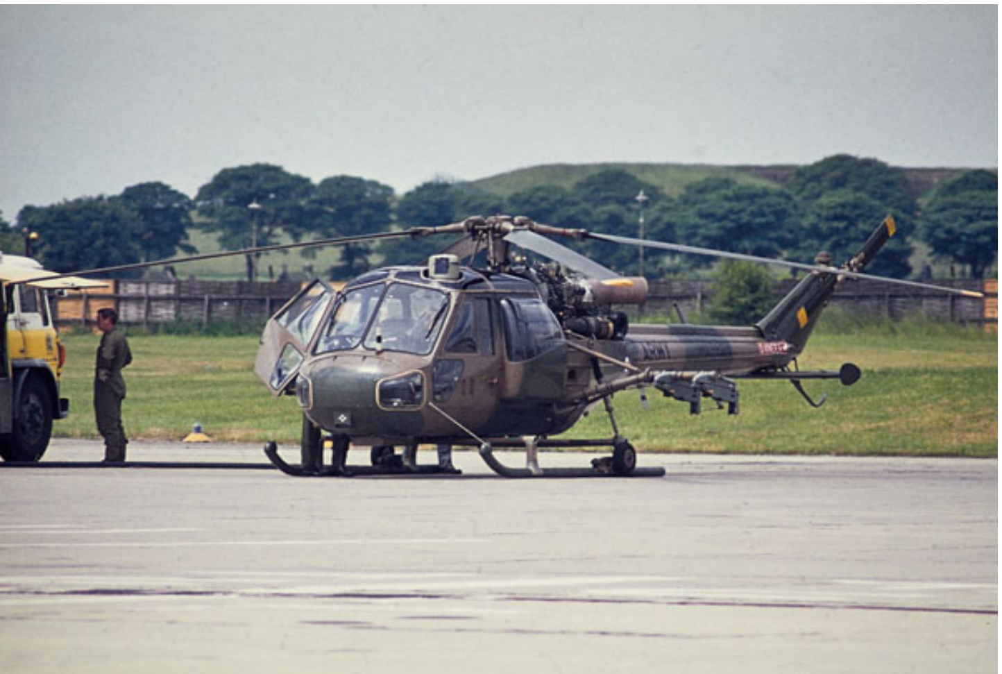
Westland Scout XT624 of the Army Air Corps getting refuelled at LBA in 1970s