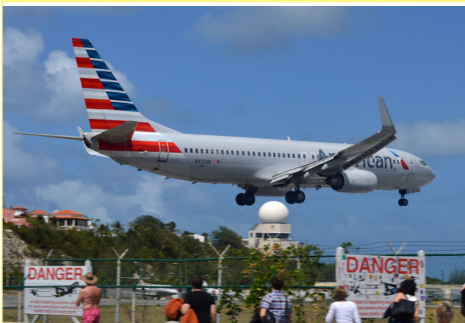
N972AN Boeing 737/800 of American Airlines landing at St Maartens, 06/03/15