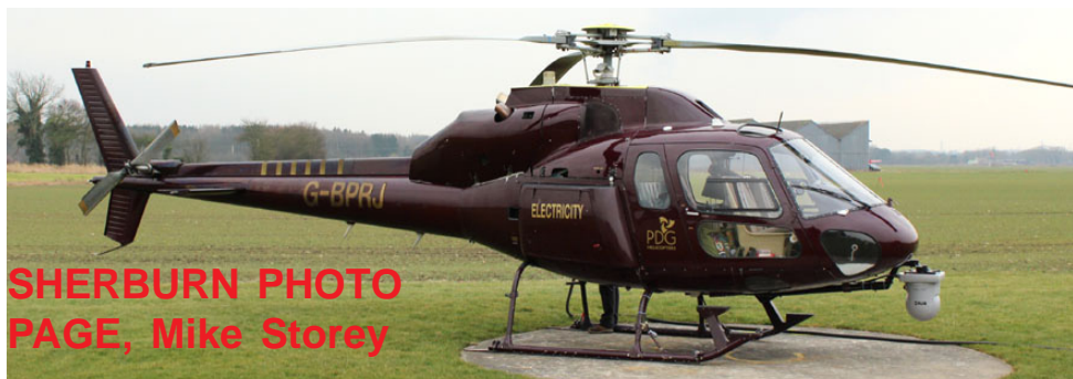
Twin Squirrel G-BPRI was based while carrying out local powerline inspection flights