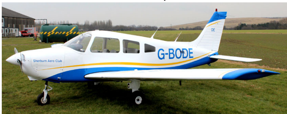
PA-28 Warrior G-BODE of the Sherburn Aero Club, fresh from the paint shop