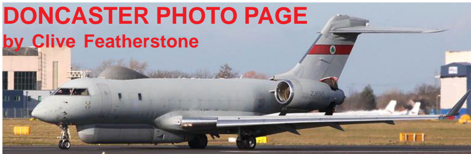
Sentinel ZJ690 arrived from Cranwell for a refuel before crossing the Atlantic on 15/1