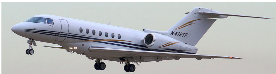
Hawker 4000 N412TF departing for Helsinki on 13/1 (David Blaker)