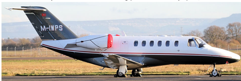
German owned Citationjet 3 M-IPWS(ex D-IPWES of Schnieder GmbH, 27/1