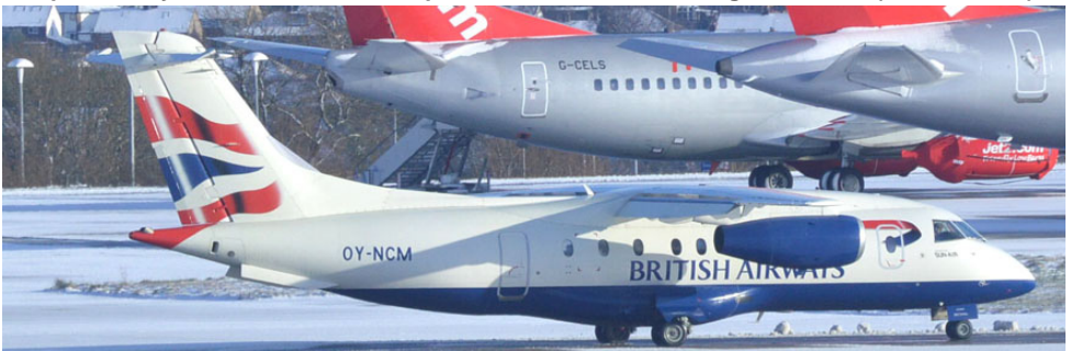
Taxiing for departure, having diverted from Manchester due to snow, Do.328Jet OY-NCM