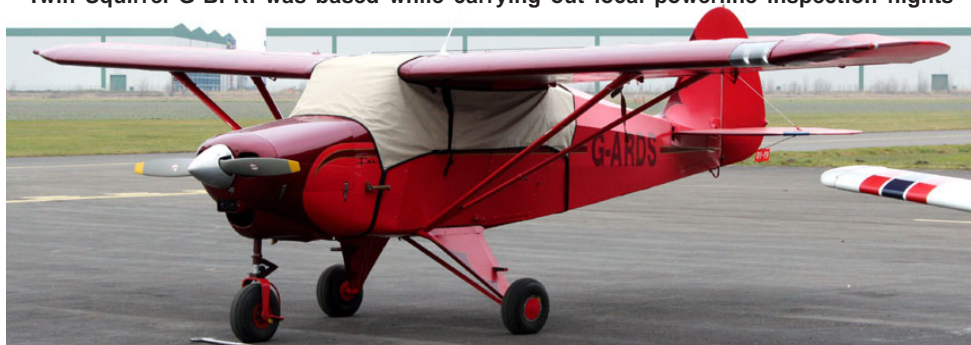
PA-22 Caribbean G-ARDS is owned by an individual from York