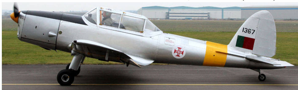
Resident Chipmunk G-UANO, painted up as 1367 of the Portuguese Air Force