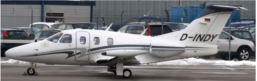
Operated by Ralf Schumaker, Eclipses Jet D-INDY on Multiflight/East, 20/1 (Rod Hudson)