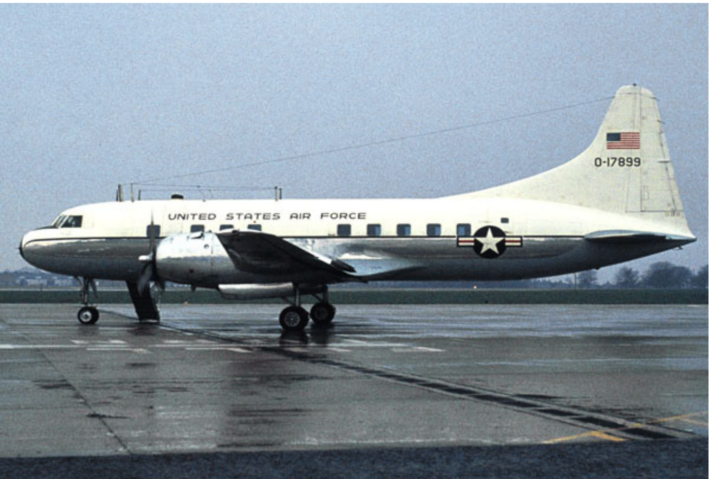
Convair T-29 s of the USAF were a common sight at LBA in 1970s, this example 51-7899