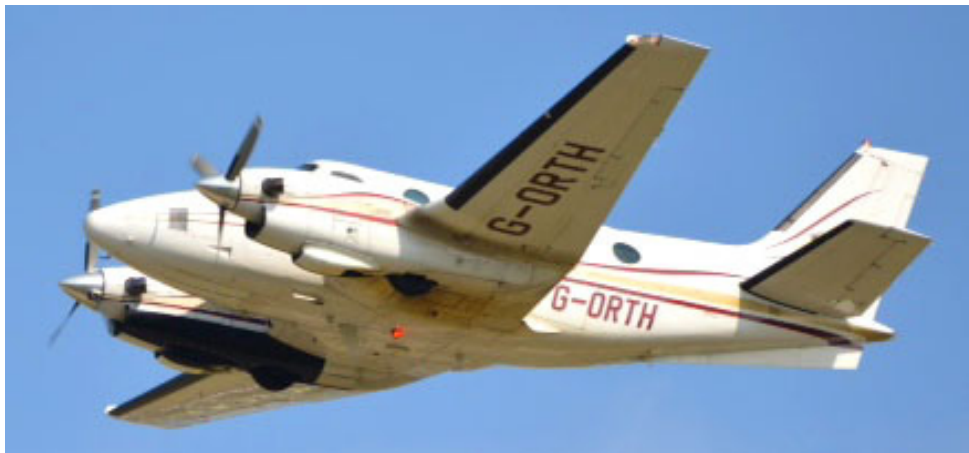
King Air 90 G-ORTH operated by Jota Aviation, departing LBIA, 05/09/13