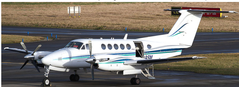
King Air 200 G-IASM operated an Ambulance flight from Belfast, 9/1 (David Blaker)