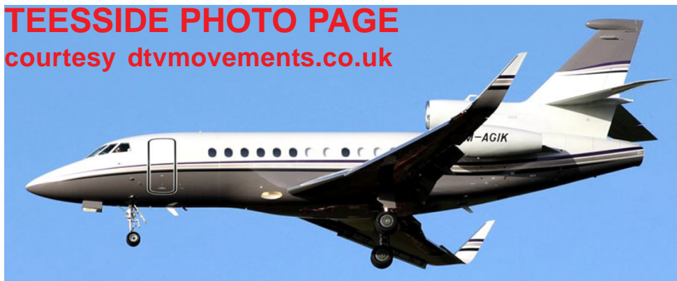
Operated by Amboy Overseas Falcon 900EX M-AGIK visited on 24/1