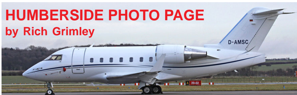
Challenger 604 D-AMSC operated by MHV Aviation arrived on 27/1 for a night stop