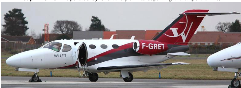
Citation Mustang F-GRET owned by Wijet visited the Cessna Service Centre(JIM CALOW)