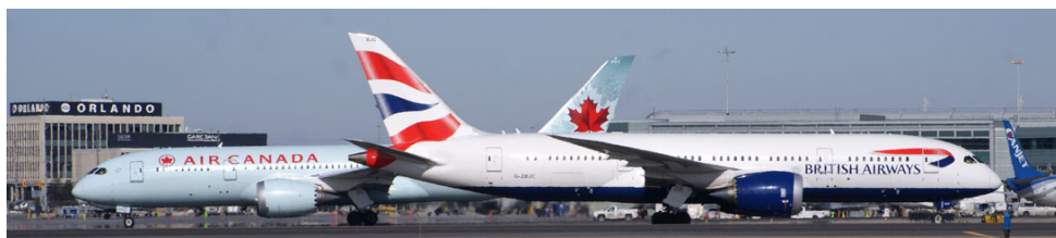
A pair of Dreamliners at Toronto/Peason International C-GHPU of Air Canada and G-ZBJC of British Airways (Ian Morton)