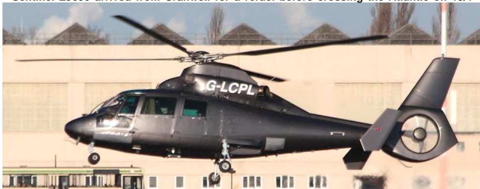
Dauphin G-LCPL operated by Charterstyle Ltd, departing the airport on 10/1