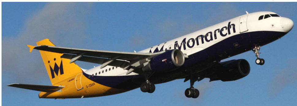
Airbus A.320 G-ZBAR of Monarch Airlines departing LBIA, 14/01/15(Mike Storey)