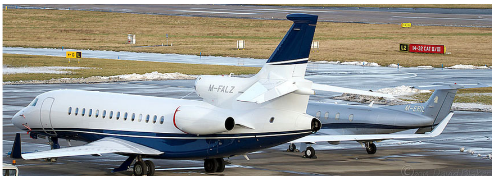
Manx duo on Multiflight/East, 24/1 German based Falcon 7X M-FALZ and PC-12 M-ERIL of Confidentialia Aviation