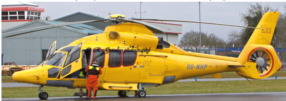
OO-NHP, one of a pair of EC-155's of NHV based at Humberside to operate oil-rig flights