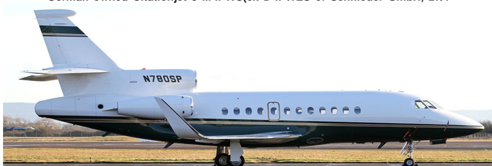
Based at Fairfield, Connecticut, Falcon 7X N780SP arrived on 18/1 and night-stopped