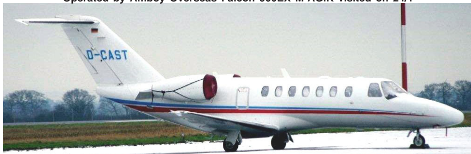
Citationjet 4 D-CAST of Air Hamburg parked on a snowy apron, 17/1