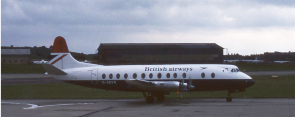
Leeds Bradford 1978 G-AOYR Vickers Viscount