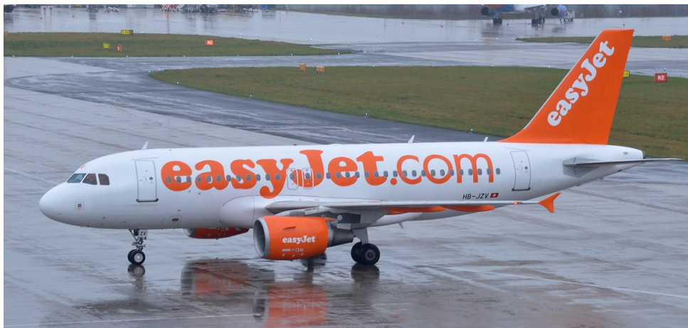
HB-JZV Airbus A319 Easyjet 3 January 2016

1/1 G-EZAF, 2/1 G-EZBD, 3/1 HB-JZV, 4/1 G-EZBC, 8/1 G-EZAF, 9/1 G-EZDH, 10/1 G-EZBH, 11/1 G-EZBF, 15/1 G-EZBF, 16/1 G-EZBB, 17/1 G-EZAS, 18/1 G-EZBE, 22/1 G-EZAX, 23/1 G-EZDL, 24/1 G-EZAF, 25/1 G-EZGD, 29/1 HB-JYC, 30/1 G-EZEB, 31/1 G-EZDP.