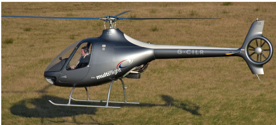
G-CILR Cabri G2 Multiflight LBA 20/02/16