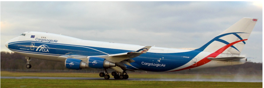
G-CLAA Boeing 747-400 Cargologic Air 12/01