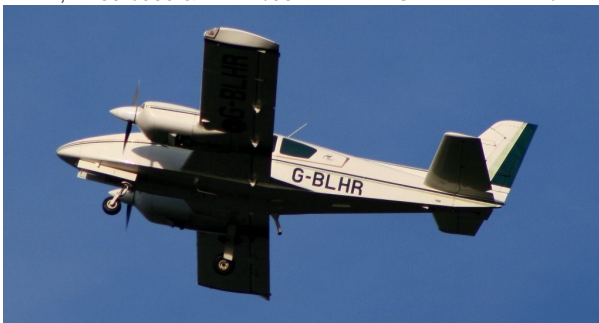
G-BLHR Gulfstream GA-7 13/01