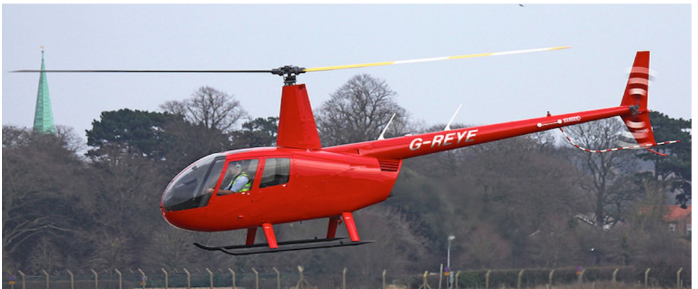
13 January G-REYE R.44