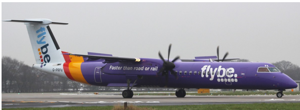
G-PRPA DASH-400 Flybe 18 January Mike Storey