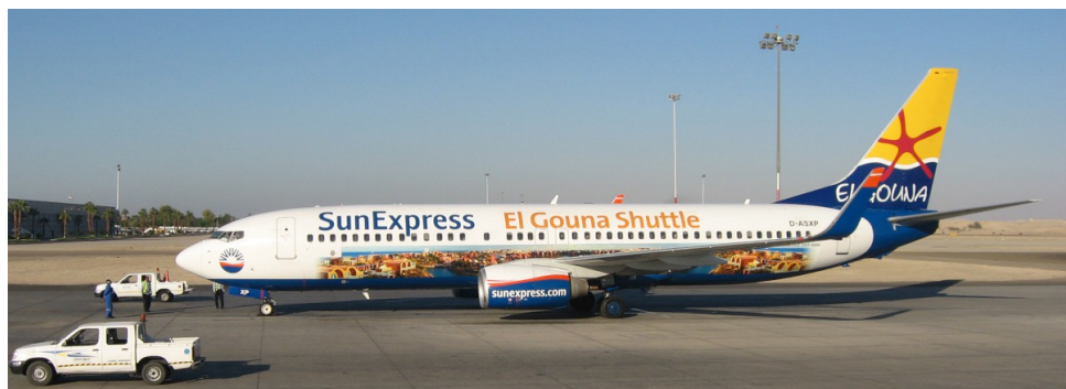
D-ASXP Boeing 737-8HX Luxor SunExpress