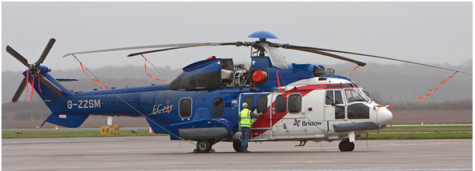
6 January G-ZZSM Super Puma

ALL Photographs courtesy of Rich Grimley Photography unless stated otherwise