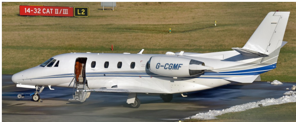
G-CGMF Cessna 560SL Citation XLS Rod Hudson (20/01/2016)

Phenom 300 D-CHIC arr 09:38 fr Cologne dep 12:10 to Zurich, Challenger 300 N229BP dep 09:50 to Gander, Cirrus SR22 N590CD arr 11:05 from Sherburn n/s, Pilatus PC-12 M-ARTY dep 11:21 to Old Buckenham, Cessna 560 XLS G-OJER arr 13:00 fr Jersey n/s, Phenom 300 CS-PHE arr 14:43 from Annecy as NJE932T dep 15:01 to LeBourget as NJE906L, Phenom 100 9H-FGV arr 18:53 from Toulouse n/s.