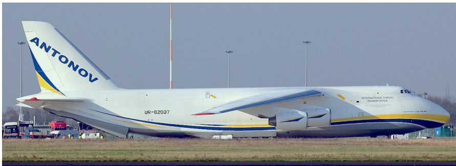
UR-62007 Antonov A-125 Antonov Airlines 20/01

16th G-JMCM Boeing 737-300 Atlantic Airlines/West Atlantic (F) (T) (FV) 20th UR-82007 Antonov AN-124 Antonov Airlines