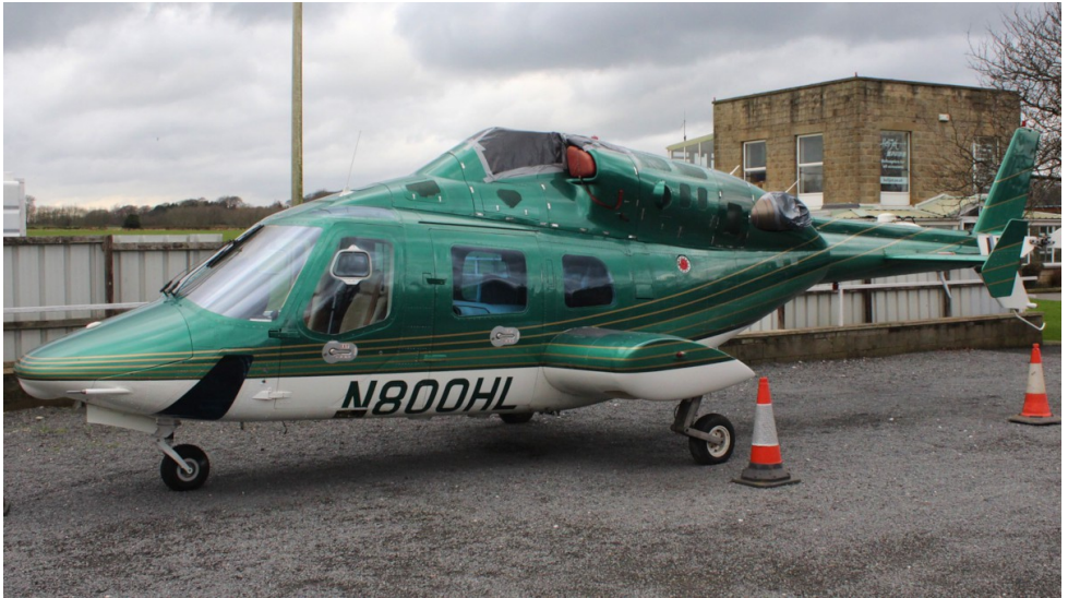
Coney Park - N800HL Bell 222 - 25 January Mike Storey

Tenerife (3513/3512 "6FP/6YD"):-1/1 G-FDZS, 8/1 G-FDZS, 15/1 G-TAWI, 22/1 G-FDZS, 29/1 GFDZS.