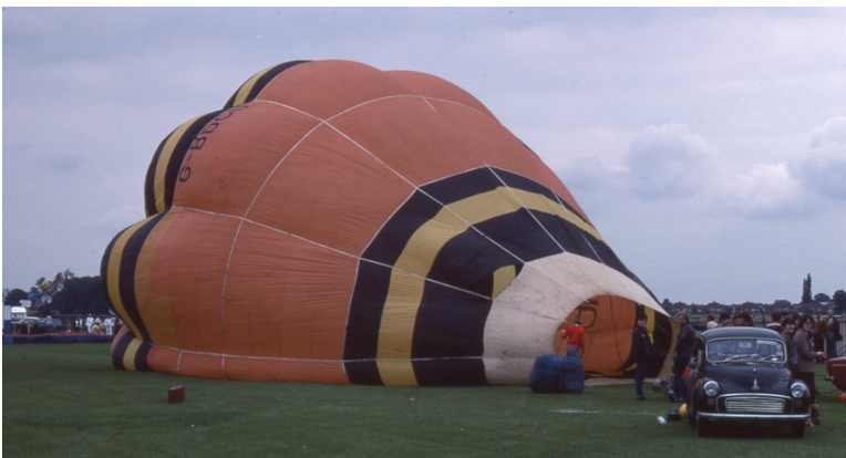
York Racecourse 1978 G-BDCU