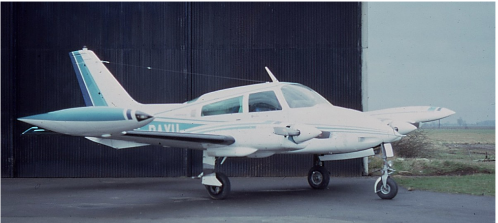
Sherburn 1978 G-BAYU Cessna 310