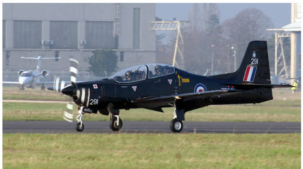
ZF291 Tucano 20/01

(FV) First Visit. (T) Training. (H) Helicopter. (F) Freighter. (M) Maintenance