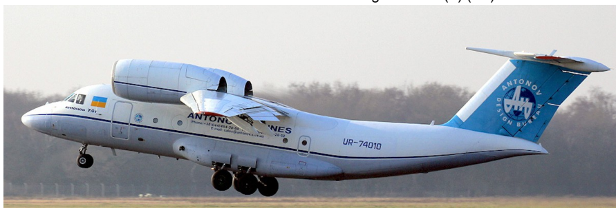
UR-74010 Antonov AN-74 Antonov Airlines 20/01

20th UR-74010 Antonov AN-74 Antonov Airlines/Antonov Design Bureau (F) (FV)