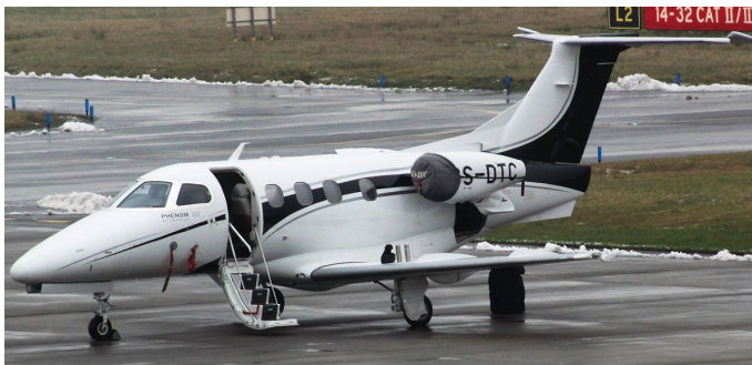
CS-DTC Phenom 100 Mike Storey

Bae 146 ZE708 f/t Northolt (10:08/13:05), Phenom 100 CS-DTC arr 10:25 fr Geneva dep 17:15 to Northolt, Sky Taxi Saab 340 SP-MRC arr 20:02 from Angers-Loire n/s.