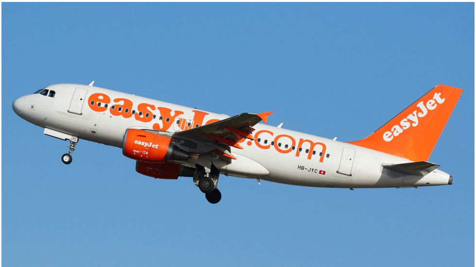
HB-JYC Airbus A319 Easyjet Switzerland 29 January David Blaker