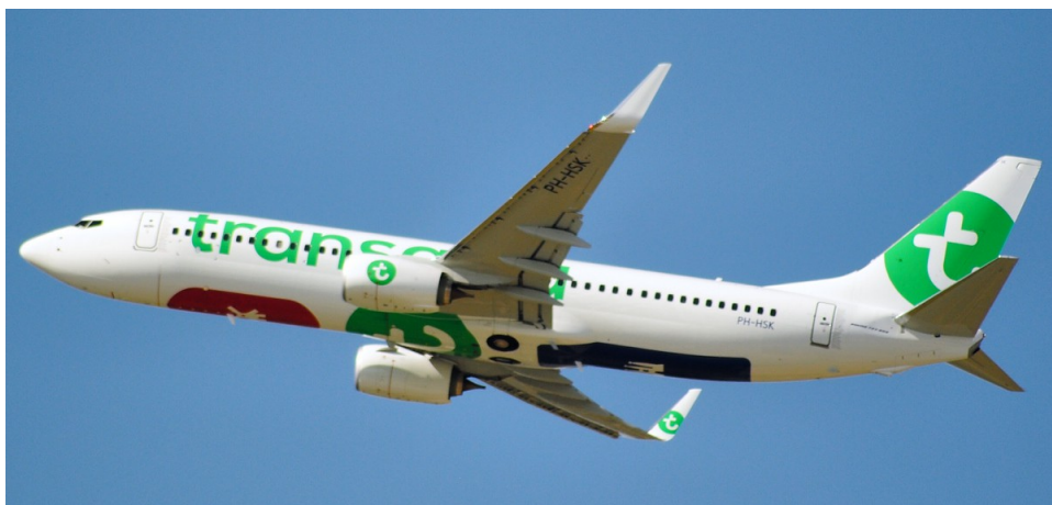
PH-HSK Boeing 737-800 Malaga Transavia (Steve Lord)