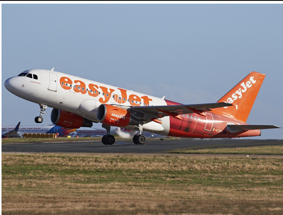
G-EZBF Airbus A319 - EasyJet Leeds/Bradford 15 January 2016 David Blaker