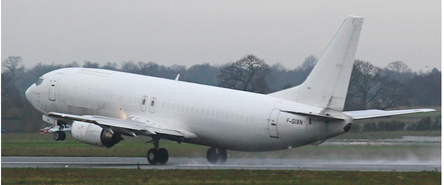
F-GIXN Boeing 737-400 Europe Air Post 11/01