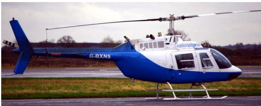
G-BXNS Bell 206B Jet Ranger III 07/01