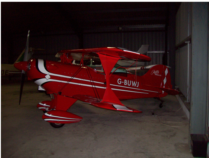
G-BUWJ Pitts S-1C New Resident 07/02/16