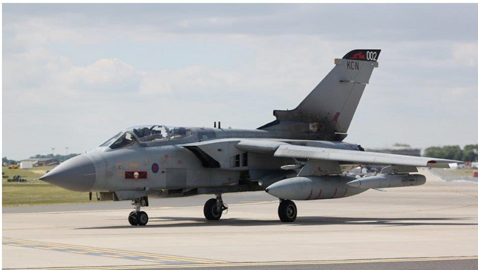
ZA367 Tornado GR.4 seen before going through the TRP process

The airfield still has the Hawk T.1 of 100 Squadron based in No.1 Hanger. The squadron provided aggressor training for the RAF and trains fast jet low level navigation training it also trains forward air traffic control training. The British Aerospace facility in the No.2 Hanger turns our Tornado's into scrap under the Return to produce scheme. It also provides extra overhaul facilities for Tornado's for British Aerospace at Marham. No.3 Hanger just contains the motor pool while No.4 Hanger the far right hanger when looking at the airfield from the spectator viewing area houses the Northumberland University Air Squadron's Tutor T.1 which also provides Air experience for Air Cadets at weekends under No.11 AEF. The hardened shelter area is only used to house some of the Tornado's awaiting scrapping and occasionally is used by aircraft on exercises in the area.