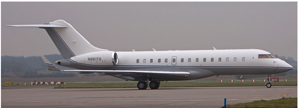
22 January N881TS Global Express