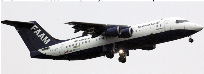
G-LUXE BAE-146-300 FAAM 14/01