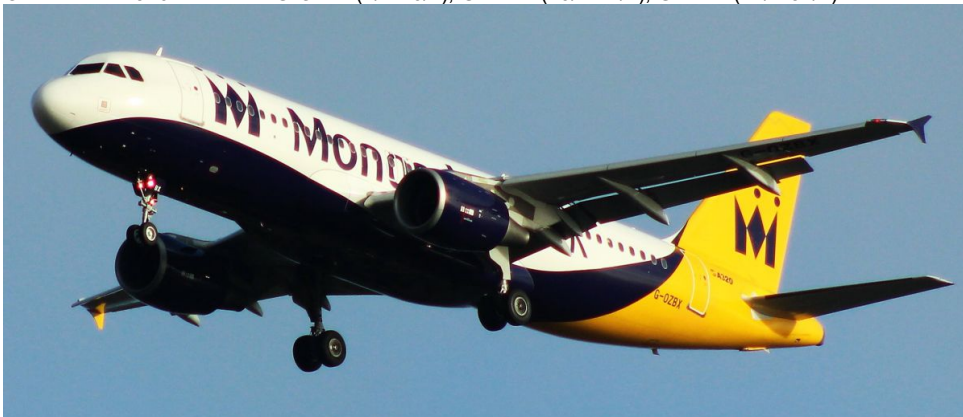
G-OZBX Airbus A320 Monarch 10/01 Jim Stanfield

One Airbus A.320 is based:- G-OZBX(1/1-20/1), G-ZBAR(20/1-27/1), G-ZBAT(27/1-31/1).