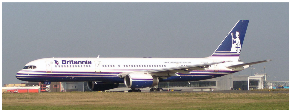
G-BYAH Boeing 757 21/03/03