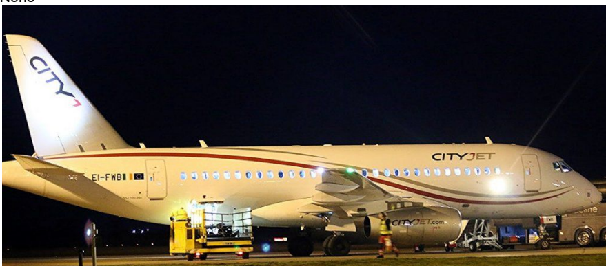
EI-FWB Sukhoi Superjet 100/95B 30/01