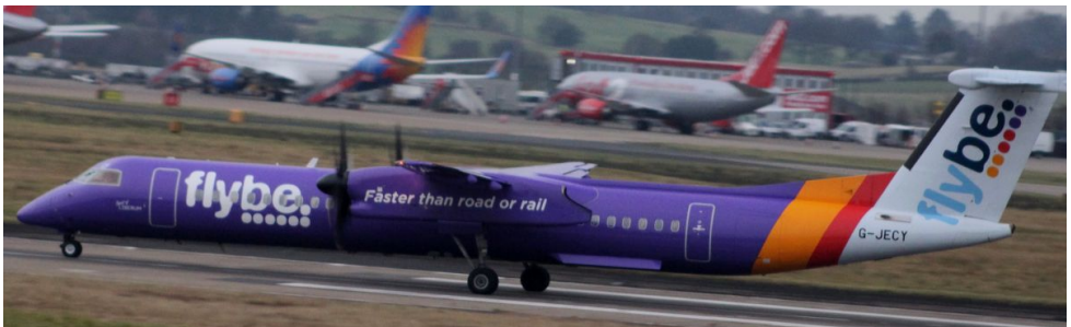
G-JECY Dash8-Q400 FlyBe 19/01 Rod Hudson

Belfast City (737/738, "7SN/6MF"):-1/1 G-JEDT, 2/1 G-FLBE, 3/1 G-JECG, 4/1 G-FLBD, 5/1 G-JEDT, 6/1 G-JEDP, 8/1 G-PRPH, 9/1 G-PRPI, 10/1 G-FLBE, 11/1 G-PRPL, 12/1 G-PRPH, 13/1 G-JECK, 15/1 G-PRPI, 16/1 G-ECOF, 17/1 G-FLBC, 18/1 G-JEDR, 19/1 G-FLBD, 20/1 G-ECOA, 22/1 G-PRPI, 23/1