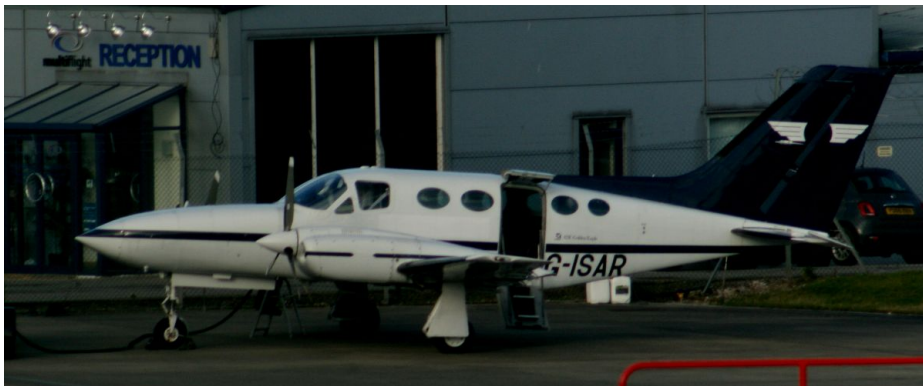
G-ISAR Cessna 421C Golden Eagle Ian Gratton

Cessna 421C Golden Eagle G-ISAR arr 11:50 from EDI dep 13:34 to Aberdeen, SOCATA TB-20 Trinidad G-EGAG arr 12:08 from Sherburn for maint, Gulfstream 650 N762MS dep 15:42 to Toronto,