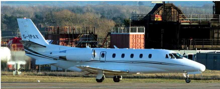
G-IPAX Citation 560XL 14/01