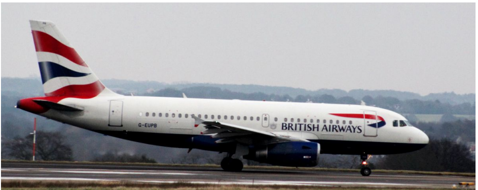
G-EUPB Airbus A320 BA 19/01 Rod Hudson

Heathrow (1346/1347, "20D/21V"):-2/1 G-EUPO, 3/1 G-EUPL, 4/1 G-EUPA, 5/1 G-EUPJ, 6/1 G-EUOE, 7/1 G-EUPT, 8/1 G-EUPX, 9/1 G-EUPJ, 10/1 G-EUPW, 12/1 G-EUPY, 13/1 G-EUPB, 14/1 G-EUPK, 15/1 G-EUOI, 16/1 G-EUPL, 17/1 G-EUPY, 18/1 G-EUOI, 19/1 G-EUOE, 20/1 G-EUOE, 21/1 G-EUOB, 22/1 G-EUPH, 23/1 G-EUPS, 24/1 G-EUOD, 25/1 G-EUPT, 26/1 G-EUPC, 27/1 G-EUPS, 28/1 G-EUOG, 29/1 G-EUPM, 30/1 G-EUPK, 31/1 G-EUPJ.