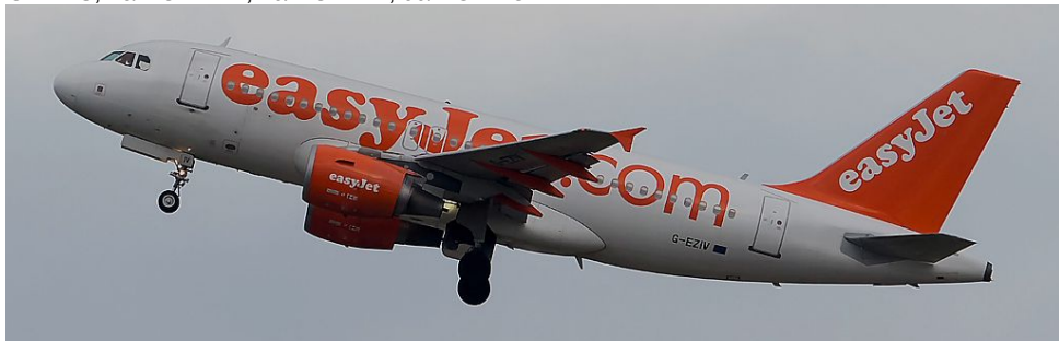
G-EZIV Airbus A319 EasyJet 07/01 Stewart Robershaw

1/1 G-EZBW, 2/1 G-EZUO, 6/1 G-EZAK, 7/1 G-EZIV, 8/1 G-EZFX, 9/1 G-EZTH, 13/1 G-EZDH, 14/1 G-EZFD, 15/1 G-EZBW, 16/1 G-EZTT, 20/1 G-EZBP, 21/1 G-EZFF, 22/1 G-EZGB, 23/1 G-EZOE, 27/1 G-EZBU, 28/1 G-EZFN, 29/1 G-EZBI, 30/1 G-EZOE.