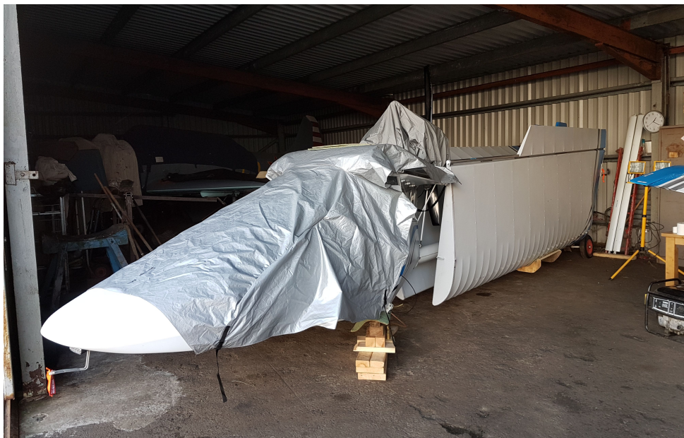
G-MGPX Twinstar MkIII