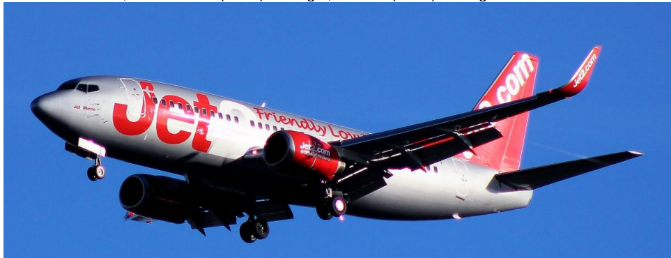
G-GDFT Boeing 737-800 Jet2.com 05/01 Jim Stanfield