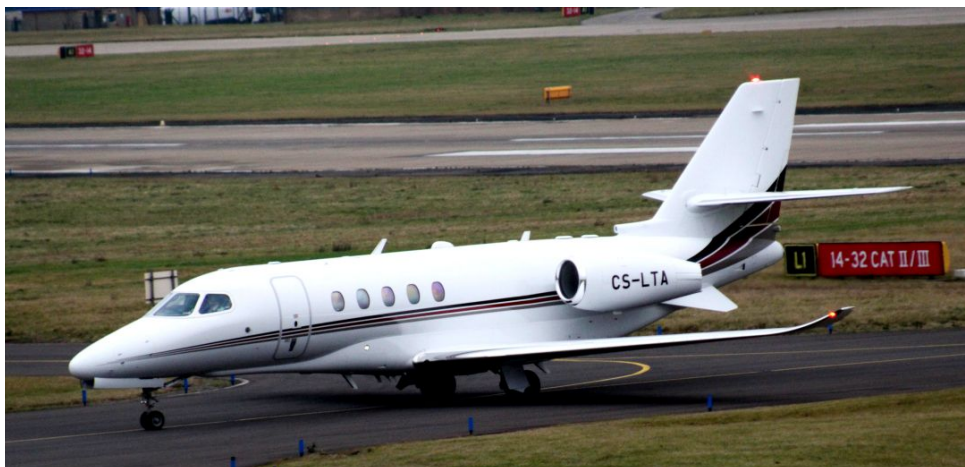
CS-LTA Cessna 680 Latitude 19/01 Rod Hudson

Phenom 300 CS-PHG dep 09:22 to Cologne as NJE433C,