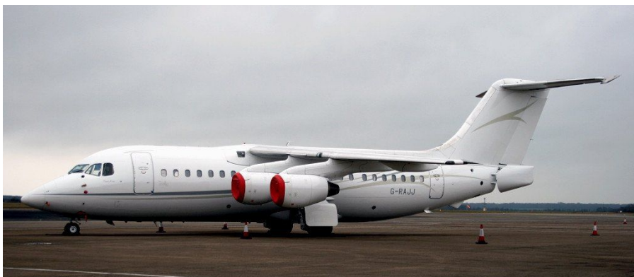
G-RAJJ BAe 146-200 31/01

31/01 G-GYTO Piper PA-28 Warrior III f/t Oxford, G-SPTR Robinson R44f/t Newcastle f Private Site n/s Heli Air, G-RAJJ BAe 146-200 n/s t Birmingham Cello Aviation