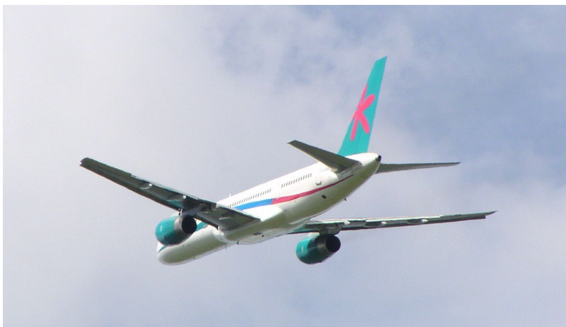
Air 2000 08/05/03