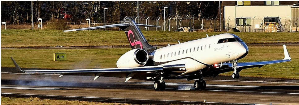
N880ZJ Bombardier BD-700-1A11 25/01 Rod Hudson

Phenom 300 HB-VPG dep 07:51 to Lahr (Ger), Global 5000 N880ZJ arr 15:21 from Luton dep 17:21 to Teterboro,