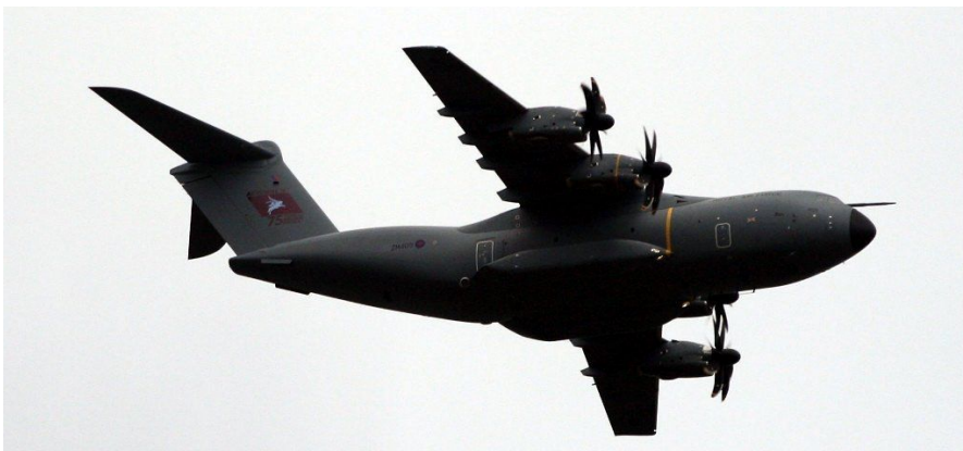
ZM409 Airbus A400M Atlas C1 30/01

23/01 G-SCCA Citation 510 Mustang f/t Jersey * 2 Gama/Beauport 24/01 G-OSRB Boeing 727-2S2F(A)(RE) f/t Doncaster * 2 T2 Aviation 25/01 OY-CYV Citation 550 II f/t Aalborg North Flying A/S, D-ITRA Citation 525 CJ1 f/t Siegerland, F-GMTJ Citation 510 Mustang f/t Paris Le Bourget Ouest Participations, D-CFOR Learjet 35A f Alicante t Birmingham Air Alliance Express, N347DC Cirrus SR22T f/t Leeds Cock Aviation Inc 26/01 G-BHNO Piper PA-28 Archer II f/t Halfpenny Green HJK Asset Management 27/01 G-OLCP S355 Twin Squirrel f Private site t/f Local flight t Private Site Cheshire Helicopters 28/01 G-LEAA Citation 510 Mustang fLuton t Humberside London Exec Aviation, G-VGMC AS355 Twin Squirrel f Private site t ? Cheshire Helicopters 29/01 None 30/01 ZM403/ ZM409 Airbus A400M Atlas C1 f Brize Norton c/t RAF, G-RAJJ BAe 146-200 f Birmingham n/s Cello Aviation