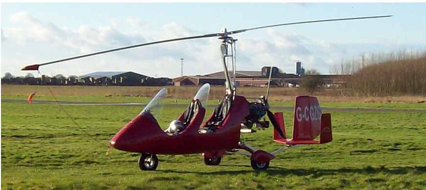
G0CGZG MTOSport 14/1

2/1 G-EISG A36 f/t Sherburn 4/1 2-PLAY TBM700 f/t Gurnsey 5/1 G-CIBZ Eurofox f/t Temple Bruer, N616MD 369E f/t Gamston, G-KITS Europa f/t Wellesbourne 6/1 G-CIWU 369E f Gamston 7/1 G-BBDT 150H f/t Sherburn, G-BBNJ F.150L f/t Sherburn 8/1 N616MD 369E f/t Gamston, G-BEZF AA5 f/t Cranfield, G-EISG A36 f/t Sherburn 9/1 N616MD 369E f/t Gamston, G-BEZF AA5 f/t Cranfield, G-EISG A36 f/t Sherburn 10/1 G-GRZZ R.44 f/t Gamston 14/1 G-BPRY PA-28 f/t EMA, G-BORL PA-28 f/t Blackpool, G-CGZE MTOSport f/t Rufforth East, G-CGZG MTOSport f/t Rufforth East, G-CDNO Gazelle AH.1 f/t Kirton near Boston, G-RMAV C42 FB80 f/t Beverley, G-CCSR EV-97A f/t Netherthorpe, G-CORB TB20 f/t Gloucester