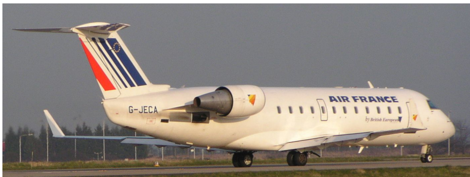
G-JECA CRJ-200ER Jersey European 01/03/03