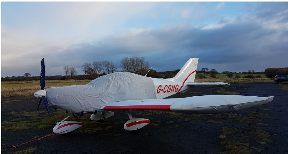
G-CGNG CZA Sportcruiser

I knew the proposed New Years Day fly-in had already been cancelled due to the adverse weather forecast but being in the area on holiday and so close too it seemed a shame not to call in , so I did !