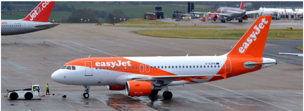
G-EZFN Airbus A319 EasyJet 28/01