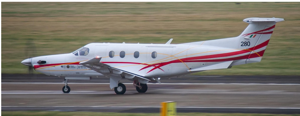
280 PC12 Irish Air Corps 23/01

EJ-REVA arr 10:12 n/stop (ex N534RV Reva air Ambulance), Cessna 680 Latitude CS-LTF arr 17:21 n/stop,