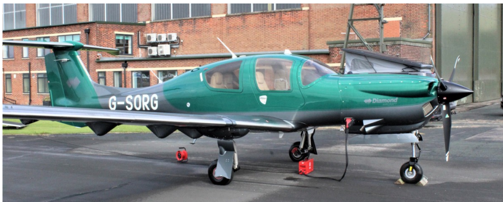
G-SORG Diamond DA50RG