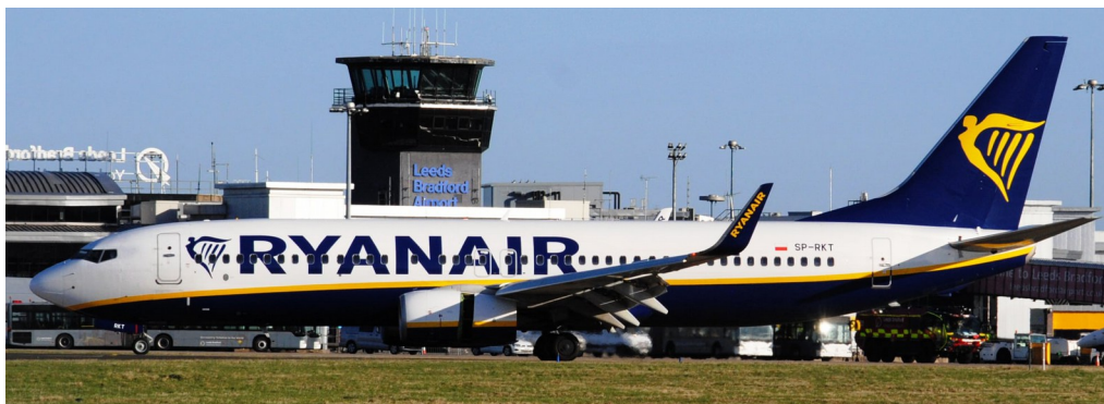
SP-RKT Boeing 737-800 Ryanair 21/01 David Wooler

Wroclaw (4108/4107, "1PV/1BR", Mon/Fri):-3/1 SP-RSY, 7/1 SP-RSQ.