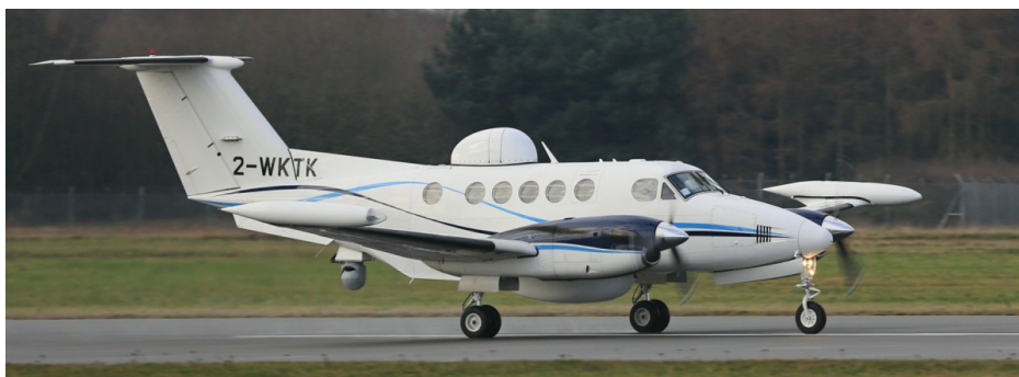
2-WKTK Beech 200T Super King Air. 16/01