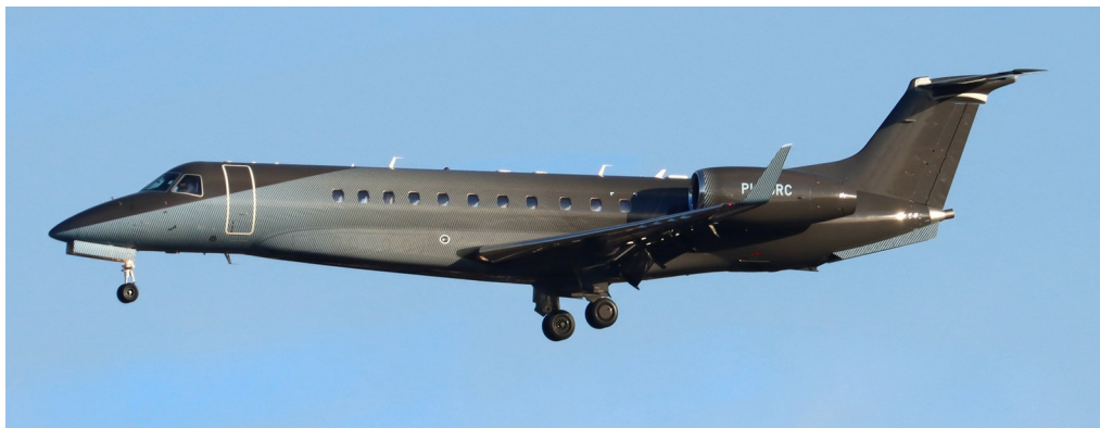
PH-JRC Legacy 600 02/01 Paul Whincup

Eclipse EA500 2-MUJJ arr 09:53 dep 11:06, Legacy 600 PH-JRC arr 11:27 dep 12:13, PA-28R Cherokee Arrow G-BFTC dep 11:48, Cessna 525A CJ2 9A-JSD arr 16:25 dep 16:58, Learjet 75 G-ZENJ arr 16:48 dep 18:13, Phenom 300 CS-PHC arr 17:56 n/stop, Falcon 7X HB-JOB arr 21:24 dep 22:11.