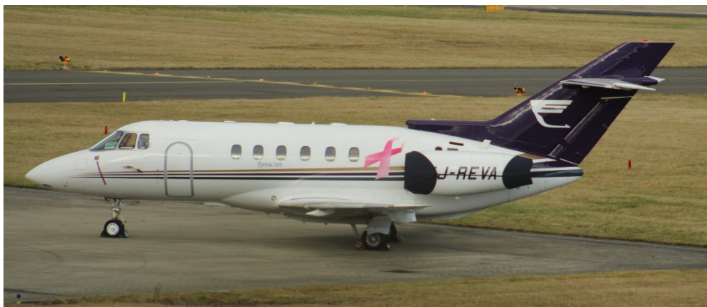
EJ-REVA Hawker 800P Reva Air 22/01 Ian Gratton

PA-28R Ch.Arrow G-BFTC arr 12:21 n/stp, Beechjet 400 OK-JFA arr 1716 dep 1812, Beechjet 400 SP-OOK dep 1827, Gulfstream G550 N631LF dep 18:38, Beech350 Shadow ZZ417 ILS approach at 19:54.