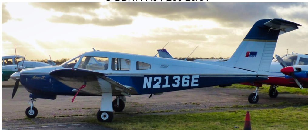
N2136E PA28RT201 29/01