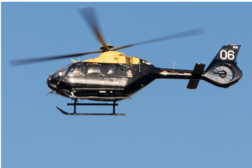
ZM506 Eurocopter H135 Juno HT1 31/01 Stewart Robertshaw

Phenom 300 CS-PHD dep 08:53, Phenom 100 ZM333 IIS approach at 09:30, Beechjet 400 SP-TAT dep 10:07, Eurocopter H135 Juno ZM506 arr 13:17 dep 14:29, PA-31 Navajo G-OUCP arr 13:33 dep 13:51, BAE Hawk T2 ZB133 overshoot at 13:49, BN-2T Islander G-BIIO arr 14:16 dep 15:15, PA-31 Navajo G-SCIR arr 15:02 dep 15:22, Beech 200 Kingair G-WCCP arr 16:33 dep 17:43.