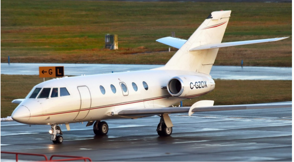
C-GZOX Falcon 20 09/01 Falcon Air 09/01 Paul Whincup

Global Express C-GLXM arr 07:30 n/stop, Falcon 20 C-GZOX arr 08:44 n/stop, Cirrus Sr22 N774MW arr 12:08 dep 14:18, Eclipse EA500 2-MINI arr 15:17 n/stop, Phenom 300 CS-PHN arr 15:43 dep 16:58, Phenom 300 D-CHIC arr 19:35 n/stop.