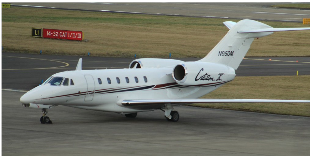
N950M Citation 750 Acorn Stairlifts 27/01 Ian Gratton

Diamond DA42 G-HAKA dep 12:03, Cessna 750 Citation X N950M arr 12:15 dep 16:30, Falcon 2000EX CS-DLH dep 13:04, Cessna 208 Caravan II G-DLAD arr 15:04 dep 16:04, Piaggio P180 Avanti D-IIVA arr 20:30 n/stop.