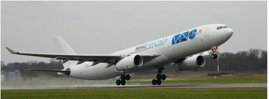
TC-MCN Airbus A330-300 MNG Airlines 15/01