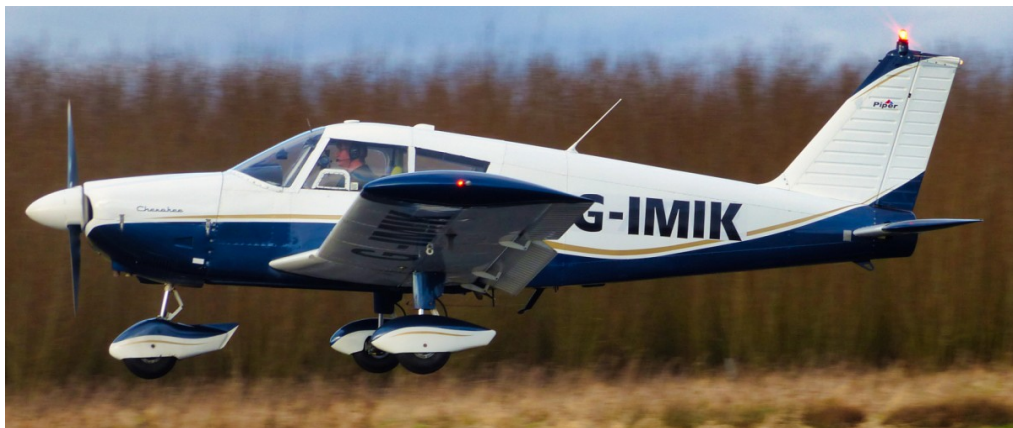
G-IMIK PA28 22/01