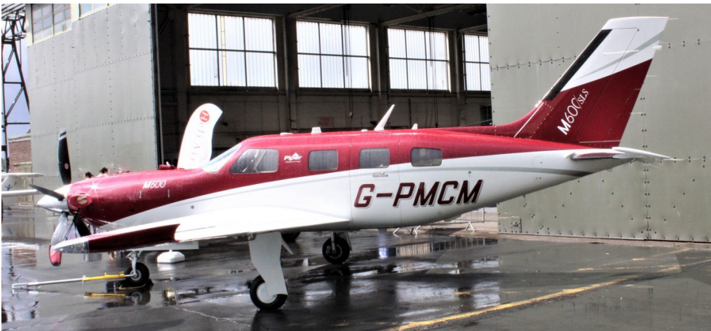
G-PMCM Piper PA46 M600