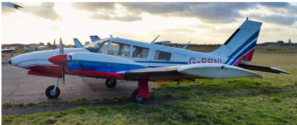
G-BBNI PA34-200 29/01