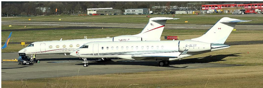
C-GLXM Global Express/N613LF Gulf V 20/01 Mike Storey

and go at 15:40, Phenom 100 ZM333 ILS approach at 16;18, Challenger 350 CS-CHG arr 18:15 n/stop.