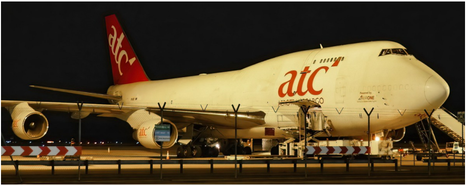
ER-BBB Boeing 747-400 Aerotrans Cargo 13/01