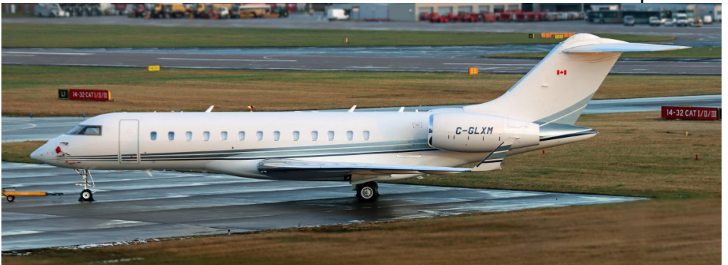
C-GLXM Global Express Sky Service 09/01 Paul Whincup