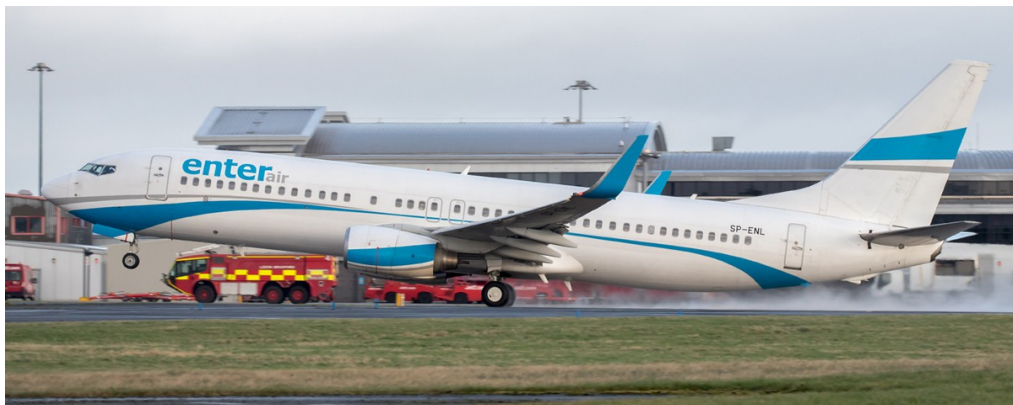
SP-ENL Boeing 737-800 Enter Air 09/01 Stewart Robertshaw

Enter Air (ENT/E4, "EnterAir") :-9/1 SP-ENL(3053) positioned in from Gatwick then operated charter to Enontekio, 13/1 SP-ENL(3056/3058P) operated charter in from Enontekio/positioned out to Toulon-Hyeres.