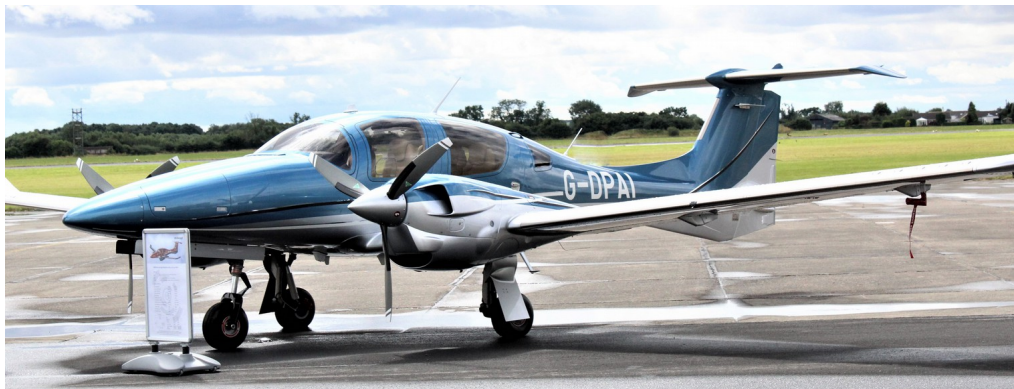
G-DPAI Diamond DA-62