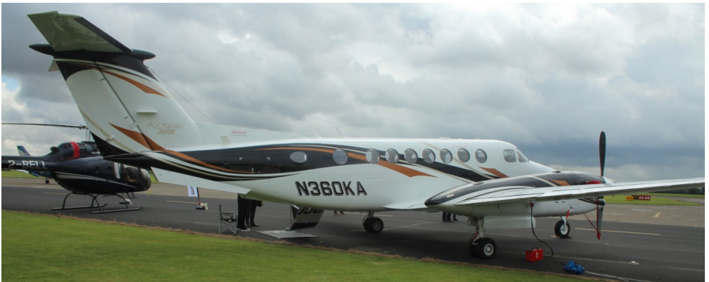
N360KA King Air 360 Textron