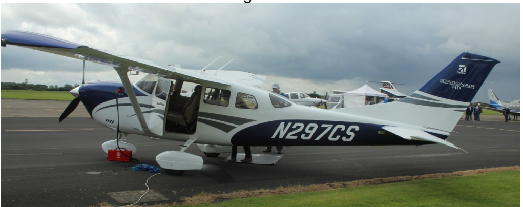
N297CS Cessna T206 Textron