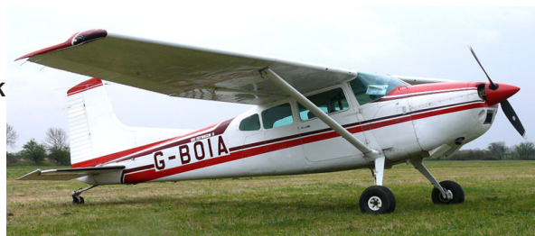
G-BOIA Cessna 180K owned by 4Media, London