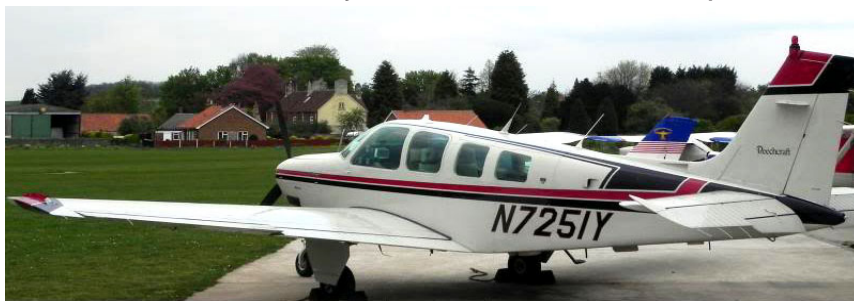
Beech A.36 N7251Y is operated by Turbo Arrow Inc and based at Elstree