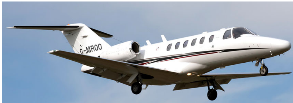
Citationjet 2 G-MROO of Rooney Air arriving from London City, 14/3(Robert Burke)

Multiflight:- Boeing 737/300 SX-MTF(Gain Jet 73) from Newark, New Jersey via Keflavik(0707). Ryanair:- EI-EFB(41GN/64QA Dublin, 2334/5 Knock, 1501/2 Niederrhein, 1503/4 Gdansk). EI-DLG(1584/5 Fuerteventura, 82QY/52AK Dublin), EI-DAM(Spare). Non based EI-EFV(01K/7MV Faro). EXECUTIVE JETS:- Citation XL CS-DXB (Fraction 6GW) from Sion(1156) to London City(1253). Citationjet 2 G-MROO (Hangar 898) from London City(1419) to Oxford(1523). GENERAL AVIATION:- Agusta A.109S G-USTS from Newcastle Heliport(1116) for a little TLC from Multiflight engineering, n/s. Mooney M20K G-BKMB departed home to Sherburn at 1554 following a visit to Multiflight engineering since last month. Pilatus PC-12 M-AMAN from Bournemouth(1837) n/s to 17/3, to Madrid/Torrejon(0535).