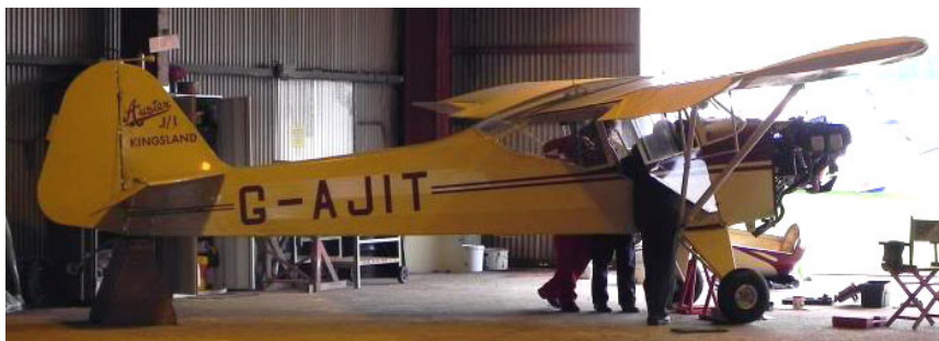
The unique 1936 vintage Auster J/1 Kingsland G-AJIT receiving some TLC