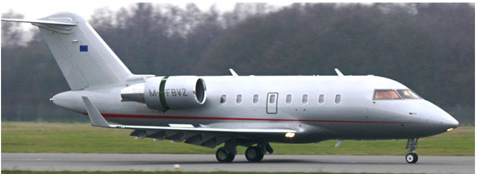
A new aircraft for Gama Aviation, Challenger M-FBVZ training on 3/3(Clive Featherstone)

The monthly update from Kinch Aviation sees the following aircraft in evidence on 16/4:- N80364 Citation 2(Stored), LN-RYG Citationjet(Stored), G-JETA Citation 2(Protracted maintenance), N646VP Citationjet(Still under repair following accident at LBIA), G-CDCX Citation X(Still under repair following arrival accident, plus maintenance it was inbound for), M-PARK Citationjet(Stored?), G-MAMD King Air 200, G-LIVY King Air 200, G-CJDB Citationjet, G-SVSB Citation Sovereign, M-CEXL Citation XL, N200RE King Air 90L, EI-TEN Citation X, G-HEBJ Citationjet, G-CTEN Citation X, D-IBBA Citationjet, M-TEAM Citationjet, G-JBLZ Citation 2, G-WOFMA.109E(in for painting), G-BLTK Commander 112(in for painting), G-BXYD EC.120B, G-OMMG R.44(in for paint work). The Bulldog G-CBAB/XX543 is thought to have departed on 8/4 having been present for some time for painting.