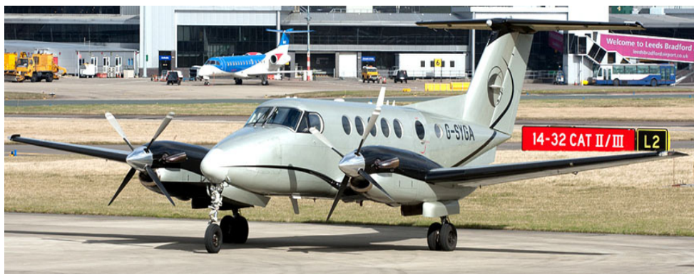
King Air 200 G-SYGA of Synergie, operating for Gama Aviation, 11/3

GENERAL AVIATION:- King Air 200 G-SYGA (Gama 049) f/t Glasgow(1120/1436). DA-42 G-DJET (White Knight 02) from Denham(1151) to Gamston(1238). PA-34 Seneca G-GFEY (Equity 14) f/t Blackpool(1335/1449).