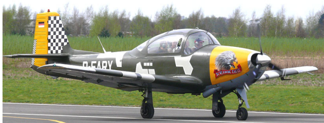
D-EARY Piaggio FWP.149 based at Barton, but a regular at Brighton, weekends