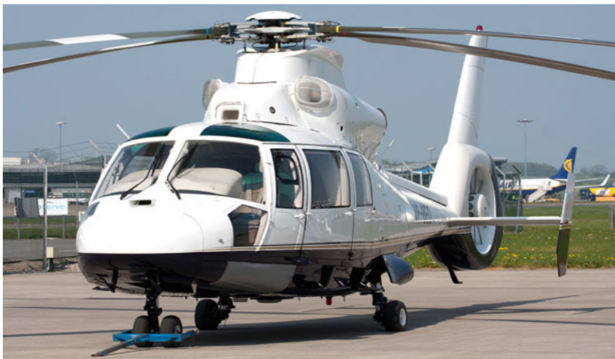
Dauphin VP-BEO was delivered to Multiflight in late April and is destined for use by the Great North Air Ambulance

GENERAL AVIATION:- King Air 200 G-WVIP (Prestige 628) from Geneva(1349) to Biggin Hill(1555).