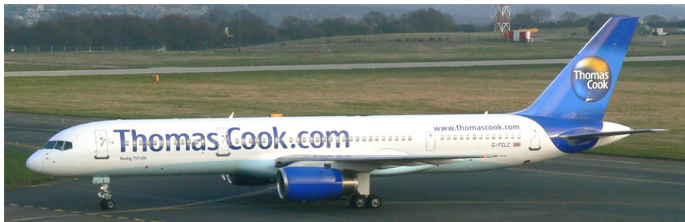
Thomas Cook Boeing 757 G-FCLC from Tenerife, taxiing onto stand, 27/3

GENERAL AVIATION:- Cessna F.172M G-BBJZ from Harewood(1022) to Sleaf(1207). Hughes 369E G-TVEE f/t Skipton(1148/1226). MD.902 Explorer G-YPOL (Police 42), ILS and overshoot(1249), f/t Carr Gate.