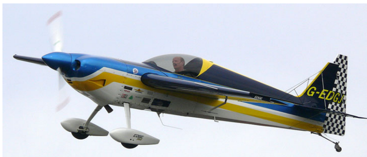
Edge 360 G-EDGJ flown by David Jenkins came 2th in the Icicle Trophy