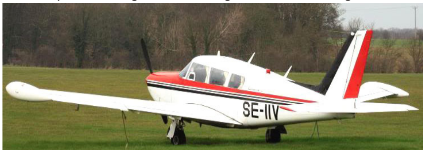
40 year old PA-24 Comanche 180 SE-IIIV is usually based at Gamston