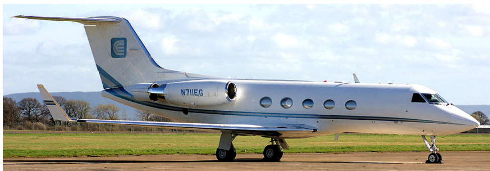
Gulfstream 3 N711EG of Entrepreneurial Management LLC at Teesside, 30/3

Sturgate:- On 23.3 G-LUED Pulsar arrived by road from its owners home in Gainsborough, carried out a local flight, and then returned home. Delete G-BIUW PA-28 which has been cancelled following sale in France. A visit 3.4 noted the following :- Lincoln Aero Club Hangar G-AWVC B.121, G-AYYU Beech C.23, G-BBHF PA-23, G-BDDG D.112, G-BRPF Cessna 120, G-CCNU Sky Ranger J2.2, G-CEBF EV.97A, G-FARY Quickie Tri-Q, G-UAPO R.90.230RG. Private Hangar Locked. Eastern Air Executive Hangar Locked but outside on their apron were G-AVYT PA-28R Gamston, G-BFEV PA-25 Kirtan in Lindsey, G-BKBN TB.10 impounded, G-CCZA MS.894A impounded, G-OBLC Beech 76 Humberide, N375SA PA-34-200T (34-7670002) Gamston. Residents on field G-AVZR PA-28, G-BONW 152, G-GKEV Pioneer 300, G-TECH RC.114, plus G-BGVE CP.1310-C3 and G-BROR J.3C-65 which had just nipped across to Netherthorpe and G-BKWD JT.2 which was on its way back from Brighton as we departed. Visitors between 14.05 and 15.00hrs. were G-AYFC D.62B f Netherthorpe t Brighton and G-OPAZ PL.2 f&t Boston.