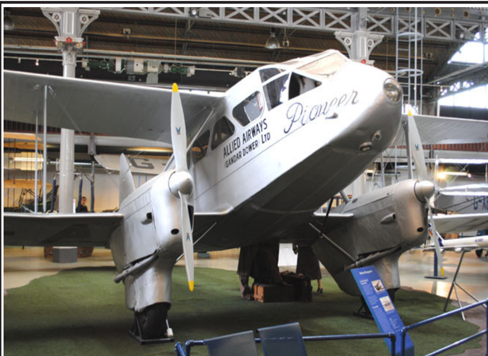
G-ADAH Dragon Rapide, Allied Airways Manchester Aerospace and Science Museum