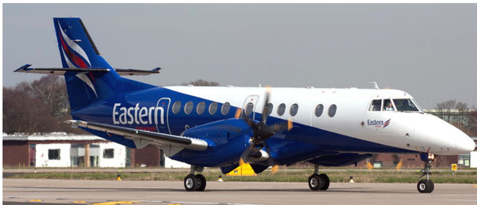
Jetstream 41 G-MAJD carrying out taxiing trials on 14/3 following repairs

EXECUTIVE JETS:- Hawker 800XP CS-DFY (Fraction 902G/112D) from Zurich(1833), n/s to Munich(0753).