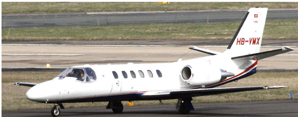
Citation Bravo HB-VMX taxiing onto Multiflight/East apron, 17/3

MILITARY:- Tucano ZF338 (LOP 71) ILS and overshoot(1258), f/t Linton. Tucano ZF144 (LOP 71) ILS and overshoot(1555), f/t Linton, note both used same call-sign.