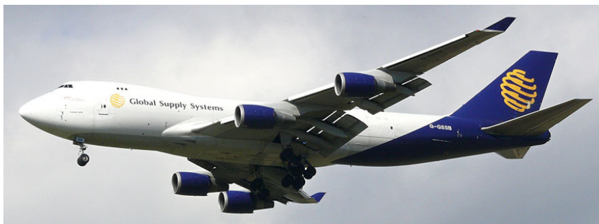
Boeing 747/400 G-GSSB crew training at Doncaster, 19/3(Clive Featherstone)

Deighton(Crab Tree Farm):- Joining the other Gazelles in residence here is HA-LFG SA.341L (1787) noted 26.3 when HA-PPC SE.3130 (1500) and N316DJ SA.315B (2505) were visiting from and to Breighton.