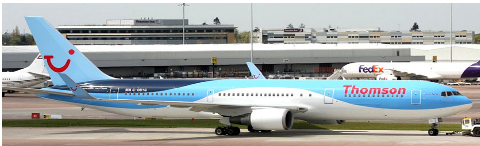
Another airline presenting a new image for 2012, before delivery of it's Boeing 787s. Here 767/300 G-OBYG is the first aircraft to be painted in Thomson's new scheme(TAS)

London City Airport should close according to The Green Party's candidate for London mayor, Jenny Jones. Speaking to the BBC's Daily Politics, she said the airport should be closed and replaced with 'something useful' such as housing or allotments and that Britain should follow Europe by 'expanding' rail travel, not aviation. A spokesman for London City Airport said the hub 'directly contributes over £500 million a year to the UK economy.' The airport, in the Docklands area, connects London with 30 destinations in the UK, Europe and America.