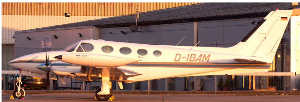
Cessna 340 D-IBAM parked on Multiflight/East following a night-stop, 6/3(Robert Burke)

GENERAL AVIATION:- Having been with Multiflight Engineering since last month Cessna TU.206G G-NIME returned home to its private strip at Saltergate near Whitby at 1510.