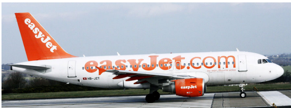
Easy Swiss A.319 HB-JZT was utilised on the Geneva flight on 1/3(Mike Storey)

GENERAL AVIATION:- Hughes 369E G-JIVE f/t Shelf(1000/1020). Cessna 182S G-LVES f/t Gamston(1138/1520), local flight 1259/1420 as "Exam 02".