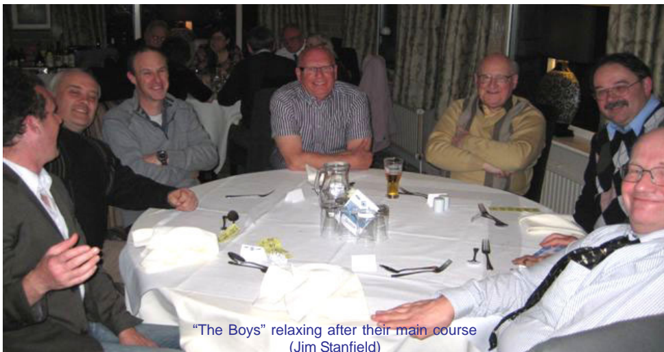
"The Boys" relaxing after their main course

Our next social event, of the eating variety (always popular), is our bi-annual lunchtime "bash" at Billy Murgatroyds on Friday 18 May 2012. Get your name down now if you have not already.