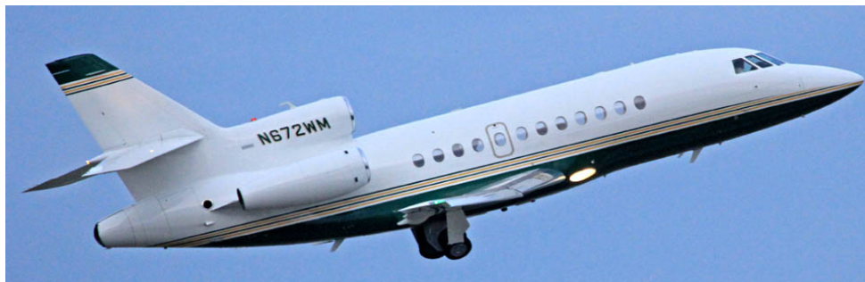
Falcon 900EX N672WM departing runway 14, enroute to Zurich on 6/3(Rod Hudson)

GENERAL AVIATION:- PA-28RT Arrow G-SKYV f/t Ronaldsway(1337/1438). DA-42 OE-FAI (White Knight 02) from Denham(1710) to Gamston(1725).