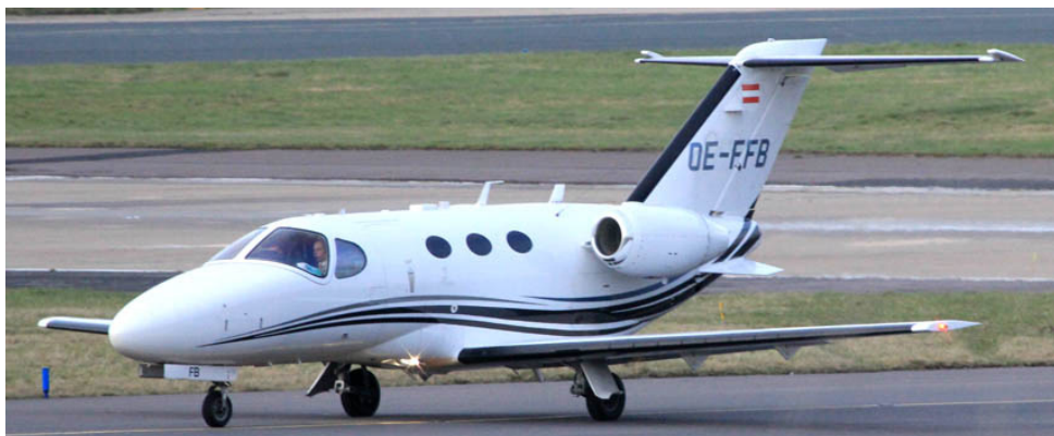
Citation Mustang OE-FFB taxiing onto Multiflight/East Apron on 6/3(Rod Hudson)

EXECUTIVE JETS:- Challenger 300 VP-CPF f/t Luton(1011/1525). Lear Jet 45 N66SG (Bizjet 1SG/2SG/3SG/4SG) from Luton(1124) to Dublin(1231), return 2125/2143. Lear Jet 45 G-HPPY (Manhattan 143) from Palma(1227) to Farnborough(1330). Hawker 800XP CS-DRY (Fraction 5UC/478P) from Birmingham(1354), n/s to London City(1215). Citationjet 2 G-SONE (Clifton 427) from Le Bourget(1712), n/s to Bristol(0930).