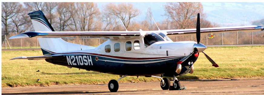
Cessna P.210N Silver Eagle(Turbo-prop conversion) parked at Teesside, 19/3

15/3 G-EDCM Citationjet 2(Saltyre 649), G-SUZN PA-28, G-BNYO Duchess 16/3 XX246 Hawk(Javelin 35, ILS), ZF379 Tucano(LOP 76, ILS) 17/3 XW222 Puma(Vortex 099, TRAINING), G-MFLA HR.200, G-BNOM PA-28 19/3 N288Z Global Express9Bayjet 889), N210SH P.210N, ZF338 Tucano(LOP 76) 20/3 G-CELD 737/300(Channex 300T, also 28/3), G-SACY AT.02, G-LORC PA-28 21/3 G-DCAM Twin Squirrel, G-SKYC T.67M, G-NIME TU.206G, G-TSDS PA-32R Saratoga 22/3 G-SNZY Lear Jet 45(Manhattan 137), G-PACO S.76C, G-XBEL Citation XL(Beauport 821) 23/3 G-LGNF SAAB 340(Loganair 847), G-CEGP King Air 200(Cega 324) 24/3 D-CCAA Lear Jet 35(Ambulance 209), N2445V Cessna 182S, G-OEMA A.300(MON 785P) 26/3 D-CHAT Citationjet 3(n/s), G-MFLB Robin HR.200 30/3 N445QS Gulfstream 450, G-CELC 737/300(Channex 300T), ZF417 Tucano(LOP 70) 31/3 D-EFPC Cessna 172S, N200GK PA-28R Arrow, XZ599 Sea King(SRG 128, training)