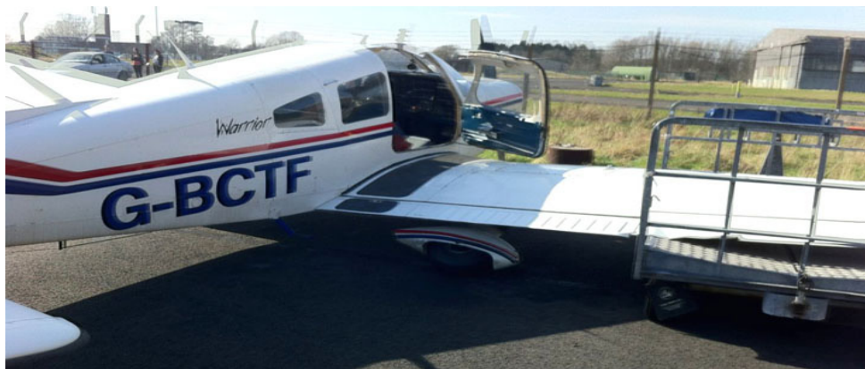
Looking rather dejected, PA-28 G-BCTF pictured at Teesside following its accident on 25/3

STURGATE:- An interesting visitor on 11/3 was Cessna 400 N2992X, this type being Cessna's version of the Lancair Columbia 300. The aircraft routed from Reykjavik via Wick before carrying on the Bournemouth. Noted with EAE on 22.3 were G-AVYT PA-28R f Gamston, G-AZTS F.172L f Humberside, G-BFEV PA-25 f Kirton in Lindsey, G-BVWZ PA-32 f Carlisle, G-CBMO PA-28 f Treswell / Forwood Farm, G-OACI MS.893E f Full Sutton, G-OOLE 172M f Humberside, G-PATN TB.10 f Humberside, G-TSGJ PA-28 f Teeside, plus N136D, N218Y and N226CA as noted in last months notes. Noted visiting on 4.4 was N60208 208B (208B2319) which had arrived on 1.4 and is on delivery to the Far East.