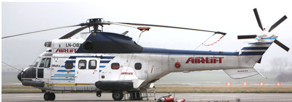
Airlift A/S Super Puma LN-OBX made two visits to Humberside during March(Richard Grimley)

10/3 G-BSXS PA-28, G-AXIE Pup, G-AWBB PA-28 13/3 G-FBKA Citation Mustang(Blink 5E, also 28/3), ZJ242 Bell 412(Shawbury 91, training) 15/3 M-TSRI King Air 90GT(Ambassador 915B), G-FPLD King Air 200(Calibrator 541) 19/3 CS-DRI Hawker 800XP(Fraction 5UE), G-FPLE King Air 200(Calibrator 569) 20/3 N636PG Cirrus SR.22, G-FMAM PA-28 Archer 21/3 CS-DQB Citation XLS(Fraction 348M), ZJ994 Merlin(Vortex 786), ZZ419 Shadow(ILS) 22/3 VP-BLS Pilatus PC-12, G-WATJ King Air 350(Ambassador 222B) 26/3 ZA447 Tornado GR4(Rebel 1, ILS), XZ599 Sea King(SRG 128, training) 27/3 N447EQ Cirrus SR.22, G-FBKC Citation Mustang(Blink 7G) 28/3 HA-YAP YAK 18(Also 29/3), ZE700 BAe.146(Northolt 18, training) 29/3 OY-PHD PA-46T Malibu 30/3 G-SUGA EMB.135 Legacy(from Fort Meyers) 30/3 ZJ992 Merlin(Rafair 7175)