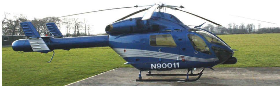
Smart MD.902 Explorer N90011 visited Coney Park twice on 1/3(Mike Storey)

1/3 G-BVLG Twin Squirrel 1140 1320 "Powerline 68" f/t Sherburn 12/3 G-NETR Twin Squirrel 1530 1600 "Osprey 62" f/t Doncaster 21/3 G-EVIP Agusta A.109E 1710 0810 "Castle 5" from Halifax, n/s to York 22/3 G-HDTV Agusta A.109E 1306 1345 "Castle 2" from Halfpenny Green to York 27/3 G-WIWI Sikorsky S.76C 1720 1735 from Rochester to Stansted 30/3 G-DSPZ R.44 1300 1400 f/t Woodford