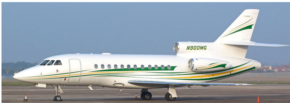
Ohio based Falcon 900EX N900MG parked on the apron at Doncaster, 15/3(Clive Featherstone)

DONCASTER/MOUNT PLEASANT HOTEL:- Noted visiting on 17/3 was Eurocopter EC.120B G-HEHE, owned by the HE Group and based at Rochester.