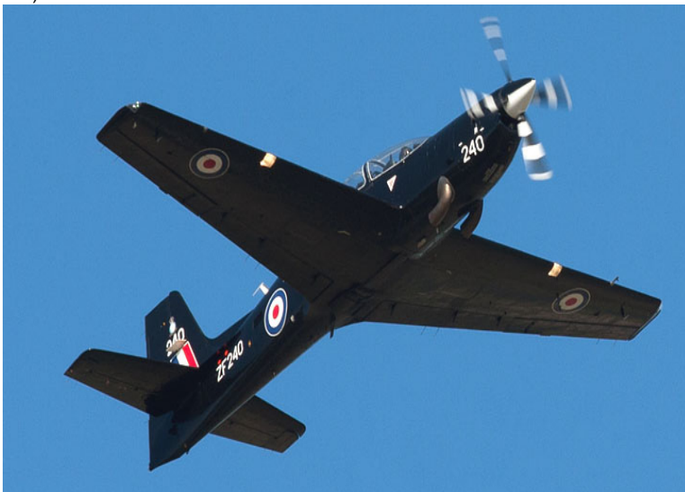
Tucano ZF240 overshooting following and ILS approach to 14, 8/3(Robert Burke)

IT FLIGHTS:- A.320 G-KKAZ (Kestrel 53DS/15RF) t/f Enfidha(0610/1333), "Kestrel 74CV" to Tenerife(1506).