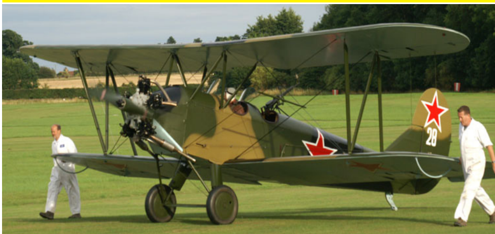
Polikarpov PO-2 G-BSSY, Shuttleworth Trust/Biggleswade, 2011 Air Show(Ken Cothliff)