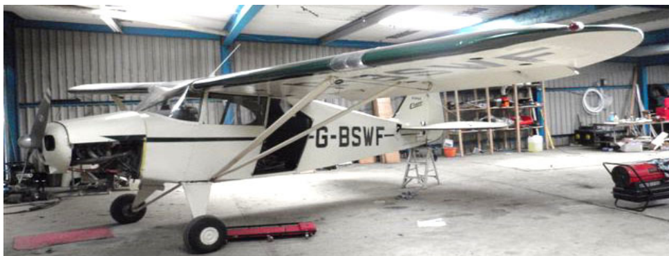
Pictured at its base, Chester-le-Street is PA-16 Clipper G-BSWF(David Thompson)