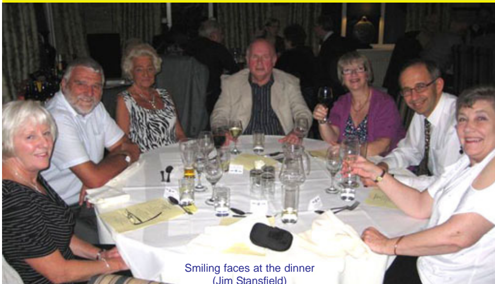
Smiling faces at the dinner

Those of you who were there will know what a good do it was. The numbers attending were up and the Chairman declared it was the best he had been to - praise indeed. It was good to see so many new faces mingling with the regulars. The increased choice to five per course proved popular, but gave some even more problems of what to choose! I know someone who has already reserved places for the 2013 dinner, so don't delay if you want to be certain of being there next year.