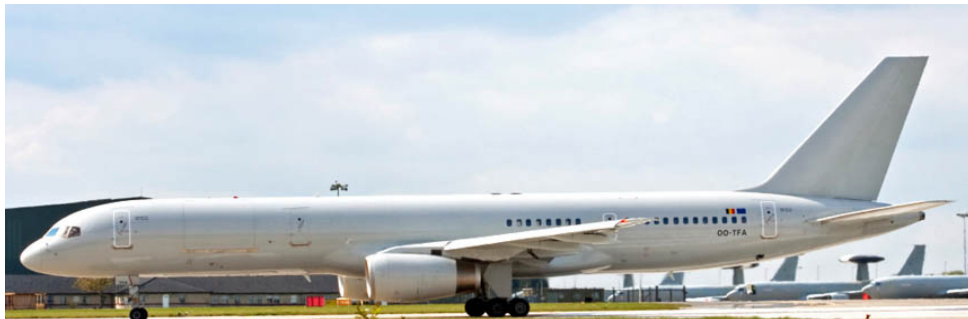
TNT have leased Boeing 757 OO-TFA to NATO and the aircraft is expected to be a regular visitor to Waddington, where it is

WOMBLETON:- G-BWXB, G-BWXD, G-BWXE, G-BWXJ, G-BWXM, G-BWXR, BWXT, G-BWXY and G-BWXZ all T.67M's have arrived with Swift ex. storage at Leicester. G-BWXM has subsequently been cancelled as sold in Sweden 13.3.