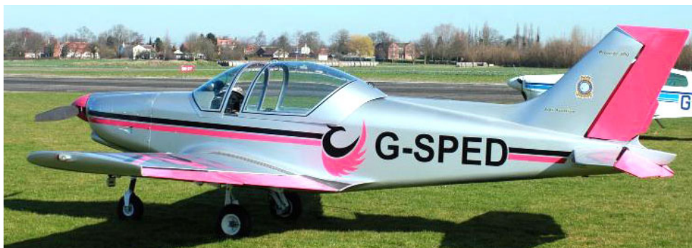
Based at Hollym, Pioneer 300 G-SPED was a visitor to Sturgate on 21/3(Alan/dsaf)

SHERBURN:- A visit mid afternoon on 26.3 noted G-BAEO F.172M and G-BSLT PA-28 (minus engine) from the Les Scattergood Fleet tied down along the fence line with G-FLKY 172S from Eddsfeld covered and tied down probably in for maintenance with Sherburn Engineering. Of interest in the main hangar were new residents G-ALUC/R5219 DH.82A and G-BWEU F.152 ex. Sandtoft, whilst in the corner was the dismantled wreckage of G-BODC PA-28. Visiting between 14.25 and 15.40hrs. were G-AKSY/TJ534 Auster 5 f&t Brighton, G-AZCP B.121 f&t Bagby, G-BCPN AA-5 f&t Gamston, G-BOWP D.120A f&t South Cave / Mount Airey, G-BTHE 150L f Brighton t Beverley, G-CBEI PA-22 f&t Brighton, G-FUZZ/51-15319 PA-18-95 f&t Gypsy Wood, G-IJOE PA-28RT f&t Sturgate and G-RVDJ RV.6 f&t Cliffe. The PPRuNe Group had their Spring UK Private Flying Bash here on 31.3 although the