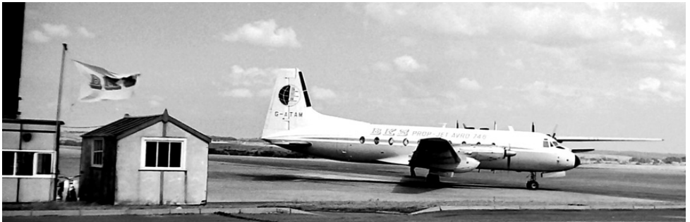
H.S.748 G-ATAM of BKS Air Transport parked on Stand 4 on the old apron