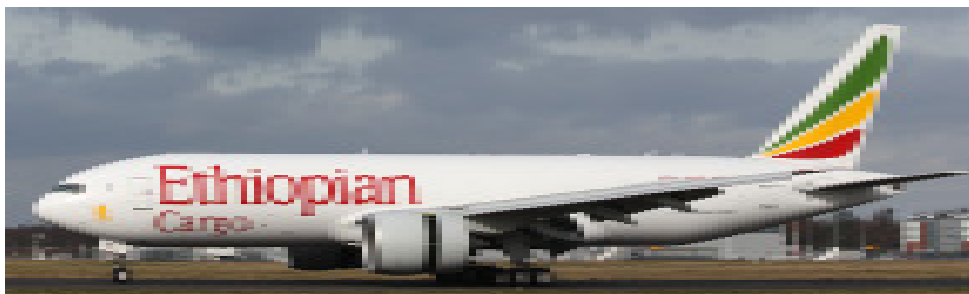
Ethiopian Cargo Boeing 777F ET-APS arriving from Nairobi on 6/3 with a cargo of tea