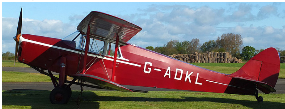
Ipswich based Hornet Moth G-ADKL visited Brighton for the Vintage Fly-in on 4/5