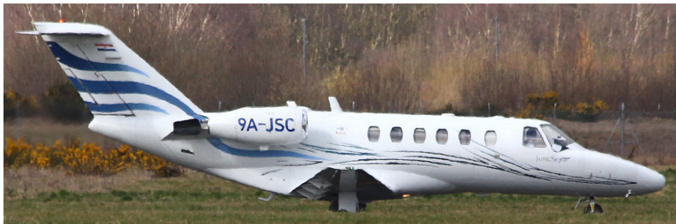
Citationjet 2 9A-JSC of Jung Sky Executive visited the Cessna Service Centre, 24/3