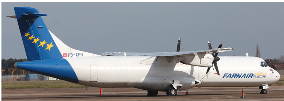
Farnair ATR-42 HB-AFN basking in the sun awaiting its cargo on 6/3