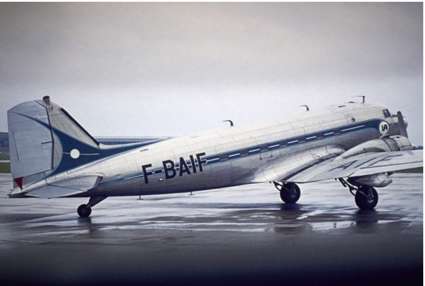
DC-3 F-BALF arrived on 4/14/73, believed to have been transporting a dolphin to a zoo.