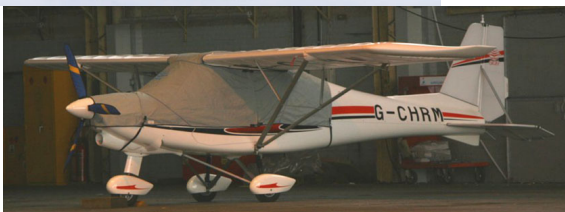
Ikarus C42 Bravo G-CHRM is a new resident