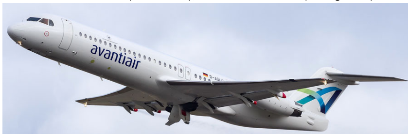
Fokker 100 D-AOLG of Avantiair brought in the German under 21 football team, 15/3