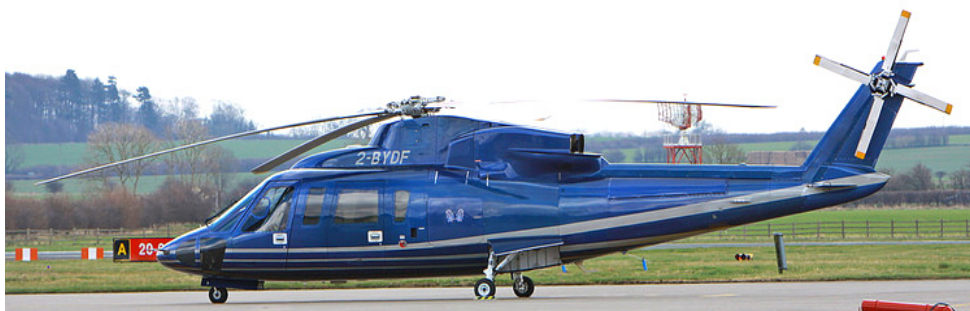
Guernsey registered S.76B 2-BYDF(ex G-BYDF) was noted on 24/3