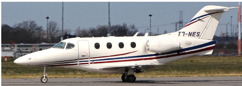
San Marino registered Premier 1 T7-NES(ex HB-VOS) arrived on 27/3