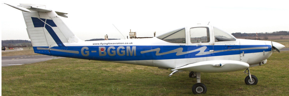
PA-38 G-BGGM arrived early in the month and is believed to be a new resident