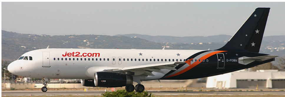
Jet2 has leased Airbus A320 G-POWM from Titan Airways for the summer season The aircraft operates flights out of Glasgow