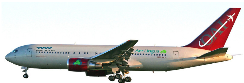
Aer Lingus has leased Boeing 767 N225AX from Omni International to operate transatlantic services

The fund has a total of GBP56 million (USD79 million) available to cover three years of financial support for each route's initial start-up phase. GBP17.5 million (USD26.25 million) has been made available to bids for 2015/16 with around GBP20 million (USD30 million) available for each of the remaining years. Thus far, it has already supported strategic routes from Dundee and Newquay into London. The Department says it is considering each proposal in line with European Commission (EC) requirements with an announcement on which has made it through the first round of scrutinization to be made in early May. Those routes selected will then move forward to the strategic and economic appraisal stage, following which successful bids will be announced in July.