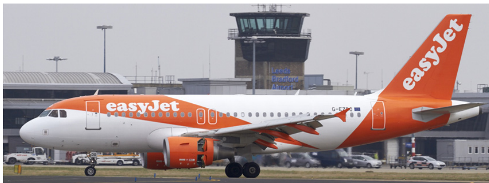
A.319 G-EZDO of EasyJet in new company colours, from Geveva, 20/3

Southampton/Aberdeen (7006, "7006/92UA"):-1/3 G-ECOM, 2/3 G-FLBA, 3/3 G-JECR, 4/3 G-FLBA, 5/3 G-ECOA, 6/3 G-FLBA, 8/3 G-ECOA, 9/3 G-JECN, 10/3 G-ECOA, 11/3 G-ECOR, 12/3 G-ECOG, 13/3 G-JECM, 15/3 G-ECOA, 16/3 G-JECH, 17/3 G-ECOE, 18/3 G-ECOE, 19/3 G-ECOH, 20/3 G-ECOO, 22/3 G-ECOE, 23/3 G-ECOE, 24/3 G-JECO, 25/3 G-ECOE, 26/3 G-JECY, 27/3 G-ECOG, 29/3 G-JECO, 30/3 G-ECOE, 31/3 G-JECI.