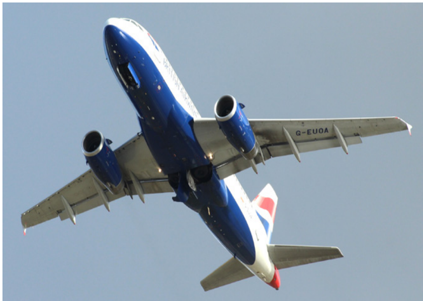
British Airways A.319 G-EUOA departing for Heathrow, 25/3

Heathrow (1346/1347, "20D/21V") -1/3 G-EUPB, 2/3 G-EUOG, 3/3 G-EUPJ, 4/3 G-EUPB, 5/3 G-EUOA, 6/3 G-EUOI, 7/3 G-EUPW, 8/3 G-EUPB, 9/3 G-EUPF, 10/3 G-EUPR, 11/3 G-EUPP, 12/3 G-EUPX, 13/3 G-EUPT, 14/3 G-EUPX, 15/3 G-EUPW, 16/3 G-EUPW, 17/3 G-EUPJ, 18/3 G-EUPH, 19/3 G-EUPW, 20/3 G-EUOE, 21/3 G-EUPA, 22/3 G-EUPD, 23/3 G-EUPU, 24/3 G-EUPO, 25/3 G-EUOI, 26/3 G-EUPB, 27/3 G-EUOE, 28/3 G-EUPX.