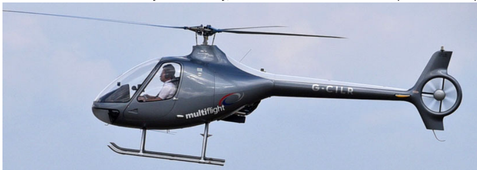
Resident Cabri G2 G-CILR now carries Multiflight titles(Rod Hudson)