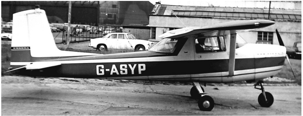
Cessna 150 G-ASYP operated by the Yorkshire Aeroplane Club