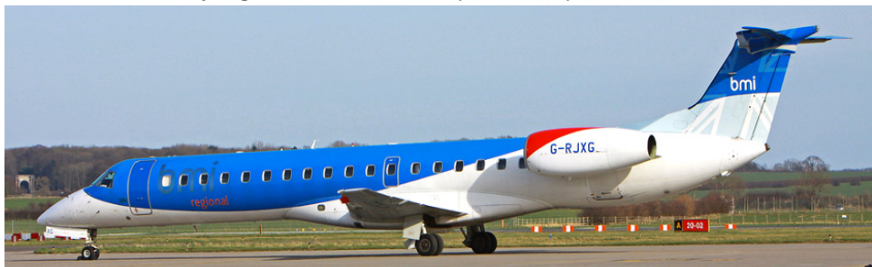
bmi Embraer 145 G-RJXG arrived on 21/3, bringing Chelsea FC to play Hull City