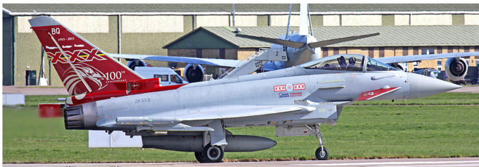
Typhoon ZK353 of 29Sqn with special tail markings, Coningsby, 20/4(Rich Grimley)

GAMSTON (Notts.) G-AXAN/EM720 DH.82A arrived on 27.2 following rebuild at Doncaster, is now registered to Tiger Leasing who are based here. A new resident is G-REYE R.44.