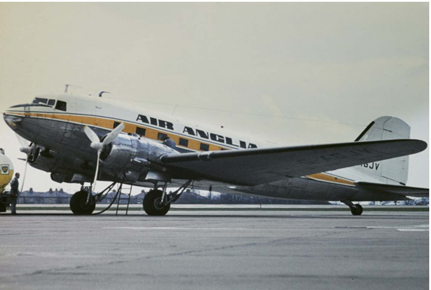
DC-3 G-AGJV of Air Anglia being refueled on stand 4 in 1973(David Blaker)