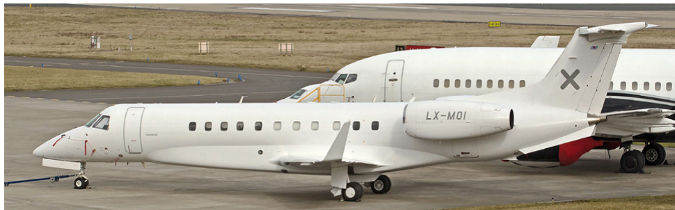
Legacy LX-MOI of Lux Aviation, parked on Multiflight/East(Stewart Robershaw)

Citation Mustang G-LEAB (Lonex 05AB) f/t Luton(0744/1637). Cessna 210M G-TOTN f/t Ronaldsway(0919/1858) n/s. Agusta A.109S G-MAOL arrived at 0955 for a refuel, departing to Newcastle Heliport at 1515. Citation XL G-OJER (Beauport 871) from Jersey(1056) to Luton(1203).