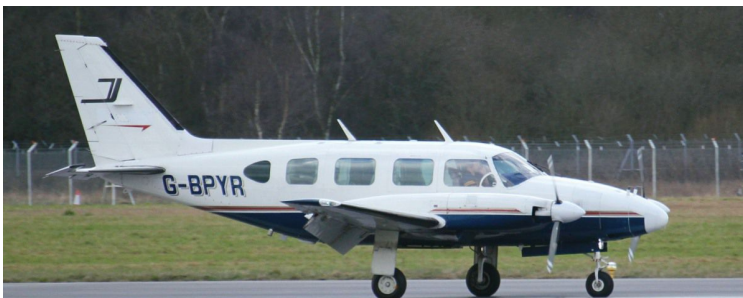
G-BPYR Piper PA-31 Navajo 2 Excel Aviation 06/03