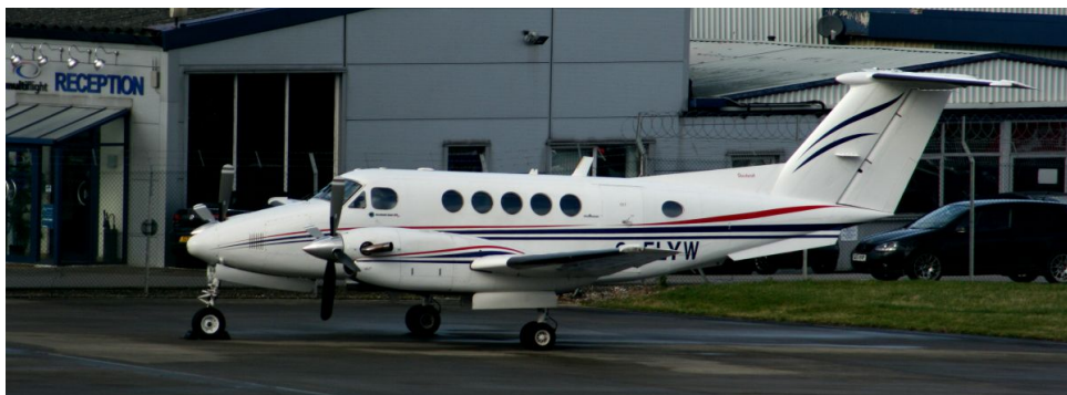
G-FLYW Beech 200 Kingair 01/03 Ian Gratton

Bell 429 G-HPIN f/t Newcastle (06:45/06:56), Beech 200 Kingair G-FLYW arr 08:23 from Glasgow returning at 17:38, Aerospatiale AS355N G-CMRA dep 10:01 to Teesside, Challenger CL604 N900UC arr 10:10 from Luton dep 13:11 to Copenhagen, Piper Pa-34 Seneca OY-PPS (csn 3433021) arr 11:54 from Billund returning at 17:25, Robinson R44 Raven G-DWCE arr 17:14 from Sherburn n/s, Piaggio P.180 Avanti M-ONTE arr 17:46 From Basle-Mulhouse dep 18:12 to Glasgow, Cirrus Sr22 N89NB arr 19:33 from Denham until 9th.