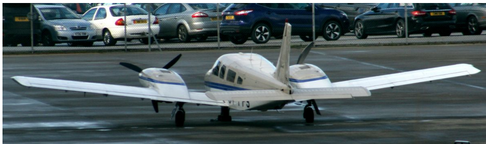
OY-PPX PA-34 Seneca 01/03 Ian Gratton