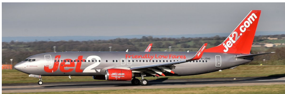
G-JZHO Boeing 737-8MG Jet2.com 25/03 Rod Hudson