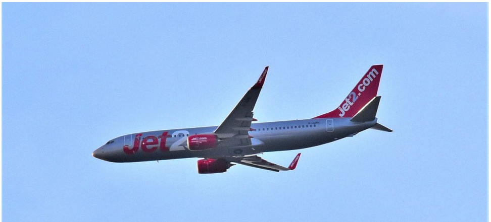
G-JZHX Boeing 737-8MG Jet2.com over Birstall 26/03 Rod Hudson