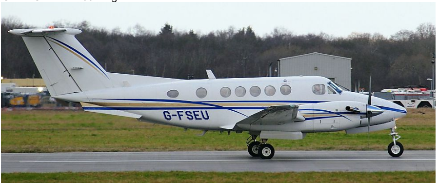
G-FSEU Beech 200 King Air 2 Excel Aviation 06/03

1st G-OUCP Piper PA-31 2 Excel Aviation 1st G-BEZL Piper PA-31 2 Excel Aviation 1st G-BFIB Piper PA-31 2 Excel Aviation 1st OE-GKW I.A.I. Gulfstream 100 Astra Tyrol Air Ambulance (FV) 2nd G-CIFE Beech 200 King Air 2 Excel Aviation Dep. 6th (FV) 3rd D-INCS CitationJet 525 CJ1 Bizair Flug 3rd G-OLIV Beech 200 King Air Dragonfly Aviation Services Ltd (FV) 5th M-INTY Gulfstream G280 Ineos Aviation (FV) 6th N350KF Beech 350 King Air Beechcraft Corp. Dep (M) 6th G-FSEU Beech 200 King Air 2 Excel Aviation