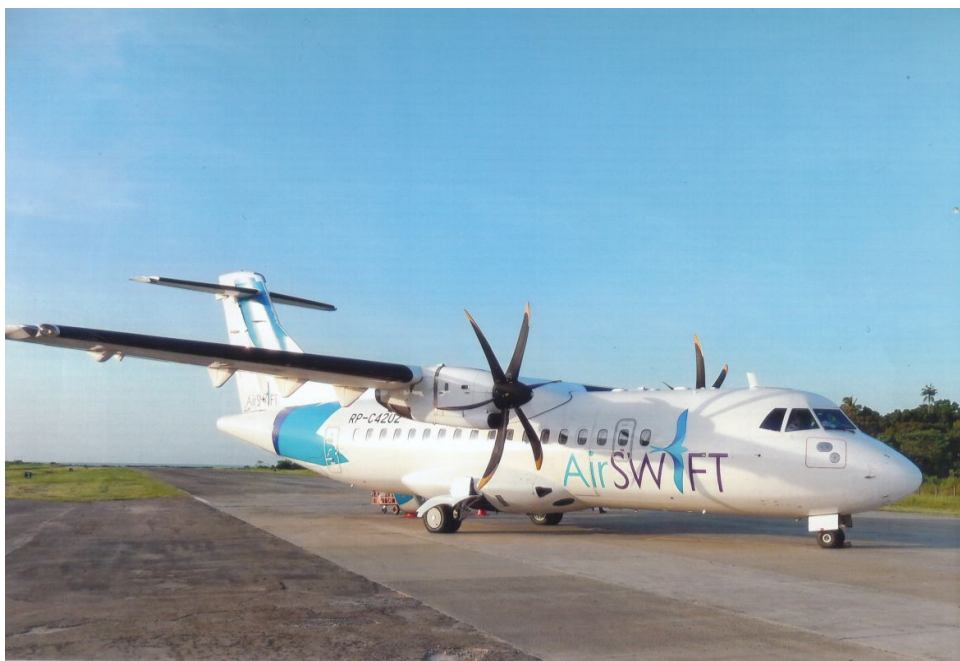
RP-C4202 ATR42-600 Air Swift Palawan Island Philippines 19/12/16