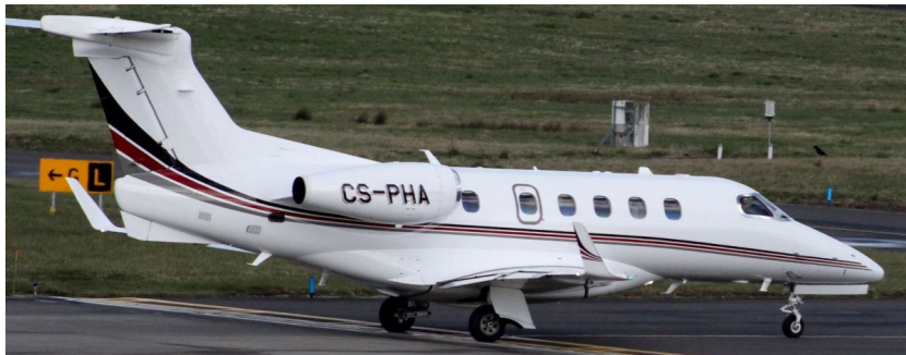
CS-PHA Phenom 300 06/03 Rod Hudson