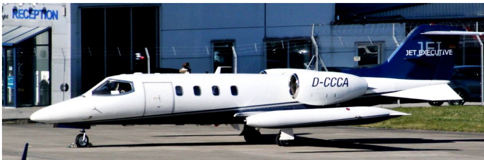
D-CCCA Learjet 35A 09/03 Rod Hudson

Cessna 525A CJ2 D-ISJP dep 08:40 to Leon return at 17:31, Learjet 35 D-CCCA arr 12:51 from Dubrovnik dep 15:53 to Munich, Cabri G2 G-CHAG to/fromf Leeds East at 13:30 & 14:28, Cessna 206H C-GGWL (csn 8911) arr 15:47 from Reykjavik, Cirrus Sr22 N89NB dep 16:50 to Denham, Beech 200 Kingair G-FSEU arr 17:18 from Dublin n/s, Cessna 560 Excel CS-DXW arr 18:18 from London City as NJE597D n/s, Global 6000 9H-VJS arr 21:31 from Antigua as Vistajet 929,