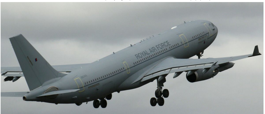
ZZ333/G-VYGD Airbus A330 MRTT (Voyager) Airtanker 06/03

1st ZA548 Tornado (T) 2nd 099 Embraer 121 Xingu French Air Force 3rd ZE708 BAe-146-200 6th ZZ333/G-VYGD Airbus A-330 MRTT (Voyager) R.A.F. Airtanker Ltd (T) (FV)