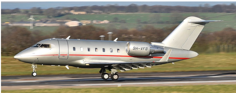
9H-VFB Challenger CL605 25/03 Rod Hudson