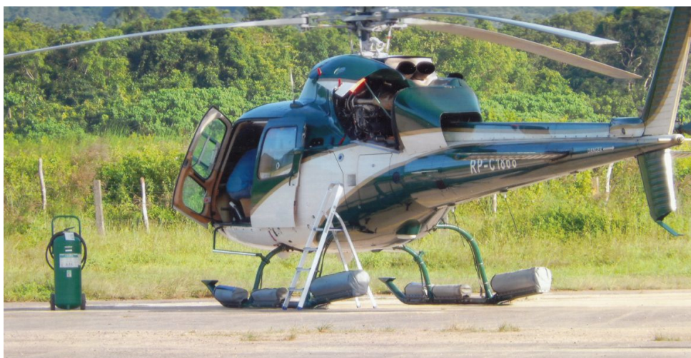
RF=C1888 AS 355 Ecureuil Palaan Island Philippines 19/12/16