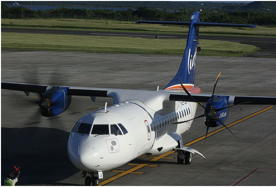
V2-LIG ATR42 LIAT