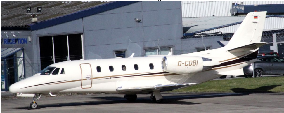
D-COBI Citation 560XL 06/03 Rod Hudson

Cessna 560 Excel N183XL (csn 6183) arr 07:49 from Doncaster dep 08:27 to Nice, Cessna 510 Mustang OE-FHK dep 08:04 to Newquay, Cessna 560 Excel D-COBI arr 08:39 from Neurenburg dep 14:38 to Baden-Baden, Cabri G2 G-CHAG arr 10:10 from Newcastle n/s, Phenom 300 CS-PHA dep 10:53 to London City as NJE894D, Piper Pa-23 Aztec G-CALL f/t IOM (12:47/13:52), Hawker 4000 LX-LOE arr 17:31 from Brussels n/s, Cirrus SR20 N203CD dep 17:37 to Liverpool. Diamond DA-62 G-GBAS arr 17:41 from Prestwick n/s, Cessna 510 Mustang OE-FHK arr 18:00 from Bournemouth n/s.