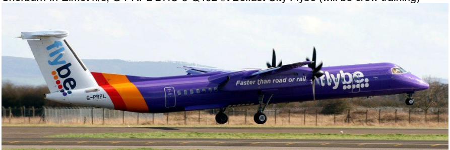
G-PRPL DHC8-Q402 20/03