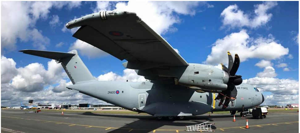
ZM400 A400M Atlas C1 RAF 31/03 Robert Burke

Cessna 680 Sovereign OK-EMA dep 07:17 to Girona, Airbus A400M Atlas ZM400 arr 10:51 from Brize Norton return at 14:01 as Ascot 480, Cirrus SR22 N89NB arr 11:42 from Denham, Agusta A109S G-FRZN arr 13:52 dep 14:31, Robinson R22 G-HANC arr 15:59 from Teesside.