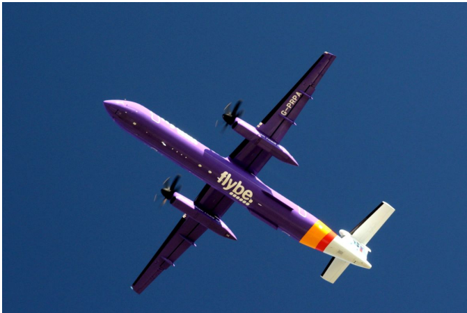
G-PRPA Dash 8 - Q400 09/03 Rod Hudson

Additional flights:-25/3 G-JECJ(731A) arrived from Manchester.