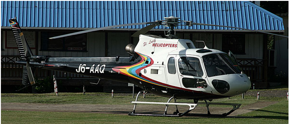
J6-AAQ AS350 St Lucia Heli 10/12/16

After 2 further days relaxing on the perfect white sand beaches and swimming in the turquoise blue sea while sipping cold beer and strong rum punches, it was back to the airport for our flight home. Logged on arrival and departure at St. Johns Antigua were American A/Ls N804NN, N908NN,