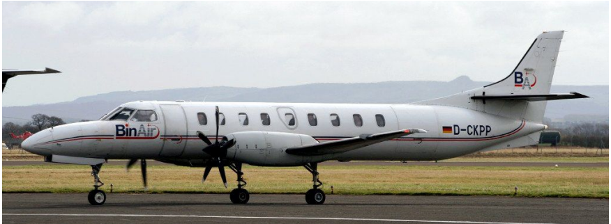
D-CKPP SA-227DC Metro 23 17/03