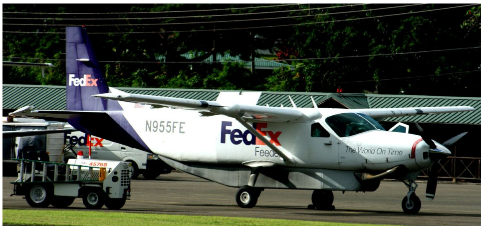
N955FE Cessna 206 FedEx 07/12/16

Logged during the week were LIAT V2-LIB,V2-LIC, V2-LID,V2-LIF,V2-LIG, V2-LIH,V2-LIK,V2-LIM, FedEx/Mountain Air Cargo Cessna 206 N721FX, N955FE, N881FE, King Air N873AF, Caribbean A/Ls ATR 9Y-TTD,9Y-TTE, St. Lucia Helicopters J6-AAH, J6-AAQ, J6-AAR, BN-2 islander J8-UVF, Air Antillas ATR F-OIXE,F-OIXH,YV-2762 Beech 1900,N8369L Cessna172,