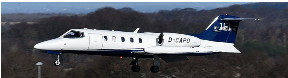
D-CAPO Learjet 35 25/03 Rod Hudson