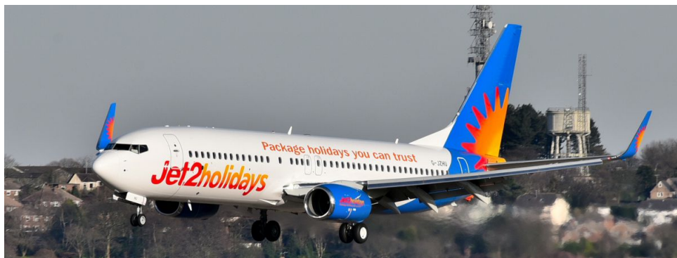
G-JZHU Boeing 737-8MG Jet2Holidays 25/03 Rod Hudson