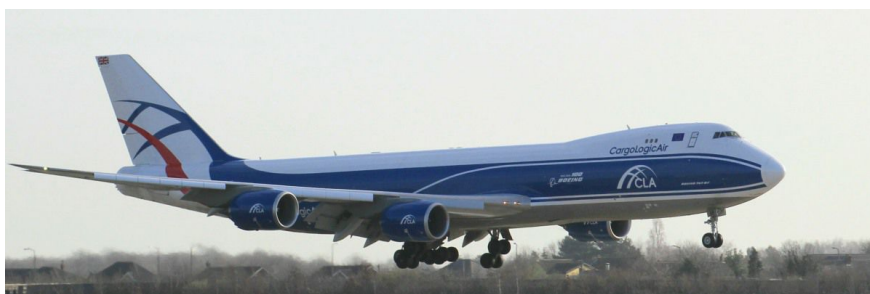
G-CLAB Boeing 747-800 Cargo Logic Air 15/03

1st UR-82073 Antonov AN-124 Antonov Design Bureau (F) Dep.2nd 1st N475MC 747-400 Atlas Air (F) (FV) 1st G-EZEN Airbus A-319 EasyJet (T) 2nd G-JECE Dash 8D Flybe (T) 3rd G-CIYX Embraer 145 Eastern Airways. Approach on an airtest flight from HUY (FV) 5th HA-LXM Airbus A-321 Wizz Air (FV) 6th G-RJXB Embraer 145 bmi regional Dep 7th 7th G-CELG Boeing 737-300 Jet2 (T) 8th G-EZBW Airbus A-319 EasyJet (T) 11th G-JECR Dash 8D Flybe (T) 12th HA-LXK Airbus A-321 Wizz Air (FV) 14th HA-LXI Airbus A-321 Wizz Air (FV) 15th G-CLAB Boeing 747-800 CargoLogicAir (F) (FV) and the first 800 series