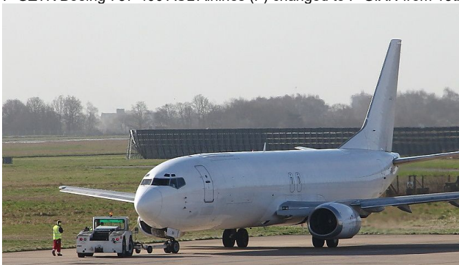
F-GIXN Boeing 737-400 ASL Airlines 01/03

1st F-GZTK Boeing 737-400 ASL Airlines (F) changed to F-GIXN from 13th to the month-end.