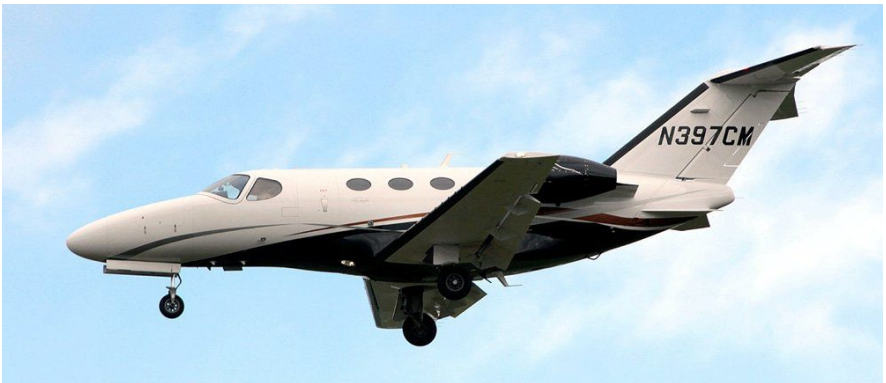
N397CM Citation 510 Mustang 19/03