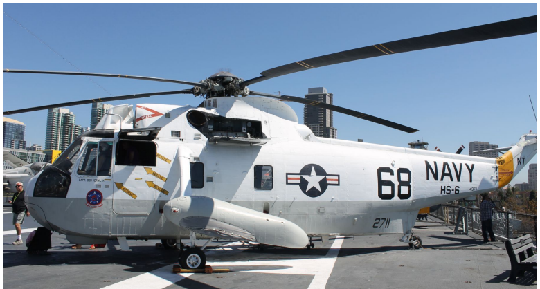
SH-3 Sea King