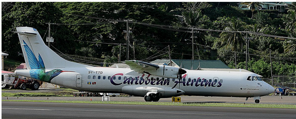
9Y-TTD ATR72 Caribbean Airways 05/12/16

Our transfer to St. James Club took just five minutes. The hotel is excellent for aircraft spotting being just five minutes by road from the airport. All arrivals at Castries Airport are from the sea, irrespective of the wind. The reason for this is a large hill at the far from the end of the runway. Most departures are towards 'the hill' so immediately after take off all aircraft make a sharp left turn which takes them over our hotel.