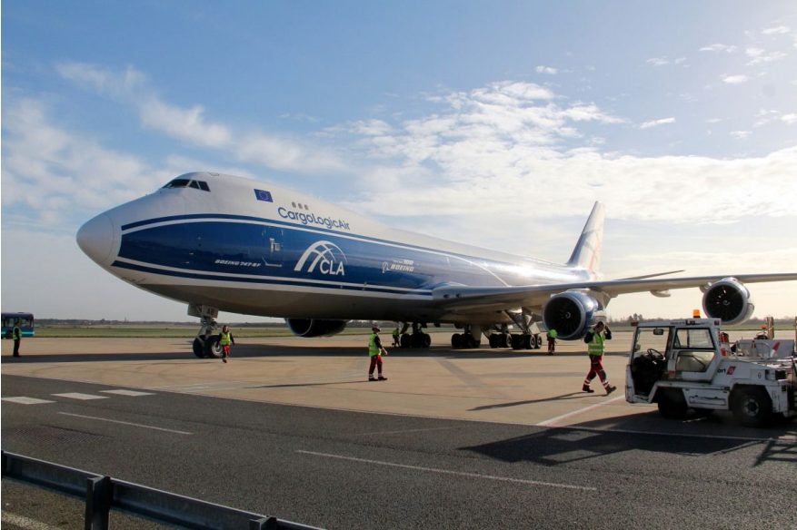
G-CLAB Cargo Logic Air Boeing 747-800

(FV) First Visit. (T) Training. (H) Helicopter. (F) Freighter. (M) Maintenance.