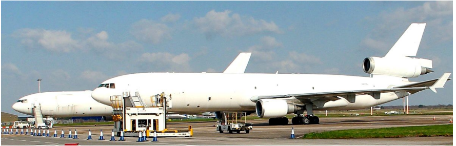
N411SN/N513SN MD-11 WGA 23/03

28th ER-JAI Boeing 747-400 Aerotrans Cargo. Dep 29th 29th G-POWK Airbus A-320 Titan Airways (T) 29th G-BYAW Boeing 757 Thomson