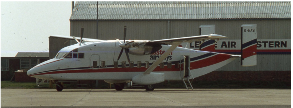
G-EASI Shorts 330-100 Humberside 1982