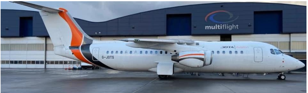
G-GOTS BAE146 Jota Aviation 12/03

Other flights:-12/3 G-JOTS(Av146 RJ85) operated charter in from Farnborough then positioned out to Manchester (252/288P), 13/3 G-JOTS(253P/253) positioned in from Luton, then operated charter to Farnborough.