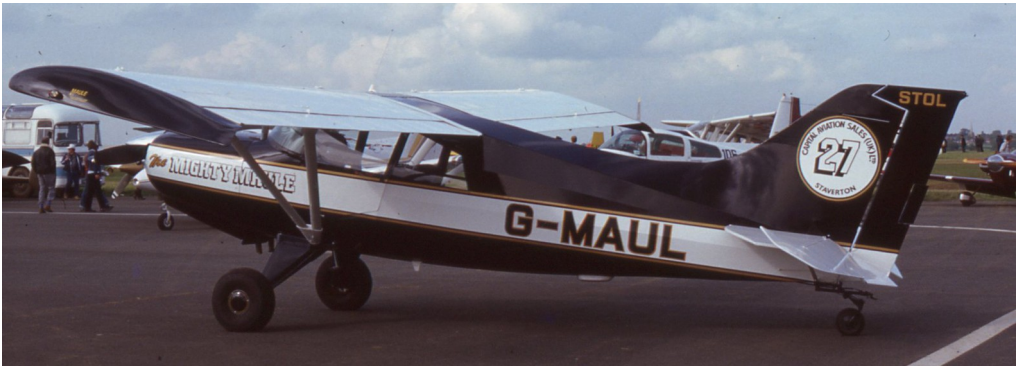
G-MAUL Maule M-5-235C Lunar Rocket PFA Rally Leicester East 05/07/1980