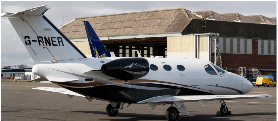
G-RNER Ce510 Citation Mustang 09/03

08/03 XE688 Hawker Hunter T72 f Leeming o/s *2 Hawker Hunter Aviation