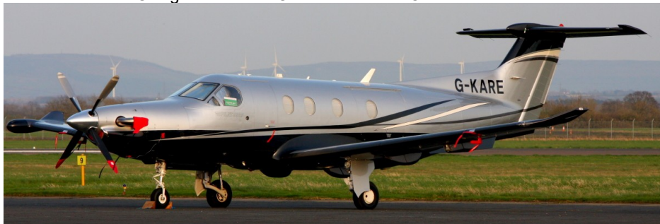
G-KARE Pilatus PC-12 30/03

30/03 G-KARE Pilatus PC-12 f Fair Oaks n/s Flexifly Aircraft Hire, 2-COOK Piper PA-46TP Malibu Meridian f Glasgow t Retford Gamston William Cook Aviation