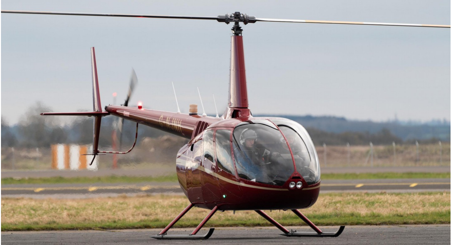
G-NJNH Robinson R66 09/03

09/03 G-KION Ce525 CitationJet arrived 07/03 t Waraw Chopin Bookajet, G-RNER Ce510 Citation Mustang f/t Retford Gamston, G-NJNH Robinson R66 f Newcastle t Leeds East Hawesbates LLP, G-FFMV Diamond DA42 Twin Star f Bournemouth t/f Local Flight n/s Draken Europe