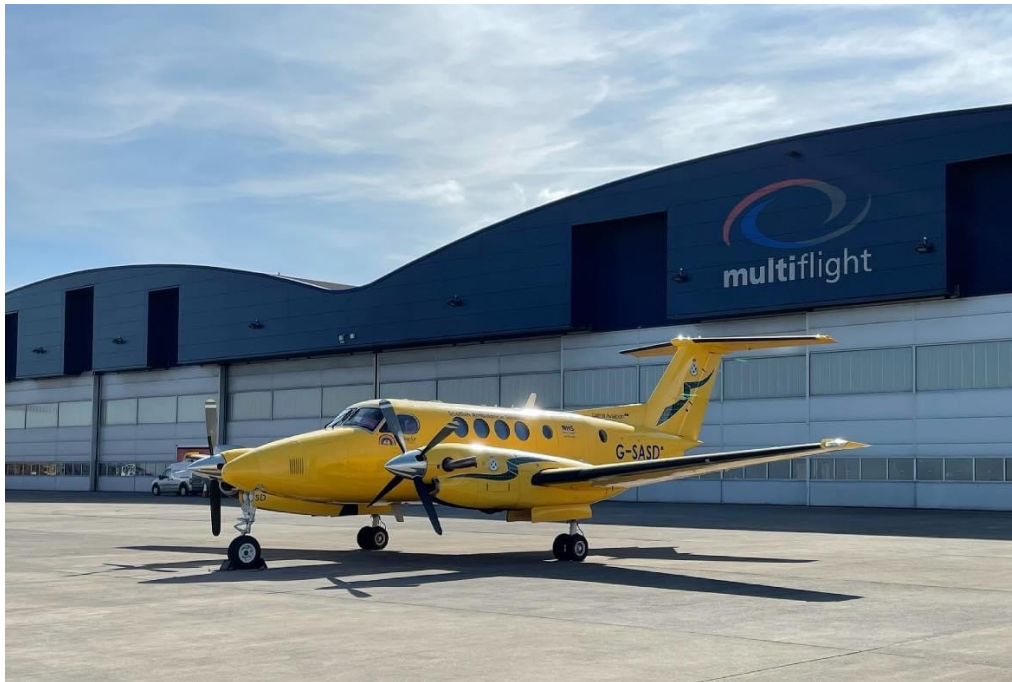
G-SASD King Air Gama Aviation

Diamond DA42 TwinStar G-FFMV dep 10:56 to RAF Leuchars, Beech 200C Super Kingair G-SASD f/t Glasgow (11:44/14:11) , Cessna 172S Skyhawk N688CS dep 14:38 to Gamston, Cirrus Sr20 N203CD dep 16:41 to Liverpool,