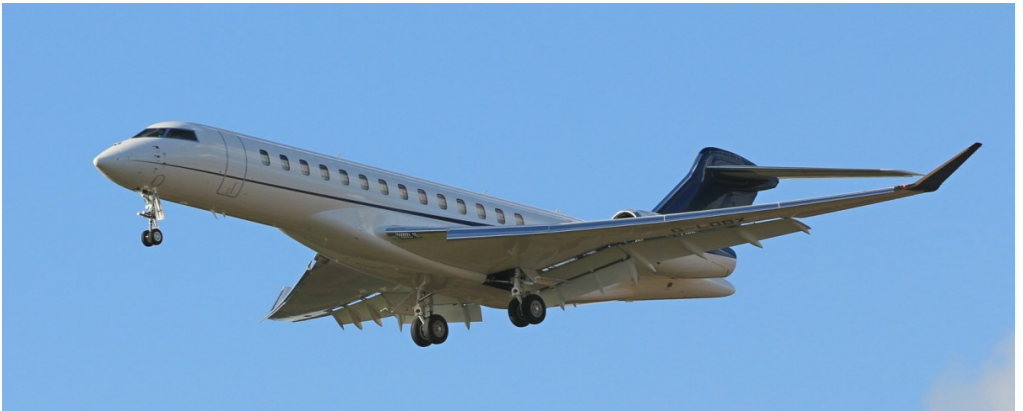
G-LOBX Global Express Global 7500 27/03