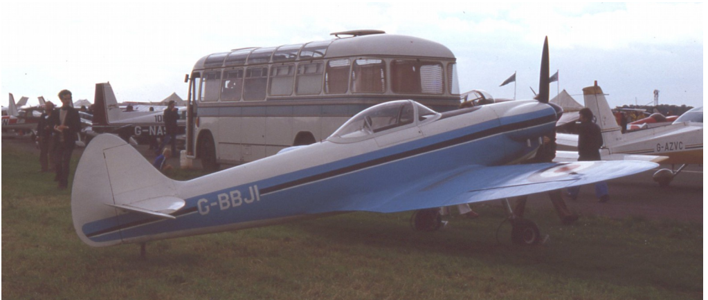
G-BBJI Isaacs Spitfire PFA Rally Leicester East 05/07/1980