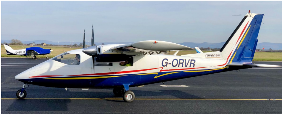
G-ORVR Partenavia P68B Victor 22/03

24/03 G-CGNE Robinson R44 n/s t Leeds East Heli Air, N288Z Gulfstream G650 n/s t Paris Le Bourget Solairus Aviation, G-CKVZ Rotorsport Cavalon Pro f ortijk/Weveldigem t Inverness, G-ORVR Partenavia P68B Victor f Aberdeen n/s Ravenair, G-OBSR Partenavia P68 Observer f Aberdeen n/s Ravenair