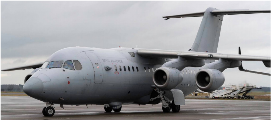
ZE708 BAe 146-200QC C3 04/03

04/03 ZE708 BAe 146-200QC C3 f/t Northolt RAF - 32 Sqdn, 2-COOK Piper PA-46 Malibu Meridian f Lausanne t Gamston William Cook Aviation, OK-NTU Nextant 400XT f Nice t Prague Time Air