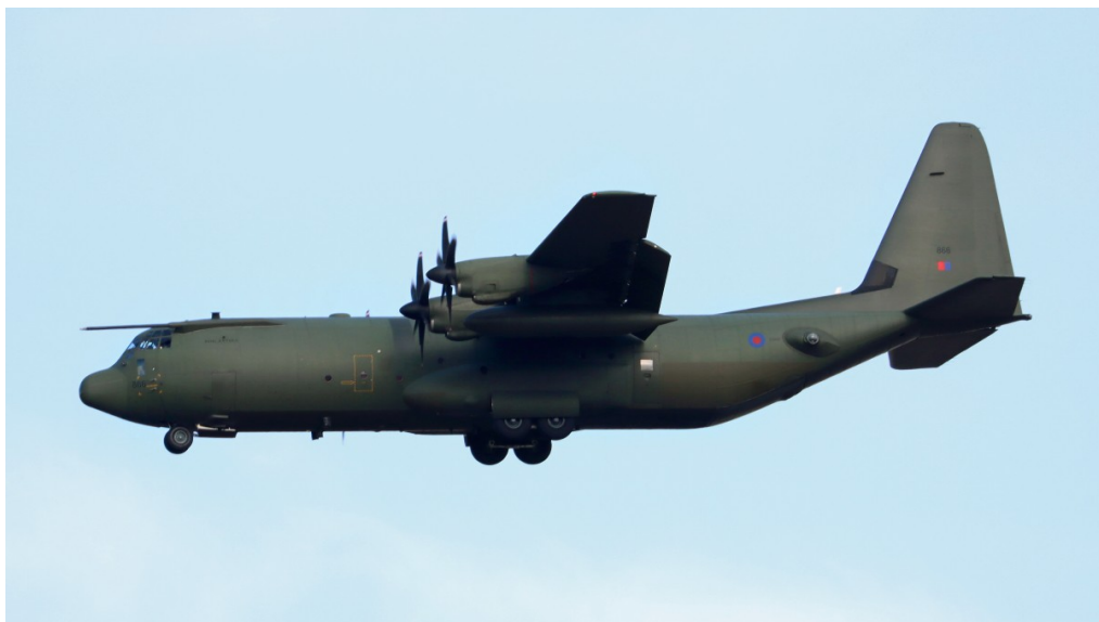
ZH866 Hercules RAF 13/03 Paul Whincup

AVRO 146-RJ100 G-JOTS arr back at 14:31 fr Luton dep 16:13 to Farnborough, Lockheed C130J Hercules ZH866 ILS approach at 14:20 f/t Brize Norton c/s OMEN2