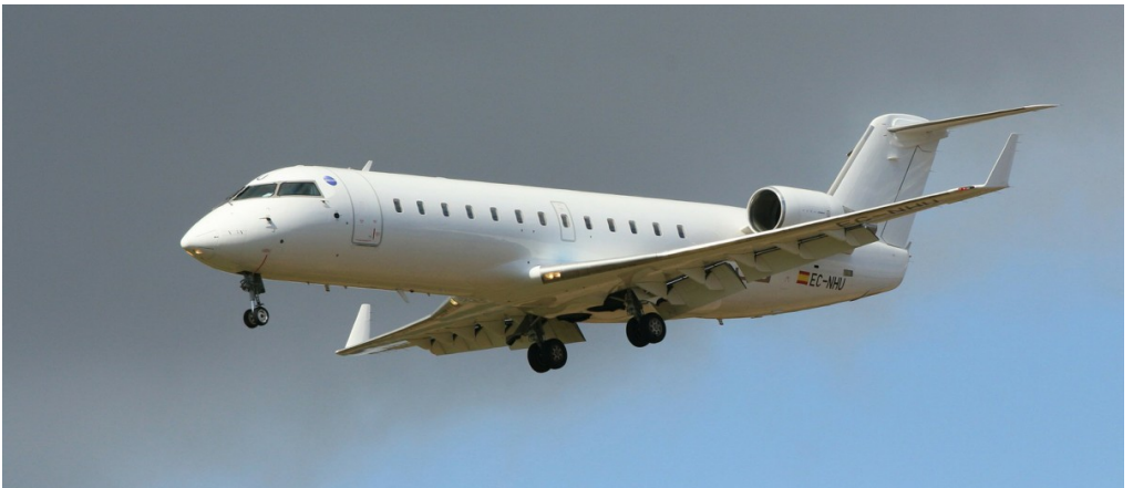
EC-NHU Canadair Regional Jet 200 Air Nostrum 27/03