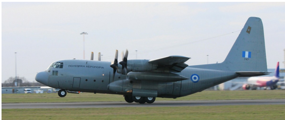
747 C-130 Hercules Hellenic Air Force 09/03