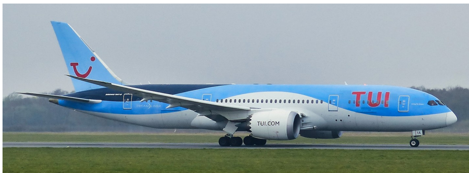
G-TUIA Boeing 787-800 Dreamliner. 27/03