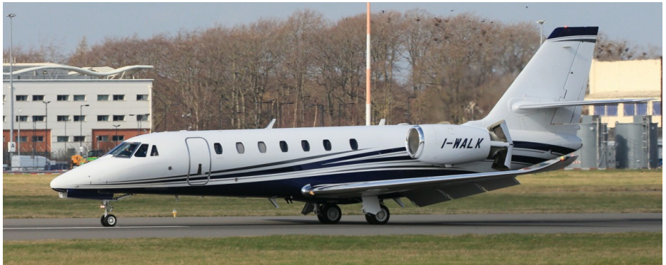
I-WALK Cessna 680 Citation Sovereign 10/03