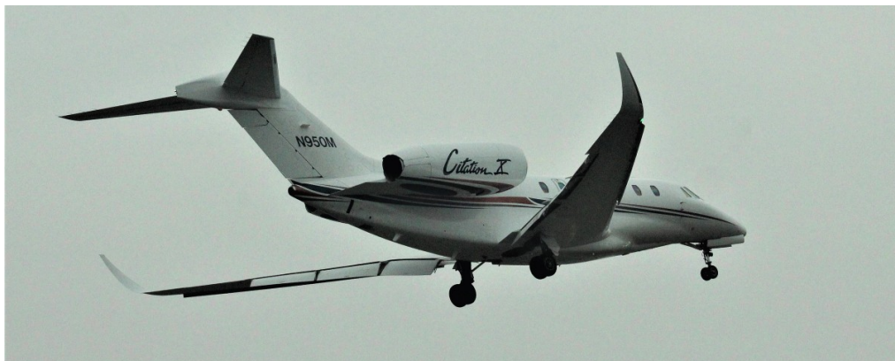
N950M Cessna 750 Citation X 03/03 Mike Storey

Cessna 560 Excel D-CECH arr 07:39 dep 09:15, Beechjet 400 OK-BII arr 10:25 dep 11:58, Cessna 750 Citation X N950M arr 10:32 dep 17:04, Cessna 206 Turbo Stationair G-NIME dep 13:38, Cessna 525A D-IWPS arr 17:07 dep 17:24, Learjet 45 G-FEMC arr 18:12 dep 18:52,