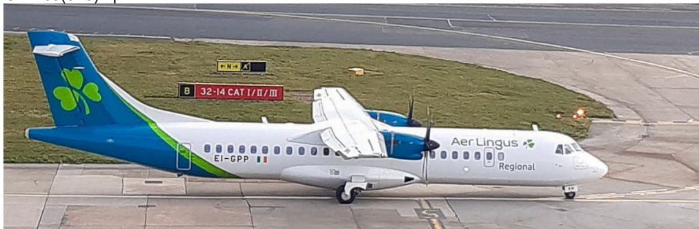
EI-GPP ATR72 Emerald 27/03 Nigel Berry

Loganair(LOG/LM "Logan") :-18/3 G-SAJJ(827) operated charter in from Bournemouth, 19/3 G-SAJJ(828) operated charter back to Bournemouth.