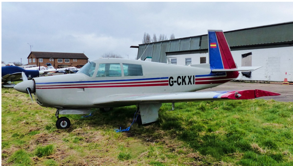
G-CKCI Mooney M20E Super 21 05/03