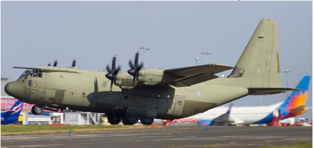
ZH889 Hercules RAF 26/03