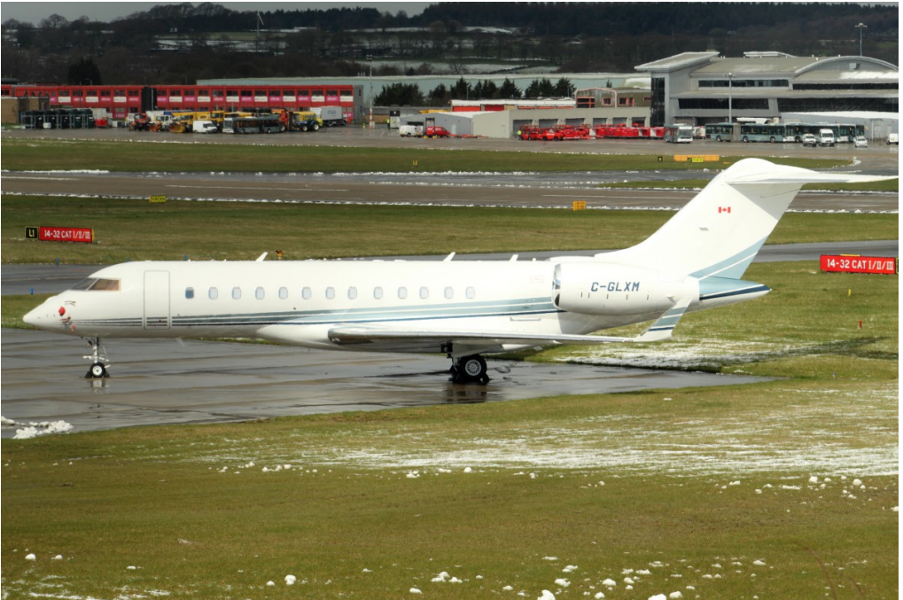
G-GLXM Global Express Skyservice 31/03 Ian Gratton

Beechjet 400 SP-TTA arr 15:02 dep 15:59, Cessna 172 Cutlass G-BILU arr 16:00 dep 16:21, Cessna 421C N60GM dep 16:22, Beech 200 Kingair G-JASS arr 17:16 n/stop, Global Express EC-LEB arr 18:45 n/stop.