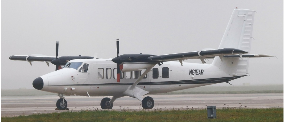
N615AR De Havilland DHC-6-300 Twin Otter D 02/03