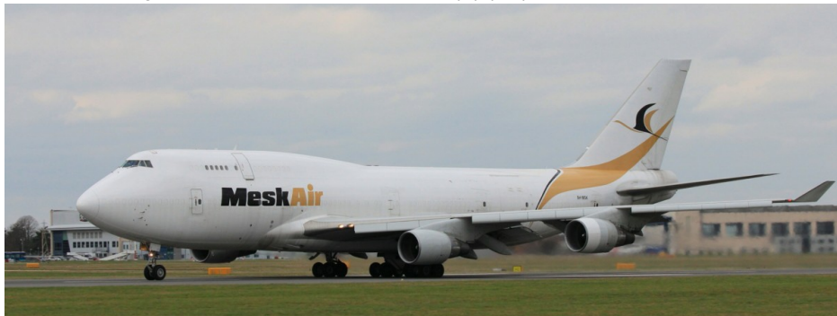
9H-MSK Boeing 747-400 Mesk Air 10/03