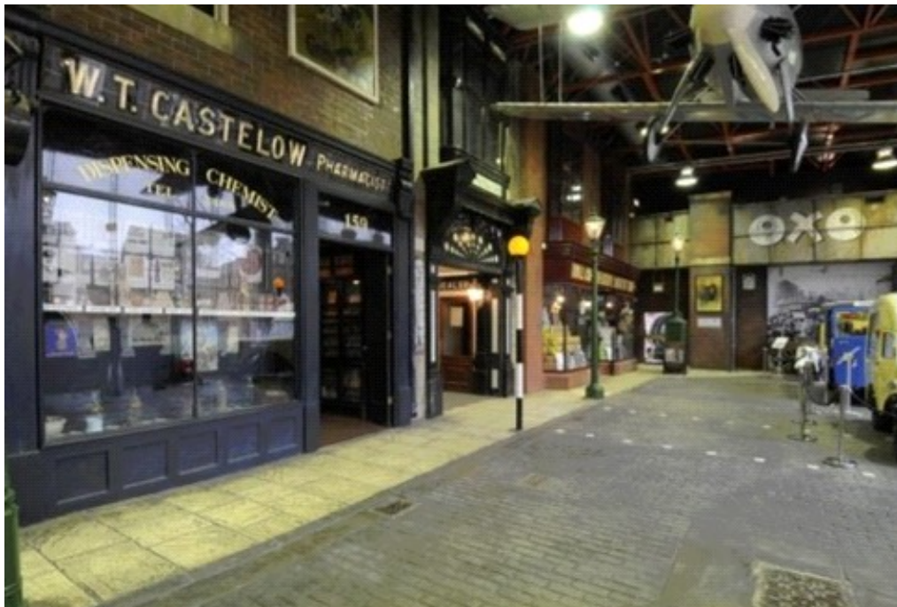
View of the interior of the Streetlife Museum

Never heard of it most of us will say, well, it's a little known aeroplane designed and built as a private venture by Blackburn at Brough, near Hull. It made its first appearance there in May 1928. Why bring this to our attention now you may well ask? The answer lies in the fact that the prototype is currently on display in the Streetlife museum, Hull and according to their web page the museum is on the High Street so easy to find - and it's free.