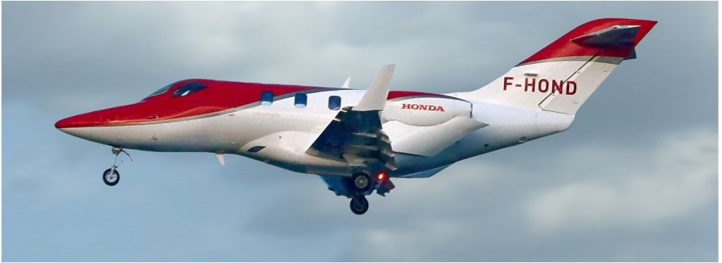
F-HOND HondaJet 26/03 Paul Whincup

Phenom 300 D-CHIC arr 09:34 dep 11:18, EMB Praetor 600 G-FTFX arr 12:23 n/stop, Cirrus Sr22 N220AD arr 13:12 dep 16:30, Falcon 2000 G-NJAD arr 13:37 n/stop, PA38 Tomahawk G-BPHI dep 13:42, Lockheed C130J Hercules ZH889 arr 14:00 dep 14:01 ( Touch & go ?), HondaJet F-HOND arr 17:21 dep 18:31. Cessna 525A CJ2 D-IWIR arr 19:56 n/stop.