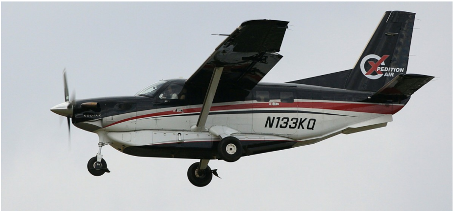
133KQ Quest Aviation Kodiak 100 10/03

(FV) First Visit. (T) Training. (H) Helicopter. (F) Freighter.