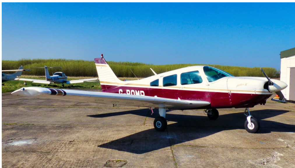
G-BOMP PA28 Archer 19/03