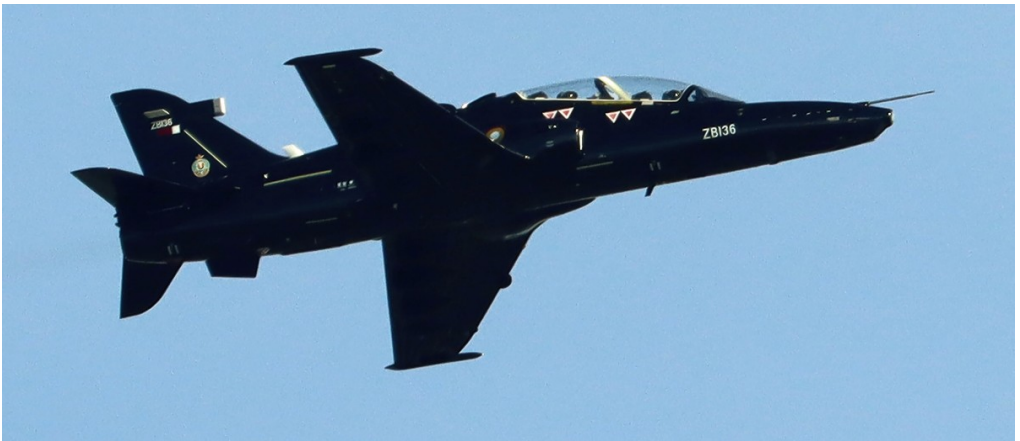
ZB136 Hawk Quatari AF 14/03 Paul Whincup