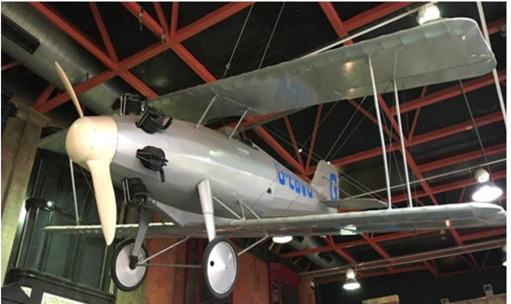
The Lincock is now on display at the Hull Streetlife Museum

The Lincock was demonstrated extensively and in particular to, Canada, China, Spain, Italy and Japan and whilst these countries showed interest no orders were forthcoming. The RAF preferred heavier fighters and had no interest in the aircraft despite its relatively high performance and manoeuvrability. In all only 8 Lincocks in 4 versions were produced and it had a brief, unsuccessful life.