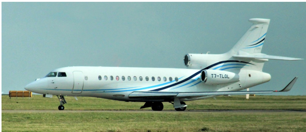
T7-LOL Dassault Falcon 7X 09/03 Mike Storey

Cessna 525A CJ2 D-ISLT arr 08:43 de 14:37, Falcon 7X T7-LOL arr 08:48 dep 10:44, Diamond Da62 G-JAAM arr 12:44 dep 14:28, Cessna 510 Mustang F-HERE arr 13:39 dep 14:41, Cessna 550 Bravo G-JHEX arr 16:26 dep 16:44, Learjet 75 G-ZNTH arr 16:31 dep 17:07,