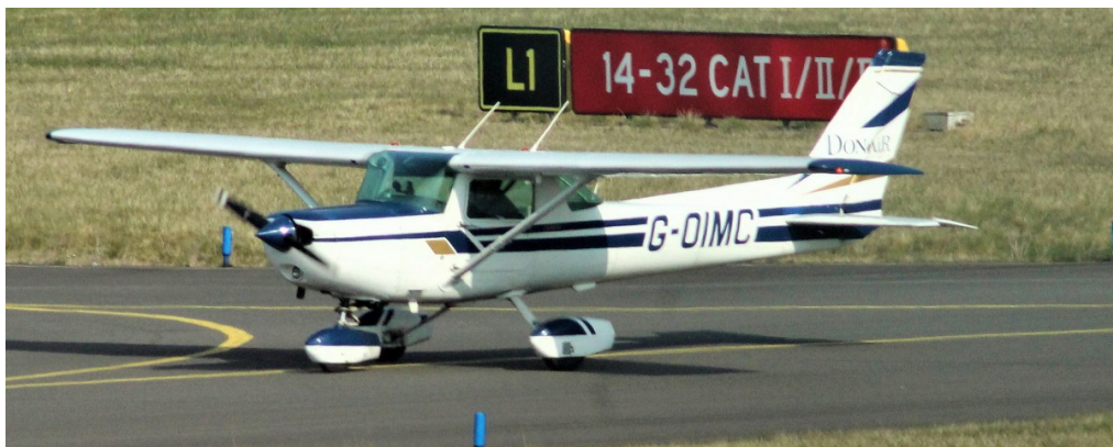
G-OIMC Cessna 152 24/03 Mike Storey

Cessna 560 Excel G-NJAA arr 09:45 dep 11:04, Cessna 152 G-OIMC arr 10:22 dep 17:27, R/Cessna F406 Caravan G-SMMA arr 11:21 n/stop, BN-2B-26 Islander G-HEBS dep 11:28 ret at 11:36 n/stop, Cessna 172 Skyhawk N688CS dep 12:26, Cessna 525 Citation M2 HB-VTW arr 15:47 dep 17:36, Phenom 100 ZM334 overshoot at 16:45, Cirrus Sr22 N842VV dep 16:55, Phenom 100 D-IAAR arr 17:01 n/stop, Cirrus SR22 G-GCVV dep 17:17 ret at 17:30 & dep 17:30, Falcon 2000XS G-SMSM arr 19:05 n/stop.