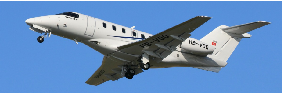
HB-VQQ Pilatus PC-24 10/03