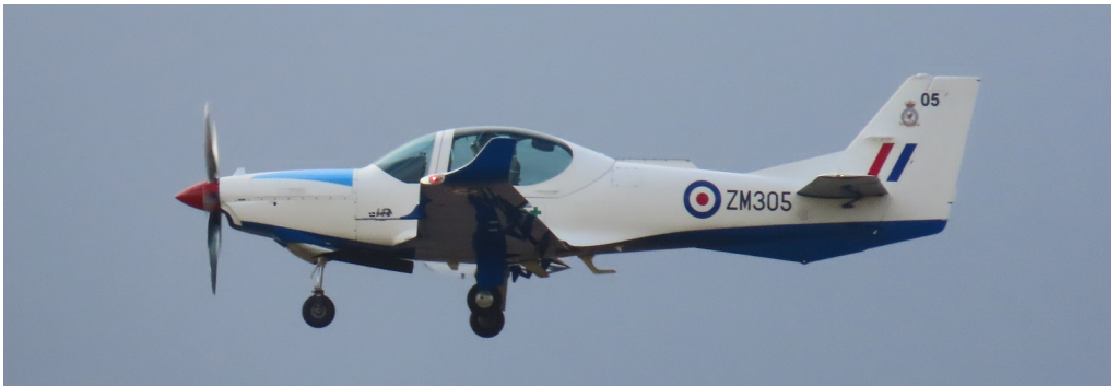
ZM305 Grob G120TP Prefect T1