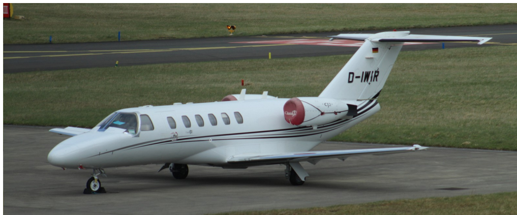
D-IWIR Citation 525 Excellent Air 13/03 Ian Gratton