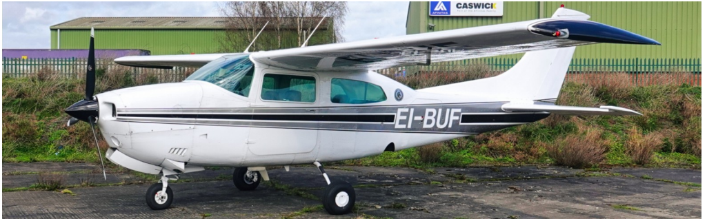
EI-BUF Cessna 210N 28/03