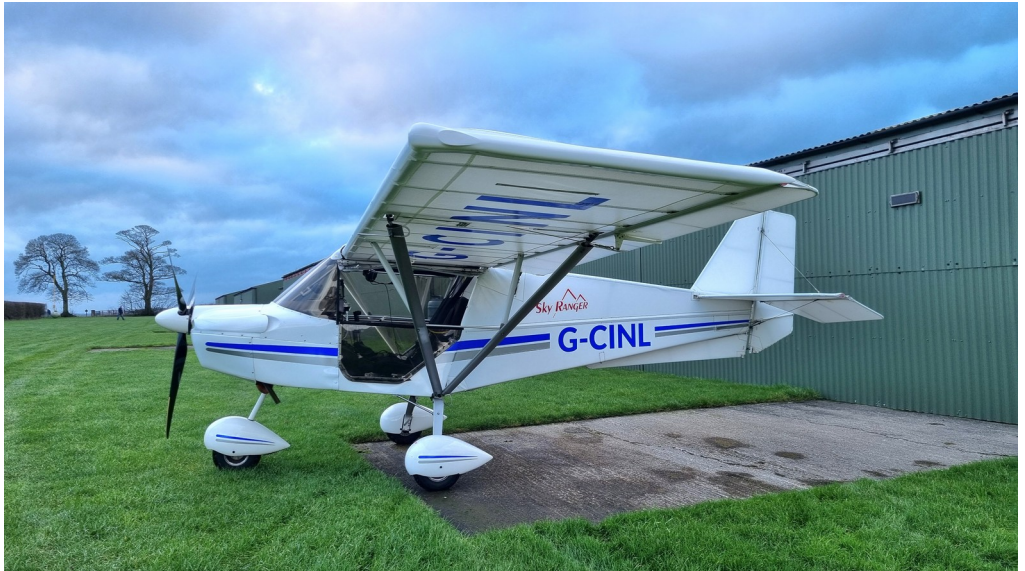
G-CINL Skyranger Swift