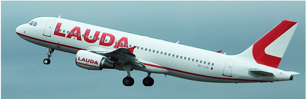
9H-LOS Airbus A320 Lauda Europe 24/03 Mike Storey