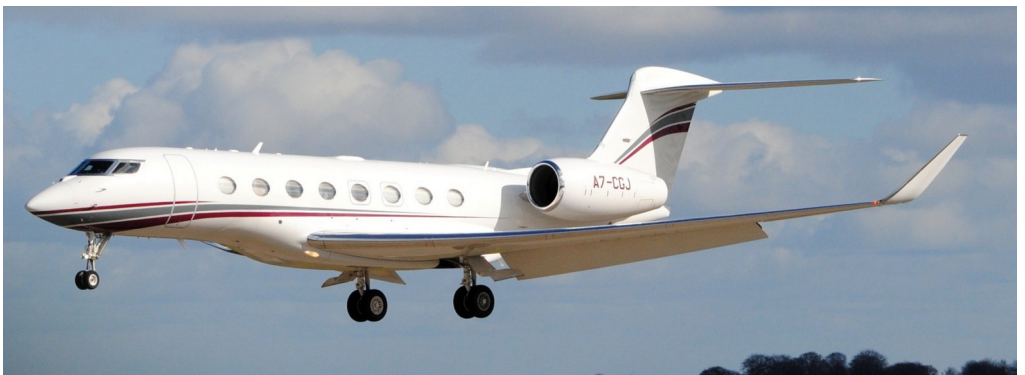
A7-CGJ Gulfstream G650ER Qatar Exec 14/03 Dave Wooler