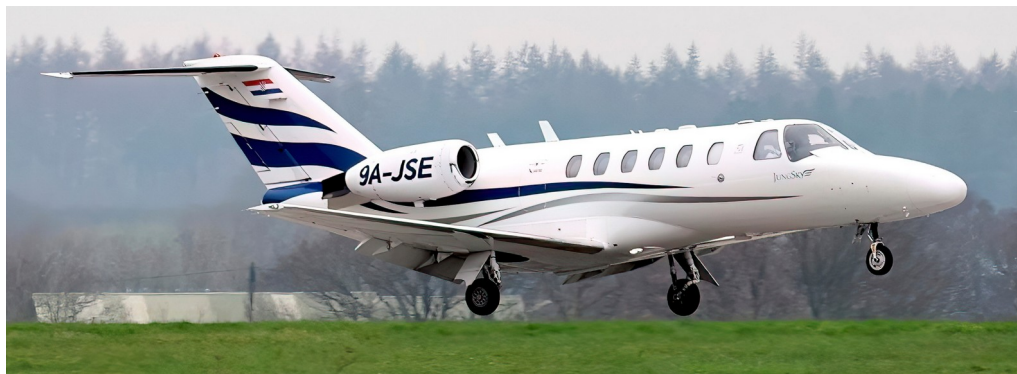
9A-JSE Citation CJ2 07/03 Paul Whincup

Gulfstream V N280PH arr 07:11 dep 09:35, Ce 650 OY-CLP dep 10:05, Learjet 45 D-CUNI arr 13:20 dep 16:08, Ce 525A 9A-JSE arr 14:23 n/stop, Embraer 145 G-SAJK arr 16:30 n/stop, Ce 525A D-IAKN arr 17:43 n/stop.