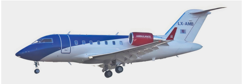
LX-AMB Challenger 605 Luxembourg Air Ambulance 30/03 Paul Whincup