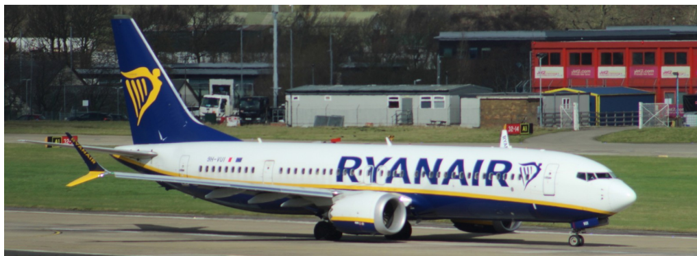
9H-VUI Boeing 737-8200 MAX Ryanair 13/03 Ian Gratton