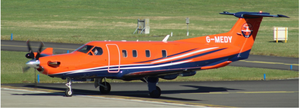
G-MEDY PC-12 Skycare Repatriation 17/03 Ian Gratton

Pilatus PC-24 D-CVMS dep 07:09, BETA CX 300 N214BT arr 09:44 n/stop, Pilatus PC XII G-MEDY arr 10:43 dep 11:24, Learjet 40 C-FWGB dep 13:25 to Reykjavik, Pilatus PC-24 D-COIN arr 19:02 n/stop, Ce 680A CS-LUC arr 19:15 n/stop.