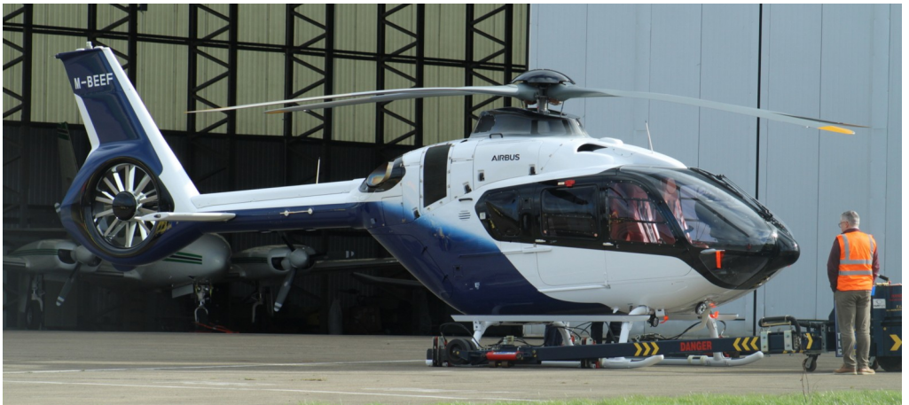
M-BEEF EC135 Acorn Mobility 13/03 Ian Gratton