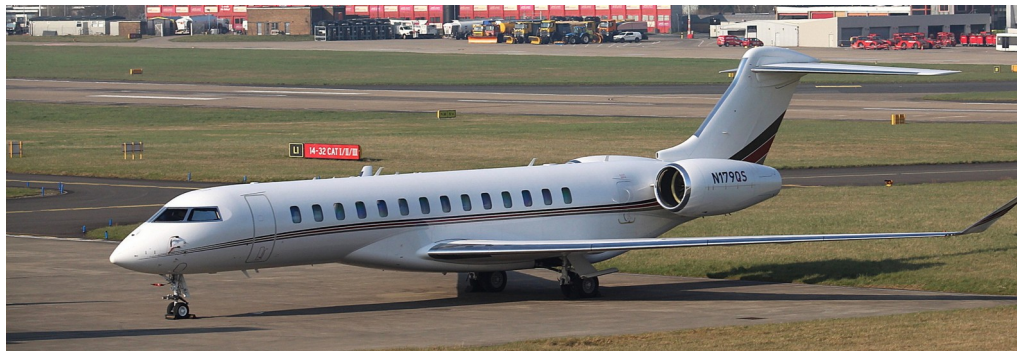
N179QS Bombardier Global 7500 21/03 Mike Storey

CE 525 G-KION arr 09:49 dep 10:56, Ce 680 CS-LUD arr 11:51 dep 13:09, Global Express CS-GLE arr 12:36 n/stop, Global 7500 N179QS arr 14:13 n/stop, Ce 525B D-CENT arr 16:55 n/stop.