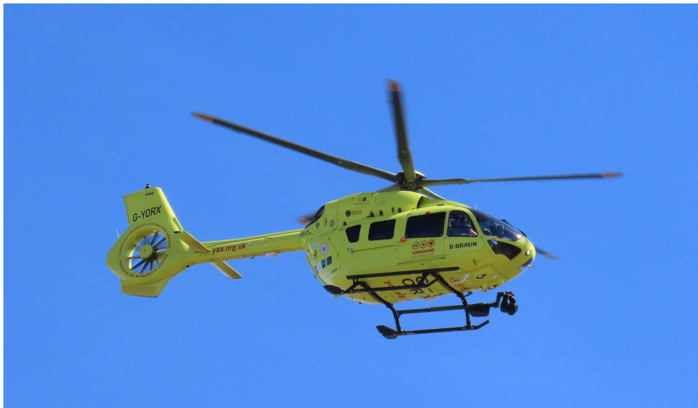
G-YORX H145 of Air Yorkshire Air Ambulance departing for Nostell