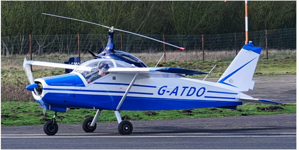
G-ATDO Bolkow Junior 14/03