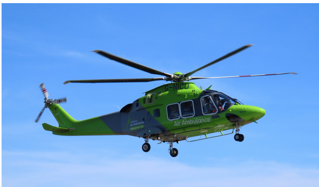
G-NICU AW169 of National Children's Air Ambulance arriving