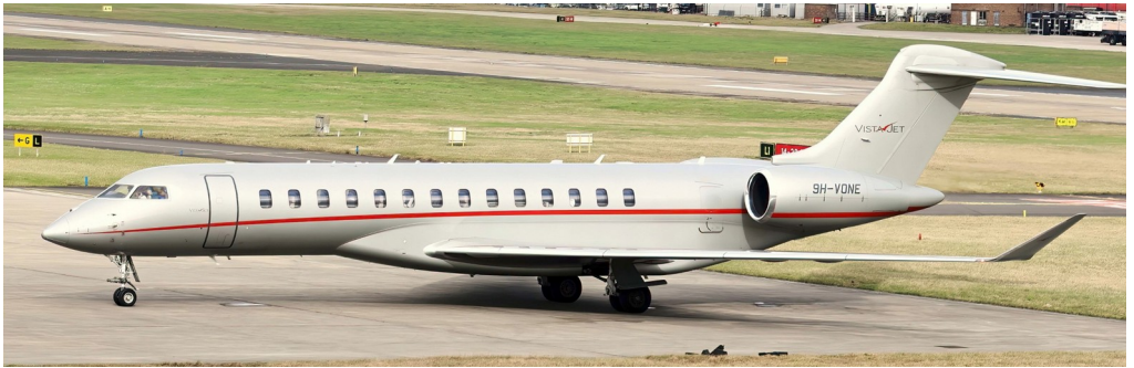
9H-VONE Global 7500 Vista Ket 02/03 Paul Whincup

Challenger 350 9H-VCM arr 08:57 dep 10:41, Global 7500 9H-VONE arr 09:15 dep 11:31, Pilatus PC XII PC XII G-FITC arr 16:38 dep 16:49, Cirrus SR20 2-SIRI arr 17:09 n/stop, Pilatus PC-24 D-CFBL arr 19:45 n/stop.