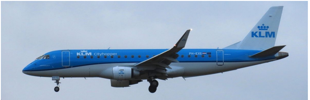
PH-EXS Embraer ERJ-175 200STD