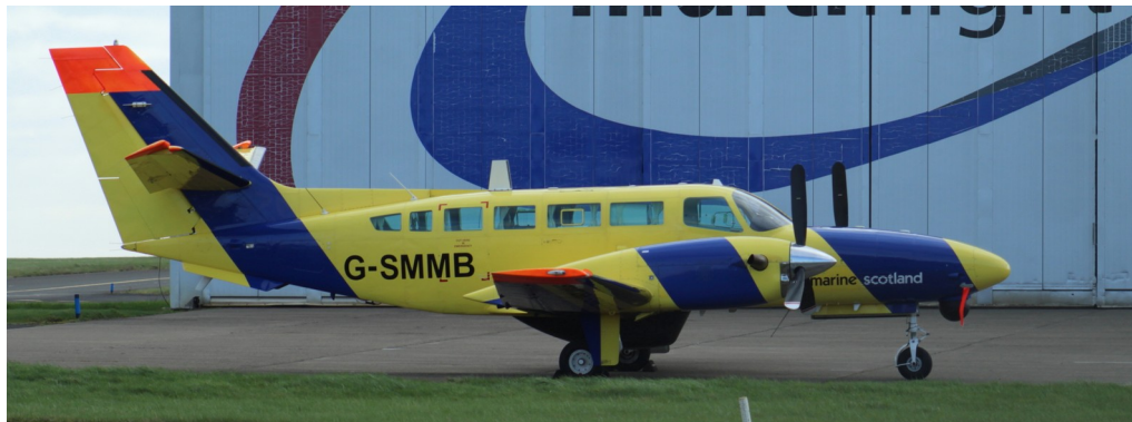
G-SMMB Cessna F406 Task Marine Patrol 13/03 Ian Gratton

Pilatus PC XII G-OTPL arr 11:37 n/stop, CE 425 D-IPCG arr 12:07 dep 13:02, Ce 525a D-IWIR dep 14:28