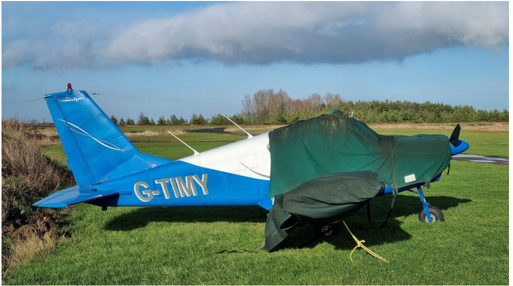
G-TIMY Gardan Horizon