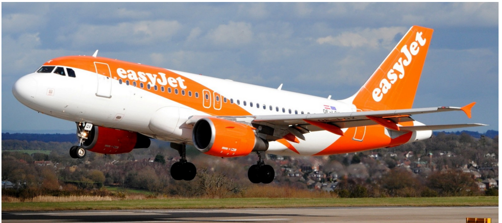
OE-LQX Airbus A319 Easyjet Europe 14/03 Dave Wooler

Paris (4637/4638, "47LZ/72KJ", Mon/Fri):-2/3 OE-ICN, 6/3 OE-ICN, 9/3 OE-ICN, 13/3 OE-LQC, 15/3 OE-IZL, 16/3 OE-LKK, 20/3 OE-ICF, 23/3 OE-LKK, 27/3 OE-ICK, 30/3 OE-IVR.