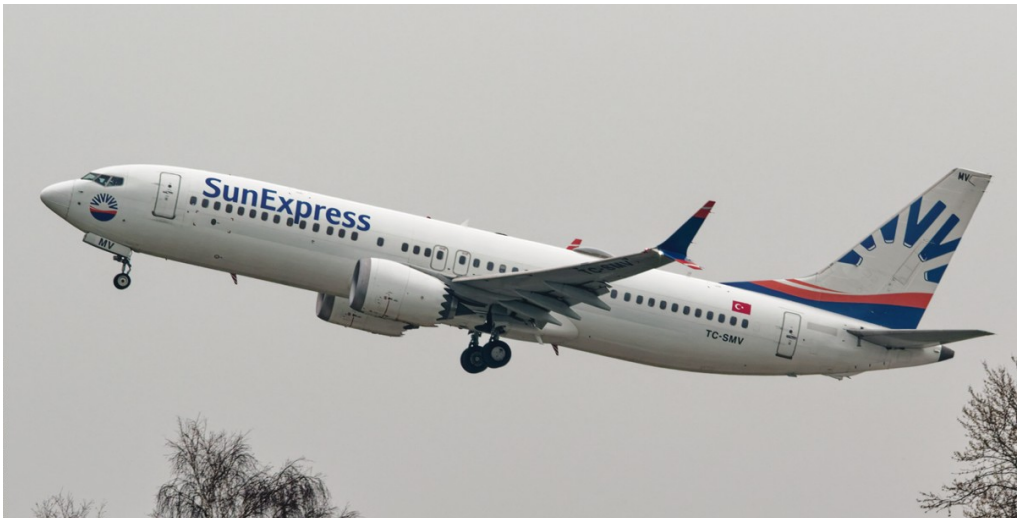
TC-SMV Boeing 737-8 SunExpress 24/03 Stewart Robertshaw

Antalya(560/561, "68H/2NB", Sun/Fri):-22/3 TC-SMV, 27/3 TC-SPV, 29/3 TC-SPI.