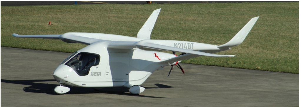
N214BT CX300 Beta Technologies 17/03 Ian Gratton