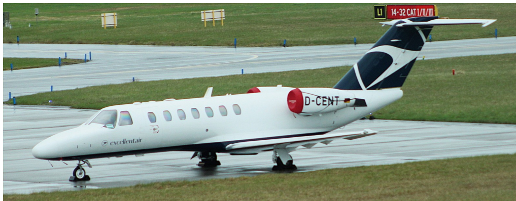
D-DENT Citation CJ-3 24/03 Mike Storey

Socata TBM930 N2PD arr 08:03 dep 08:15, Pilatus PC XII G-SCLN arr 08:19 n/stop, AW 139 M-JCBA arr 08_37 dep 0900 ( also reported as an H160) ret LBA at 16:02 & dep again at 16:30, Beechjet 400 SP-TAT arr 10:42 dep 11:57, Ce 560XL G-SIRS arr 13:52 dep 21:32,