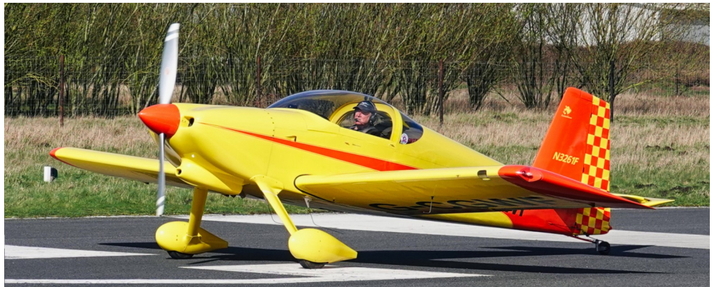
G-CGWF Vans RV-7 14/03