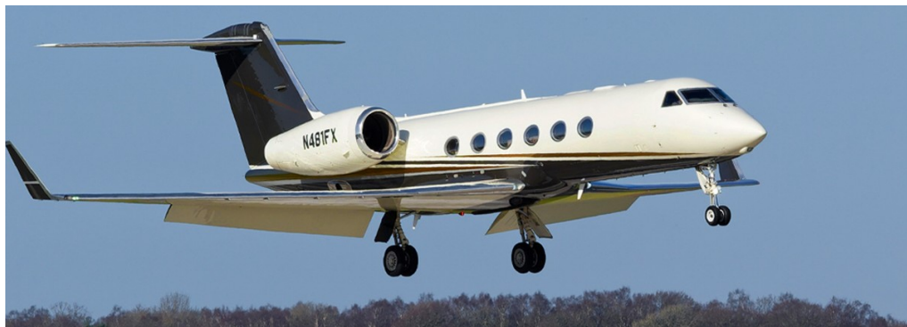
N481FX G450 Flexjet 04/03 Stewart Robertshaw

CE 560XL CS-DXM dep 07:22, Gulfstream 450 N481FX dep 08:59, Ce 425 M-MANX arr 09:49 dep 14:36, Challenger 350 CS-CHP arr 10:18 dep 12:25, Eclipse EA500 2-JSEG arr 10:33 dep 13:08, Phenom D-CLUB arr 11:43 until 6th, CE 525A D-ISJA dep 13:29,