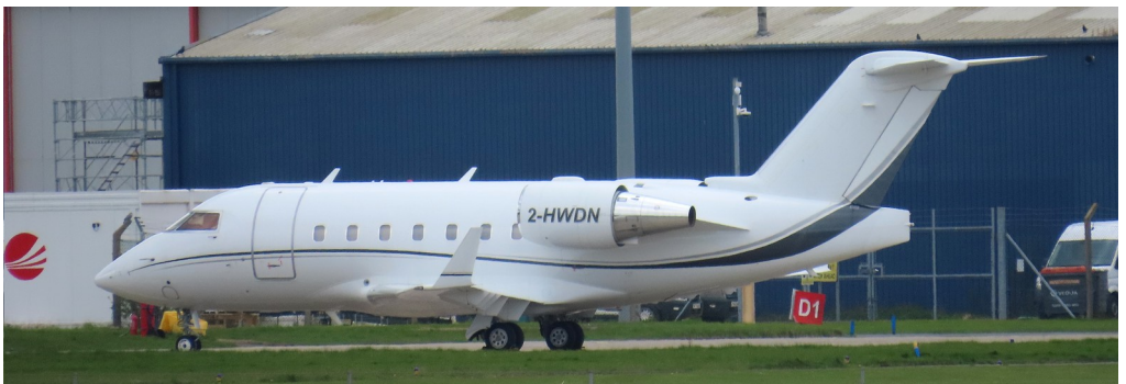
2-HWDN Bombardier Challenger 604