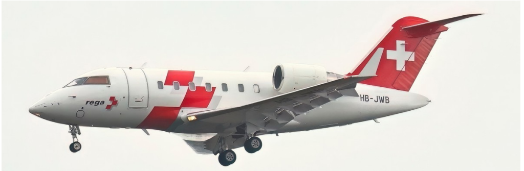
HB-JWB Challenger 650 Swiss Air Ambulance 30/03 Paul Whincup