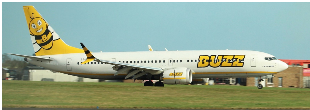
SP-RZE Boeing 737-8200 Ryanair Buzz 03/03

Other flights:-19/3 EI-IHB(584W/6817) arrived from Milan then departed to Manchester, EI-IGL(80TE/4006) arrived from Alicante then departed to Manchester.