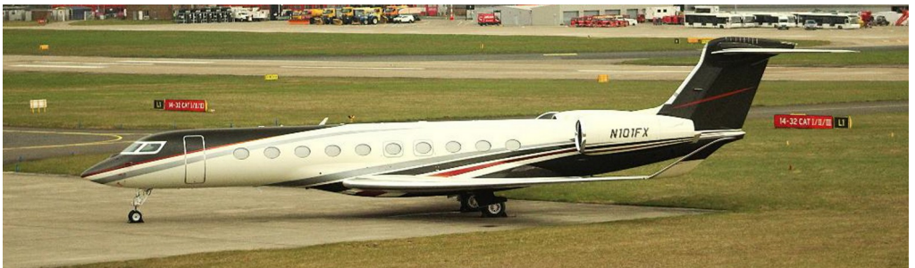
N101FX Gulf 7 Flexjet 31/03 Mike Storey

Gulfstream G700 N101FX arr 08:41 n/stop, Cirrus Sr22 2-FFLY arr 09:51 dep 16:37, Ce F406 Caravan G-SMMA arr 13:10 n/stop, Ce 525A 9H-PMN arr 16:07 n/stop, Global Express D-ACEV arr 18:08 dep 19:01, Phenom CS-PHP arr 20:28 n/stop.