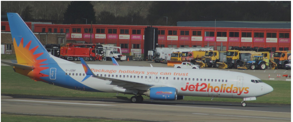
G-JZBF Boeinbg 737-800WL Jet2Holidays 13/03 Ian Gratton