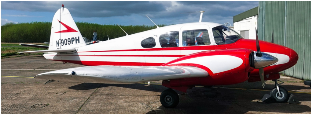
N909PH PA-23 Apache 28/03