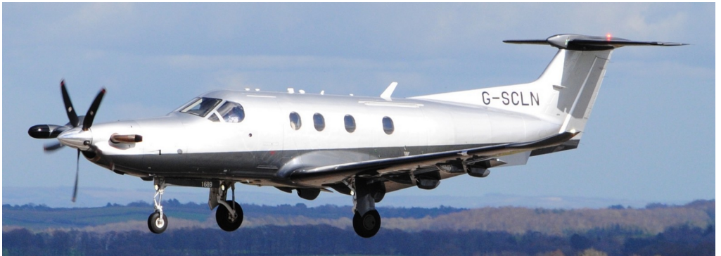
G-SCLN PC-12 14/03 Dave Wooler G-OTFL PC-12 Duagii Leasing 15/03 Ian Gratton