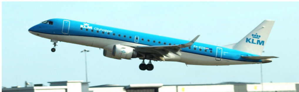
PH-EZH Embraer 190 03/03 Mike Storey

Other flights :-29/3 PH-EZL(9935) positioned out to Amsterdam.