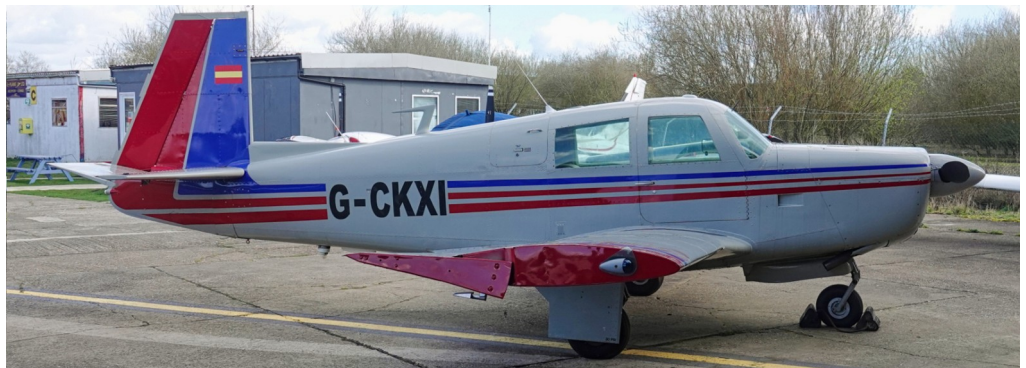
G-CKXI Mooney M20E 14/03