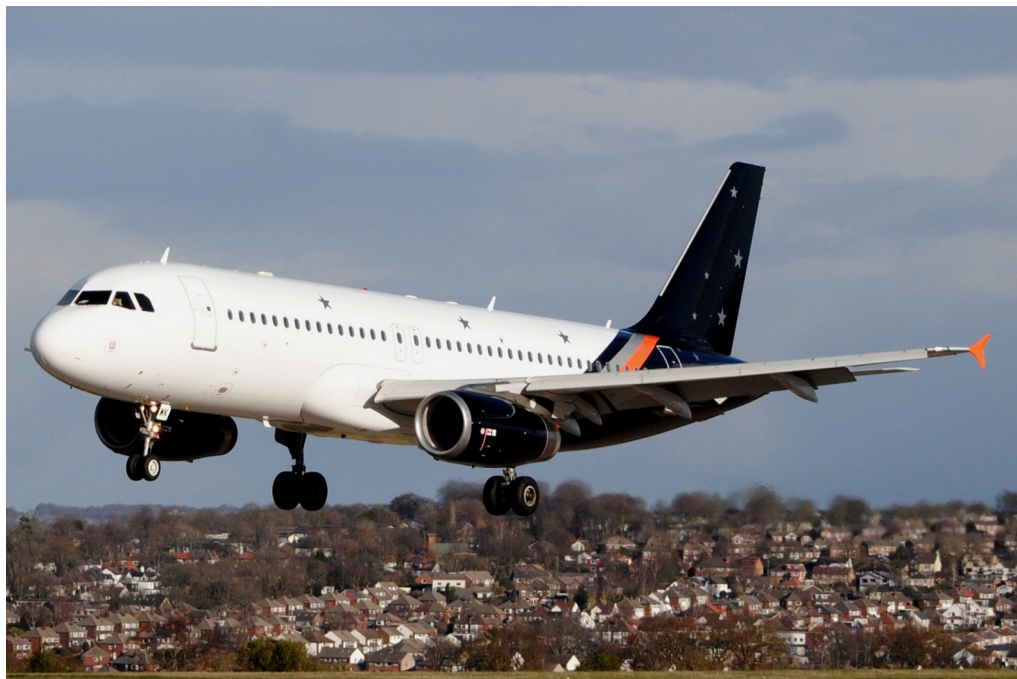
G-POWK Airbus A320 Titan Airways 14/03 Dave Wooler

Titan(AWC/ZT, “Zap”) :-14/3 G-POWK(855Y/8551) positioned in from Stansted then departed to Biggin Hill, 15/3 G-POWK(8552/855W) arrived from Biggin Hill then positioned out to Stansted.