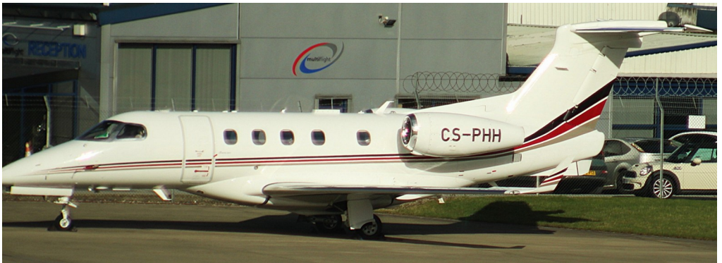
CS-PHH Embraer Phenom 300 03/03 Mike Storey

Pilatus PC-24 D-CFBL dep 08:50, Phenom CS-PHH dep 12:20, Gulfstream 450 N481FX arr 13:42 n/stop, CE 560XL CS-DXM arr 13:59 n/stop, Cirrus Sr20 dep 17:32,