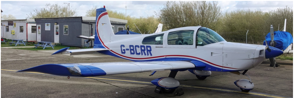
G-BCRR AA-5B Tiger 28/03