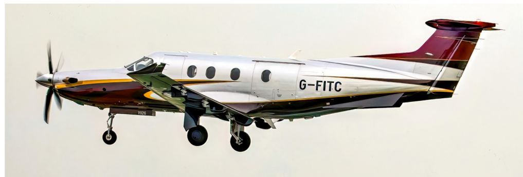
G-FITC PC-12NG 22/03 Paul Whincup

CE 525B D-CENT dep 07:33, Beechjet 400 OK-BEE arr 09:23 dep 12:45, Ce 525A OO-AMR arr 09:28 dep 10:00, Pilatus PC XII G-FITC arr 09:54 dep 10:28, Pilatus PC-24 D-COIN arr 10:13 dep 11:40, Global Express CS-GLE dep 11:32, Global 7500 N759QS dep 12:29, Phenom CS-PHI arr 14:57 dep 17:25, Ce 525 G-KION arr 16:42 n/stop,