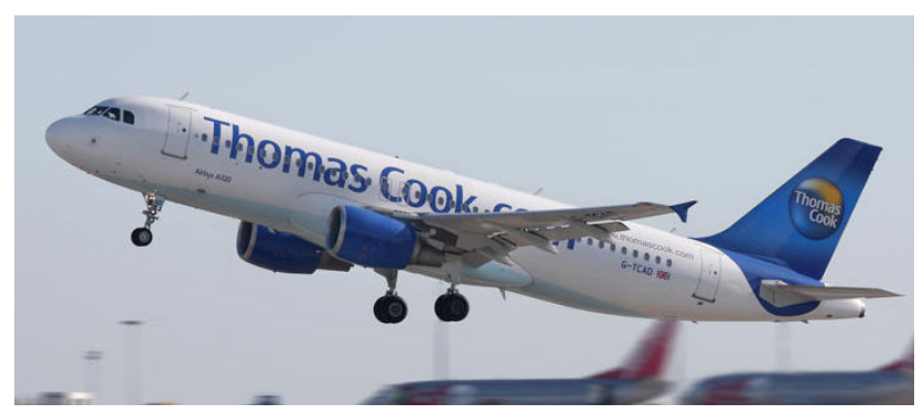
G-TCAD Airbus 320 on its first visit to LBIA Departing runway 32 for Mahon on 26/09/09 Paul Whincup