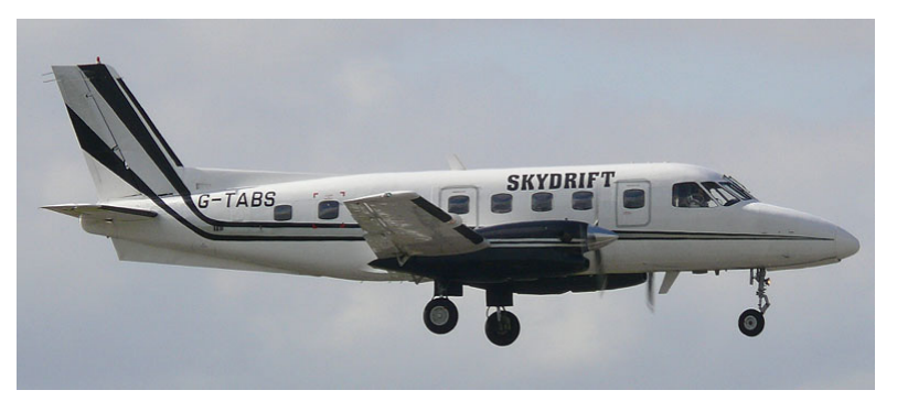
G-TABS Embraer Bandierante of Skydift Landing at Doncaster/Robin Hood for a freight charter, 14/09/09.