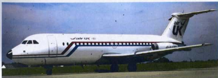
BAC 1-11 G-AXMU This series 400 aircraft was leased by Air UK from BIA in the mid-1980's for operations on the Leeds/Bradford to Amsterdam route.

Shorts 330 G-RNMO Gill Air of Newcastle used "sheds" on the route from Leeds to Gatwick in the mid 1980's.