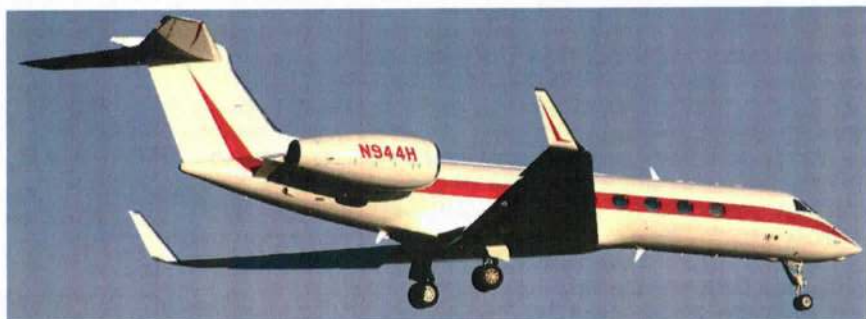
Honeywell Aircraft Leasing Gulfstream 4 N944H making its first visit to LBA, 10/9

GENERAL AVIATION:- DA-42 Twin Star G-GFDA(Equity 02) from Blackpool(0919), local flight as "Exam 02"(1156/1307), back home to Blackpool(1422). Bolkow 105 G-BTKL(Veritair 01) from Wetherby(0923) to Emley Moor(0959), f/t Emley Moor(1240/1303). Cessna T.210M G-TOTN f/t Ronaldsway(0934/1558). Mooney M.20K G-BKMB f/t Sherburn(1115/1652), to Multiflight engineering. Eurocopter EC.130 G-SASY(Heliflight 52) from Sheffield(1124) to Bristol(1614). PC-12 G-DAKI from Biggin Hill(1828) to Bournemouth(1902).