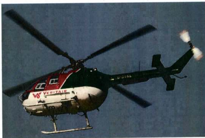
Veritair Bolkow 105 G-BTKL departing LBIA following a refuel

GENERAL AVIATION:- Bolkow 105 G-BTKL(Veritair 01) from Wetherby(0927) to Redhill(0959). Baron N64VB from Hawarden(1034) to Sleaf(1103). King Air 200 G-MEGN from Cardiff(1602) to Edinburgh(1711).