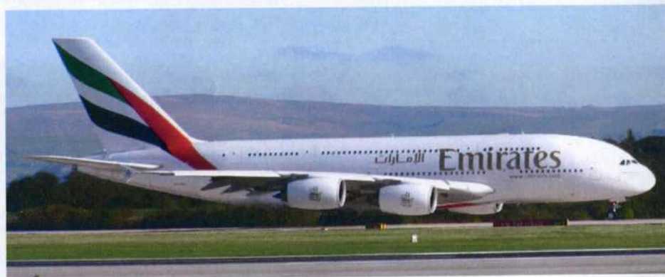
A6-EDJ Airbus A.380-861, Emirates Manchester, 04/10/10, Alan Sinfield