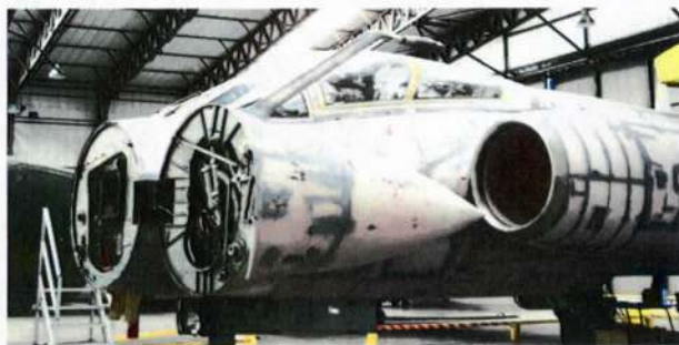
Blackburn Buccaneer XV901 Built by Blackburn in Yorkshire this aircraft saw action with the RAF in the Falklands in 1983.