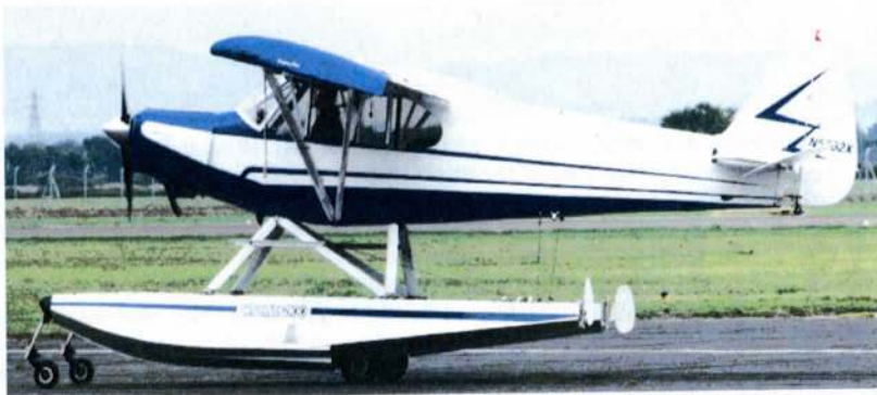
PA-18 Floatplane N5382X spent a few days at Teesside from 21/9

Stainsby Hall:- Twin Squirrel G-BXLL was operating from here on 3/9 carrying out local powerline inspection duties using call-sign "Powerline 12".