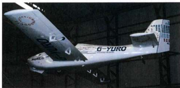
Europa Prototype G-YURO Built at Kirkbymoorside this advance kit built design could carry two people.