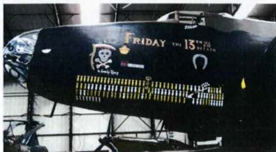
Handley Page Halifax Reconstructed by the Yorkshire Air Museum as a tribute to all the Halifaxes and their crews based in Yorkshire during World War II.