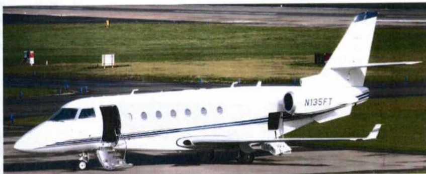
Minnesota based IAI Galaxy N135FT parked on Multiflight/East

GENERAL AVIATION:- King Air 200 G-WVIP(Prestige 641) f/t Newquay(1456/1658).