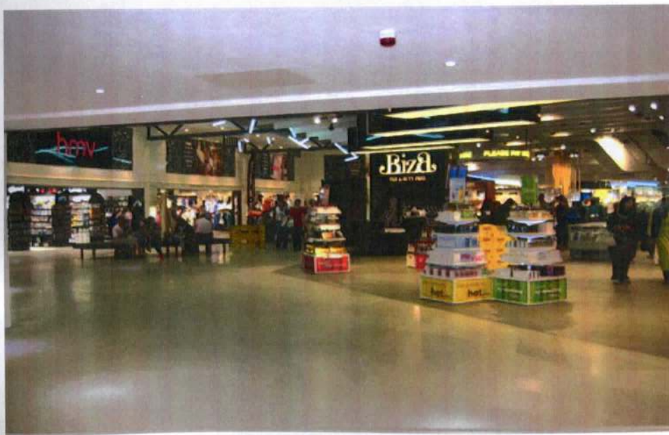
TAX FREE SHOPPING IN THE AIRPORT SHOPPING MALL(10 POINTS)