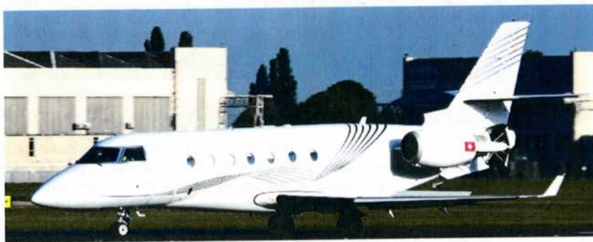
TAG Aviation IAI Galaxy HB-IUT visited Doncaster on 9/9(Clive Featherstone)

12/9 PH-VKK PA-44 Seminole, CS-DUG Hawker 900XP(Fraction 8AF) 13/9 CS-DRJ Hawker 800XP(Fraction 7LY), D-CAMS Citation XL(CLU 1613), G-PZAZ PA-31 14/9 CS-DXZ Citation XLS(Fraction 547F), G-KLNB King Air 200(Saxon Air 35A) 15/9 EI-MJC Citationjet 2, G-DTFL PA-44, ZJ707 Bell 412(SYS 100, ILS) 16/9 D-ISCH Citationjet 2, ZJ122 Merlin(Vortex 767, ILS), G-SSSC S.76B(ILS) 17/9 EI-GJL Dauphin, G-CFGB Citation Sovereign, G-BYVH Tutor(Barkston 10, ILS) 18/9 OO-VHV King Air 90, G-BLHR Duchess(Exam 77) 19/9 G-CPRR Citation Sovereign(GOJ 219A), G-CJDB Citationjet, G-HEBJ Citationjet 20/9 N4483W Hawker 400XP, M-FOUR Beech 36, ZJ238 Bell 412(SYS 91, ILS) 21/9 CS-DXL Citation XL(Fraction 3XW), ZJ236 Bell 412(SYS 81), G-NTWK Twin Squirrel 23/9 N816JW IAI Galaxy(n/s), LX-LAR Lear Jet 35A(DUK 1AMB), G-JCBJ S.76B(JCB 2) 24/9 G-ZMED Lear Jet 35A(Air Med 019), ZK453 King Air 200(Specter 1) 27/9 G-LSAJ Boeing 757(Channex 476, LBA div), Tucanos ZF239(LOP19), ZF417(LOP93) 28/9 N234RG Pilatus PC.12, G-MSPT Eurocopter 155, G-NAAL Challenger 600 29/9 M-PRVT Citation X 30/9 G-HARK Challenger 604(Twinjet 5T, training)