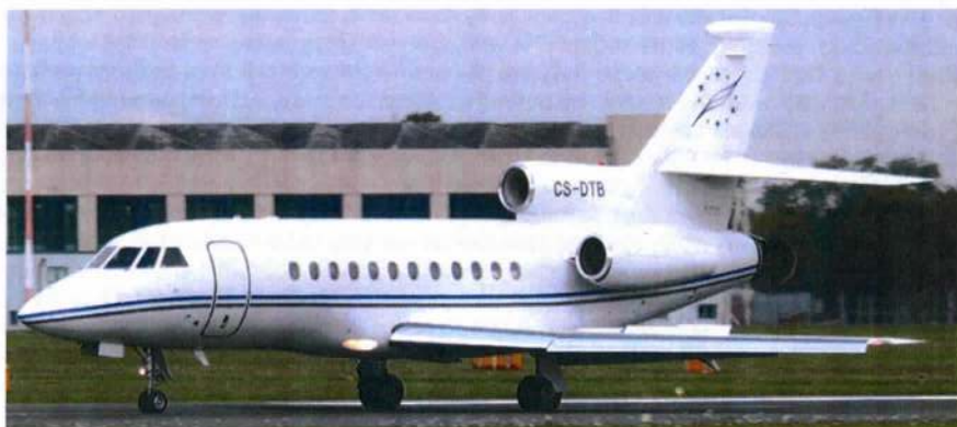
Falcon 900EX CS-DTB arriving at Doncaster on 9/9(Clive Featherstone)

Doncaster Race Course:- Helicopter noted visiting for the St. Ledger on 11/9 were:- G-BPRL Twin Squirrel, G-JIVE Hughes 369E, G-LONE Jet Ranger, G-OTSP Twin Squirrel, G-RWLA Eurocopter EC.135T, G-STGR Agusta A.109S, G-TOLI R.44.