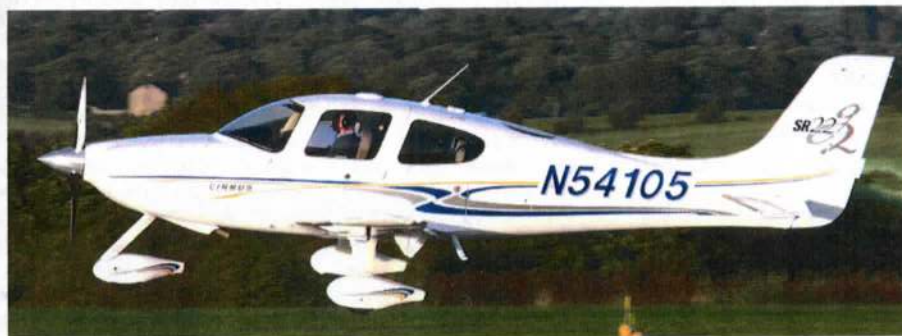
A pleasing study of resident SR.22 N54105 about to touch down on 32

GENERAL AVIATION:- Robinson R.44 G-OMEL from Kemble(1035) to Sherburn(1315). King Air 200 G-MEGN from Cardiff(1519) to Edinburgh(1820).