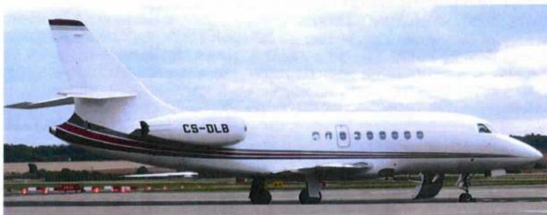
Netjets Europe Falcon 2000EX parked on the apron at Humberside(Clive Featherstone)

11/9 G-CITJ Citationjet (Clifton 5) 17/9 CS-DLB Falcon 2000EX(Fraction 2CB) 21/9 N888SF Citation Sovereign, F-HHAM King Air 90(Darta 6639) 24/9 N95590 Commander 690 25/9 G-MEGP Challenger 300, G-RSXL Citation XLS 27/9 M-OTOR King Air 90, G-YPRS Citation XL 29/9 H-29 Agusta A.109(Belgian Air Force, from Newcastle)