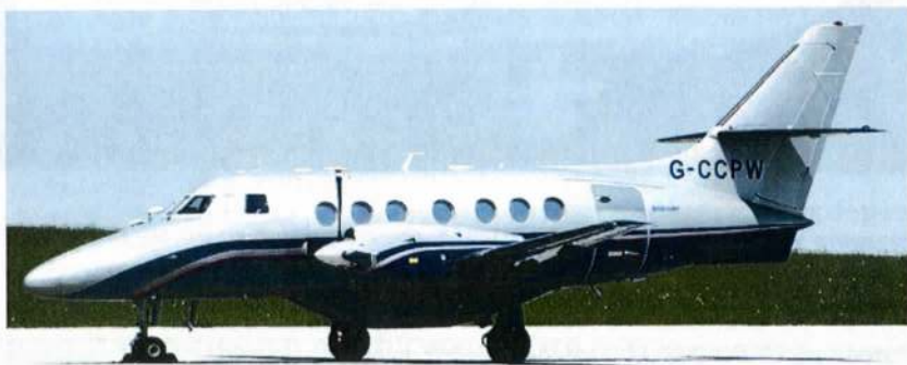
Linxsair of Humberside, Jetstream 31 G-CCPW operated on behalf of Manx2 on 24/9

MILITARY:- Tucano ZF379(LOP 09) ILS and overshoot(0925), f/t Linton. Lynx ZD284(Armyair 968), radar approach and overshoot(1409), f/t Dishforth. This aircraft later repeated the sortie, overshooting the second time at 1555.