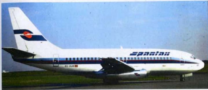
Boeing 737-200 EC-DUB Spantax, operated IT flights to Spain from LBA during the 80's and we also had the pleasure of seeing their Convair 990 Coronados during the same period. I hope to find a picture of one in the thousands I am still sorting through!