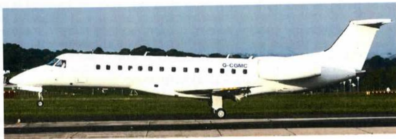
Colouful(!!) Eastern Airways EMB.135 landing on 32, 9/9(Robert Burke)

MILITARY:- King Air 200 ZK453(Cranwell 15) ILS and overshoot x2(1223/1259).