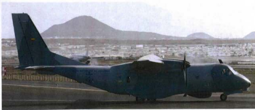
While holidaying in Lanzarote Simon Titchmarsh was lucky to catch this Columbian Navy CASA 235 ARC 803 passing through on delivery.

CREDITS, ACW, ATW, AV Flash, Civil Spotters, LBA2 E-mail site's, and it's contributors, IFW, LBA WEB Site, Teletext, Telegraph and Argus, TTG, Lawrie Coldbeck