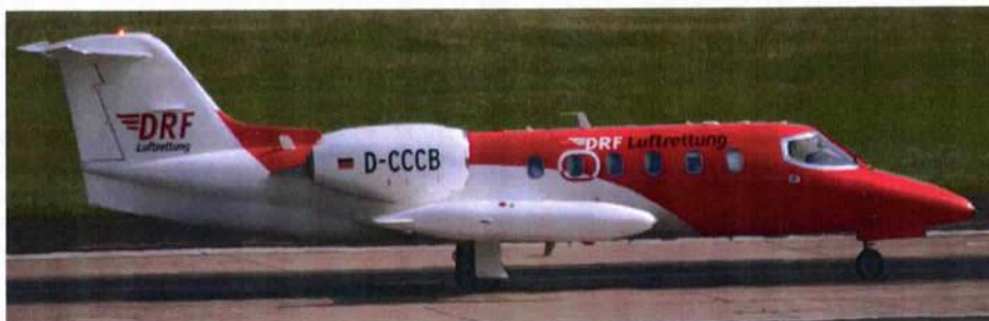
Lear Jet 35A D-CCCB back tracking for departure to Gibraltar, 1/9(Martyn Gill)

GENERAL AVIATION:- Having night stopped, Cessna 402C OY-SUN departed to Newcastle at 1139. R.44 G-UTTS from Teesside(1231) to Brighton(1310), return 1646/1826.