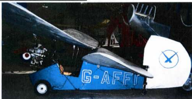
Flying Flea G-AFFI Built by two West Riding Branch members in a garage in Yeadon during the 1970's