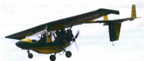
A Fly-in was held at Sandtoft on 21/8 and among the aircraft taking part was locally based Streak Shadow G-BUVX. Unfortunately,

Routing up the Vale of York on 5/3 was Douglas DC-3 HB-ISC. The aircraft passed the vicinity of York at 1430 routing to Wick and onwards to Oshkosh. Between 1115 and 1145 on 9/9 the BAe.146-200 G-LUXE was collecting air samples in the Vale of York using call-sign "Metman". On 23/9 Agusta A.109BA H-29(Belgian Air Force 317) was noted routing up the Vale of York at 1300 enroute to Newcastle. A pair of Dubai registered Agusta AW.139 helicopters DU-139 and DU-141 passed abeam York at 1115 on 29/9 routing to Newcastle. Incidentally, Boeing 747-400 A6-HRM(Dubai 01) arrived at Newcastle the following day to transport the VIPs home. Crossing overhead Teesside at 1705 on 30/9 was Cessna T.210N OK-TEI routing from Wick to Munster on delivery to The Czech Republic.