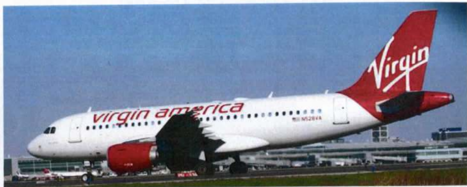
N528VA A.319-112, Virgin America Toronto, 10/10/10