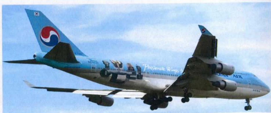
HL7448 Boeing 747-4B5F Korean Airlines Passionate Wings of Culture, special scheme Heathrow, 17/06/10