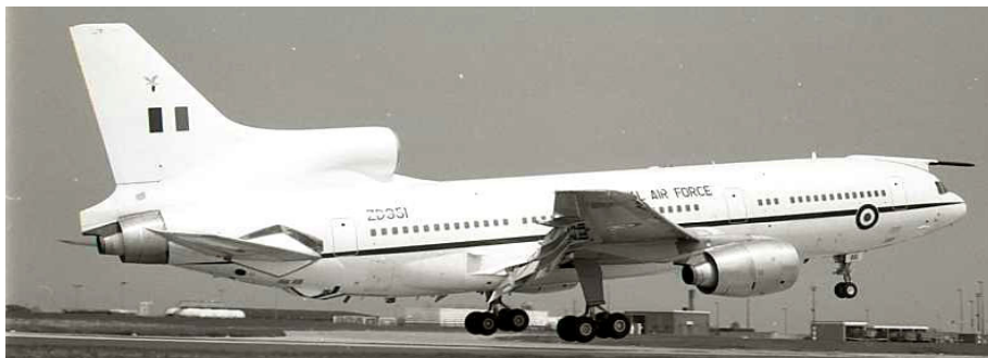
Trooping flights were regular in the early 80's here RAF Tristar ZD951 lands on 14