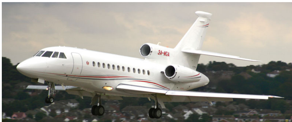
The second star of the weekend, Falcon 900EX 3A-MGA arriving on 4/9

GENERAL AVIATION:- King Air 200 G-MEGN from Nice(0915) to Birmingham(0938). Pilatus PC-12 M-LEYS of Heres Aviation, from Denham(1104) to Oxford(1507). Following attention in Multiflight Engineering from last month, Long Ranger G-PTOO departed to Kirkby Overblow at 1542.