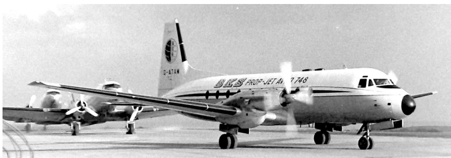
AVRO 748 G-ATAM, about to replace the DC-3s with BKS Air Transport, early 1960s(TS)