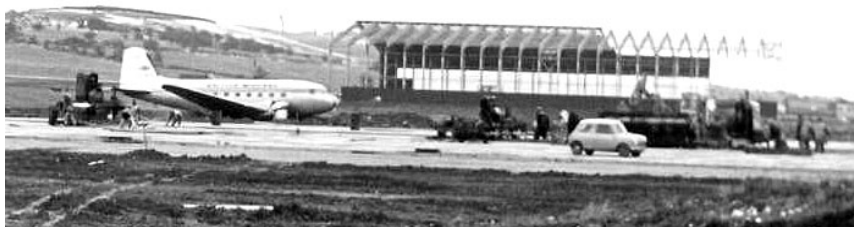
Douglas DC-3 G-ANTD of Derby Airways ran off the side of Runway 33 on 17/2/1965 while construction work was continuing. Also being built in the background was the Yorkshire Light hangar which still exists today(TS)