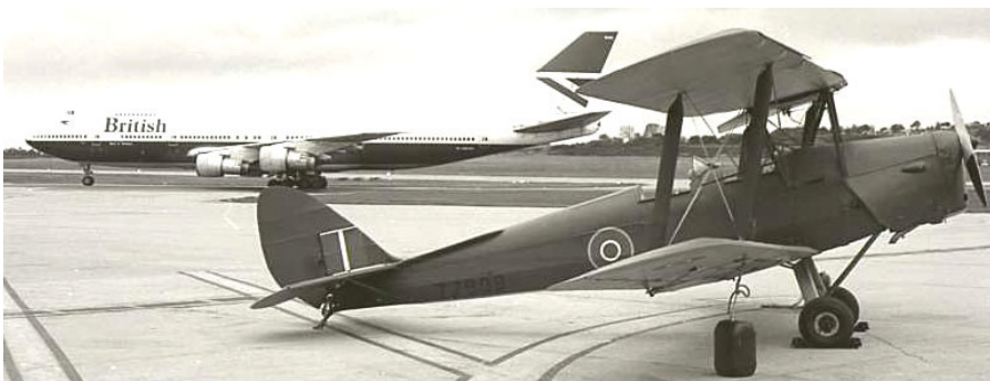
The opening of the runway extension, 1984, with Tiger Moth G-ANON and 747 G-AWND