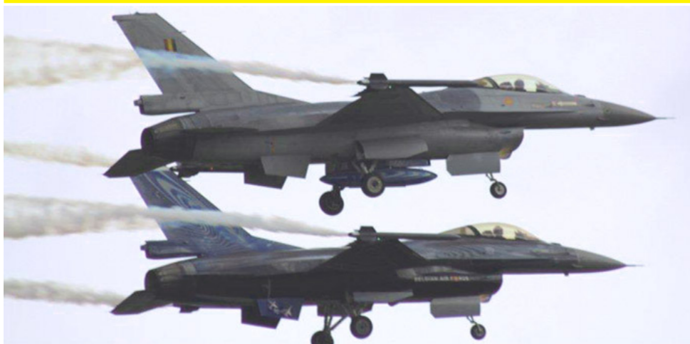
Belgium Air Force F-16s, FA.82 and FA.110 displaying at LBIA, 17/10/11(David Senior)