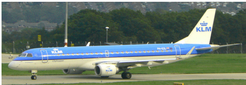
KLM Embraer 190 PH-EZL arriving from Amsterdam in place of the Fokker 70, 16/9

GENERAL AVIATION:- R.44 G-PIXX (Newsflight 01) from Denham(1102) to Hawes(1226), from Fishburn(1840) to Hawes(1909). PA-34 G-RVRB (Ravenair 34T) 2ILS and overshoots(1509/1529), f/t Liverpool. Sikorsky S.76C G-WIWI of Air Harrods, from Bedale(1838) to Stansted(1906). 23/9 Friday SCHEDULES:- bmi:- Based G-RJXK Brussels x2. G-RXJ(1292/1291, 1298/1297). 1404/1403 canx, G-RJXL(1410/1409).