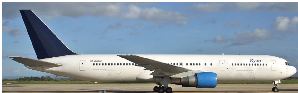
Ryan International Boeing 767 N736BK park on the Teesside Ramp on 13/9

TEESSIDE(Durham Tees Valley)