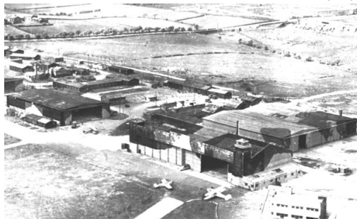
RAF Yeadon, believed to be in 1941, the AVRO factory is not finished and the workers bus station is empty(TS)