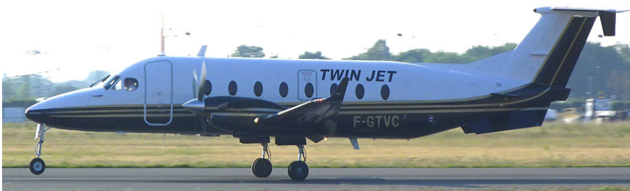
Beech 1900D of Twin Jet on a charter flight into Doncaster, 1/9(Clive Featherstone)

D-CAHB Lear Jet 40(Twin Star 126), ZZ418 Shadow(Widget 01, training) 22/9 CS-DNQ Falcon 2000(Fraction 297U), G-FRYL Premier 1(Manhattan 9K), CS-DXZ Citation XL(Fraction 6WC), G-CPRR Citation Sovereign(Go-jet 222M) 23/9 XV101 VC-10(Ascot 848, ILS), G-HAFT DA-42(Exam 93), G-CFVO King Air 200 24/9 N761JU Cessna T.210M(n/s), G-EGLS PA-28, G-MEGN King Air 200 25/9 D-CAPB Citation XL, G-XBLU Citation Sovereign(Donnair 40) 26/9 N144PK Gulfstream 4, G-WAIN Citation Bravo(XJC 200T), OE-HUB Citation X 27/9 G-DOSB DA-42, G-EZEW A.319(Easy 8042, training), PH-ATM King Air 200(Air Test) 28/9 G-EZEC A.319(Easy 8040, training), G-VIPW PA-31(Prestige 07T, training) 29/9 G-FBEH Embraer 190(Jersey 025T, training), G-LFPT Citation Mustang(Ambition 98T) 30/9 N363MU Citationjet, ZJ707 Bell 412(Shawbury 91, ILS), OY-SUN Cessna 402B