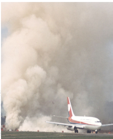
Dan Air Boeing 737/200 creating a dust storm when running up for take off on 14 prior to the opening of the runway extension in 1984(TS)