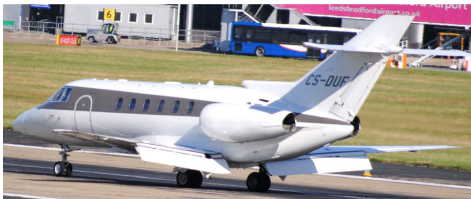
Netjets Hawker 750XP CS-DUF preparing for departure to Bern, 27/9

GENERAL AVIATION:- PA-28 Archer G-DIXY from Fowlmere(1147) to Deauville(1421). Twin Squirrel G-ORDH from Bagby(1830) to Nun Monkton(1859).