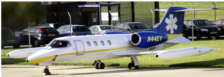
LearJet 35A N44EV arrived from Orlando on an Ambulance flight,15/9(Mike Storey)

MILITARY:- Tucano ZF293 (LOP 80) ILS and overshoot(1109), f/t Linton. Tucano ZF342 (LOP 21) ILS and overshoot(1518) f/t Linton.