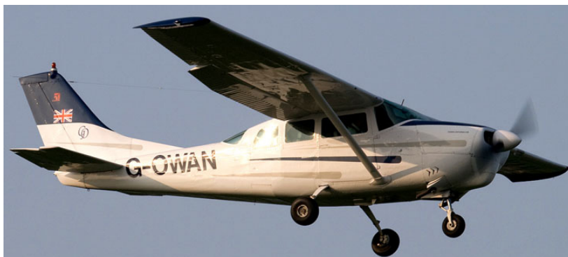
Cessna 210D G-OWAN has moved from its farm strip near Clitheroe to once again overwinter with Multiflight

MILITARY:- Tucano ZF239 (LOP 84) ILS and overshoot(1126) f/t Linton.