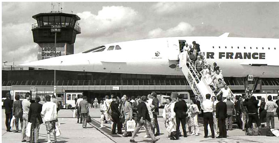
Iconic shot of passengers disembarking from the first Concorde, F-BTSD to land at LBA

The remainder of the magazine this month is dedicated to looking back of some of the sights from what is now Leeds Bradford International Airport, from the archives of Terry Sykes and Colin Addison.