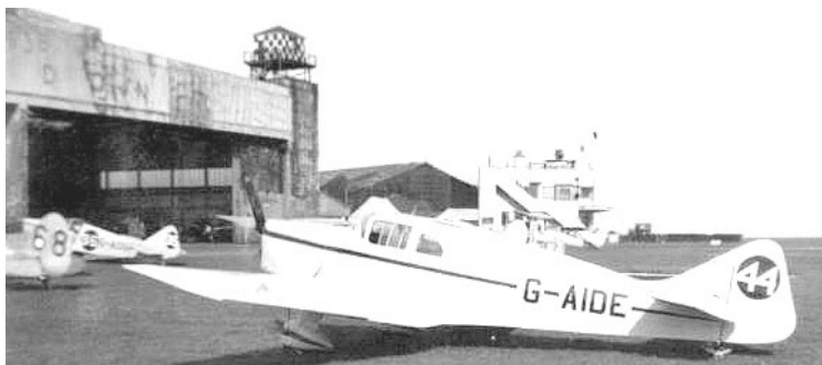
Entrants for the National Air Races held at Yeadon over the Whit Holiday in 1956 Miles Monarch G-AIDE is seen in the foreground (TS)