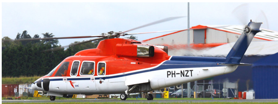
S.76B PH-NZT of Schreiner Northsea operating at Humberside in September

Yeadon Dam was cordoned off in the early hours of the morning so that environment officials could kill a flock of geese, the YEP reports. Around 10 Canada Geese were killed at Yeadon Dam after officers from the Food and Environment Research Agency shot the flock on the orders of the airport. A joint statement from FERA, the airport and Leeds City Council said that the birds were killed because they posed 'a significant risk to the aircraft'. But local residents are upset about incident, which came under the cover of darkness and with no warning, and have even put RIP posters around the area. They say that geese have always been regular visitors to Yeadon Tarn and they have not been aware of any shootings in the past.