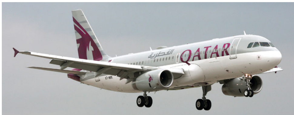
Qatar Amiri Flight Airbus A.320 A7-MBK on finals for Runway 14, 3/9

GENERAL AVIATION:- Malibu Mirage N921GG f/t Liverpool(1135/1245), arrived to collect SR.20 N203CD which had been in Multiflight Engineering since last month and followed it home to Liverpool at 1240. Another Cirrus which had been on maintenance, SR.22 N590CD returned home to Sherburn at 1241.