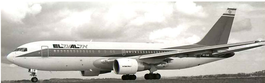
El Al operated a series of charters to Tel Aviv in the 80's here Boeing 767 4X-EAB taxis into the 14 loop. LBA was also number 1 diversion airfield for the company.