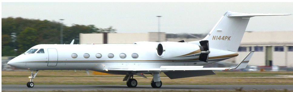
Gulfstream 4 N144PK touching down at Doncaster, 26/9(Clive Featherstone)