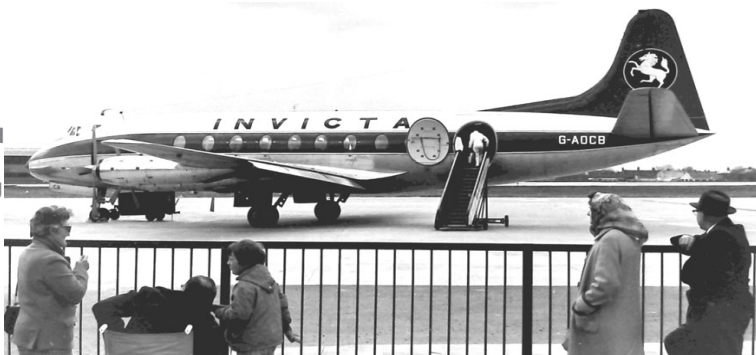
Invicta Viscount 700 G-AOCB parked on Stand 3 by the short lived viewing area between the Terminal building and the fire station in the 1970s