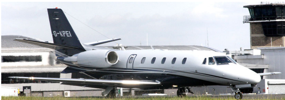
Seen arriving from its base at Belfast, Citation XL G-KPEI on 14/9

GENERAL AVIATION:- Cessna F.172P G-SBAE f/t Blackpool(1155/1443). Hughes 369E G-RAPD f/t Shelf(1211/1314), from Bolton Abbey(1651) to Shelf(1655). PA-34 G-VVBK (Ravenair 47T) ILS and overshoot(1515), f/t Liverpool. Cessna 421C G-SVIP from Shoreham(1617) to Biggin Hill(1754).