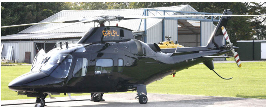
Agusta A.109E G-PLPL visited Coney Park twice on 10/9(Mike Storey)

1/9 G-DPJR Sikorsky S.76B 1845 1855 from Battersea to Westdale 4/9 G-WOFM Agusta A.109E 1600 1610 from Oxford to North Yorkshire 6/9 G-IOOZ Agusta A.109S 1205 1220 from Burnham to Archerfield 7/9 G-PWIT Long Ranger 1745 1755 from North Yorks Moors to Gloucester 10/9 G-PLPL Agusta A.109E 1200 1210 from Battersea to Penrith, return 1610/1620 11/9 G-BSCE R.22B 1245 1310 f/t Humberside 13/9 G-OASP Twin Squirrel 1755 1805 from Pembrokeshire to Battersea 15/9 G-MCAN Agusta A.109S 1440 1500 from Liscard to Hawes 16/9 G-VONE Twin Squirrel 2020 1600 f/t Denham(night-stop) 17/9 G-CRST Agusta A.109E 1750 1815 f/t Redhill 20/9 G-OLCP Twin Squirrel 1435 1440 from Blackbushe to Middlesborough 23/9 G-MCAN Agusta A.109S 1155 1205 from Hawes to Liscard 23/9 G-BPRI Twin Squirrel 1830 1600 f/t Harrogate(night-stop) 26/9 YU-HES Gazelle 1145 1210 from Woodford to Middlesborough 29/9 G-PGGY R.44 1310 1345 from Redhill to Fenland 30/9 G-RAMY Jet Ranger 1425 1440 f/t Humberside