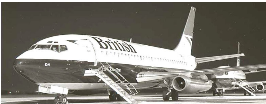
Two BA 737s(G-BGDN.G-BGJH) on diversion from Manchester parked on Stands 1 and 2