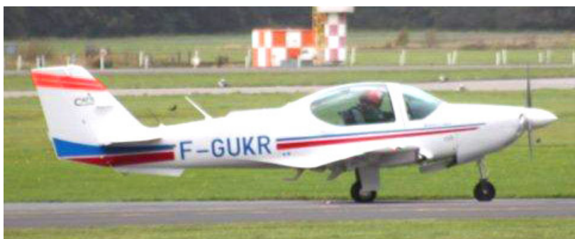
F-GUKR, one of a pair of Grob 120As visiting Linton, 3/10

Overflight:- Surprisingly plotting on planefinder on 9/9 was Czech microlight OK-QUA95. It was noted overhead Harewood at 1235 flying at 2000' heading 338 degrees at 91.5 knots, later landing at Fishburn.