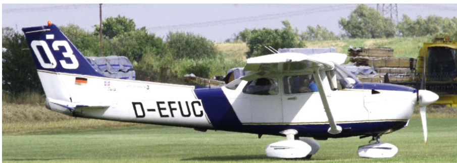
Cessna 172S D-EFUC is based at Brighton and is used for survey work(Mike Storey)