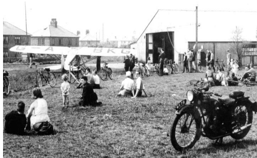
Watching the aircraft outside the club hangar by the Harrogate Road, believed to be in the summer of 1938, with Puss Moth G-ABKG(TS)