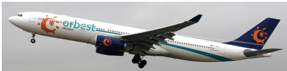
Orbest, formerly Iberworld, operated a charter to Calgary on 10/9 using A.330 EC-LEQ