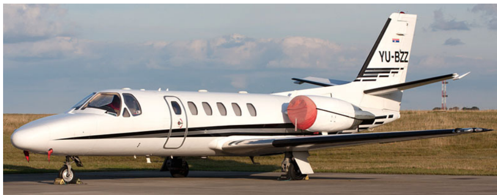
Citation Bravo, YU-BZZ operated by Air Pink parked on Multiflight/East, 22/9

GENERAL AVIATION:- King Air 350 G-KLNB (Saxonair 35A) from Norwich(1517) to Heathrow(1604).