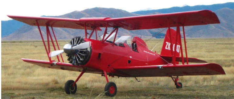
ZK-CAT Grumman Ag-Cat converted for passenger carrying