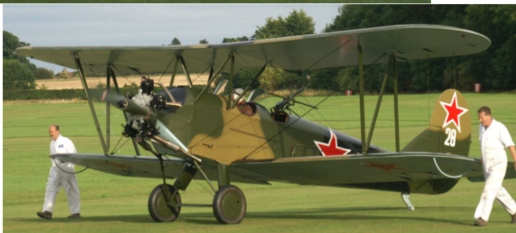
28 Polikarpov PO-2