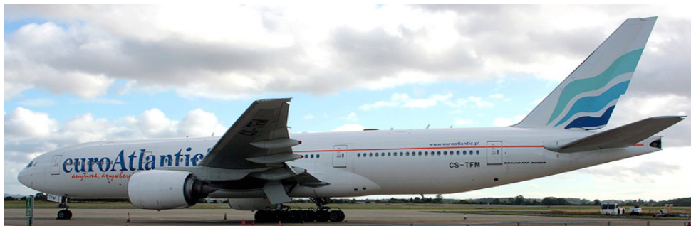
Euro Atlantic Boeing 777 CS-TFM parked at Teesside inbetween trooping flights

SUTTON BANK:- A new resident is G-CHKH ASW28. Noted arriving from Netherthorpe on 6/9 was Tiger Moth G-APAP/R5136.