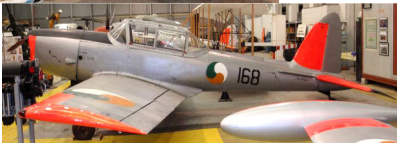
168 DHC-1 Chipmunk T20