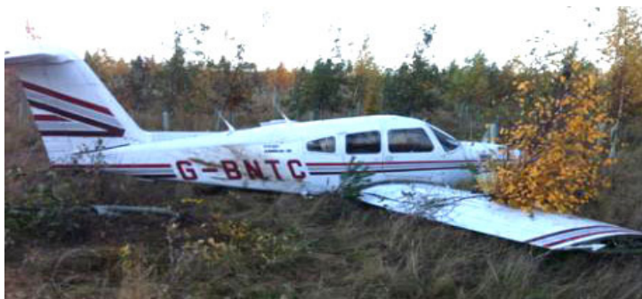
PA-28RT Arrow G-BNTC came down in a field while inbound to Sherburn from Cranfield on 3/11. Although the aircraft was badly damaged both occupants were not badly injured.