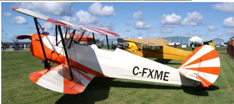
C-FXME Stampe SV-4C