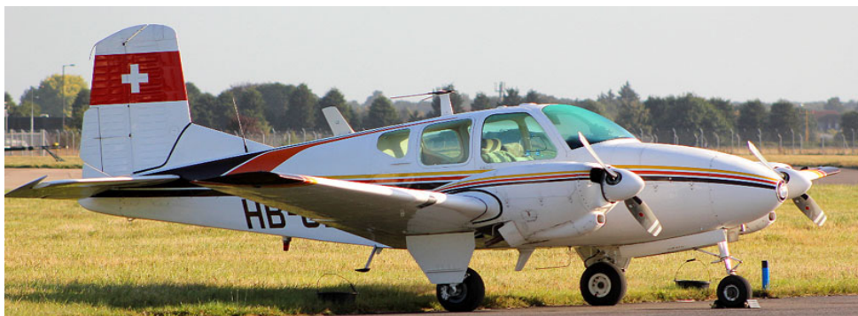
Vintage Beech 95 Travel Air HB-GBL parked on the apron at Doncaster

6th PH-HHJ AS-355F2 Twin Squirrel (Ecureuil 2) Heli Holland, came in with stable-mate below with an engine problem & went into Kinch (FV) (H) 6th PH-ECZ Eurocopter EC-130B Heli Holland (H) second visit 7th D-CKHG Citation 560XLS Windrose Air Charter 7th VP-CGA Dassault Falcon 2000 VW Air Service (FV) 11th N600PB Embraer 500 Phenom 100. 600PB LLC, Wilmington DE (FV) 13th D-IRAR Beech 200 King Air (FV) 13th CS-DMX Beechjet 400 (FV) 13th N255RB Hawker Siddeley 125B Hawker 800 (FV) 13th CS-DFV Citation 560XL (FV) 14th HB-JFD Citation 750X (T) 15th G-NOAH Airbus A-319-CJ Acropolis Aviation (FV) 15th CS-DTM Learjet 45 MasterJet (FV) 15th G-PACO Sikorsky S-76C Cardinal Helicopter Services (IOM) Ltd (FV) 15thG-WIWI Sikorsky S-76 Air Harrods 15th CS-DXF Citation 560XLS Netjets Europe Ltd 15th M-ARIE Pilatus PC-12 Guernsey PC-12 Ltd 16th M-ARCH Citation 750X Archilda International 17th G-GDEZ BAe-125-1000B Frewton Ltd 17th HZ-BL1 CitationJet 525 CJ1 departed from Kinch after (M) 18th G-EMHC Agusta A-109 Looporder/East Mids Helicopters (H) 19th G-HARK Challenger CL-604 (T) 20th G-DCAM AS-355 Twin Squirrel/Ecureuil II Cameron Charters LLP (FV) (H) 21st G-IFTF BAe 125-800B HS-125 Albion Aviation Management Ltd 21st EC-KPE Citation 560XLS Corporatejets XXI 22nd M-ISLE Citation 680 Sovereign (FV) 27th N463RD Socata TBM850 (FV) 29th OO-AAC CitationJet 525 CJ2+ Air Service Liege (FV)