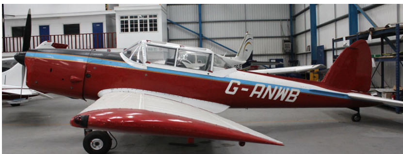
G-ANWB Chipmunk 21 of Westair