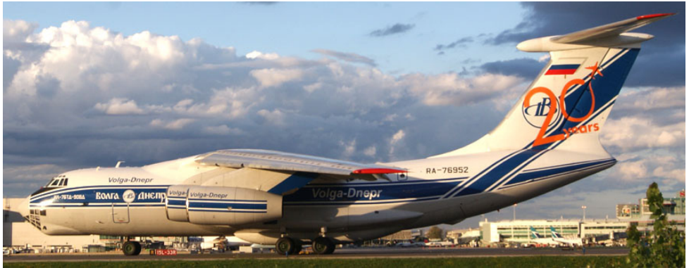
RA-76952 Ilyushin IL-76TD of Volga-Dnepr Airlines at Toronto on 18/08/12