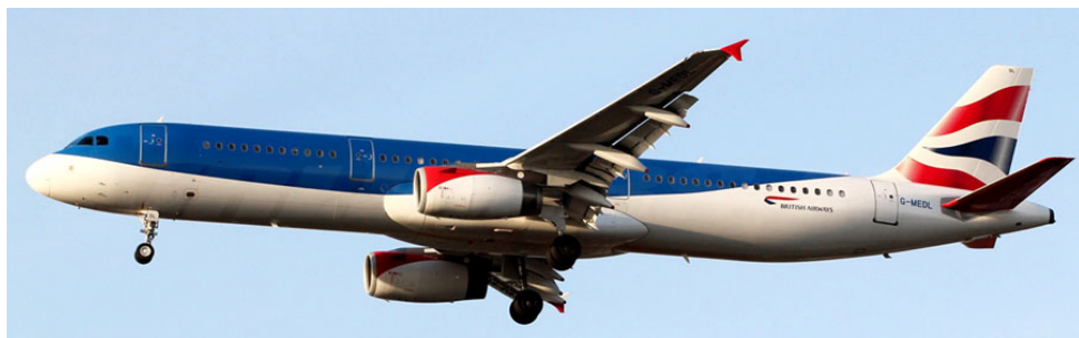
British Airways A.321 G-MEDL is currently flying in a hybrid BA colour scheme

These will be replaced by seven B738s ( G-TAWK to TAWR ) by next summer & also by the first three or four B788s of the eight on order ( G-TUIA to TUID plus 4)