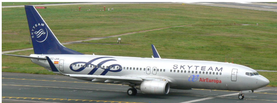
Air Europa, 737/800 EC-JHK in Skyteam colours, operating into LBIA during the summer