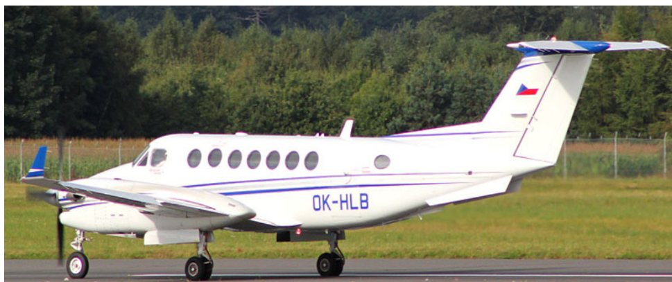
Czech, King Air 350 OK-HLB of Aerotaxi arriving at Doncaster, 4/9

DEVONSHIRE ARMS:- R.44s G-CEKA and G-YRKS were present on 14/10.