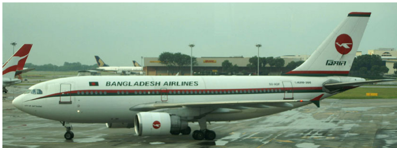
S2-ADF Airbus A.310 Bangladesh Airlines

Some pictures from the travels of Ken Cothliff. The first two were taken on his trip to the Southern hemisphere, the first at Sydeny and the second at a strip near Omarama, South Island, New Zealand. The second two shots are of course from the Shuttleworth Collection, Old Warden.