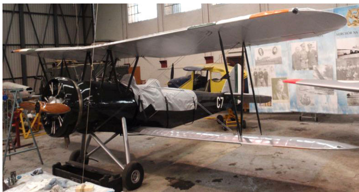
C7 Avro Cadet