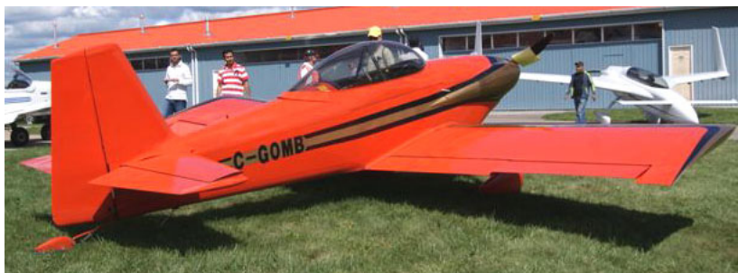
C-GOMB Vans RV-4