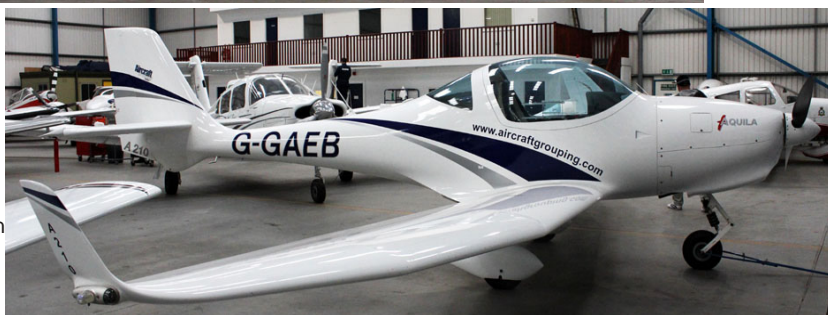
G-GAEB Aquila O1 owned by Stamp Aviation of IOM