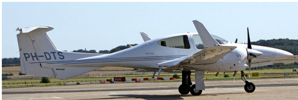
Diamond DA-42 Twin Star PH-DTS parked at Humberside, 9/9(Clive Featherstone)

HUSTHWAITE:- The residency of G-BZUH Rans S.6 was short lived with it now moving to Bagby.