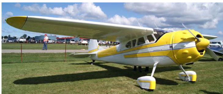
CF-LEQ Cessna 195B Airmaster