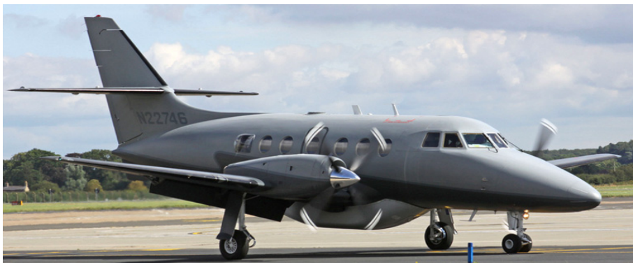
Jetstream 32 N22746 arriving at Humberside on 2/9. The aircraft, which is owned by Sky Research Inc of Oregon, left its home base of Ashland Municipal four days earlier and had routed via Canada and Iceland.