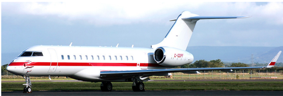
Operated by IMP Group, Global Express C-GDPF is seen here on the apron at Teesside, 21/9

WADDINGTON:- Updating the August mag Netherthorpe resident G-AYEC CP.301A made a forced landing and overturned in a field near the A607 road at Coleby on 18.8 due to engine problems shortly after take off from Waddington.