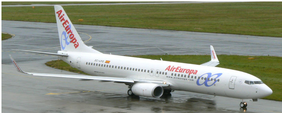
Delivered in April this year, 737/800 EC-LPQ of Air Europa made its first visit on 25/9

MILITARY:- Islander ZH536 (Ascot 7949) again dropped in for fuel(0955/1209) while on operations in the area, f/t Waddington.