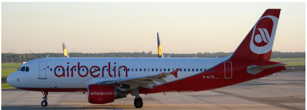
D-ALTE Airbus A.320 of Air Berlin at Dusseldorf, 10/10/12(Martin Zapletal)