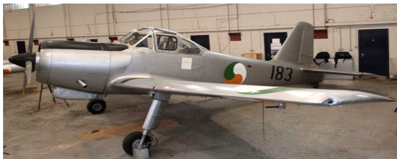
183 Percival Provost