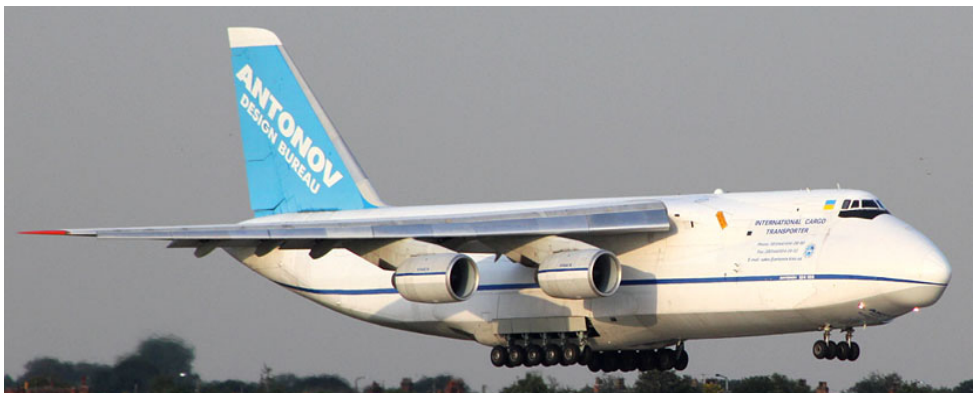
UR-82073 AN-124 Ruslan of Antonov Airlines, touching down at Doncaster(Clive Featherstone)