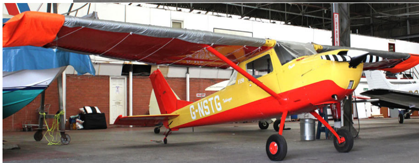
G-NSTG Cessna F.150F formerly G-ATNI