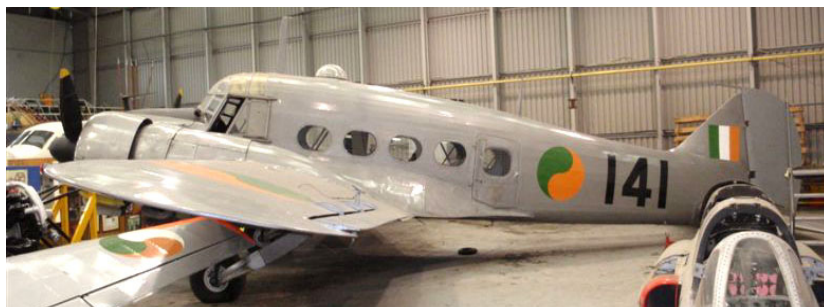
141 Avro Anson 19