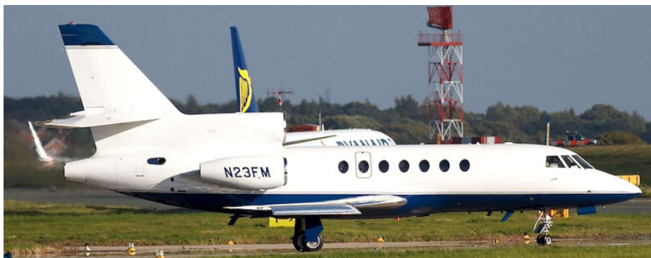
Based at Danbury, Connecticut Falcon 50 N23FM visited on 14/9(David Blaker)

GENERAL AVIATION:- Cirrus SR.22 G-VBCA f/t Bagby(0954/1243). Beech F.33 N26RT f/t Top Farm(1619/1650).