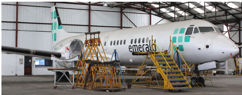
G-JEMA BAe ATP currently registered to PTB (Emerald) Ltd.