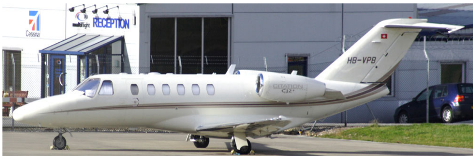
Citationjet 3 HB-VPB parked on Multiflight/East at the end of the month

EXECUTIVE JETS:- Citationjet 2 D-CJET (Air Hamburg 254A/261H) from Nice(1033), n/s to Le Bourget(1505). Phenom G-CGNP (Flairjet 211A/212A) f/t Dublin(1349/1642). Citationjet 2 G-OCJZ (Clifton(972/941) from Farnborough(1502), n/s to Geneva(0932). Citation Mustang G-SSLM (Blink 9J) on its first visit, from Genoa(1656) to Blackbushe(1738).