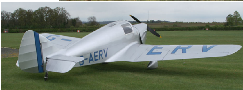
G-AERV Miles Whitney Straight