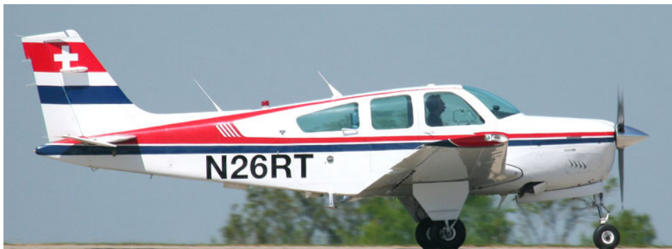
Showing signs of its previous Swiss ownership, Beech 36 N26RT visited on 13/9

MILITARY:- BN-2T Defender ZH004 (Armyair 585) from Belfast International(0838), t/f Doncaster(0939/1259) as "Exam 02", then back to Belfast International(1353).