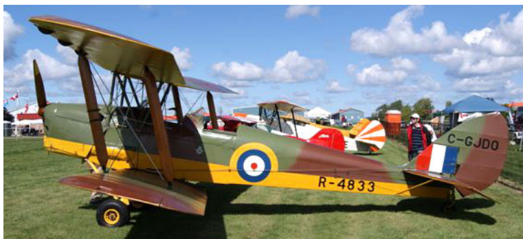
C-GJDO Tiger Moth

On 9/9 our Canada correspondent Ian Morton visited the open day and took the following shots.