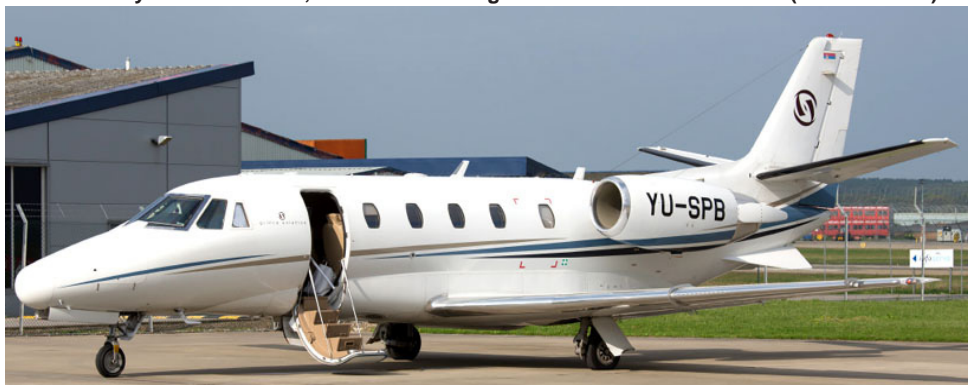
Citation XL YU-SPB of Prince Aviation arrived from Malta on 21/9(Robert Burke)