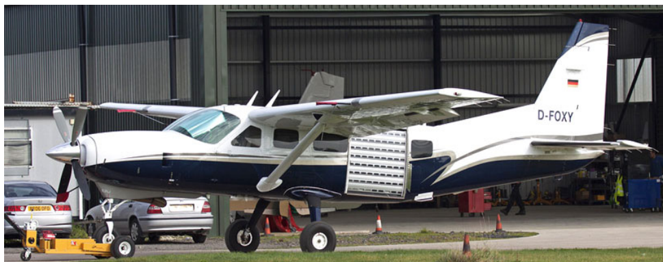
Cessna 208B D-FOXY is a new resident at Hibaldstow for parachuting(Rich Grimley)

SCAMPTON:- New with the Museum here is the nose and forward fuselage reconstruction of KB976 Lancaster 10AR which arrived on 18.8 by road from Brooklands.