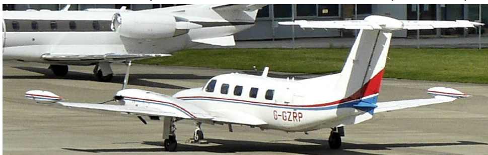
Operated by Air Medical of Oxford, PA-42 G-GZRP is a regular at LBIA