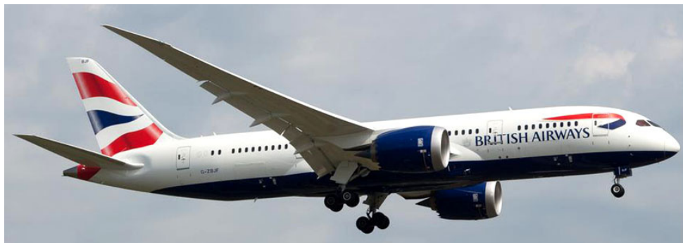
British Airways Boeing 787 Dreamliner on finals for 14, crew training 3/9(Matty Barker)

Additional flights:-1/9 G-MAJI positioned out to Aberdeen(017P).