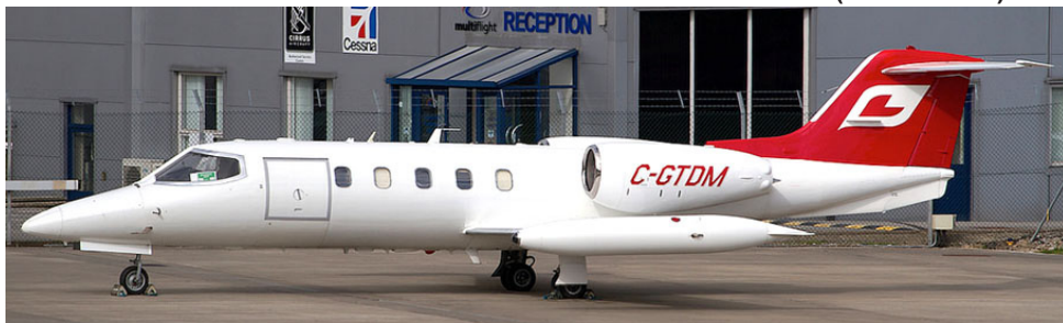
Lear Jet 35A C-GTDM of Fox Flight arrived on an ambulance flight on 28/9(David Blaker)