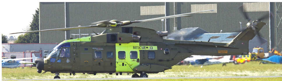
Danish Air Force Merlin M-513 visited twice during the month for refuels, 8/9 and 13/9