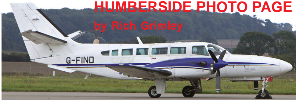
East Midlands based Cessna F406 G-FIND, used on survey work, visiting on 2/9