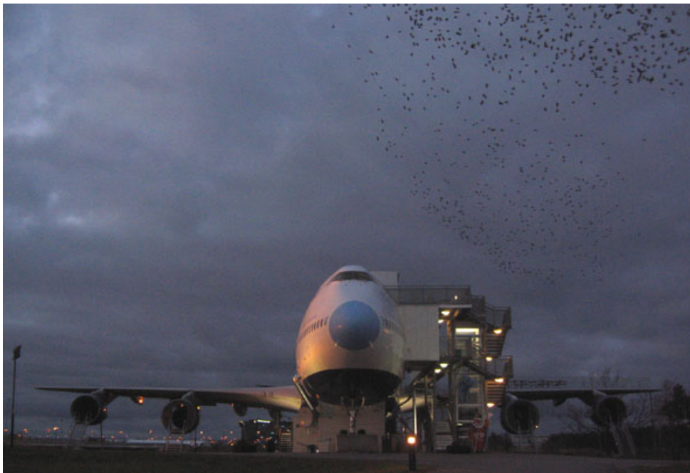
"Jumbo Hotel"(3D-NEE) with swarming birds, Stockholm 29/09/14(Martin Zapletal)