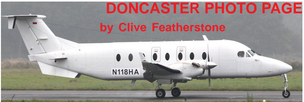
Beech 1900D N118HA arriving on 19/9, on ferry flight from Montenegro to the USA