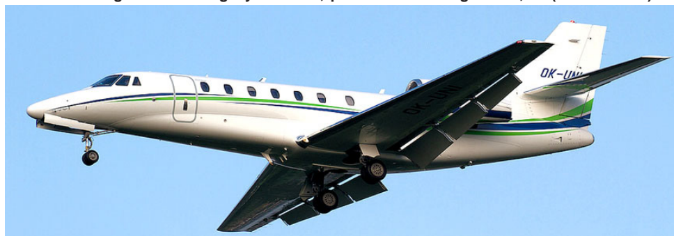
Owned by Travel Service, Citation Sovereign OK-UNI on finals for 21/9(David Blaker)