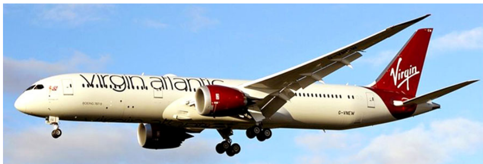
Virgin Atlantic has taken delivery of their first Boeing 787 G-VNEW. The aircraft has been crew training at several UK airports, sadly not LBIA(As yet!)