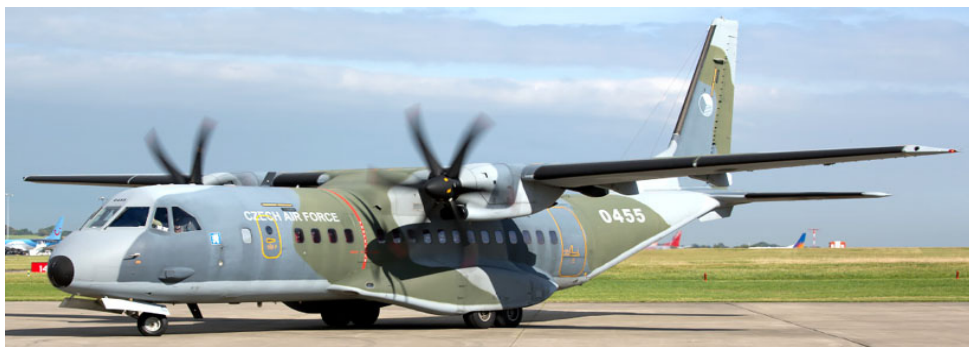
Czech Air Force CASA.285 0455 taxiing on Multiflight/East, 28/9(Robert Burke)