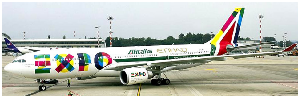
Alitalia and Etihad have painted two of their A.330s in special scheme to promote their sponsorship of EXPO 2015 in Mialn next year. EI-EJM of Alitalia above and A6-EYH if Etihad below

Wizz Air , has confirmed it will slightly modify its existing model by introducing a second aircraft type to its fleet. While maintaining the one fleet family concept, the budget carrier has confirmed it will switch 26 of its outstanding orders for the A320, for the larger A321 variant. According to Wizz Air the larger capacity will enable the carrier to "accommodate its ongoing route network expansion" and maintain "low ticket prices". As part of its 'Go East' strategy Wizz Air has recently expanded its network into countries such as Israel, Azerbaijan, UAE and Russia and the larger A321s are expected to fly on some of these new routes, while also enabling capacity to be increased on some trunk routes within Europe.