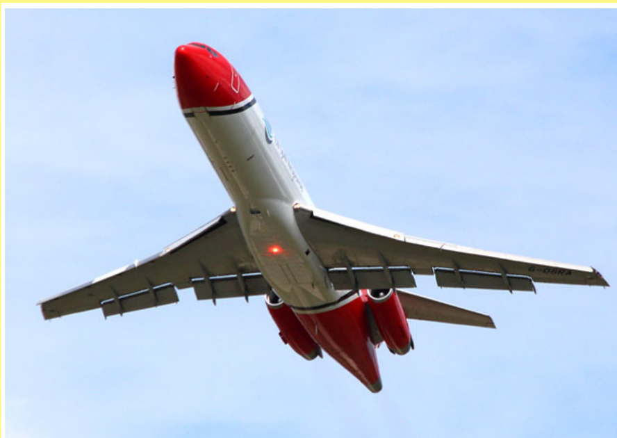
G-OSRA Boeing 727/200 of T2 Aviation departing Doncaster, 18/09/14 Clive Featherstone