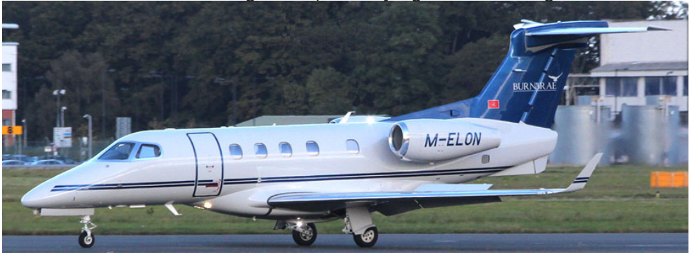
Phenom M-ELON of Burnbrae Av, the second aircraft to carry this registration, on 26/9