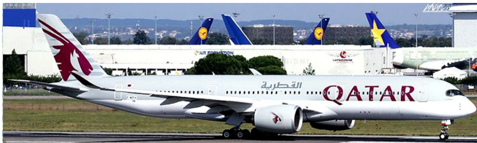
The first Airbus A.350 for launch company QATAR, A7-ALA, still test flying as F-WZFA

As we close for press unconfirmed reports are suggesting SAS are not accepting bookings for the LBIA to Copenhagen service from December 1st, and from this date the service will cease