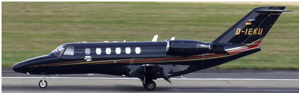
Striking Citationjet 2 D-IEKU of Star Wings visited twice during the month

Dauphin EI-GJL f/t Braggenstown(0807/1531). Citationjet 2 G-OCJZ (Clifton 9) f/t Bristol(1011/1407). Twin Squirrel G-TAKE (Arena 25) from Redhill(1219) to Dundee(1339). Cessna 441 EI-DMG from Luton(1241) to Waterford(1621). PA-28RT Arrow G-SKYV f/t Ronaldsway(1405/1629), n/s. Making its first visit, Gulfstream 5 N1040 owned by Cox Enterprises of Atlanta, Georgia, from East Midlands(1411), n/s to Keflavik(0711). Lear Jet 35A G-ZMED (Air Med 076) from Palma(1436) to Oxford(1707). Extra 500 D-FBRS f/t Aberdeen(1511/1826). PA-31 Chieftain OY-CKR f/t Roskilde(1831/1412), n/s until 11/9.