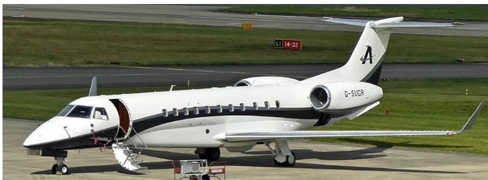
Sir Alan Sugar's latest Legacy G-SUGR, parked on Multiflight/East, 7/9(Rod Hudson)