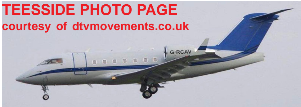
Challenger G-RCAV of Hangar 8 arriving on a murky morning, 9/9