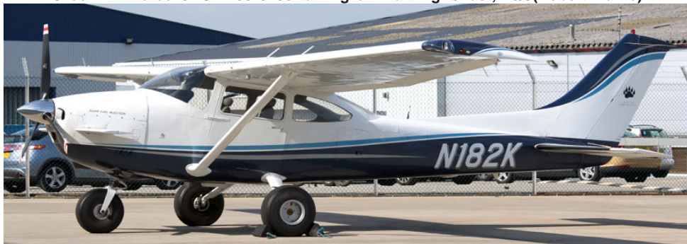
IOM based, highly modified, Cessna 182Q N182K arrived on 8/9(Robert Burke)