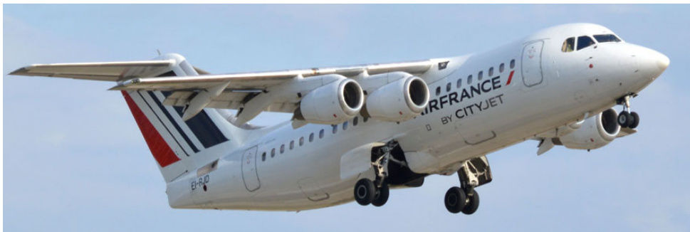
RJ-85 EI-RJD of City Jet departing London City on 04/06/14(Andrew Barker)