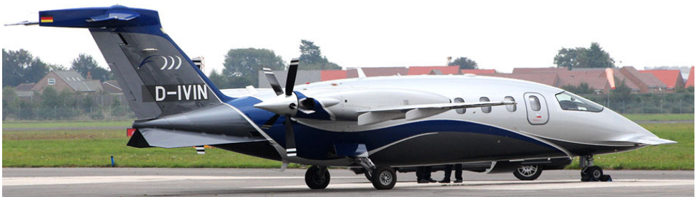
The distinctive shaoe of Avanti D-IVIN owned by Airgo, parked on the apron on 13/9