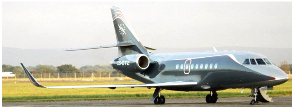
Colourful Falcon 2000 CS-DTZ owned by Masterjet, parked on the apron, 2/9