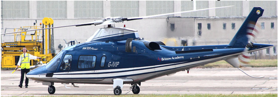
Agusta A.109E G-IVIP operated by Castle Air being marshalled on stand on 13/9