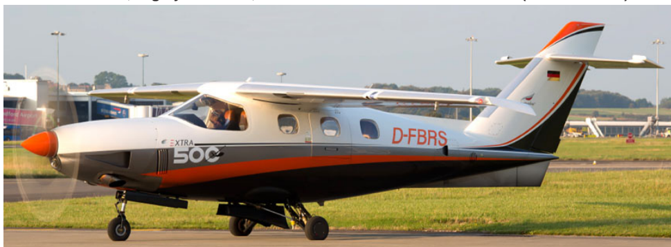
The rather unusual shape of Extra 500 D-FBRS which visited on 9/9(Robert Burke)