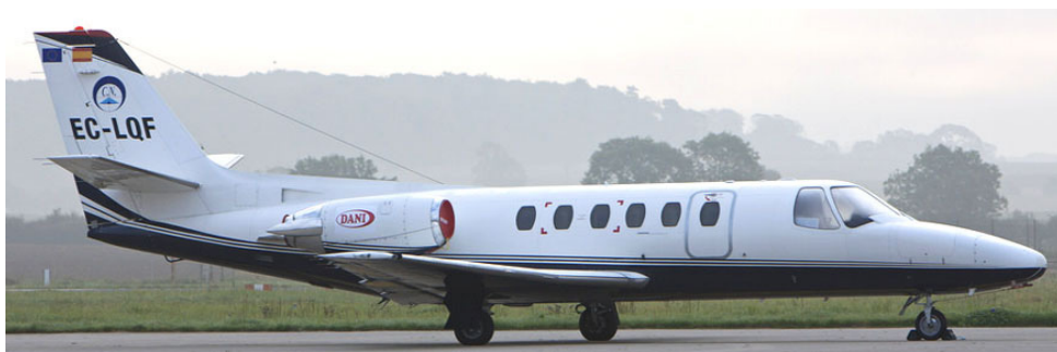
Operated by Clipper National Air, Citation 2/SP EC-LQF is seen arriving on 9/9