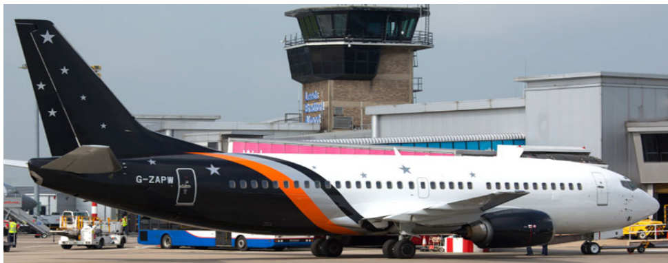
Boeing 737/300 G-ZAPW was also sub-chartered by Jet2 during the month Noted this aircraft is now painted in a new revised colour scheme(Robert Burke)