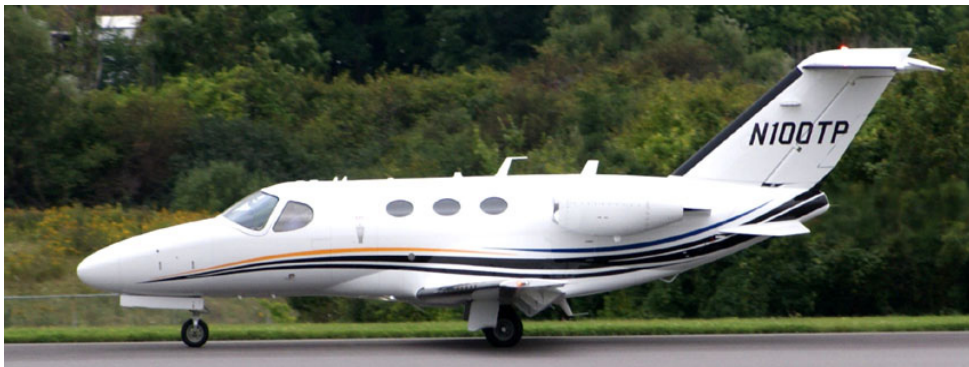
Citation Mustang N100TP of Tes Aviation at Toronto.Pearson, 11/09/14(Ian Morton)