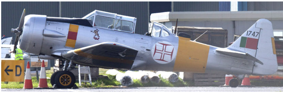
Harvard T6 G-BGPB(formerly FAP 1747) based at Duford, seen visiting on 30/9