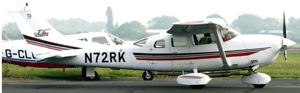
Cessna T.206H arrived 10/9, was based until the end of the month for local survey work