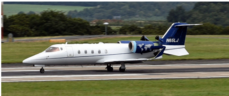
N85LJ Learjet 60 Rod Hudson

Hawker 800 XP CS-DRX arr 06:45 fr Le bourget as NJE548Y dep 08:59 to Bern as NJE418M, Learjet 60 N65LJ dep 14:15 to Belfast.