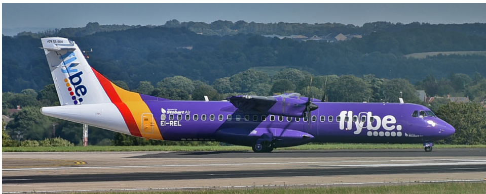
EI-REL ATR72-500 Flybe/Stobart Air - 28 August 2015 (Rod Hudson)