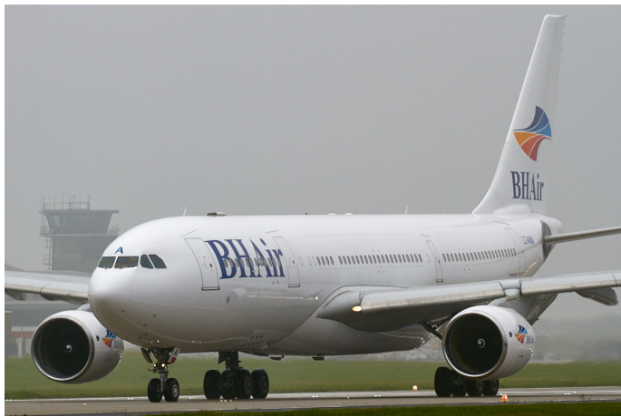
LZ-AWA Airbus A330-200 BH Air 12 September 2015 (David Blaker)

Innsbruck "2587/2588":-5/9 OE-LGF, 12/9 OE-LGK, 19/9 OE-LGA, 26/9 OE-LGA.