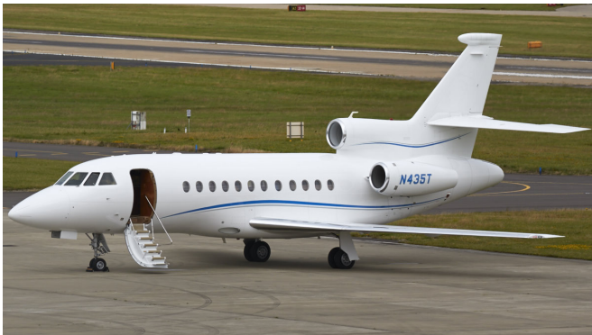
N435T Dassault Falcon 900EX David Blaker

Cessna 560XLS OE-GWV f/t Zurich (07:24/18:05), Cessna 560XLS CS-DXF arr 08:05 fr Nice as NJE131D n/s, Falcon 900EX N435T arr 10:55 fr Zurich dep 14:37 to Dusseldorf, Cessna 560XLS excel D-CXLS arr 12:07 fr Nice dep 13:18 to Bristol, Eurocopter EC135 G-HOLM arr 15:25 dep 16:11 to Oxford,