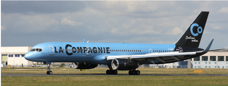
F-HCIE Boeing 757

3rd EI-REM A.T.R. 72 Aer Lingus Regional/Stobart Air