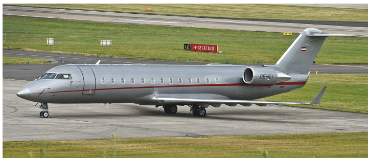
OE-ILI Challenger 850 Rod Hudson

Learjet 35 G-JMED dep 07:55 to Oxford, Cirrus SR22 N989PS arr 10:11 fr Elstree, Eurocopter EC120B G-SKPP arr 11:54 dep 12:25, Learjet 60 LX-TWO arr 14:27 fr Budapest dep 16:51 to Luxembourg, Challenger 850 OE-ILI dep 15:38 to Olbia (Italy), Learjet 45 G-XJET arr 16:58 fr Tenerife dep 18:23 to Southampton.