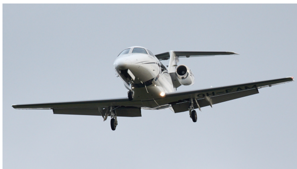
9H-FAM Phenom 100 David Blaker

Piper PA-28 G-EGLS arr 08:11 dep 15:13, Cirrus SR22 N950CD arr 10:05 fr Sherburn n/s, Grob G115 G-CGKB f/t Cranwell (10:42/13:17), Beech C90 Kingair G-MOSJ arr 13:53 fr Southend dep 16:46 to Northolt, Cessna 550 Citation G-FIRM f/t Dublin (14:59/20:21), Phenom 100 9H-FAM arr 15:53 fr Dundee n/s, Bagby based Aerospatiale AS355N G-ORDH arr 16:54 dep 17:31,