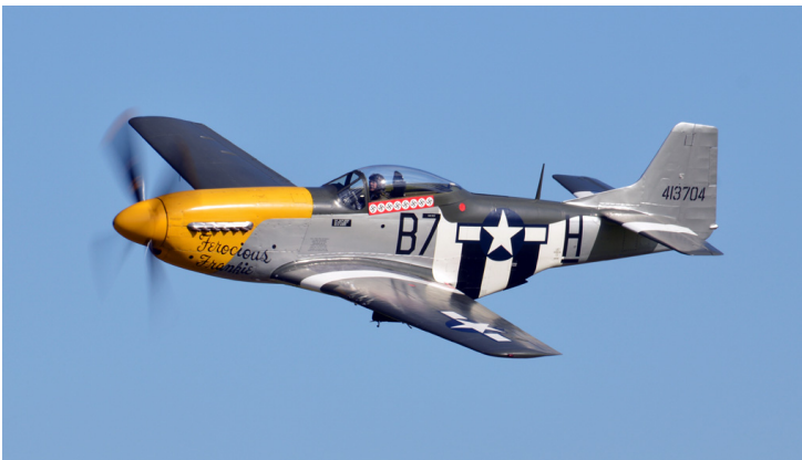
G-BTCD 44-13704 'Ferocious Frankie' North American P-51D Mustang USAAF