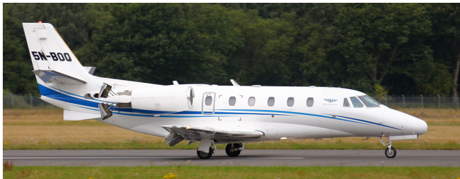
5N-BQQ Citation 560XLS