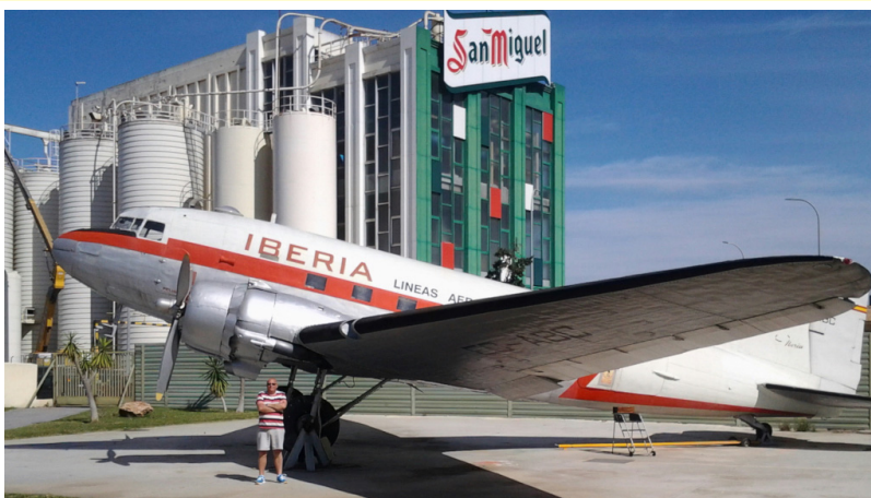
EC-ABC Douglas DC3 Iberia Malaga Aero Museum 21/04/15