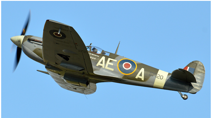
EP120/G-LFVB Spitfire LF MkVb The Fighter Collection(Steve Procter)