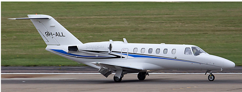
9H-ALL Citation CJ2 Stewart Robertshaw

Eurocopter EC135 G-MSPT arr 07:04 fr Oxford dep 07:28 possibly to its base at Davenby Hall (Cumbria), BN-2T Defender ZF573 f/t fr Waddington (07:42/09:32), Beech A36 Bonanza N715BC dep 08:26 to Sleep, Cessna 510 Citation Mustang G-FBLK arr 10:23 fr Blackbushe dep 11:36 to Geneva, Cessna 560XLS Citation Excel CS-DXK arr 11:31 fr Newquay as NJE355R dep 12:25 to Le Bourget as NJE180F, Linton based Tucano ZF489 did one overshoot at 14:33 c/s LOP05, Cessna 525A Citation CJ2 9H-ALL arr 15:48 fr Palma dep 17:04 to Biggin Hill,