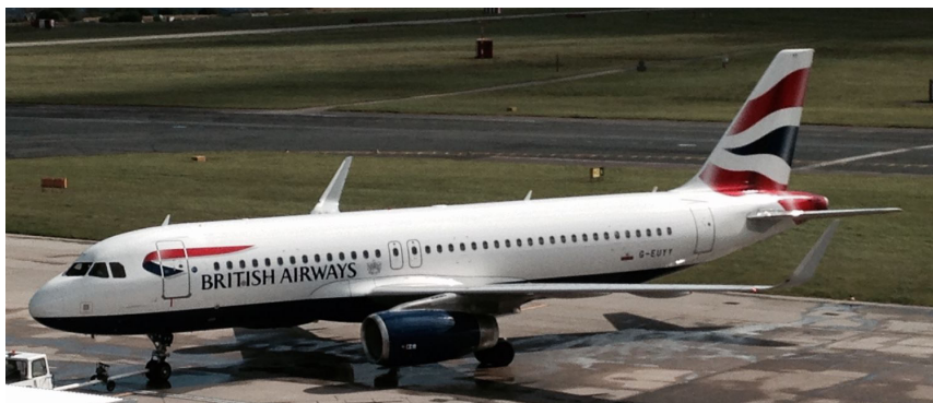
G-EUYY British Airways A320 LBA 28/08/15