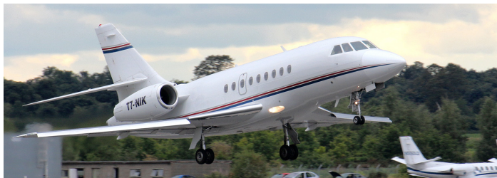
T7-NIK Falcon 2000

6th EI-FAU A.T.R. 72-600 Aer Lingus Regional/Stobart Air (FV)