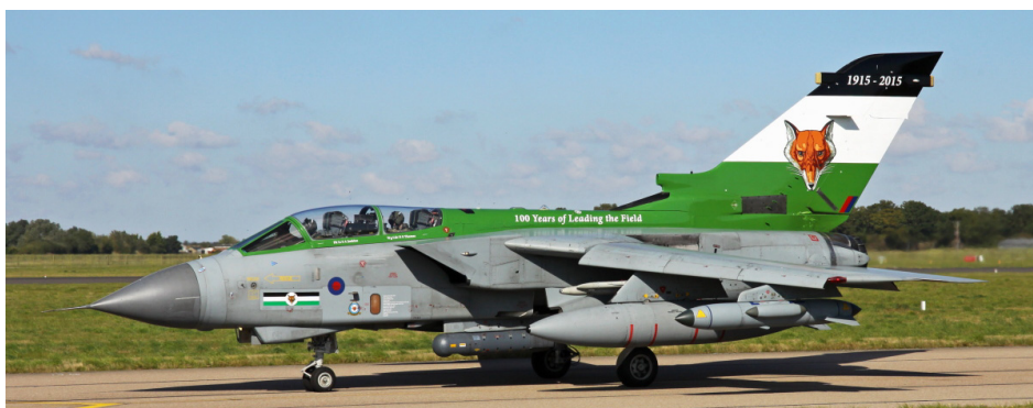
ZA405 Tornado GR4 (12 Sqn) RAF Coningsby 30/09/15 (Rich Grimley)