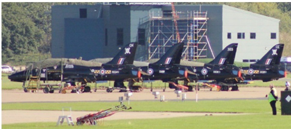
Hawks at Linton on 25th Sept: XX258 "CE", XX346 "CH" both above wearing 100 Squadron RAF (skull and checker board); XX191 no squadron marks and no code, XX303 "303" no squadron marks.