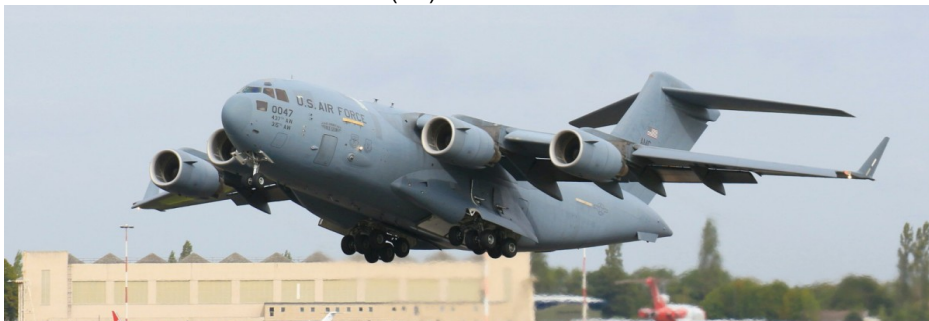
97-0047 C-17 Globemaster U.S.A.F. 04/09