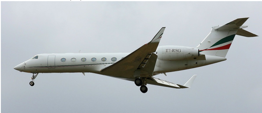
T7-RSG Amber Aviation (Hong Kong) Ltd Gulfstream V-SP (G550) 10/09