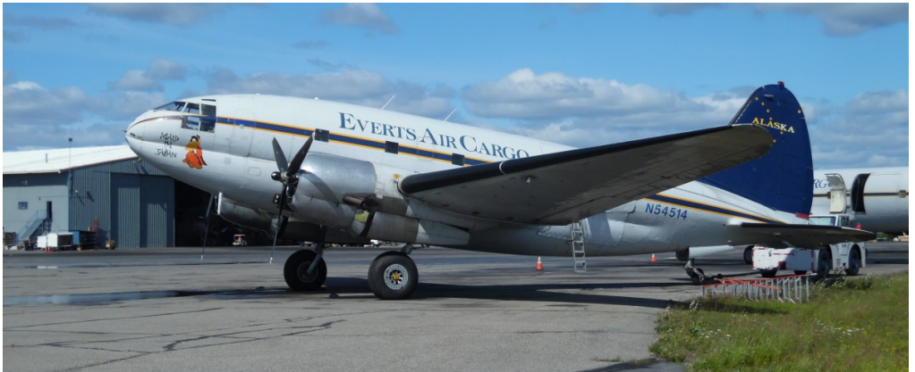
N54514 Everts Air Cargo Curtiss Commando