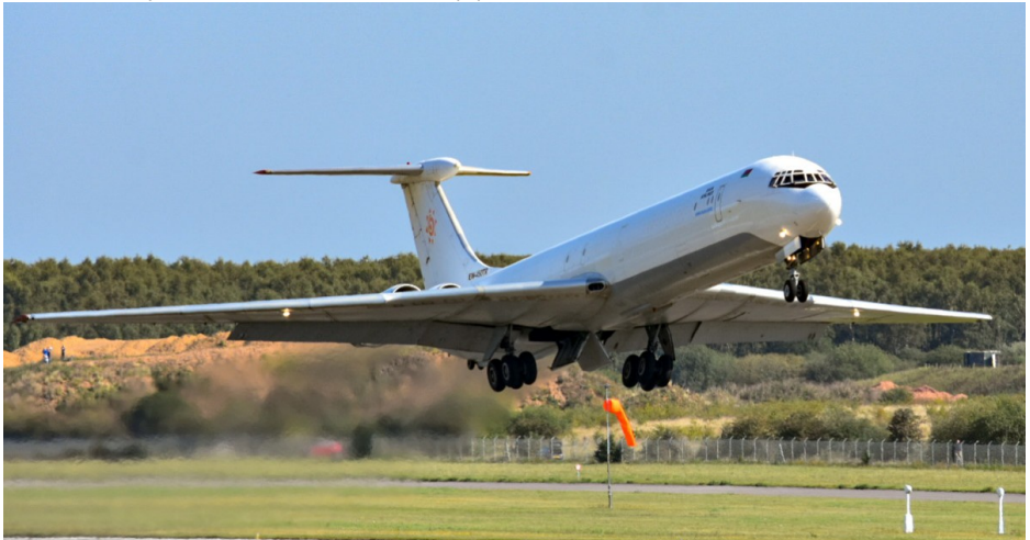
EW-450TR Ilyushin IL62 Rada Airlines 10/09 Claire Issott