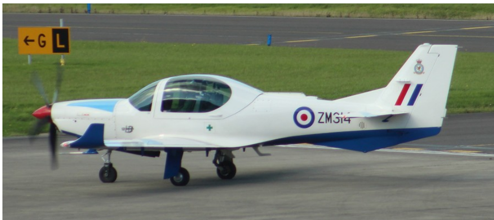
ZM314 Grob G120TP Prefect 09/09 Ian Gratton