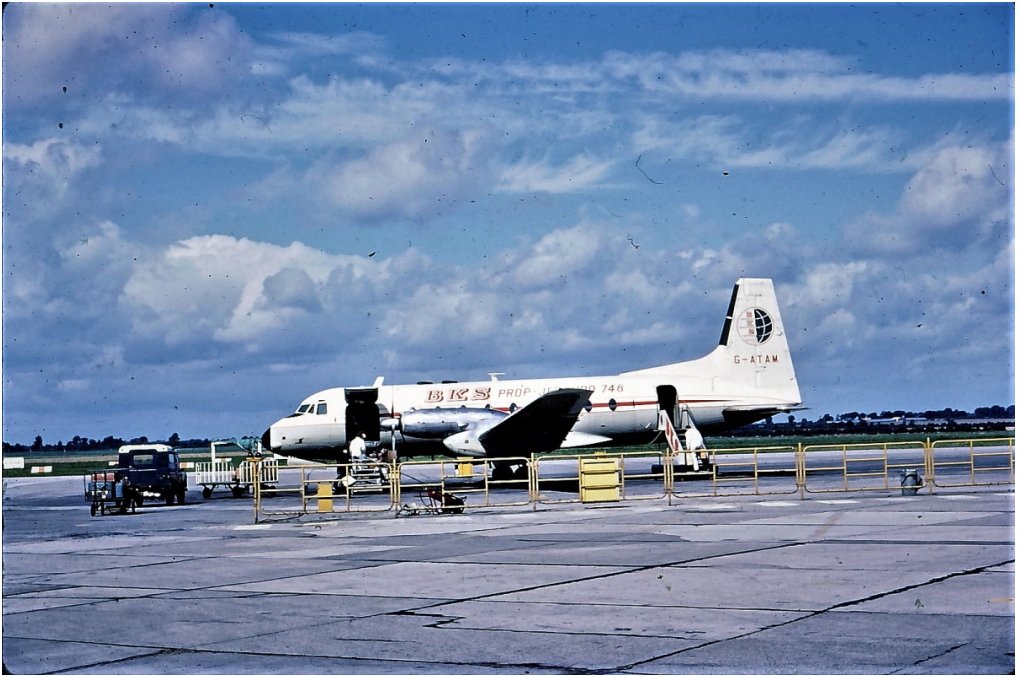
G-ATAM-AVRO 748 JOHN GIBBON