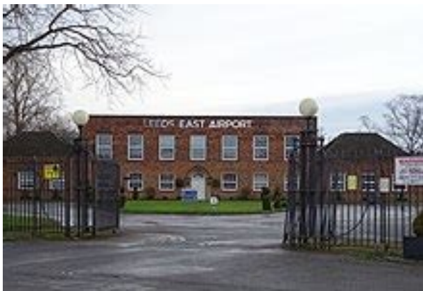
Main gate and entrance.

Access from the north is via Tadcaster and then south on the A.162, left onto the B.1223 towards Ulleskelf, where you turn right over the railway and continue down Busk Lane. Enter via the main gate and keep to the right past the old Guard Room and head for the barrier immediately ahead. Here you will need to stop to sign-in and be allowed through the barrier. We had phoned ahead and arranged arrival around 11 a.m. We just made it with the inevitable Leeds traffic gridlock and road works causing the usual challenges.