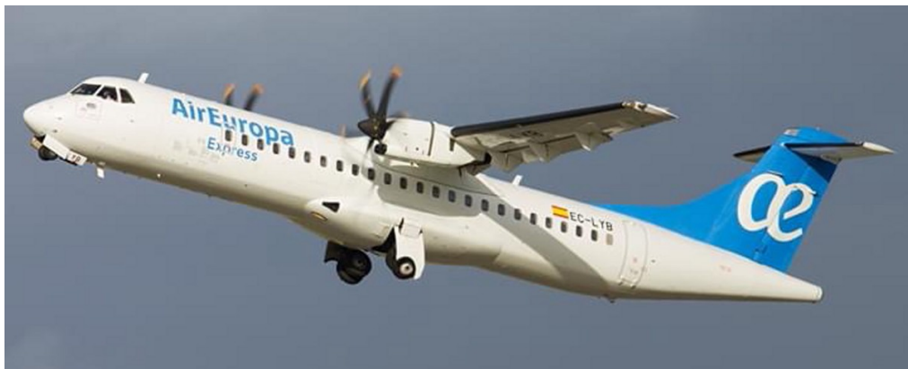
EC-LYB ATR 72-500 Air Europa Swiftair 05/09 Danny Jones

Swiftair (SWT/WT, "Swift") :-4/9 EC-LYB(651) operated charter in from Porto, 5/9 EC-LYB(661) operated charter back to Porto.