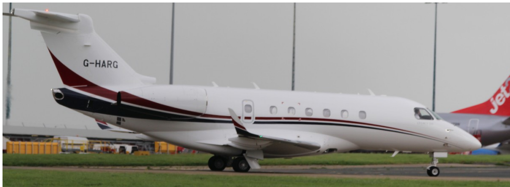
G-HARG EMB Legacy 500 04/09 Ian Gratton

Cessna 560 Excel CS-EJA dep 10:00 to Napoli, Falcon 2000EX CS-DLD dep 10:10 to Cologne, EMB Legacy 500 G-HARG arr 11:43 fr Palma dep 13:05 to Palma, Cessna 560 Excel SE-RIL arr 13:13 fr Manchester dep 14:08 to Jersey, Global 6000 CS-GLF arr 13:40 fr Zurich n/stop, BN-2B-20 ISLANDER G-SICA arr 14:00 fr Aberdeen n/stop, Challenger 350 CS-CHA arr 14:13 fr Ljubljana dep 19:02 to Stansted, Aero At-3 G-SACX overshoot at 15:28 fr Sherburn,