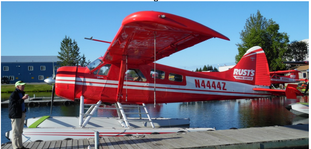
N4444Z De Havilland Canada DHC-2 Mk.I Beaver