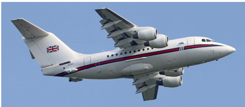
ZE701 Bae 146 CC2 18/09 Paul Whincup