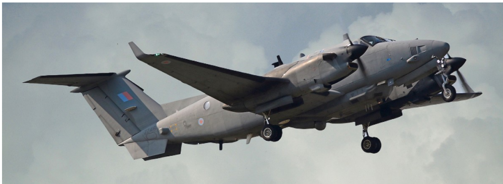
ZZ416 King Air at Waddington 15/09 visited LBA 12/09 Paul Whincup