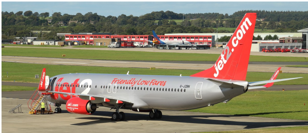
G-JZBN Boeing 737-800WL Jet2.com 09/09 Ian Gratton

Only positioning/test flights shown:-4/9 G-GDFN(050B) test flight, 5/9 G-GDFX(245) positioned out to Split, 8/9 G-JZBD(060J) positioned out to Edinburgh, 12/9 G-GDFZ(050B) test flight, 18/9 G-GDFT9050B) test flight, 18/9 G-GDFN(051B) test flight, 27/9 G-JZHT(051B) test flight, 28/9 G-DRTD(059B) test flight, G-GDFO(050B) test flight, 29/9 G-GDFN(031F) test flight to Dublin.