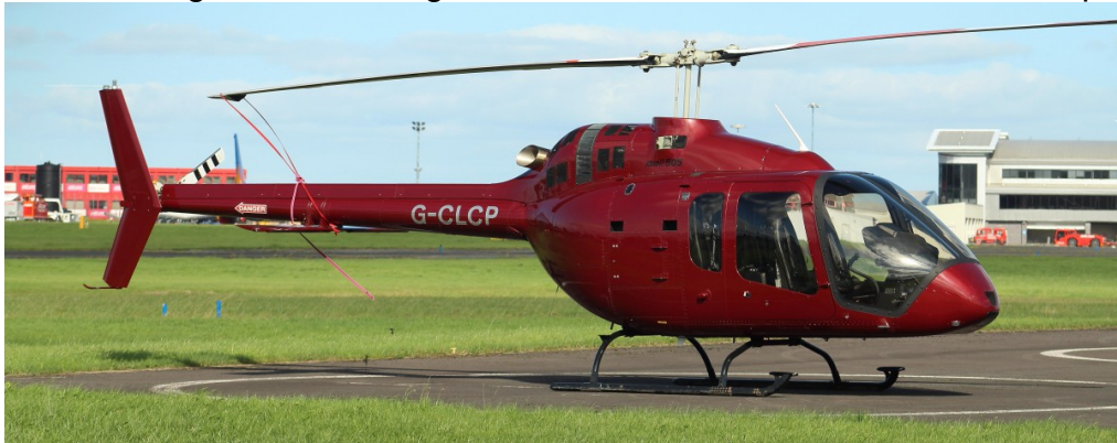
G-LCLP Bell 205 Hields 09/09 Ian Gratton