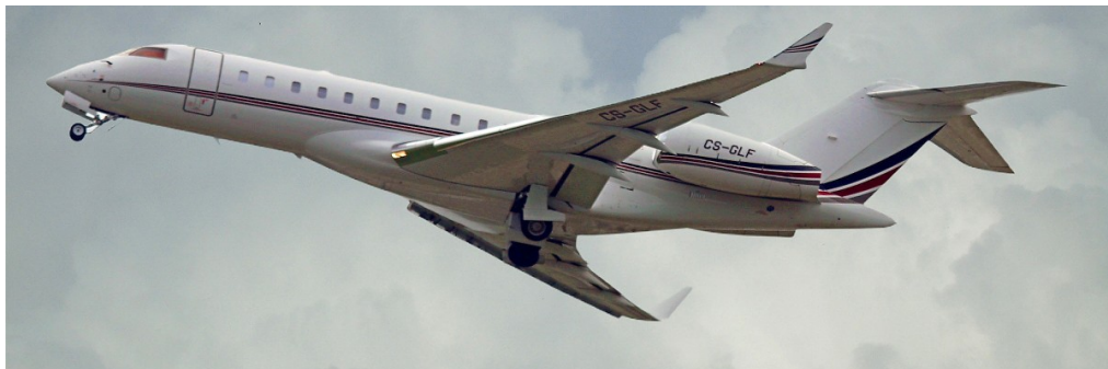
CS-GLF Global 6000 05/09 Paul Whincup

Global 6000 CS-GLF dep 08:50 to Olbia, Agusta A109S Grand G-OPOT arr 09:20 fr Biggin Hill dep 09:41, Challenger 350 CS-CHH arr 12:35 fr Inverness n/stop, Cirrus SR20 N781CD arr 13:36 fr Church Fenton n/stop, Eurocopter EC155 G-LCPX dep 15:07, Cessna 525A CJ2 D-IAKN arr 16:23 fr Dortmund n/stop, Cessna 550 Citation Bravo G-CMBC arr 16:38 fr Split dep 17:07 to Staverton, Challenger 350 9H-VCO arr 18:51 fr Farnborough n/stop.