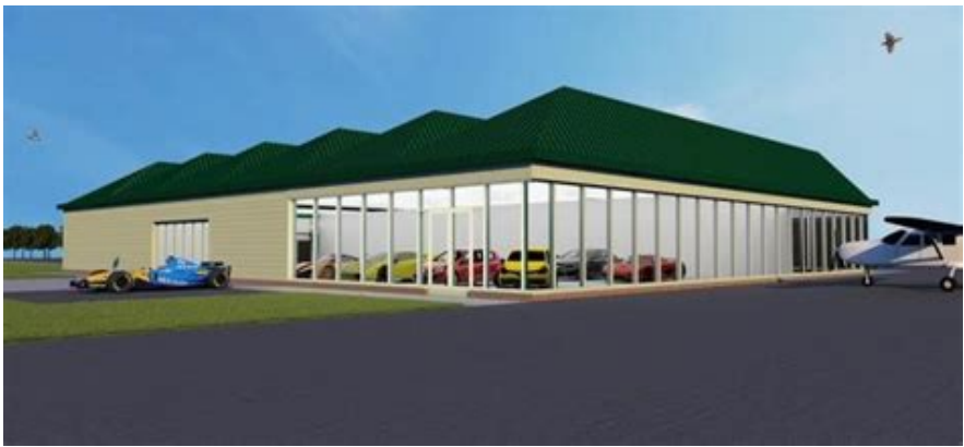
An artist impression of the FBO Terminal.

Currently all flights need PPR (Prior Permission Required) and air ground communication is on Fenton Radio 126.505. The Airport is planning to have GNSS (Global Navigation Satellite System) which will make it more attractive to operators in adverse weather.