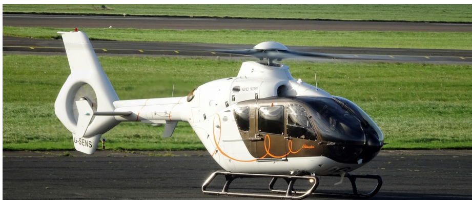
G-SENS Eurocopter EC135 T2+ 26/09