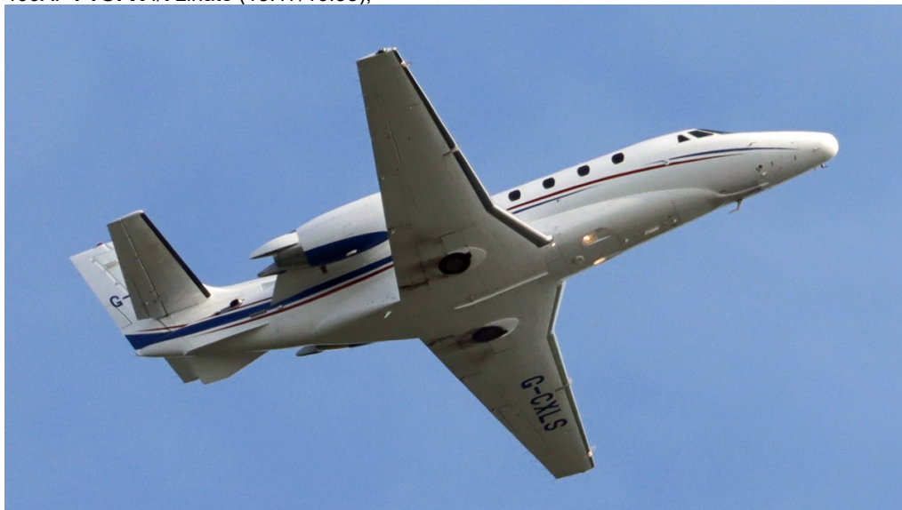
G-CXLS Cessna 560 Excel 18/09 Paul Whincup