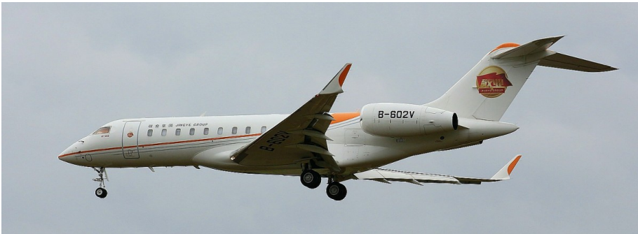
B-602V First Mandarin Business Aviation Co Ltd (Jianghe Group) BD-700 Global Express 6000 10/09