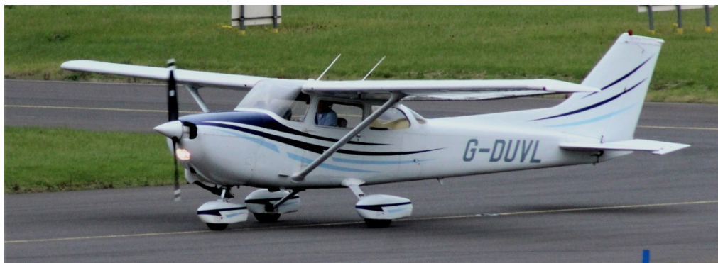
G-DUVL Reims Cessna F172N Skyhawk 10/09 Mike Storey

Cessna 560 Excel G-LXWD arr 07:55 fr Biggin Hill dep 09:28 to Guernsey ret t LBA at 16:02 n/stop, Reims Cessna F172N Skyhawk G-DUVL arr 11:06 fr White Waltham n/stop, Beechjet 400A SP-TTA arr 11:30 fr Newcastle dep 13:00 to Valencia, Phenom 300 N418EE arr 13:56 fr Blackpool dep 14:32 to Cranfield, Cessna 404 Titan II G-BWLF arr 15:15 fr EMA n/stop, Challenger 850 9H-YOU f/t Olbia (15:18/16:10), Eclipse EA500 N117EA arr 18@04 fr IOM n/stop, Cessna 750 Citation X D-BUZZ arr 20:44 fr Luton n/stop.