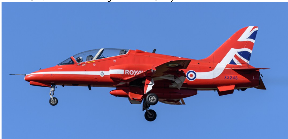
XX245 Hawk T1 Red Arrows 29/09