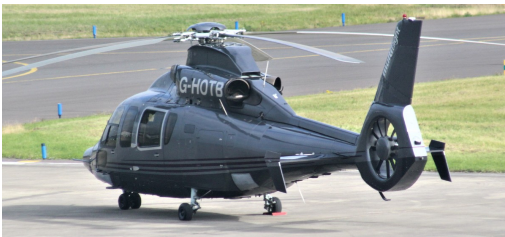
G-HOTB Eurocopter EC155 B1 18/09 Mike Storey