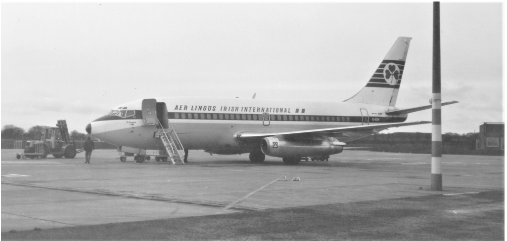
Aer Lingus B.737- 238 EI-ASH. Taken from the then Public Enclosure next to Stand 3. Entered service with Aer Lingus in April 1970 so the date of this photo will be some time later.