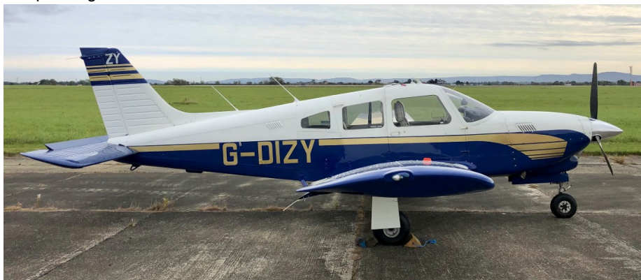
G-DIZY Piper PA-28R Turbo Arrow 30/09