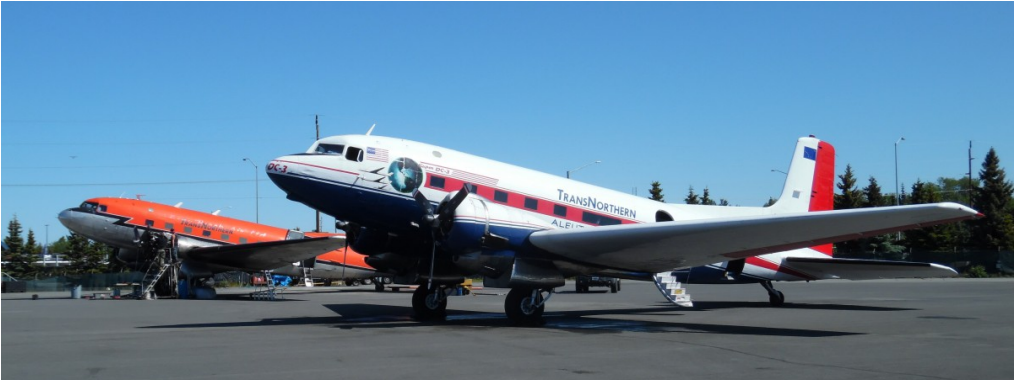
Trans Northern Super DC-3