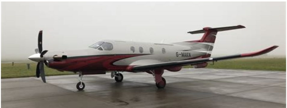
G-MAKN of Makin Air.

Holiday flights are already offered from the Airport by Makin Air in G-MAKN. This is a Pilatus PC12/47E Single Engine Turboprop that was delivered new in 2017 and has the advantage that it can land on grass or tarmac runways. The Aircraft is registered and managed by Ravenair of Liverpool John Lennon Airport. You can have a tailored made holiday. Some illustrative holiday flight costs are; Annecy/Courcheval £760 per person and Palma, Mallorca £1000 per person. The prices are based on nine persons, return within 48 hours and do not include airport charges and landing fees.