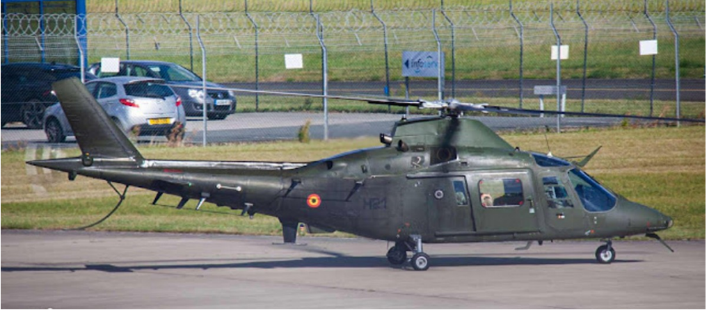
A109HA Belgium Air Component 08/09 Mark Dobson

Phenom CS-PHV arr 0704 dep 0805, CE 525B OE-GTO arr 0832 dep 1011, Bell 505 G-HJDP dep 0950, Belgian Army Agusta A109 H21 arr 1004 dep 1055, Cirrus SR20 G-GCDA arr 1007 n/stop, Ce 680A CS-LTR arr 1437 dep 1625.