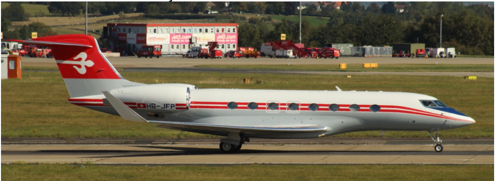
HB-JFP Gulfstream G650 Patak Philippe 25/09