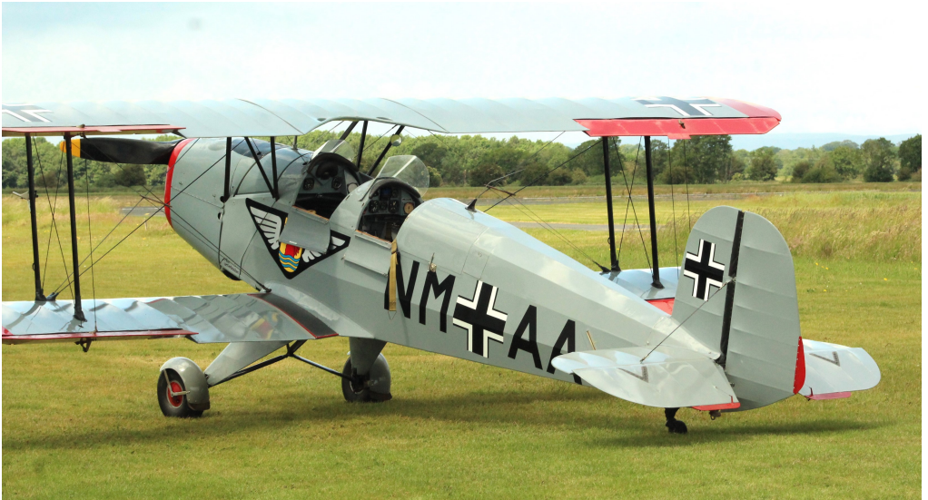
G-BZJV CASA JUNGSMANN