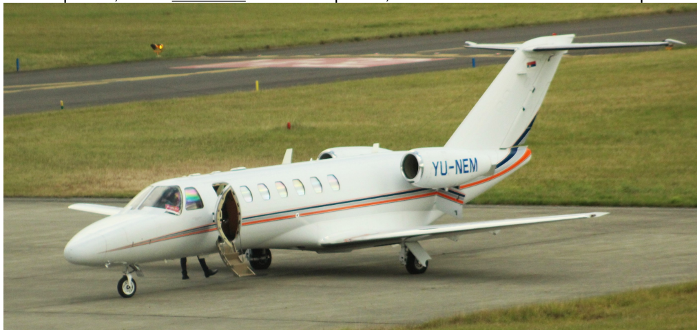
YU-NEM Citation Cj3 02/09 Mike Storey

CE 525B YU-NEM dep 1015, Pilatus PC XII M-GETS arr 1039 n/stop, phenom M-NORN arr 1224 dep 1513, AS365 M-VENA arr 1454 dep 1648, Ce 560XL CS-DXZ arr 1723 n/stop.