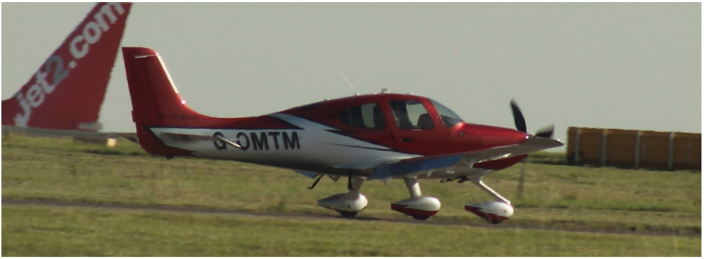
G-OMTM Cirrus SR22T 30/09 Ian Gratton