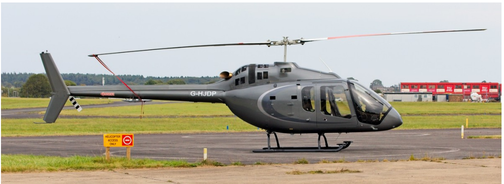
G-HJDP Bell 505X Jet Ranger 07/09 Stewart Robertshaw

Bell 505 G-HJDP dep 0947 ret at 1103, Premier 1 LZ-LUX arr 1251 dep 1401, Pilatus PC XII G-KARE arr 1301 dep 1318, Phenom D-CTOR arr 1408 dep 1544, Phenom CS-PHQ arr 1506 dep 1618. Gulfstream 500 N574FS arr 1646 n/stop.