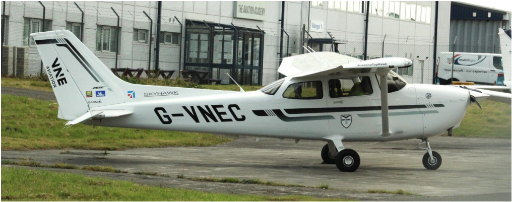
G-VNEC Cessna Skyhawk 02/09