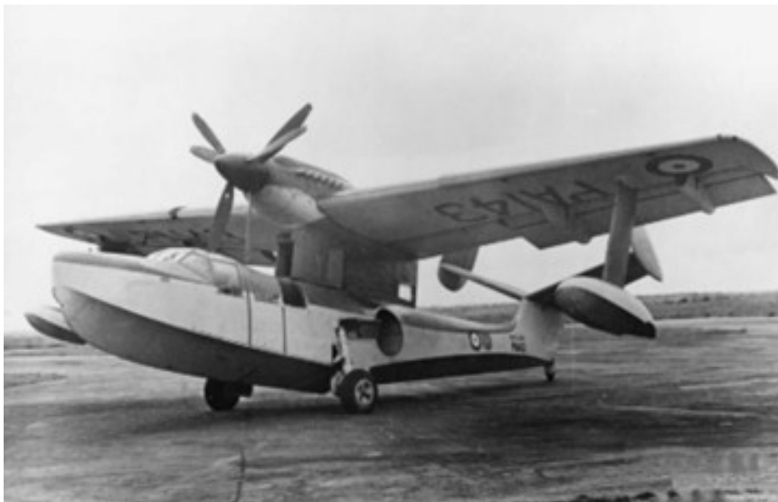
Only two Supermarine Seagulls were constructed. The example at the Sherburn Races claimed the speed record for amphibious aircraft.

On 21st July, the day before the race, a Miles Magister crashed on the runway on landing. Ambulances, fire engines and crash tenders raced to the scene but found the pilot, Peter Edmonds of Maidstone and his passenger, unhurt. As the aeroplane taxied after touching down a gust of wind caught it's tail and slewed it round, skidding the undercarriage wheels and snapping the support struts. The propeller was smashed. Sherburn became a hive of activity as competitors of the high speed air races arrived in their aircraft. One of the earliest was Squadron Leader TS (Wimpy) Wade, test pilot for the Hawker Aircraft Company, in his single seat Sea Hawk arriving from Farnborough. Another early arrival was Lieutenant PG Lawrence in his Blackburn Firebrand, a piston engined naval fighter. John Derry, De Havilland test pilot arrived in a Venom. Mike 'Lucky' Lithgow, Vickers Armstrong test pilot, arrived in his Supermarine Attacker. Many thousands of people from the North were expected to see the high speed races. Away from Sherburn Leeds Police erected special crash barriers on Woodhouse Moor, Leeds for the next day landing of the Bristol Sycamore helicopter which was to fly the Lord Mayor to Sherburn. There were advertisements in the Louth Standard and Lincolnshire Standard advertising flights to the Race from Skegness Aerodrome, how successful these flights were was not recorded.