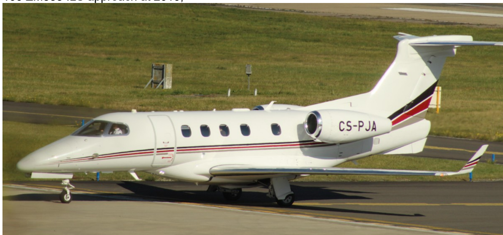
CS-PJA Phenom 300 Netjets 25/09 Ian Gratton

Phenom CS-PJA arr 1059 dep 1236, Learjet 45 G-EMCZ arr 1105 dep 1814, Cirrus SR22 G-GOMC arr 1111 dep 1425, Gulfstream G650 HB-JFP dep 1155, Ce 525C N513AL arr 1349 dep 1424, P180 Avanti D-IPPY arr 1705 n/stop, Global 6000 CS-GLH arr 1916 dep 2014, Phenom 100 ZM333 ILS approach at 2010,