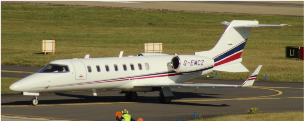
G-EMCZ Learjet 45 247 Aviation 25/09 Ian Gratton