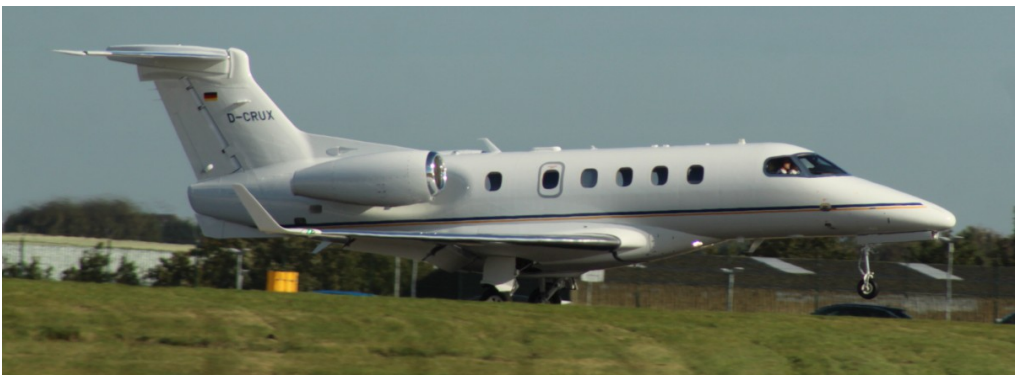
D-CRUX Phenom 300 PAD Aviation 30/09 Ian Gratton