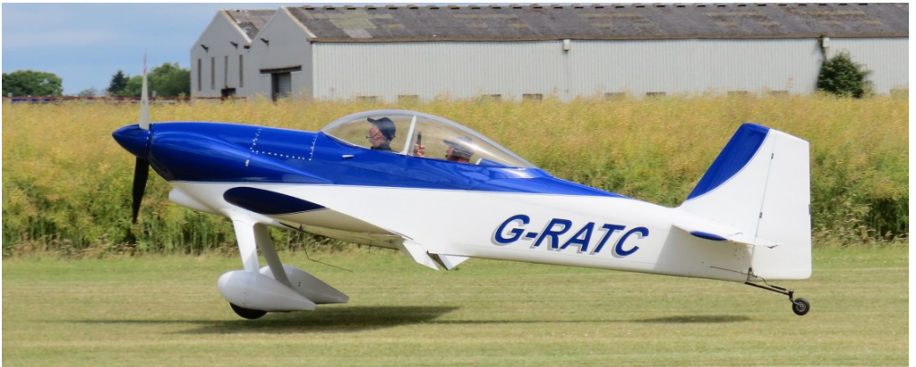
G-RATC Vans RV-4