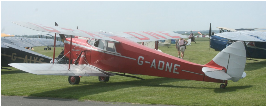
G-ADNE Hornet Moth