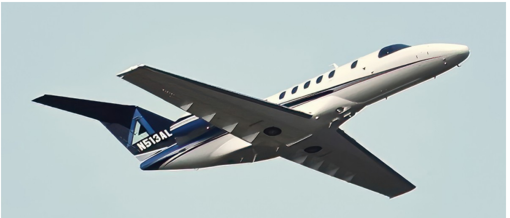
N513AL Citation 525 CJ4 25/09 Paul Whincup

Ce 680 CS-LUA dep 0839, Eclipse EA500 G-LZRI arr 0941 dep 1101, Learjet 45 TC-RSE dep 1306, Hawker 750 TC-FBC arr 1332 dep 1448, Ce 525B SP-MDD arr 1417 n/stop, Phenom CS-PHB arr 1538 dep 1654, Partenvia P68 G-POLW arr 1729 dep 1835, Pilatus PC-24 D-COPI arr 1732 n/stop, Beechjet SP-OOK arr 2145 n/stop,