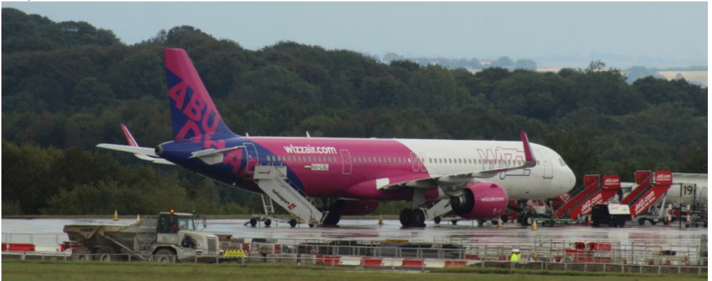
HA-LGL Airbus A321-271N Wizz Air 03/09 Ian Gratton

Warsaw (1315/1316, “9594/6WR”, Tue/Thu/Sat):-2/9 9H-WMJ, 4/9 HA-LZL, 6/9 HA-LZK, 9/9 HA-LVT, 11/9 HA-LZL, 13/9 HA-LZK, 16/9 9H-WDT, 18/9 HA-LTA, 20/9 HA-LTA, 23/9 HA-LXS, 25/9 9H-WNM, 27/9 HA-LZL, 30/9 HA-LVT.