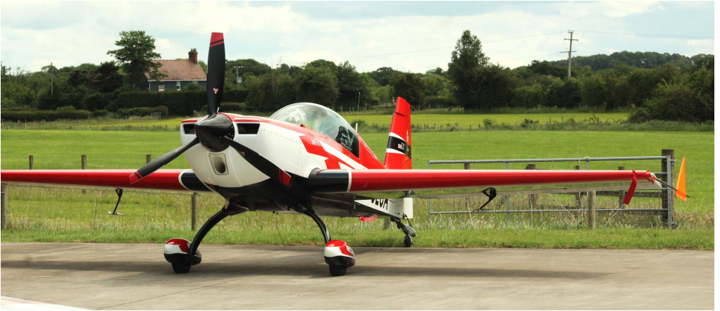
G-CLCA Extra 330LX