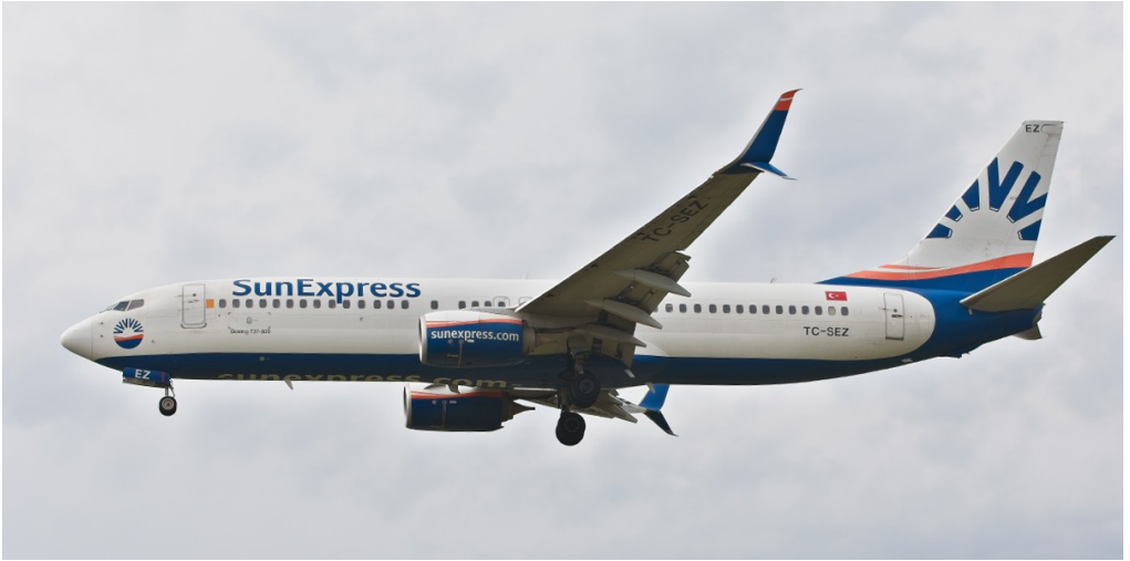
TC-SEZ Boeing 737-8 Sun Express 08/09 Stewart Robertshaw

Antalya (560/561, "6QA/2NB", Sun/Mon/Wed/Fri):-1/9 TC-SPT, 3/9 TC-SEM, 5/9 TC-SPR, 7/9 TC-SEZ, 8/9 TC-SPR, 10/9 LY-MLF, 12/9 TC-SEJ, 14/9 9H-SWK, 15/9 TC-SPV, 17/9 TC-SPI, 19/9 TC-SEU, 21/9 TC-SPV, 22/9 TC-SPP, 24/9 LY-MLF, 26/9 TC-SRB, 28/9 LY-MLJ, 29/9 TC-SEK.