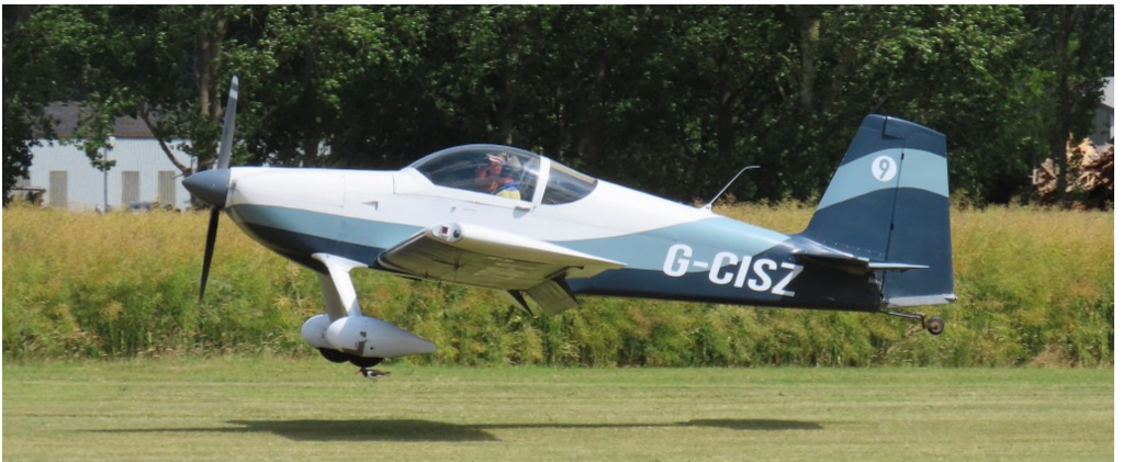
G-CISZ Vans RV-7