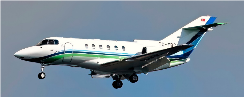
TC-FBC Hawker 750 28/09 Paul Whincup