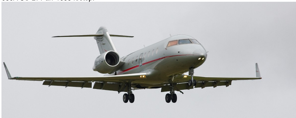
9H-VFJ Challenger 605 Vista Jet 15/09 Stewart Robertshaw

Challenger CL605 N949MC arr 0837 until 17 th , Phenom CS-PHU arr 0846 dep 1415, Phenom OK-PHO dep 0903, Agusta A109 G-RDWN arr 0934 dep 1034, Learjet 35A SX-SEM arr 1006 dep 1356, Ce 680A CS-LUA arr 1255 dep 1412, CE 560XL D-CDCM arr 1504 dep 1621, Ce 680A CS-LTT arr 1635 n/stop.