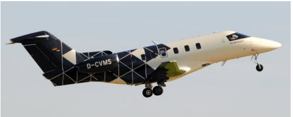
D-CVMS PC-24 Platoon Aviation 30/09 Dave Wooler

Global 6500 C-GZLM dep 0856, Pilatus PC-24 D-CVMS arr 0905 dep 1044, Cirrus Sr22 N842VV arr 0914 dep 1758, Cirrus SR22 G-TAAB arr 0918 dep 1719 ret at 1744 n/stop, Cirrus Sr22 G-OMTM arr 1038 n/top, phenom D-CRUX arr 1106 n/stop, Diamond DA62 G-JAAM arr 1451 dep 1545, Phenom D-CAAG arr 1646 n/stop, Ce 525A D-ISJP arr 1702 n/stop, Challenger CL605 9H-VFL arr 1939 n/stop.