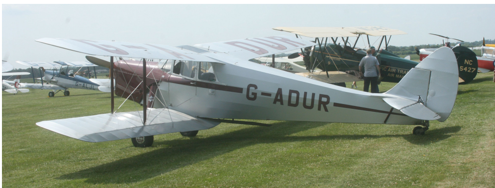
G-ADUR Hornet Moth