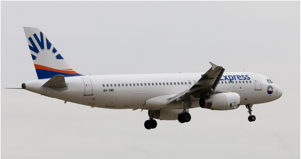
9H-SWK Airbus A320 Sun Express 14/09 Stewart Robertshaw