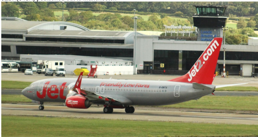
G-DRTX Boeing 737-800 Jet2.com 02/09 Mike Storey

Only positioning /test/training flights shown:-2/9 G-JZBR(041A) positioned out to Manchester, 3/9 G-GDFY(041A) positioned in from Malaga, 4/9 G-GDFY(042A) positioned out to Birmingham, 6/9 G-DRTJ(049A) positioned in from Birmingham, 8/9 G-JZBR(042A) positioned out to Bristol, 9/9 G-JZDF(010P) positioned in from Newcastle, 11/9 G-JZBL(041A) positioned in from Manchester, 12/9 G-JZHX(049A) positioned out to Manchester, G-GDFC(050B) training flight, 14/9 G-GDFC(050B) training flight, G-SUNG(059B/257/258/049A) positioned in from Manchester then operated to/from Palma then positioned back to Manchester, 15/9 G-JZHB(041A) positioned in from Edinburgh, G-GDFM(071W) positioned in from Birmingham, G-DRTX(050B) training flight, 18/9 G-JZDH(049A/043A) positioned out to/in from Liverpool, 23/9 GJZHM(300T/302T) training flight to/from Newquay, 25/9 G-JZBJ(041A) positioned in from Palma, 27/9 G-JZBH(010P) positioned in from Manchester, G-JZHJ(049A) positioned out to Zakynthos, 28/9 G-DRTB(045C) positioned in from Reus, 29/9 G-JZBB(041A) positioned in from Birmingham, G-JZBS(050B) training flight, 30/9 G-JZHF(050B/041A) training flight then positioned out to Bristol, G-GDFM(038F) training flight to Dublin, G-GDFW(053B) training flight, G-JZHJ(042A) positioned in from Manchester, G-JZBB(034F) training flight to Teesside, G-JZDA(043A) positioned out to Manchester.