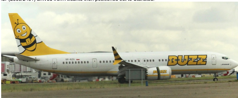
SP-RZG Boeing 737-8200 MAX 02/09 Mike Storey

Other flights :-6/9 9H-QBF(2486/2661) positioned in from Stansted then departed to Alicante, EI-IJP(2660/2481) arrived from Alicante then positioned out to Stansted.