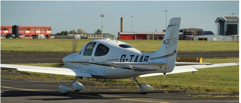
G-TAAB Cirrus SR22 30/09 Ian Gratton