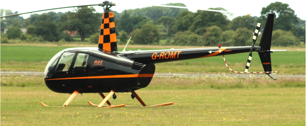
G-ROMT ROBINSON R44