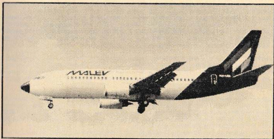
MALEV B737 HA - LED