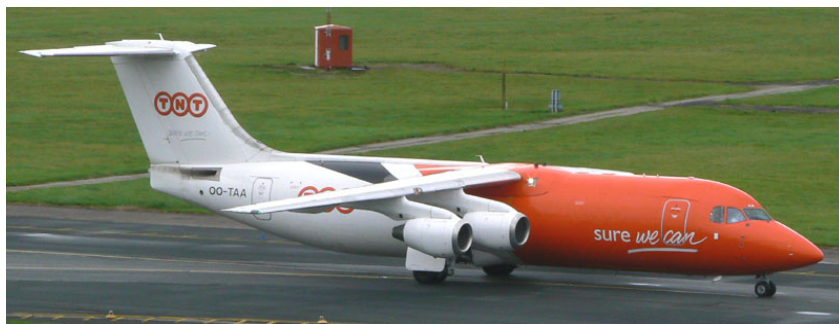
TNT BAe.146 OO-TAA arriving with horses for York Races on 20/8

GENERAL AVIATION:- Cessna 208 Caravan N208WD f/t Elstree(0942/1636). Robinson R.22B G-LIPE from a private site near Shobdon(1024) to Wellesbourne Mountford(1253). DA.42 Twin Star G-GFDA (Equity 03), ILS and overshoot(1547), f/t Blackpool. PC-12 G-PVPC from Gerona(2031), n/s to Bournemouth(1003).