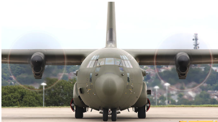
Hercules ZH871 made a short visit to LBIA on 5/8(Robert Burke)

GENERAL AVIATION:- Twin Squirrel G-DBOK arrived from Todmorden(0900) for Multiflight engineering, n/s. Cirrus SR.22 N147LD f/t Denham(1001/1632). Following several days maintenance with Multiflight A.109A N109TK returned home to Chorley at 1240. Pilatus PC-12 G-PVPC f/t Birmingham(1426/1552). Regularly noted crossing Leeds Airspace but a very uncommon visitor is PA-24 Comanche N218SA , however it arrived from its base at Fadmoor at 1417 before routing to Bembridge at 1606. Cessna F.172M G-BDNU f/t Elstree(1737/1626), n/s.