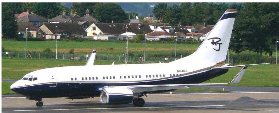
Making its first visit on 24/8 was Boeing 737/700BBJ N164RJ

GENERAL AVIATION:- Twin Squirrel G-VONE (Premier 16) from a private site near Teesside(0230), n/s to Daleview(1720). Dauphin EI-GJL from Dundalk(1932), n/s to Dundalk(0810). King Air 200 G-CEGP (Cega 776) from Malaga(2031), n/s to Bournemouth(0957).