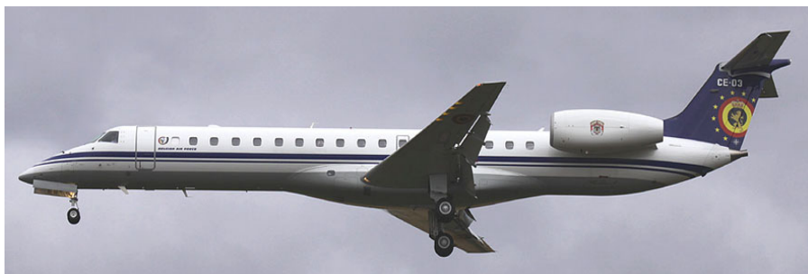
Embraer 145 CE-03, of the Belgian Air Force arriving Teesside on 12/8

9/8 XX203 Hawk(Pirate 16), ZE163 Tornado(Leuchars 36), ZJ801 Typhoon, all ILS 10/8 G-CYLS Cessna T.303(Orchid 148), Hawks XX222/XX280/XX346 all ILS 11/8 N2NR A.109E, G-ZMED Lear Jet 35(Air Med 061), ZE395 BAe.125(Northolt 10) 13/8 OE-LLL Falcon 7X(Jet Management 717) 14/8 OY-BHF PA-31(n/s), CS-DXF Citation XL(Fraction 3PG), EI-GJL Dauphin 16/8 G-SOVB Citation Sovereign, XX255 Hawk(Pirate 10, ILS) 18/8 HB-CAJ Cessna 140, G-MAFF BN.2T Islander(Rushton 66) 19/8 OK-TOS King Air 200, CS-DKK Gulfstream 550(Fraction 149P), G-CEDK Citation X 20/8 CS-DMV Hawker 400XP(Fraction 7FA) 21/8 CS-DNP Falcon 2000(Fraction 322D), G-CFAK MT-03, G-NBEL Twin Squirrel 22/8 OO-CIV Citationjet 2(Skyservice 795), OO-SKM King Air 200 23/8 G-IASM King Air 200(Propstar 91), G-POWB King Air 200(Vulcan 1) 24/8 G-LAWX Sikorsky S.92, G-SEFI Robinson R.44 25/8 SE-RBY Citation Bravo(Nextjet 625B), G-ATSZ Twin Comanche 26/8 SE-DLZ Citation 1SP, CS0DXU Citation XLS(NJE 689u), OO-AIE Citation XLS 27/8 N188S A.109A, G-BOMB Cassut Racer, G-OZAT Hawker 900XP(Hangar 812) 28/8 M-JJTL Pilatus PC-12, G-YPRS Citation XLS, VP-CRB Lear Jet 60 29/8 EC-JYT Challenger(TAG Espana 081), N978RW Falcon 900B(n/s) 30/8 EC-KMT Hawker 900XP(Gestair 041) 31/8 PH-CIJ Citation Sovereign, G-PTOO Long Ranger, G-RWLA EC.135