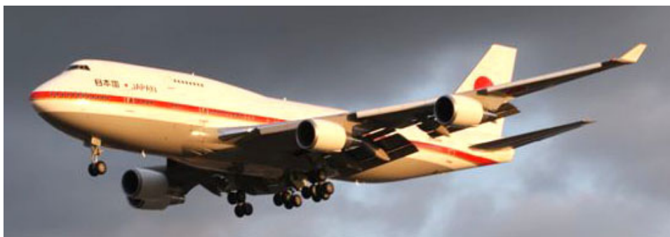
20-1102, Japan-Air Self Defence, Boeing 747-400 Toronto-Pearson By Ian Morton, 24.06.10