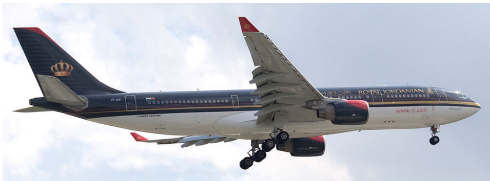
JY-AIR, Royal Jordanian Airlines, Airbus 330-223 London/Heathrow