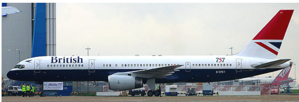
Boeing 757 G-CPET being rolled out been in a retro colour scheme for British Airways