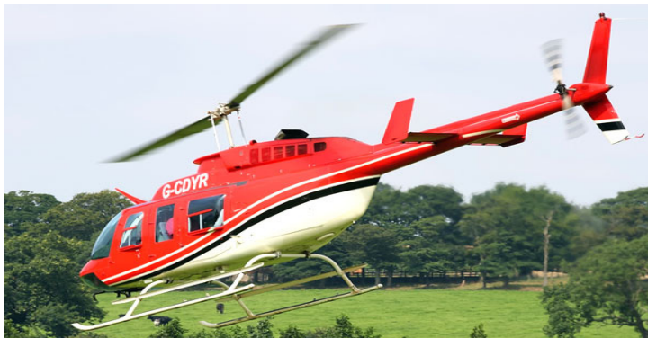
Long Ranger G-CDYR departing Coney Park

12/8 G-WCRD Gazelle 1110 1200 f/t Oulton Hall G-URSA Sikorsky S-76C 1145 1330 "Sparrowhawk 1" f/t Harrogate G-DPJR Sikorsky S.76B 1635 1645 f. Denham t. Private site/Scotland 14/8 G-CUDY Enstrom 480 1400 1745 f/t Cowbridge 19/8 G-WOFM Agusta A.109E 1750 1800 f. Benson t. Perth 27/8 G-EEZA R.44 1130 1240 f/t Todmorden 28/8 G-XLLL Twin Squirrel 1540 f. Sandtoft, no record of departure. 31/8 G-CPTS Jet Ranger 1543 1505 f/t Skipton