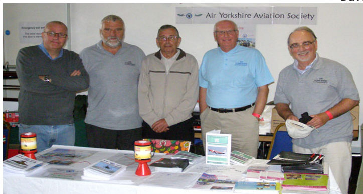
THE SATURDAY TEAM