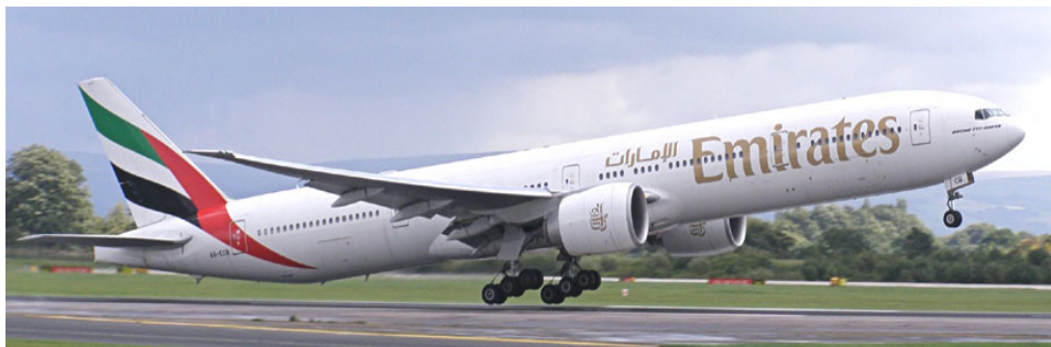
A6-ECB, Emirates Boeing 777-300ER Manchester 28.08.10