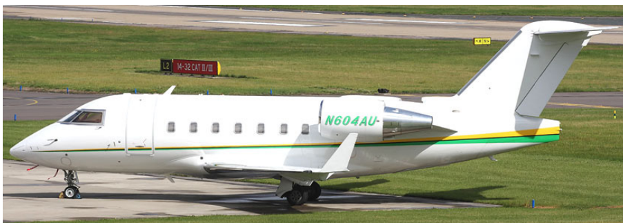
Challenger N604AU parked on Multiflight/East, 10/8

GENERAL AVIATION:- Cessna 172S G-PFCL from Elstree(0938) to Liverpool(1154). PA-28 Warrior G-BTNH f/t Birmingham(1240/1330). Partenavia P-68B D-GBRD (Kiel Air 727A/B) from Kiel(1438) to Blackpool(1525), with engineers to attend to u/s Dornier 228 D-ILKA. 'RD returned from Blackpool at 1708 as "Kiel Air 727Y" and night stopped before heading home to Kiel at 1011. PA-34 Seneca G-JMOS (Propstar 31) from Bournemouth(1417) to Liverpool(1436).