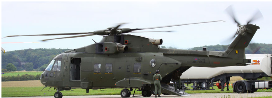
Merlin ZJ121 dropped in Humberside for a refue on 12/9(Richard Grimley)

19/8 CS-DMV Hawker 400XP(NJE 7FA), G-ZMED Lear Jet35A, ZJ186 Apache(Armyair 307) 20/8 N955SH PA-46T Malibu, G-LCYE Embraer 170(Flyer 4550) 21/8 G-MFLA Robin HR.200, G-AYCT Cessna F.172H, TF-FIG Boeing 757(Iceair 776) 22/8 ZF143 Tucano(LOP 44, ILS) with ZF169(LOP 73), G-POPW Cessna 182S 23/8 ZD621 BAe.125(Northolt 35, training), ZK453 King Air 200(Cranwell 62, ILS) 24/8 EC-HZH Metroliner(Aeronova 612) 25/8 OE-FZC Citation Mustang(Dream Team 55TJ), XZ654 Lynx(Armyair 997, training) 27/8 N939SR Cirrus SR.22 28/8 TF-FID Boeing 757(Iceair 776) 29/8 EC-HCH Metroliner(OVA 621), N883DP C.182RG, G-BUXS Bolkow 105 30/8 XX255 Hawk(Pirate 07, ILS), G-BYXN Tutor(Cranwell 22, training) 31/8 XX322 Hawk(Red 10, ILS), G-FBLK Citation Mustang(Blink 3C)