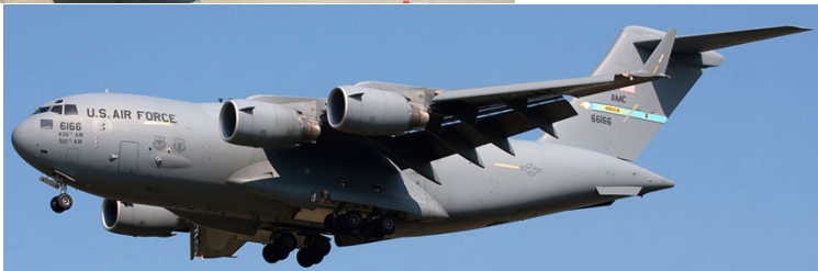
06-6166 C.17A Globemaster 3AS, 436AW, USAF Thunderbird Support