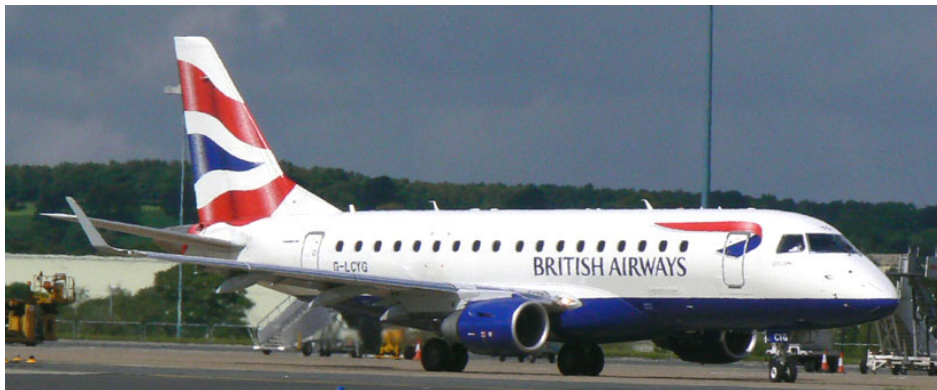
Cityflyer Embraer 170 G-LCYG seen taxiing for departure to Naples on 27/8

GENERAL AVIATION:- King Air 200 G-BVMA from Cardiff(0909) to Charleroi(1239). Cessna F.172M G-BBJZ from Harewood(1027) n/s. DA-42 G-DSKY (White Knight 03) from Galway(1351) to Birmingham(1413). PA-32 G-BJCW from Blackpool(1812), n/s to 29/8, to Fairoaks(1530). Twin Squirrel G-VGMC (Pilgrim 1) f/t Bramham Park(2102/1542), n/s.