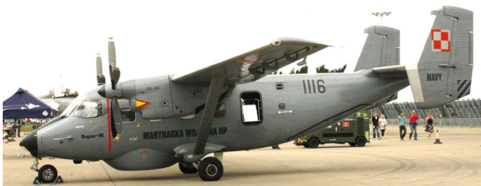
1116 M.28 Bazra 28EL Polish Navy (Mike Storey)