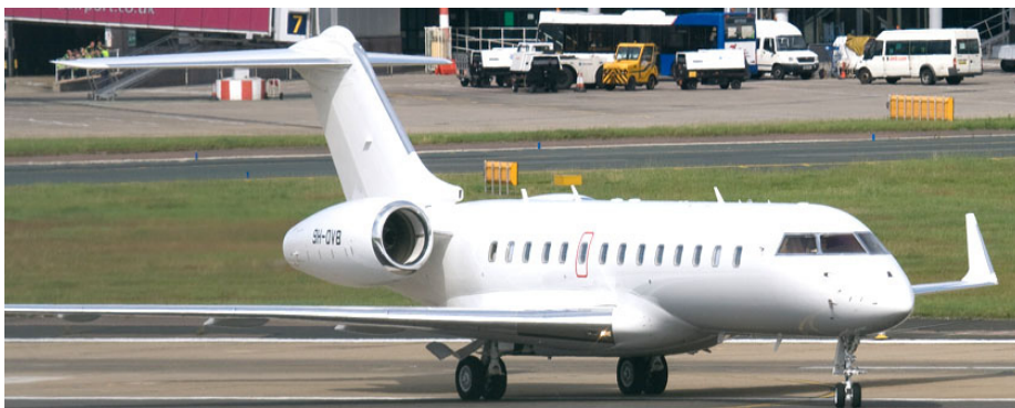
First visit by a Maltese bizjet, Global Express 9H-OVB arriving 20/8

GENERAL AVIATION:- PA-46 Malibu N921GG from Lydd(1232), crew ferry for SR.20 N203CD which also arrived from Lydd(1309), for maintenance with Multiflight. 'GG' departed to Liverpool at 1340. Beech A.36 D-EKPD f/t Thrupton(1716/1833).