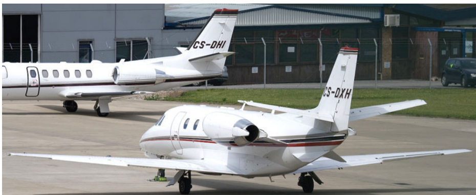
Netjets Citation XL CS-DXH and Citation Bravo CS-DHI Parked up on 20/8

GENERAL AVIATION:- Duchess G-BXXT f/t Humberside(1011/1559), local flight 1218/1411 as "Exam 102". Dauphin G-NHAA (Helimed 63) f/t Teesside(1822/1713) to Multiflight engineering, n/s until 25/8. Augusta A.109E G-DWAL from York(2015) to Skipton(2052).