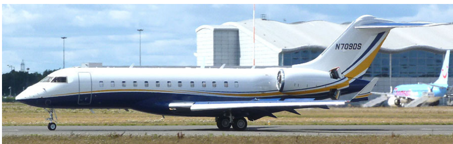
Global Express N709DS of CB Air LLC arriving at Doncaster 27/8

Doncaster(Aeroventure):- A recent arrival here is the cockpit section of Tornado F.2 ZD938.