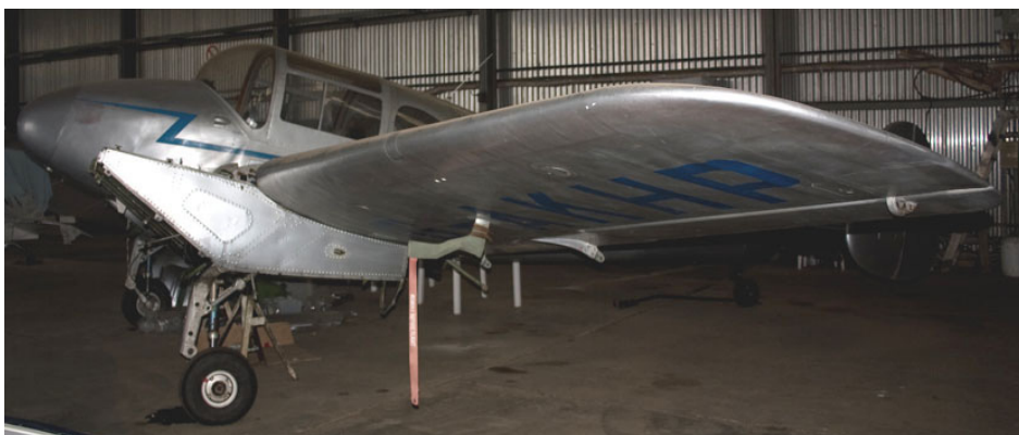
Gemini G-AKHP is still under repair at North Coates following its wheels up landing (Martyn Gill)

North Moor:- A recent visit revealed Chevron G-MZDP, which arrived from an off site workshop and is currently minus its propeller. All other residents were as expected however a pair of wings in Hangar 3 were unidentified. A new resident is Pegasus XL-R G-MTUI.