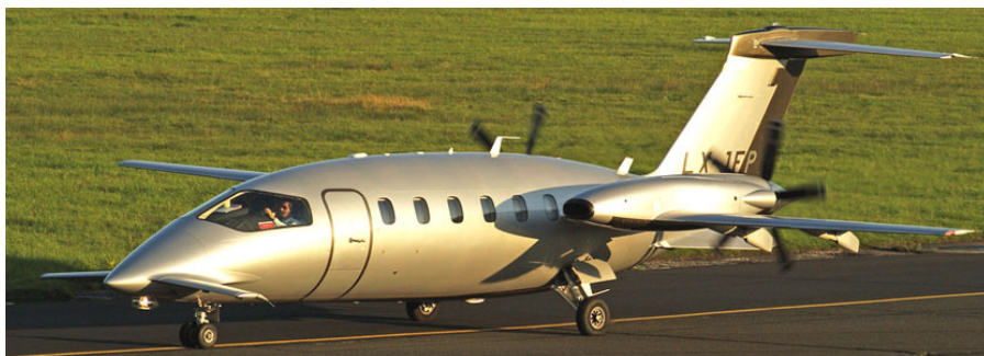
The distinctive outline of P.180 Avanti LX-JFP, visiting Teesside on 25/6

Syerston:- A new resident is DR.107 G-CVII, which was first noted in early July, nearing completion and unmarked.