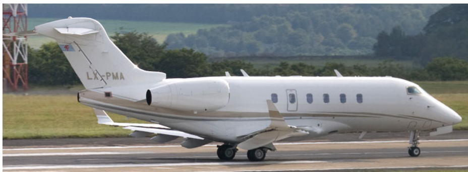
Challenger 300 LX-PMA of Luxavation was on it first visit to LBIA, 20/8

GENERAL AVIATION:- PA-34 G-RVRB (Ravenair 34T) from Liverpool(1011), local flight 1108/1132 as "Exam 02" and back to Liverpool(1242). Cirrus SR.20 N590CD from Sherburn(1049) to Multiflight engineering, n/s. Long Ranger G-PTOO from Sherburn(1235) to Prestwick(1320), from Carlisle(1803) to Sherburn(1810). MD.902 G-SASH (Special 15) went to Gloucester(1434) for maintenance. With sistership G-CEMS being out of service following an incident in the Dales when a skid was damaged, MD.902 G-LNAA arrived via Wakefield(1831) to take up operations as "Helimed 98".