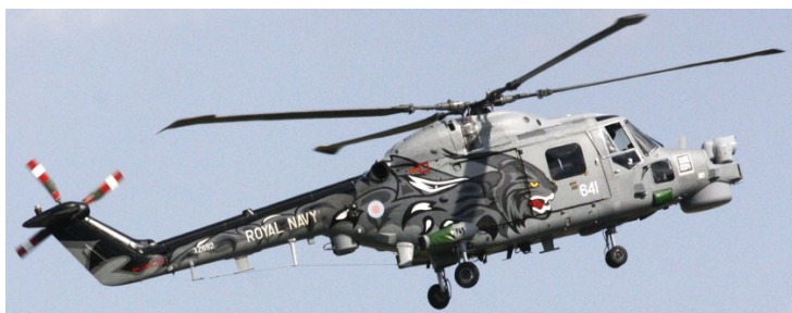
XZ692/641 Lynx HMA.8SRU 702 Squadron Royal Navy Special Lynx scheme (Mike Storey)