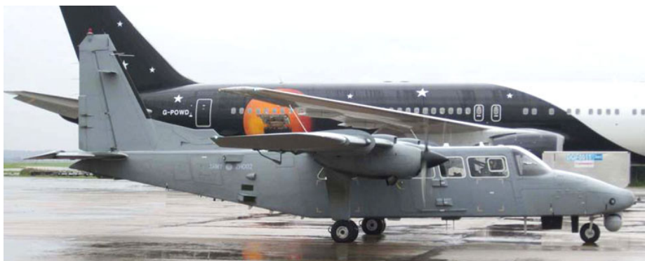
BN.2T Defender ZH005 parked alongside Titan Boeing 767 G-POWD at Teesside on 10/8

9/8 G-MROO Citationjet 2(Hangar 893), G-GZRP PA-42(Air Med 893), G-FOZZ Beech 33 10/8 ZH005 BN.2T Defender(Armyair 595), M-AJOR Hawker 900XP 11/8 M-YLEO PC-12, M-JJTL PC-12, G-CGWV Embraer 135(training) 12/8 M-USCA TBM.850, N709EL Hawker 400XP, ZH883 Hercules(Ascot 305, ILS) 14/8 OO-FPA Citation XL(Flying Group 84T), G-ZUMI RV.8 15/8 LX-FGB Citation XL, ZF348 Tucano(LOP 408, ILS) 16/8 CM-02 Falcon 20(Belgian Air Force 620), ZF377 Tucano(LOP 403, ILS) 17/8 CS-DUD Hawker 750XP(Fraction 1QK), XX318 Hawk(Pirate 18, ILS) 18/8 I-TOPX Hawker 900XP(n/s), ZE701 BAe.146(Northolt 18, ILS) 19/8 G-XAVB Citation Mustang(Beauport 591), Tucanos ZF406(LOP 69)/ZF243(LOP 79) 21/8 G-DPJR Sikorsky S.76B(Premier 27), G-BYCP King Air 200(Lonex 37CP) 22/8 ZJ809 Typhoon(Rockstar, ILS), LX-TWO Lear Jet 35, ZG848 Islander(Armyair 594) 23/8 F-GRNT Merlin(Air Lec 421), PH-RID Citation Sovereign, G-HOLM EC.135T CS-DHH Citation Sovereign(Fraction 1NH), OO-FPC Citationjet 3(FYG 162N) 25/6 EC-KMT Hawker 900XP(Gestair 041, n/s), LX-JFP P.180 Avanti 26/6 CS-DMM Hawker 400XP(Fraction 4XQ), G-SNZY Lear Jet 45 27/8 F-HFRA Citation 1SP, G-BMDK PA-34 Seneca(Air Med 067) 28/8 HB-ZOO Twin Squirrel, N978PW Falcon 900, F-GHSV King Air 200(New Bird 828) 29/8 OO-GEA Jet Ranger, CS-DHL Citation Bravo(Fraction 881F) 30/8 EC-LJC Citation Mustang(Flying Olive 221), ZD280 Lynx(Armyair 950, ILS) 31/8 OO-AIE Citation XLS(Abelag 31Z), YU-BUU Citationjet 3, G-SNZY Lear Jet 45