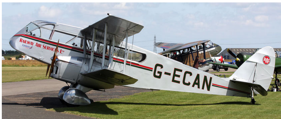
DH Dragon G-ECAN visited Brighton for the Wings and Wheels event

Bridlington:- Tiger Moth G-ANLS landed on a cliff top between Bridlington and Sewerby on 23/7 to take part in an event at Sewerby Hall. It spent most of the day parked on the cricket pitch in front of the Hall, whilst Long Ranger G-PTOO carried out pleasure flights from the same location.