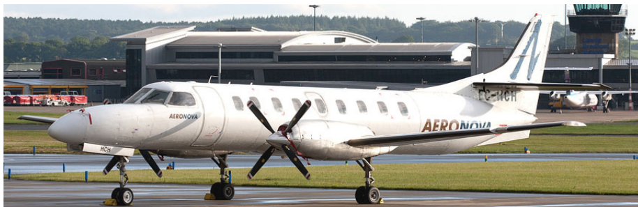
Metroliner EC-HCH of Aero Nova operated a charter into LBIA on 5/8

GENERAL AVIATION:- Cirrus SR.22 N40GD from Newmarket Race Course(0857) to Waterford(0943). Cheyenne 3 G-GMED (Air Med 064) from Glasgow(1448) to Oxford(1826). PA-28 Dakota G-BOKA f/t Fairoaks(1821/1800), n/s until 6/8.