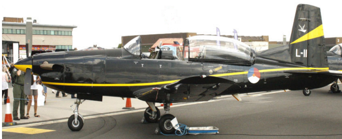
L-11 PC-7 Turbo Trainer 131 Squadron EMVO Netherlands Air Force (Mike Storey)