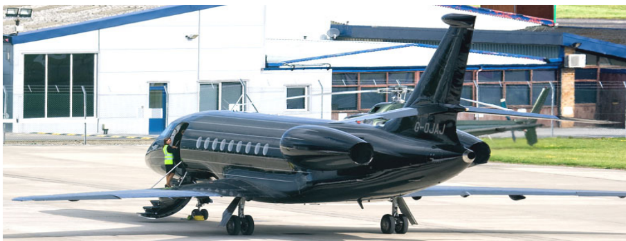
Striking Falcon 2000EX G-OJAJ parked on Multiflight/East, 20/8

MILITARY:- Grob Tutor G-CGKC (Cranwell 89) f/t Cranwell(1040/1220).