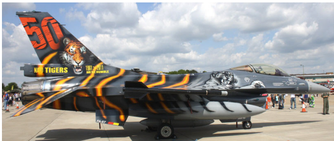
FA.87 F-16AM Fighting Falcon 10 Wing Belgium A/F "50 years of NATO Tiger Meets" (Mike Storey)