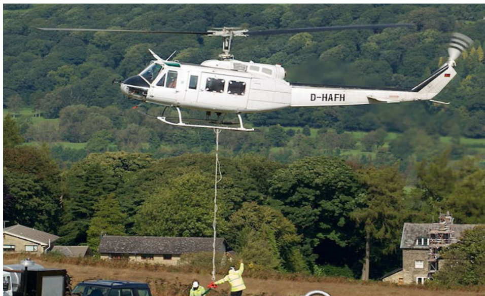
Bell 205 D-HAFH operated on Ilkley Moor, lifting stones for a full week in August

LINTON-ON-OUSE:- Visiting on the morning of 31.8 were G-ACUS DH.85, G-ALWB DHC.1, G-AZGY CP.301B, G-BCGC/WP903 DHC.1, G-BLTC D.31A and G-SAHJ Sprint 160 all departing between 09.36 and 09.46hrs. All are Henlow residents. On 21/8 King Air 200 G-LIVY arrived from Dublin with passengers for York Races before positioning to LBA for an overnight stay. Also from Dublin, for the same reason was Citation XL CS-DQB(Fraction 730L) on 24/8. Visiting on 21.9 was M-YCEF Hawker 850 XPi (258723).