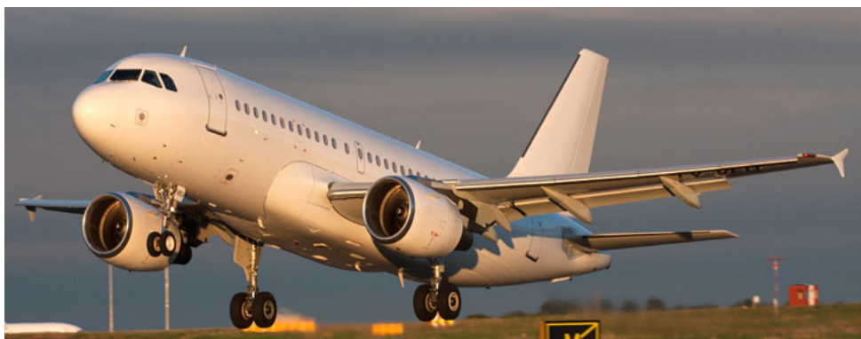
Airbus A.319 LY-VEU of Avion Express, departing runway 32 @ LBIA, 19/08/12(Robert Burke)