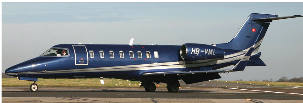
Operated by Jet Link SA, Lear Jet 45 HB-VML was on its first visit to LBIA on 23/8

GENERAL AVIATION:- Operated by Air Taxi Europe, Cessna F.406 Caravan D-IATE (Twin Goose 100/200) was a first time visitor, from Antwerp(0846) to Kristiansund(0946). King Air 200 G-PCOP (Gama 975) from Jersey(1053) to Staverton(1207). King Air 350 G-KLNB (Saxonair 35A) from Newquay(1416) to Norwich(1447). S.76C G-DPJR (Premier 24) f/t Devonshire Arms(2034/1611) n/s.