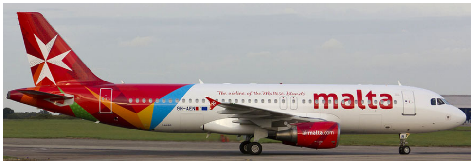
Air Malta are adopting a new colour scheme as can be seen on A.320 9H-AEN

Stansted's main operator Ryanair has stated it has held discussions with a number of parties that are interested in bidding for said and has been asked to consider acquiring a minority stake of less than 25% of the airport as part of a consortium. Ryanair offers two-thirds of total seat capacity flying to and from the airport.U.K. airport operator BAA's decision to sell brought to an end a four-year legal campaign to overturn a 2008 antitrust ruling by the Competition Commission aimed at creating more competition in the British air travel market. However, experts say the airline may even be restricted from taking a minority stake in Stansted because of antitrust issues. “There aren't too many examples of airlines owning operators in Europe because as an owner an airline would get access to information about competitors' deals,” one analyst said. Manchester Airports Group has also been tipped as a possible buyer. The owner of Manchester, East Midlands, Humberside and Bournemouth airports wants to expand and is looking to bring in an investment partner to help finance an acquisition. Stansted has been valued at up to 1 billion pounds ($1.58 billion). BAA is expected to mandate banks to run an auction shortly with a view to completing a sale by early next year in line with Competition Commission guidelines.