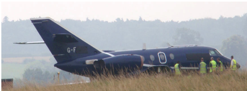
Cobham's Falcon 20 G-FRAL pictured by David Thompson, following its excursion onto the grass at Teesside, having aborted its take-off due to a bird strike.

Note the registration and Cobham titles have been covered with plastic bags.