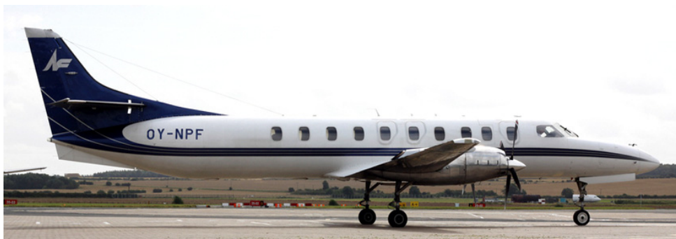
Metroliner OY-NPF of North Flying operated a charter to Humberside

1/8 OY-LAF PA-34 Seneca, ZF204 Tucano(LOP 21, overshoot) 4/8 HB-PBK PA-32R Lance, G-MEDX A.109E, OE-FIN Tecnam T.2006 5/8 N131CD Cirrus SR.22, G-RWEW R.44 7/8 XX346 Hawk(Javelin 18, ILS), G-HDEW PA-32, ZH536 Islander(Ascot 7940, ILS) 8/8 N700GY TBM-700, G-SACX AT-03, G-RVRX P-68B(Ravenair 7RX) 9/8 EI-DMG Cessna 441, G-BIID PA-18 Super Cub, ZH901 Chinook(Vortex 522) 14/8 SX-DVG A.320(Aegean 4980), TC-ACP Boeing 737/800(Pegasus 1411) 15/8 G-ISSV Eurocopter EC.155, XX184 Hawk(Pirate 10, overshoot) 16/8 OY-NPF Metroliner(Norfllying 114), G-KLNR Hawker 400XP(Saxonair 40C) 17/8 D-CCCA Lear Jet 35(Jet Executive 252), G-VONC S.76B(Premier 06), G-HTEL R.44 19/8 N422HM Gulfstream 4(To Denver), M-ICRO Citationjet 3(Eastflight 08A) 20/8 N55AL Gulfstream 5 21/8 G-JMED Lear Jet 35(Air Med 076), SX-DVM A.320(Aegean 4980) 22/8 M-USHY Cessna 441, M-OTOR King Air 90 27/8 N511TE Baron, N939SR Cirrus SR.22(n/s) 28/8 EI-DMG Cessna 441(Burst nosewheel on landing, n/s) 30/8 HA-LFQ Gazelle, G-FULM S.76B, G-GZRP Cheyenne 3(Air Med 054)