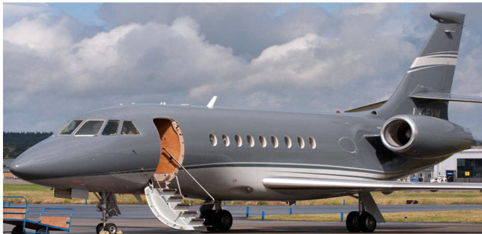
Silver Wings Falcon 2000EX LX-EVM brought pax for York Races, 22/8(Robert Burke)

MILITARY:- BN.2T Islander ZH536 (Ascot 7947), refuel while on local patrol(2218/2308), f/t Waddington.