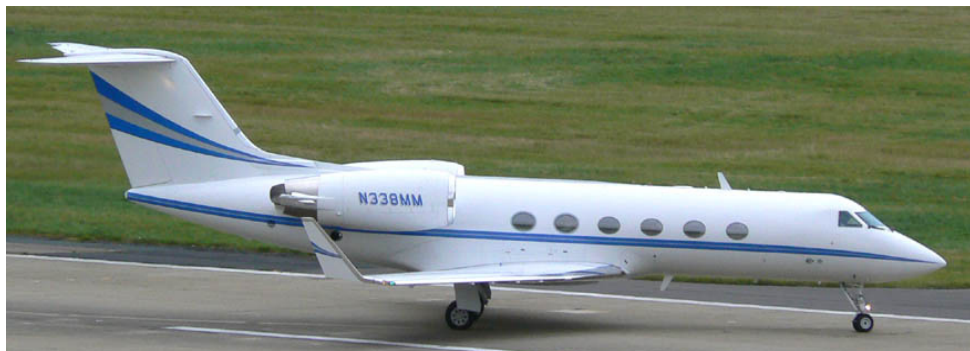
Gulfstream 4 N338MM operated by War Enterprises LLC visited LBIA twice in August