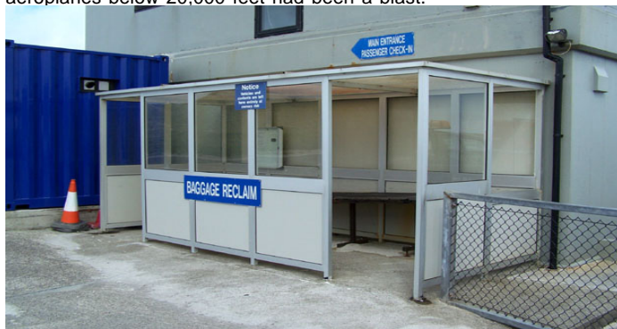
The "terminal" at Barra

Our final flight was back to Leeds, but before that some food was called for, accompanied by a bit more spotting from the Caledonian Café. All too soon we were heading south at 17,000 feet, aboard G-LGNB, into increasingly thick cloud and gloomy weather. With the comforting steady drone of the CT7 turboprops, my mind drifted back to the sights and sounds of beautiful Barra, the white sand beaches and the Atlantic breakers. Our stay and the journeys in prop driven aeroplanes below 20,000 feet had been a blast.