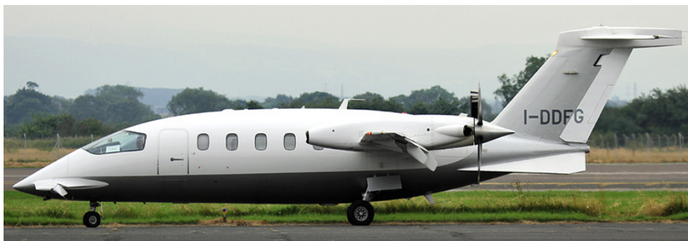
The distinctive shape of Avanti I-DDFG taxiing for departure from Teesside, 27/9

ULROME:- XZ592/H Sea King HAR.3 landed on the cliff top with an oil leak on 3.9 and was still present on 4.9 awaiting repair. The crew were picked up by another Sea King from Leconfield.