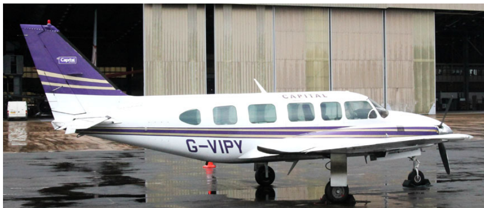
PA-31 Cheftain G-VIPY of Capital Aviation at East Midlands, 02/08/12(Rod Hudson)