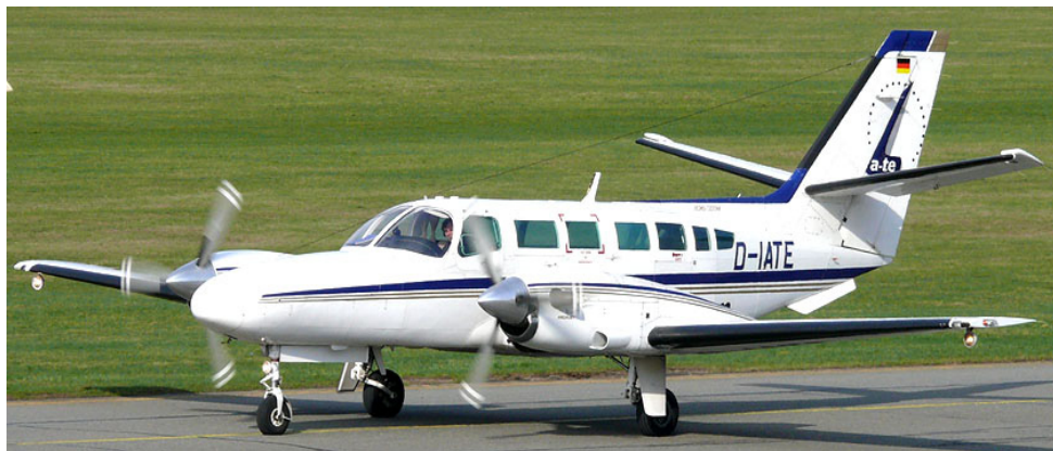
Making its first visit to LBIA on 22/8 was Cessna F.406 Caravan 2 D-IATE of Air Taxi Europe

GENERAL AVIATION:- Beech F.33 G-OAHC from Lee-on-Solent(1226), n/s to Duxford(1204)