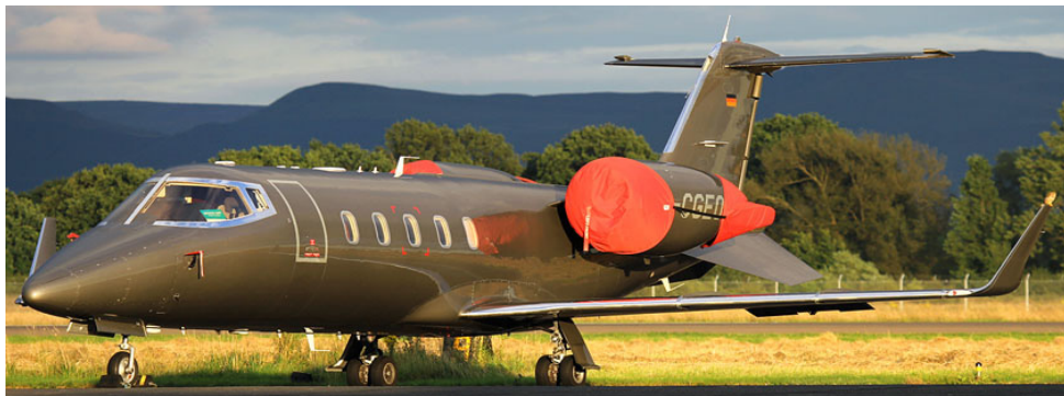
Lear Jet 60 D-CDEO, operated by Silver Bird spent two days at Teesside in early August

ASW19B, G-CJHZ ASW20, G-CJVZ ASK21, G-CKFN DG.1000S, G-CKFV LS8, G-CKJH DG.303, G-CKND DG.1000T, G-CKRN G.102, G-DBWO T.51, G-DDKC K.8B, G-DDZY ASW19B, G-DECJ T.65A, G-DEDM BG.200, G-DEHC SB-5B, G-DESB ASK21. G-DEUF SZD.50-3, G-DHSJ Discus b, G-DKFU Ventus 2cxT, G-EEBM G.102, G-KHCC Ventus bT, G-KKAM ASW22BLE, G-KUGG ASW27, G-OJNE Nimbus 3T, G-ORIG DG.800A, G-OSUT SF.25C, (ATH)/BGA.643 T.15, (AVQ)/BGA.698 T.34A, (AZX)/BGA.801 T.41, (BEX)/BGA.920 T.43, (BLE)/BGA.1047 T.50, (BQP)/BGA.1152 T.30B, (BRA)/BGA.1163 T.49B, (BSZ)/BGA.1210 T.50 and (DPG)/BGA.2267 Mu.13D.