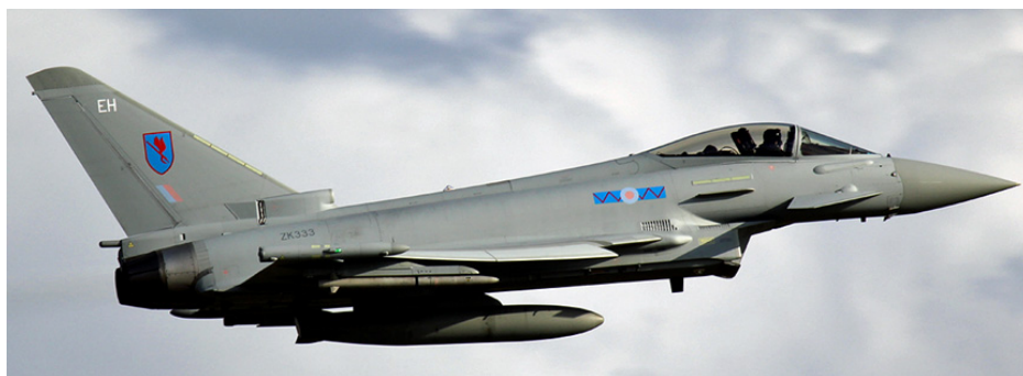
Fine study of Leuchars based Typhoon ZK333/EH carrying out an overshoot at Teesside

Note the registration and Cobham titles have been covered with plastic bags.