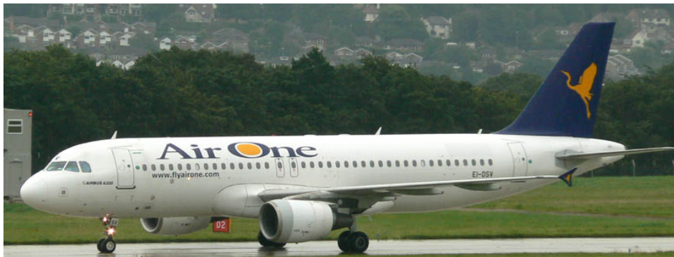
Alitalia A.320 EI-DSV in Air One colours arriving from Rome on a student charter, 19/8.

GENERAL AVIATION:- Having arrived last month for attention from Multiflight Engineering, PA-28 G-AYAW returned home to Fishburn at 0911. PA-28 Warrior G-OWAP from Benson(1002) to Bournemouth(1609). King Air 90 G-MOSJ (Enzo 604/604P) from Belfast City(1141) to Liverpool(1223).