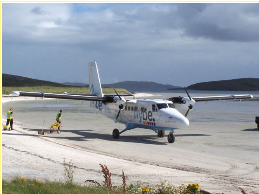
G-BVVK Twin Otter, Loganair/Flybe On the beach at Barra, 21/08/12 Jim Stanfield