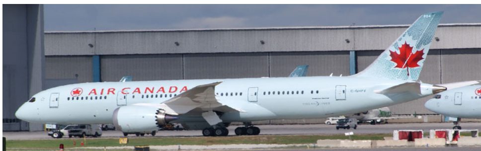
The latest Boeing 787 for Air Canda C-GHPV at Toronto On 4/10(Ian Morton)

Qantas is taking the bold step of removing life rafts from 38 planes that fly on domestic routes to cut down on fuel costs. Life rafts will still be deployed on aircraft that fly over long stretches of water, the airline said. "The majority of our Boeing 737s operate between Australian mainland cities and don't fly over long stretches of water, so rafts simply aren't required, even as a precaution," said Mike Plottel, head of safety. "The simple rule of thumb is that all Qantas aircraft that need to carry life rafts, which is all of our international aircraft and about half of our B737s, will have them onboard," he added. Some Qantas pilots and crew have criticised the policy but the Civil Aviation Safety Authority said it is in accordance with international rules and Australia's air safety regulations. Rival Virgin Australia is also considering a similar move on some of its planes. Qantas is embarking on a major cost-cutting drive after posting a record A$2.84 billion loss this financial year.