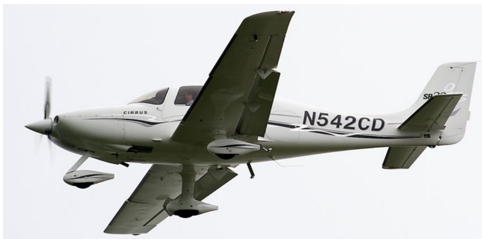
Cirrus SR.22 N542CD on finals to runway 32 on 28/8, inbound from Biggin Hill(D. Blaker)