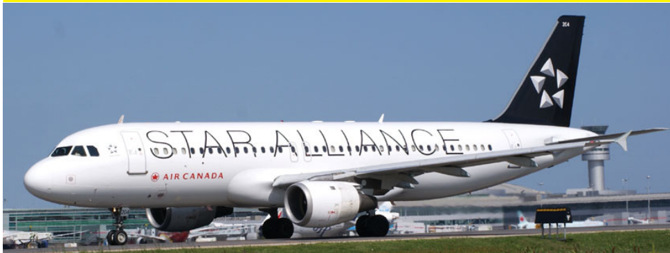
Airbus A.320 C-FDRK of Air Canada/Star Alliance at Toronto/Pearson, 10/08/14(Ian Morton)