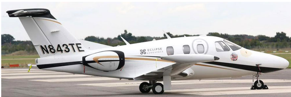
Eclipse Jet N843TE arrived on 15/8 and stayed 3 days