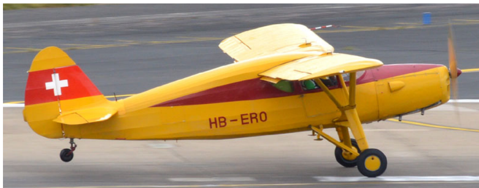
1943 vintage Fairchild Argus called for fuel enroute from Scotland home to Switzerland