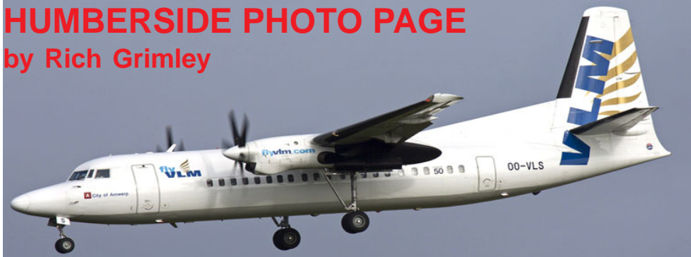
Fokker 50 OO-VLS of VLM arriving on a charter flight, 29/8