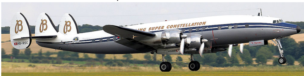
Breitling sponsored Super Constellation HB-RSC