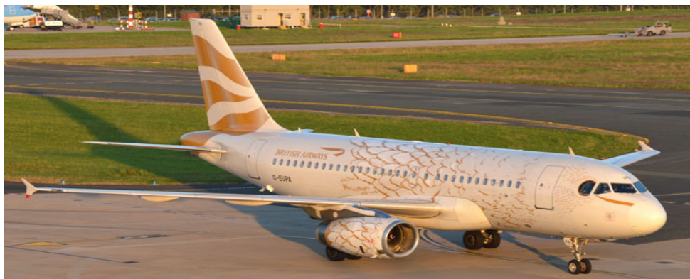
BA A319 G-EUPA taxiing onto stand 7 on arrival from Heathrow, still in Dove scheme

Additional flights:-1/8 G-MAJK positioned out to Aberdeen(51P)