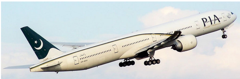
Boeing 777/300 AP-BHV of Pakistan International departing Birmingham, 05/08/14(Jim Stansfield)