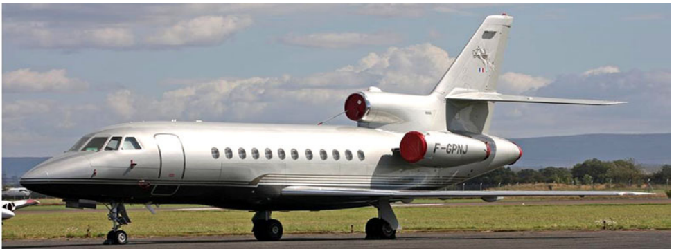
Another shooting party arrived on board Falcon 900EX F-GPNJ of Aero Vision on 26/8