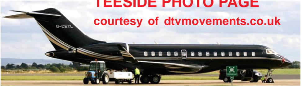
Striking Global Express G-CEYL of Aravco arrived with a shooting party on 12/8