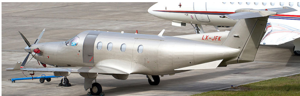
PC-12 LX-JFK of Jetfly parked on Multiflight/East apron, 20/8(David Blaker)