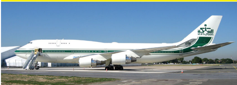
Boeing 747/400 HZ-WBT7 of Kingdom Holdings, Prague. 14/09/14(Martin Zaplatal)