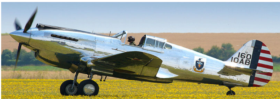
Highly polished aluminium of the Curtiss Warhawk N80FR