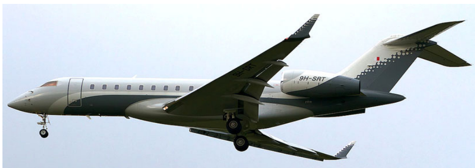
Global Express 9H-SRT of Hyperion A/V brought pax for York Races on 18/8(David Blaker)