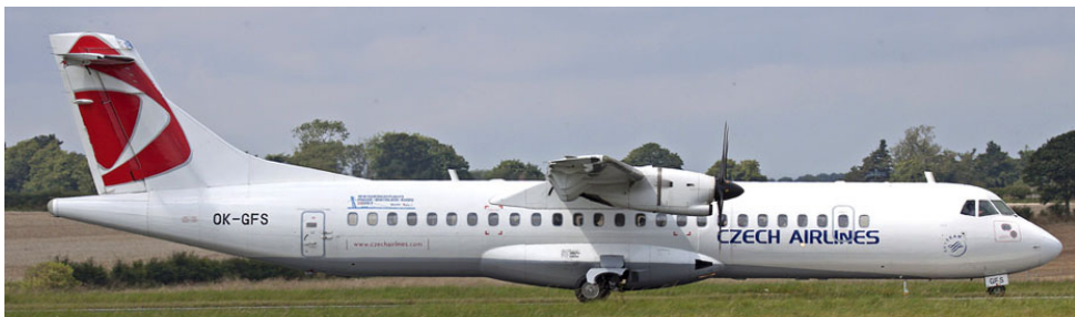
ATR-72 OK-GFS brought Trenchen FC on 5/8, for their Europa League match at Hull