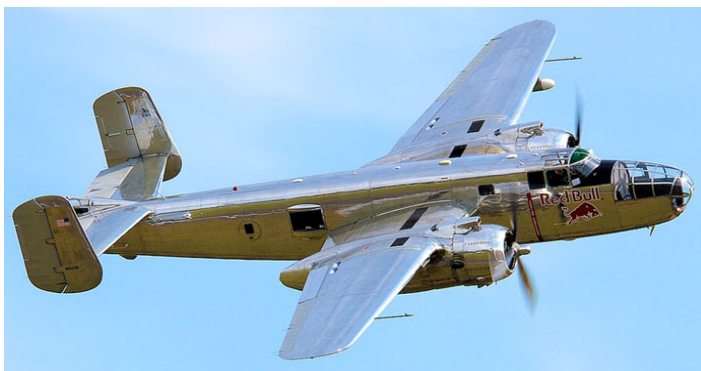
Red Bull sponsored B-25J Mitchell N6123C