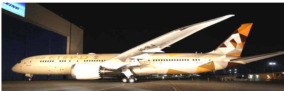
ETHIAD has launches a new colour scheme, seen here applied to Boeing 777 A6-BLA

Bridgepoint, which owns Leeds-Bradford Airport, has bought British foreign exchange provider Moneycorp for £212m, Moneycorp is owned by SOF Investments, which was spun out of Royal Bank of Scotland in 2013 as part of the state-owned bank's plans to shed non-core divisions. Moneycorp focuses on both small businesses and private consumers through services that include an online payments and telephone platform, as well as bureaux de change at Heathrow and Gatwick airports. The group is aiming for a bigger share of the foreign currency and money transfer business, where banks have traditionally been major players. Last year, the firm bought Thomas Cook's corporate forex business. Moneycorp had gross income of £97.2m in 2013 and handled more than £10bn of currency trades across almost 100 currencies. Bridgepoint, which also has investments in cafe chain Pret A Manger and clothing retailer FatFace, was advised by DC Advisory. SOF Investments was advised by Canaccord Genuity.