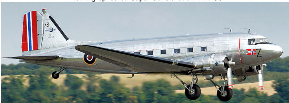
The Noway Dakota DC-3 carried out a very sprightly display