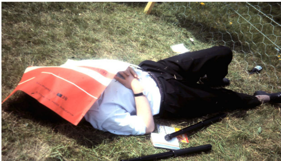
The overnight coach trip takes its toll. Biggin Hill Air Fare May 1965. But who is it? Answers on a postcard to the Editor.