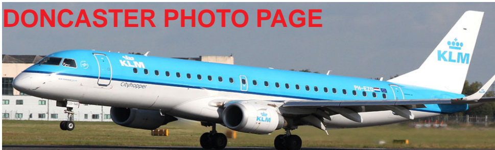
KLM Embraer 190 PH-EZO crew training on 4/8(Clive Featherstone)