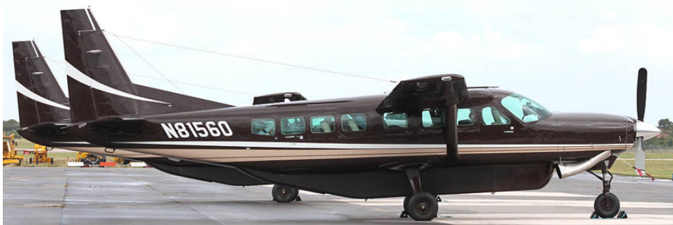
On delivery to Abu Dhabi A/F, Cessna 208s N81560/2, 13/8(Clive Featherstone)