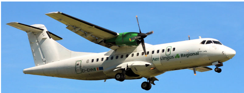
EI-EHH ATR42-300 Aer Arann