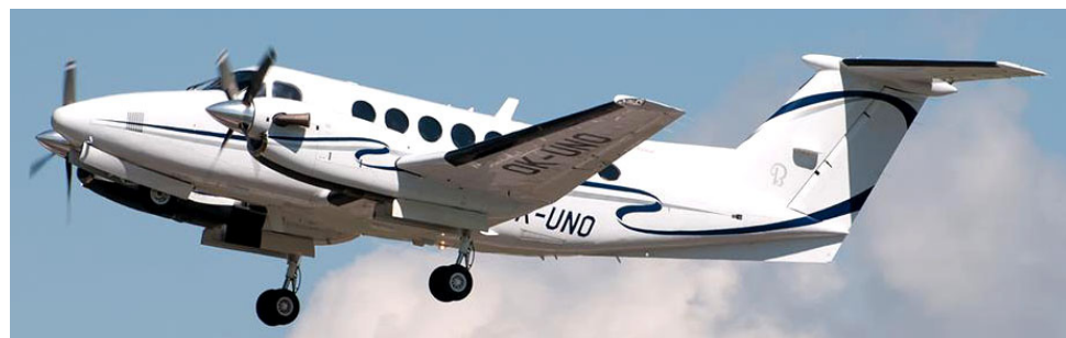
King Air 200 OK-UNO of Air Prague visit on 2/8, f/t Bari and only stayed a short time