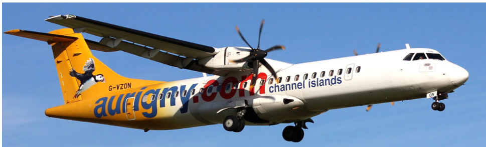
G-VZON ATR 72-212A of Aurigny Air Services

Some shots taken from the Airport Hotel pub-garden Manchester Airport on a lovely sunny afternoon in late June 2014. Above is Dornier 328-110 G-BZOG of Suckling Airways.