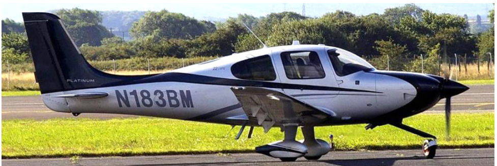
UK based Cirrus SR.22 N183BM taxiing onto stand, following its arrival on 3/8