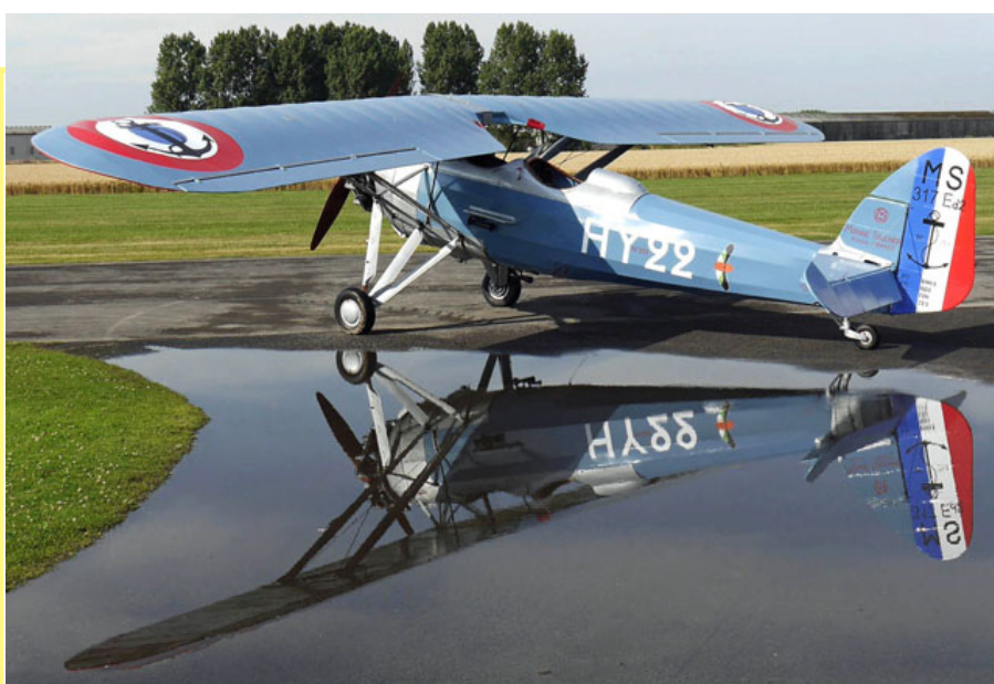
G-MOSA Morane Saulnier MS.317 at Brighton, 19/07/14 Rod Hudson