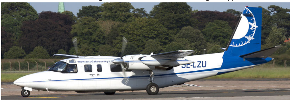
Commander 690 SE-LZU dropped in on 4/8 while carrying out survey work in the area