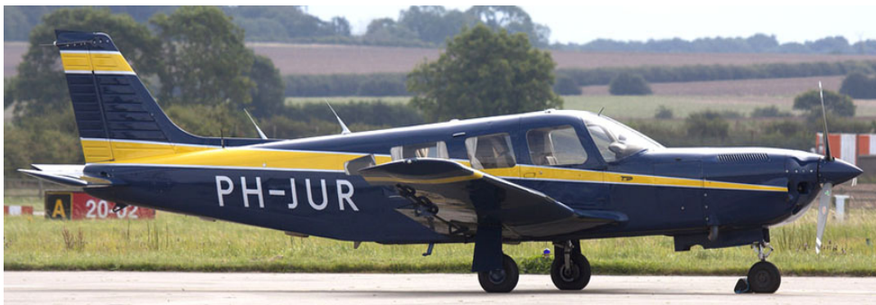
PA-32RT Saratoga PH-JUR arrived on 21/8 and night-stopped