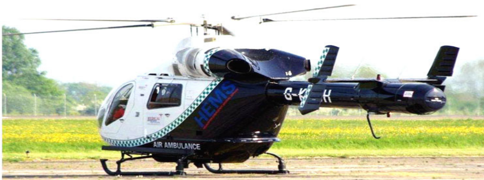
MD-902 Explorer G-KSSH has been based at Nostell Priory with the YAA recently

SALTBY:- From the Resident Review delete G-CHDA Pilatus B4-PC11AF which has moved to Camphill.