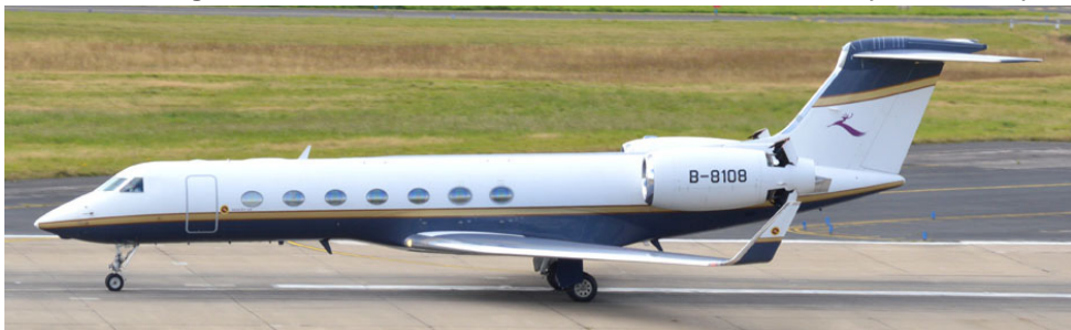
Operated by Beijing Capital, Gulfstream 5 B-8108 is the first Chinese aircraft to visit LBIA On 30/8 this aircraft became the first aircraft to fly direct to China from LBIA