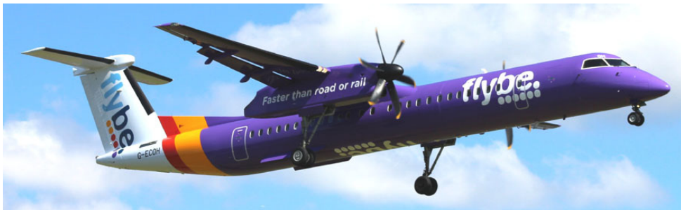
G-ECOH DHC-8-420Q Flybe