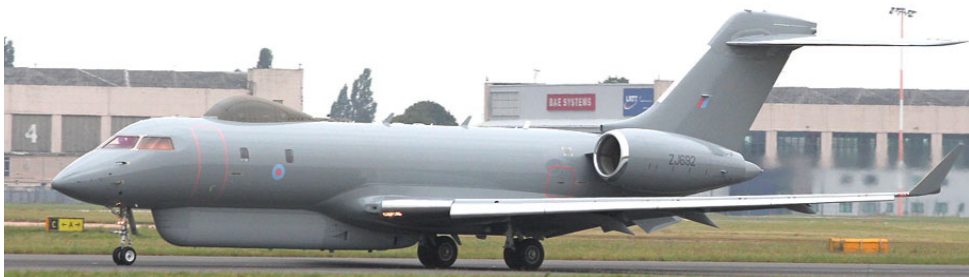
RAF Sentinel ZJ692 crew training on 1/8(Clive Featherstone)