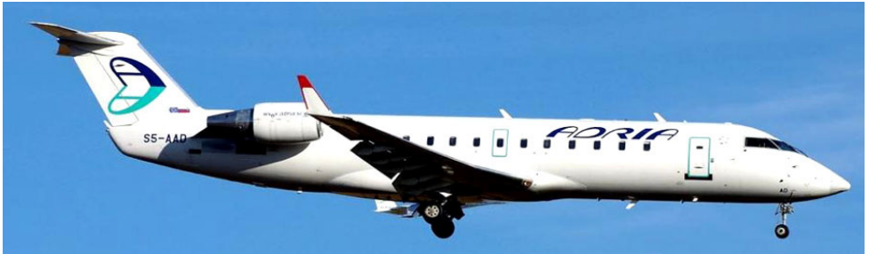
CRJ-200 S5-AAD of Adria arriving on a charter, 8/8