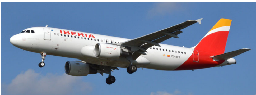
One of the latest additions to the Iberia fleet, Airbus A.320 EC-MCS landing at Heathrow on 31/9