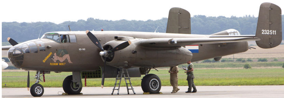
An interesting arrival at Humberside on 2/8 was B-25 Mitchell PH-XXV/223511 The aircraft carried out a flypast at East Kirkby the following day(Rich Grimley)

HIBALDSTOW:- With a parachute competition in progress HA-ACO Do.28D-2 (4335), HA-HIB Do.28D-2 (4328) and HA-VOC Do.28D-2 (4331) were very active on 7.9, HA-YDF SMG.92 (01-0005) was in the small hangar whilst the large hangar held G-ASDK A.61 being restored back to its military marks of VF631.