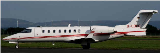
D-CDOC Learjet 45