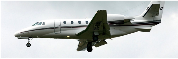
CS-DXQ Citation 560XL XLS