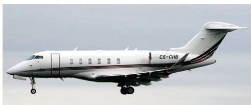
CS-CHB BD-100 Challenger 350