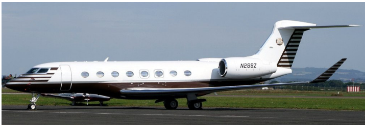
N288Z Gulfstream G650