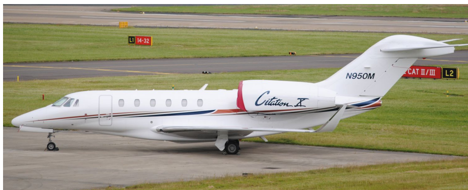
N950M Cessna 750 Citation X LBA 14/07/2015 (Steve Lord)