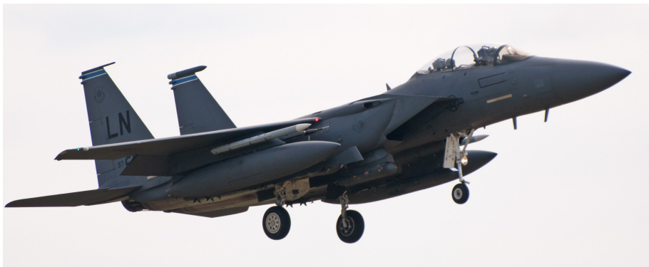
97-0218 Boeing F-15E Strike Eagle Lakenheath 03/08/2015 (Andrew Coverdale)