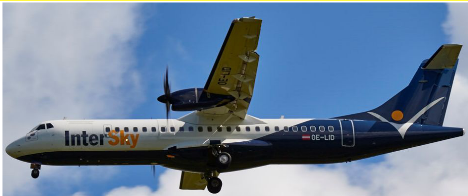
OE-LID ATR 72-600 Intersky July 2015 (David Blaker)