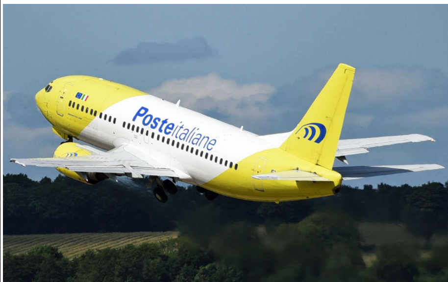
EI-DVA Boeing 737-33A Mistral Air LBA 9 July 2015 Rod Hudson