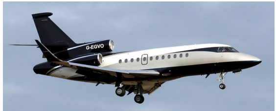
G-EGVO Falcon 900EX EASy

f Brize Norton C/T RAF - Transp Wing, ZF339 Tucano T1 f Linton O/S RAF - 1 FTS, ZH001 BN-2T Defender AL2 f/t Aldergrove AAC - 651 sqdn, 9H-SRT BD700 Global Express XRS t Nice Arrived 29/098 Hyperion Aviation, G-MCAN Agusta 109S Grand f Local Site t ? Castle Air. The Hercules was here doing some crew training till about 11am.