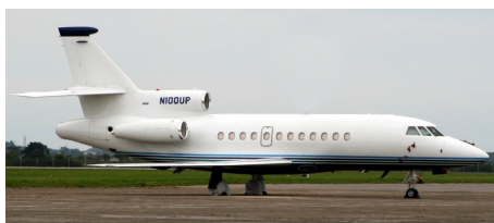
N100UP Falcon 900B