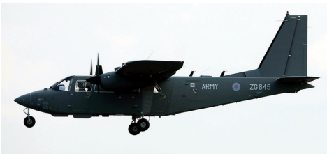
ZG845 BN2T Islander AL1