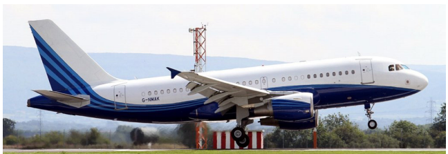
G-NMAK Airbus A319-115X CJ