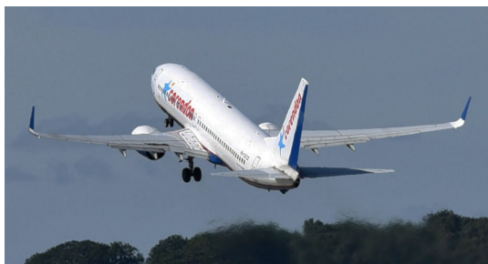
PH-CDG Corendon Boeing 737-800 9 July 2015