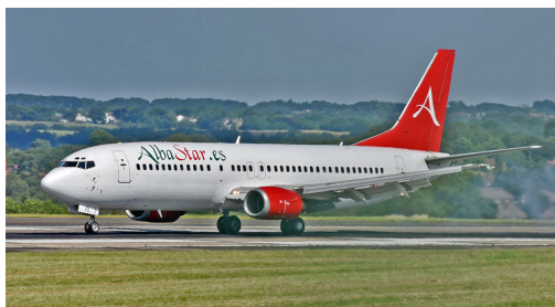
EC-MFS Albastar Boeing 737-4Y0 9 July 2015 Rod Hudson

Based Aircraft:-G-FDZT(1/7), G-FDZD(1/7-3/7), G-TAWC(3/7-4/7, 11/7-30/7), G-FDZJ(5/7-10/7), G-FDZZ(30/7-31/7).