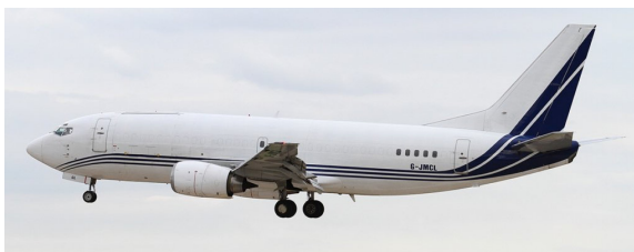
G-JMCL Boeing 737- 322SF