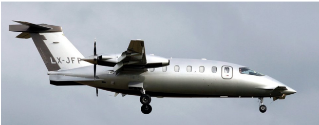
LX-JFP Piaggio P180 Avanti II