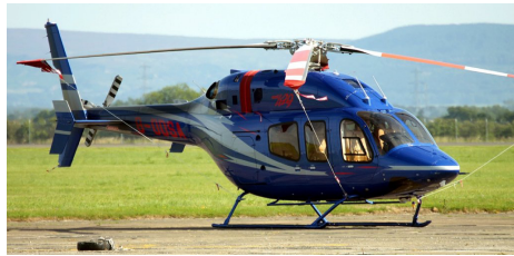
G-ODSA Bell 429 Global