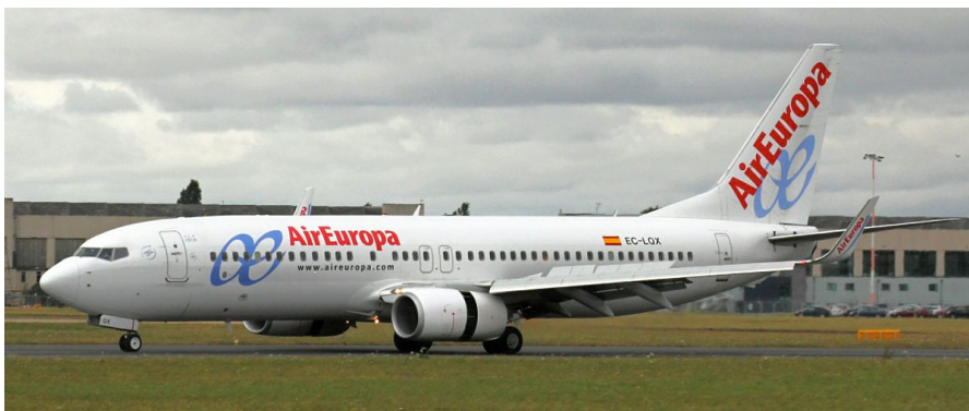
EC-LQX Boeing 737-800 Air Europe 11/08