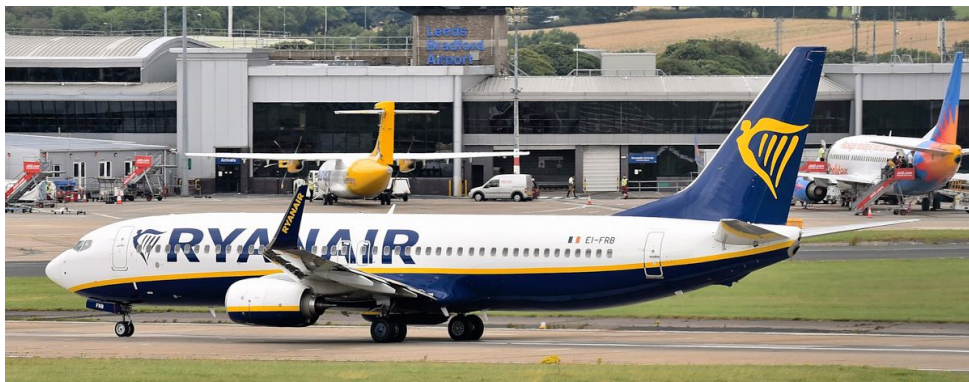
EI-FRB Boeing 737-8AS Ryanair 13/08 Rod Hudson

Tenerife (2493/2492 "56ZW/47JH" -various):-6/8 EI-EKW, 13/8 EI-EMK, 20/8 EI-DHV, 27/8 EI-EVT.