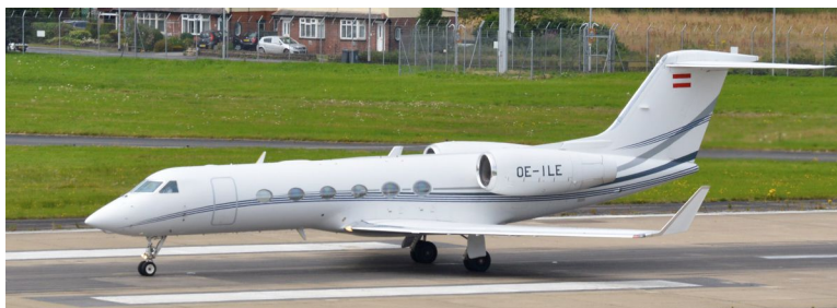
OE-ILE Gulfstream G450 05/08

Gulfstream G450 OE-ILE arr 10:53 from Belfast n/s, Cessna 510 Mustang G-KLNW f/t Norwich (12:18/12:55), Cirrus SR20 N203CD f/t Liverpool (13:56/14:47), Grob G115 Tutor G-BYXG dep 13:59 to Linton-on-ouse, Cessna 550 Citation M-WOOD arr 16:06 from Farnborough dep 17:03 to Staverton, Agusta A109 G-SKBH arr 16:21 from Wickenby dep 16:53 to Carlisle (fuel), Agusta A109S Grand G-HRDB arr 16:25 dep 17:23, Phenom 100 9H-FAM arr 17:13 from Luton n/s,