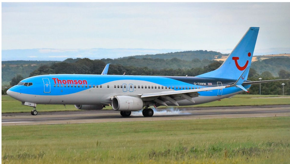
G-TAWM Boeing 737-8K5 Thomson 13/08 Rod Hudson