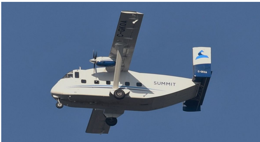
C-GKOA Shorts SC7 Skyvan Over Birstall 29/08 Rod Hudson