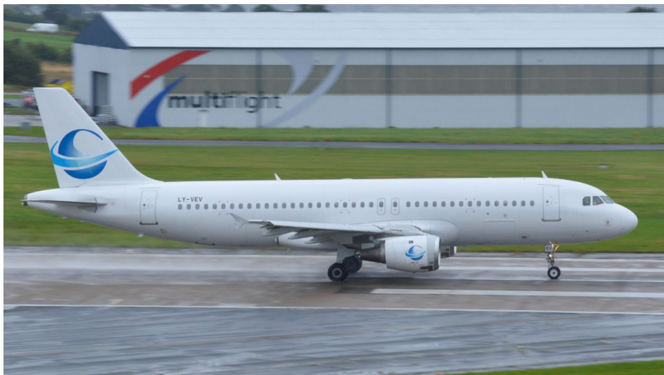
LY-VEV Airbus A320 Avion Express for Vueling 22/08

Barcelona (8794/8795) :-1/8 EC-KDX, 5/8 EC-LZF, 9/8 EC-MEQ, 12/8 EC-LVB, 15/8 SX-BHN, 19/8 EC-KDT, 22/8 LY-VEV, 26/8 EC-LRY, 29/8 EC-LVC.