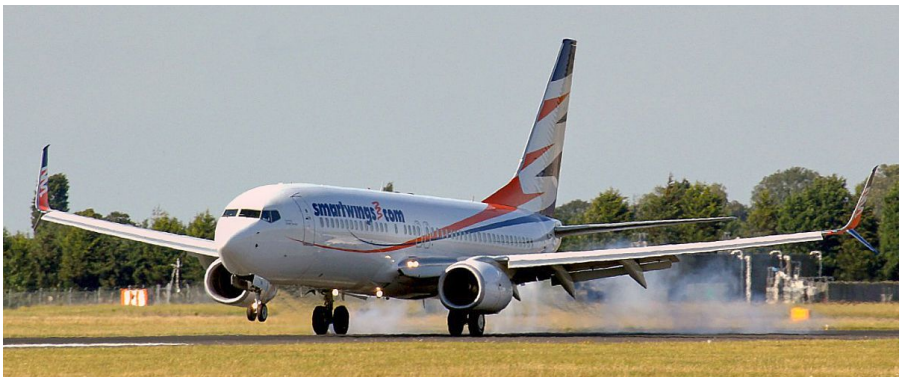
OK-TVU Boeing 737-800 Smart Wings 30/08

(FV) First Visit. (T) Training. (H) Helicopter. (F) Freighter. (M) Maintenance (RTB) Return to Base