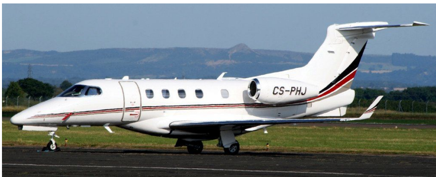
CS-PHJ Emb-505 Phenom Netjets Europe 16/08