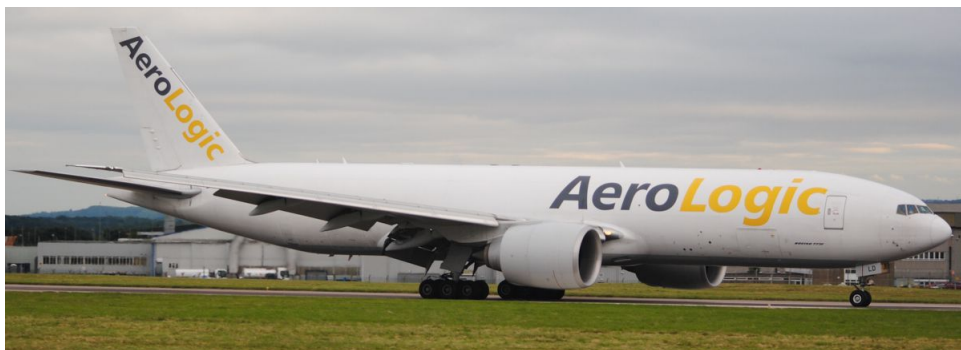
D-AALD Boeing 777F Aero Logic