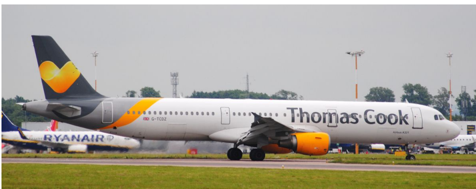
G-TCDZ Airbus A321 Thomas Cook