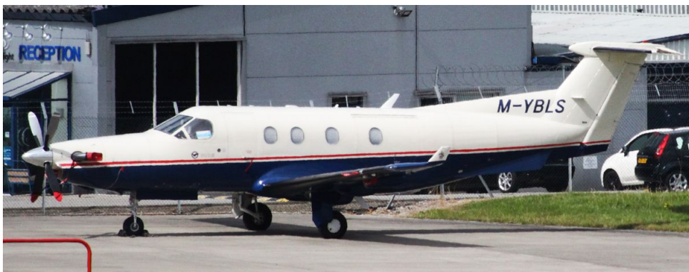
M-YBLS Pilatus PC12 17/08 Mike Storey