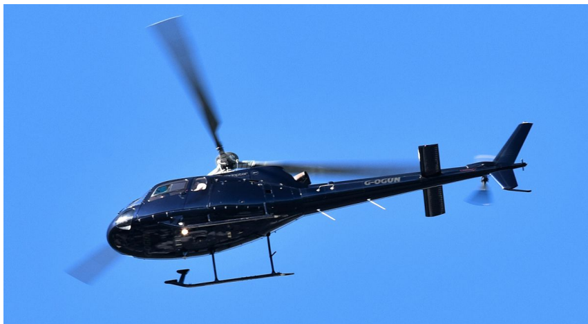
G-OGUN Eurocopter AS.350B2 Ecureuil Birstall 29/08 Rod Hudson