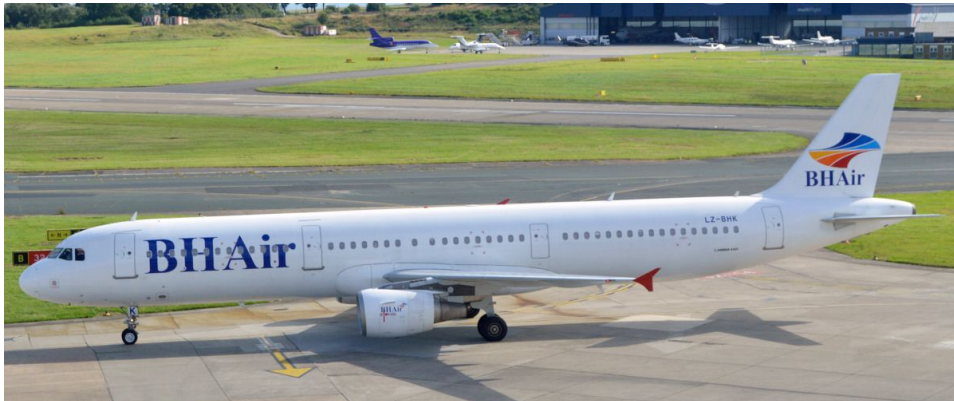
LZ-BHK Airbus A321 BH Air 06/08

This company operates weekly Saturday charter flight using A320/A319 aircraft through the Summer. Bourgas "5569/5570" :- 6/8 LZ-BHK, 13/8 LZ-BHK, 20/8 LZ-BHK, 27/8 LZ-BHK.