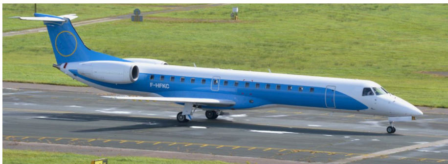
G-HFKC Legacy 600 Enhance Aero Positioning

Cessna 560XLS CS-DXU dep 10:22 to EMA as NJE391B, Legacy 600 F-HFKC dep 14:12 to Cardiff,