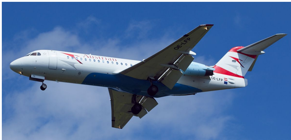
OE-LFP Fokker 70 Austrian 06/08 David Blaker

Innsbruck "2587/2588"):- 6/8 OE-LFP, 13/8 OE-LFQ, 20/8 OE-LFP, 27/8 OE-LFQ.