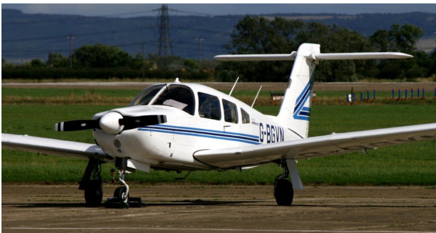
G-BGVN Piper PA-28RT Arrow IV 31/08