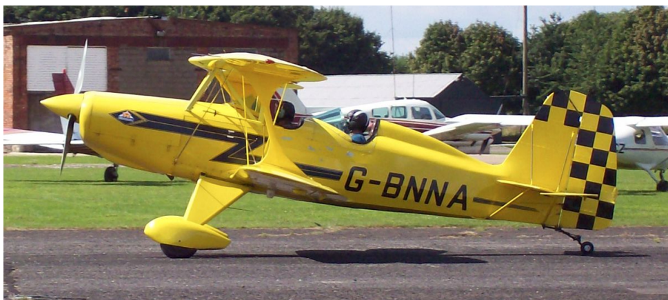
G-BNNA SA.300 Starduster Too