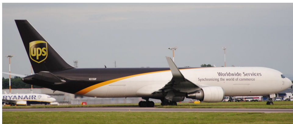
N315UP Boeing 767F UPS