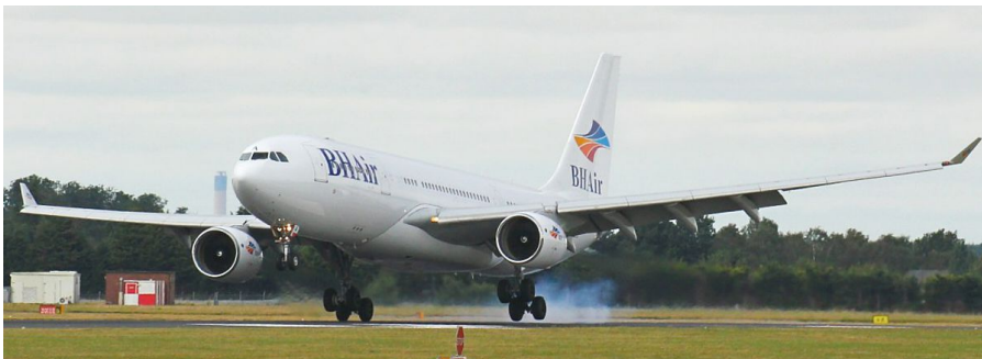
LZ-AWA Airbus A330-200 BH Air 11/08