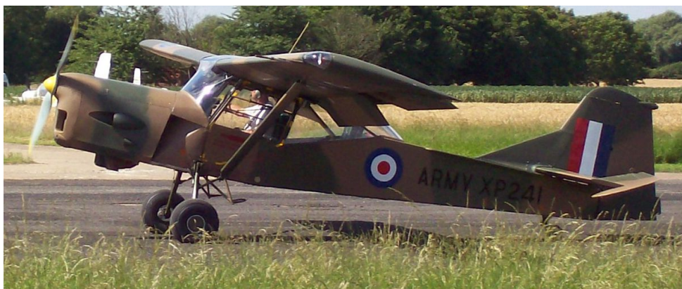
G-CEHR-XP241 Auster AOP9