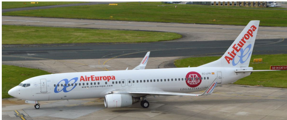
EC-LPR Boeing 737-800 Air Europa 05/08

Palma(337/338):- 5/8 EC-LPR, 12/8 EC-LQX, 19/8 EC-JHL, 26/8 EC-JNF.