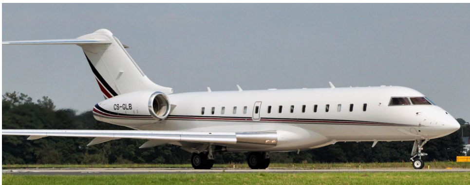
CS-GLB Global Express 17/08 Mike Storey

Beechjet 400 N719EL arr 07:43 from EMA dep 08:1 to Nice, Beech 200 Kingair M-WATJ dep 0:51 to Hurn, Beech C90 Kingair N95VB arr 07:56 from Slep dep 08:54 to Biggin Hill and f/t Biggin Hill (19:39/19:50), Cessna 560XL CS-DXN f/t Cork (11:14/16:16) c/s NJE 271B/098W, Global 6000 CS-GLB arr 12:27 from Luton as NJE659M dep 14:00 to Northolt as NJE865A, Piper Pa-31 Navajo G-UMMI f/t Northolt (17:57/20:17), Pilatus PC-XII M-YBLS dep 18:11 to Islay,