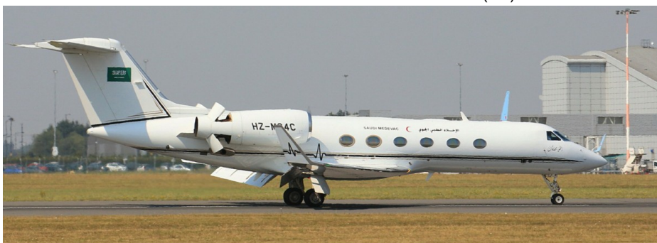
HZ-MS4C Gulfstream IV Saudi Armed Forces Medical Services 12/08