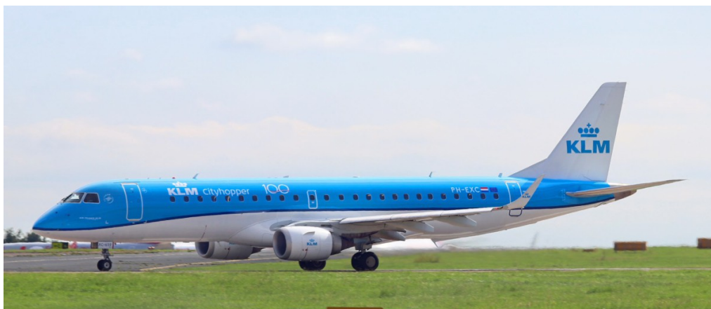
PH-EXC Embraer 190 KLM 08/08 Paul Whincup