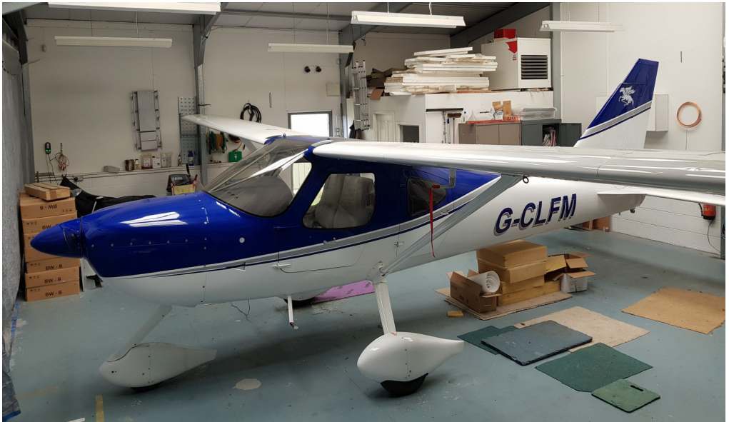
G-CLFM Glasair Sportsman

COVID-19 has also forced the cancellation of the first two ARG Open Cockpit Days on the 13 April and 10 May and a decision will be made on their two further open cockpit days as well as the planned Wings & Wheels event as the national situation evolves .