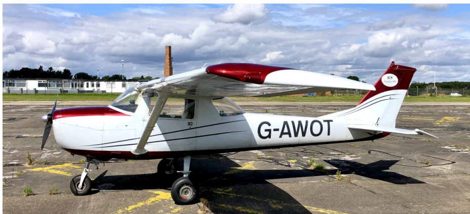
G-AWOT Cessna F150H 03/08