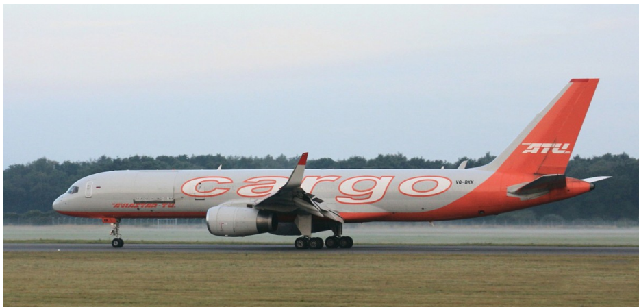
VQ-BKK Boeing 757-200 Aviastar-TU Cargo 19/08