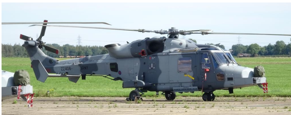
ZZ408 Westland Wildcat AH1 31/08