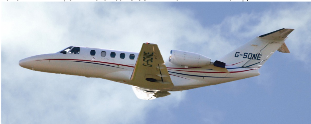
G-SONE Cessna 525A CJ2 07/08 Paul Whincup

Cessna 421C Golden Eagle G-ISAR arr 00:06 fr Belfast dep 00:46 to EMA ret to LBA at 20:53 fr Belfast and dep 21:44 to EMA, Cirrus SR22 N220AD arr 08:24 n/stop, Cessna 510 OE-FBD dep 09:00 to Liverpool, Bell 505 Jetranger X 2-BELL test flight dep 10:38 ret at 10:44, PA-28R Cherokee Arrow G-MEME arr 10:53 dep 16:15, Phenom 300 D-CHIC arr 11:11 fr Sion dep 15:28 to Hawarden, Cessna 525A CJ2 G-SONE arr 13:41 fr Alicante n/stop,