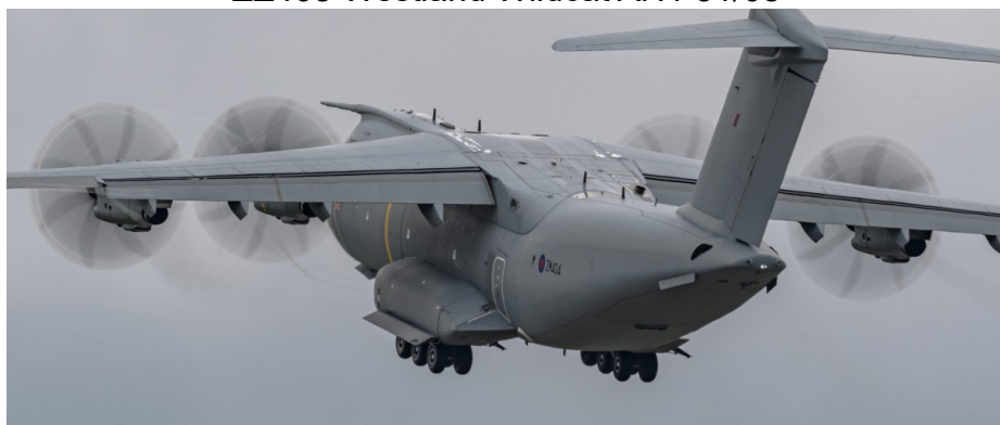
Airbus A400M Atlas C1 17/08