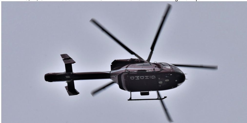
G-HDMD MD-900 Explorer 06/08 Rod Hudson

Learjet 75 G-USHA arr 09:44 fr IOM dep 10:28 to faro, Diamond DA40 Star G-EMDM arr 16:03 fr Oxford n/stop, Mooney M20K G-JBRD dep 16:14 to Dunkeswell, Cessna 525A CJ2 D-ISUN arr 18:07 fr Malpensa n/stop, Cirrus SR22T N53LG arr 18:33 fr Denham local flight at 19:10 arr back at 19:42, Cessna 680 Latitude CS-LTB arr 19:25 fr Farnborough n/stop.