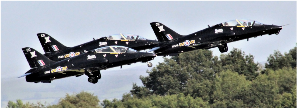
XX348/XX318/XX187 BAE Hawks