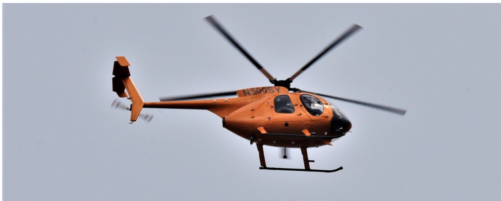
N500SY Hughes 369E (500) 05/08 Rod Hudson