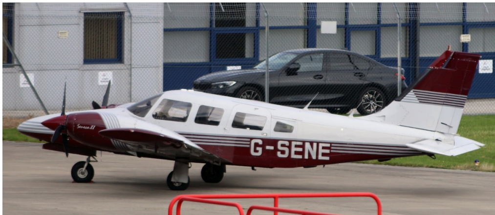
G-SENE PA-34 Seneca 30/08 Paul Whincup

PA-34 Seneca G-SENE f/t Elstree (10:35/16:23), Cirrus SR20 N939SR dep 10:57 to Church Fenton, Cessna 680 Latitude OE-LGR arr 11:45 fr Le Bourget dep 13:14 to Mikonos, Cirrus Sr22 N677CD arr 12:45 fr Doncaster n/stop, Bell 505 Jetranger X 2-BELL dep 14:05, Cessna 525A CJ2 9H-ALL dep 15:01 to Baden-Baden, falcon 2000EX CS-DLD arr 15:15 fr Portorož eurocopter EC155 G-LCPX arr 19:23 n/stop.