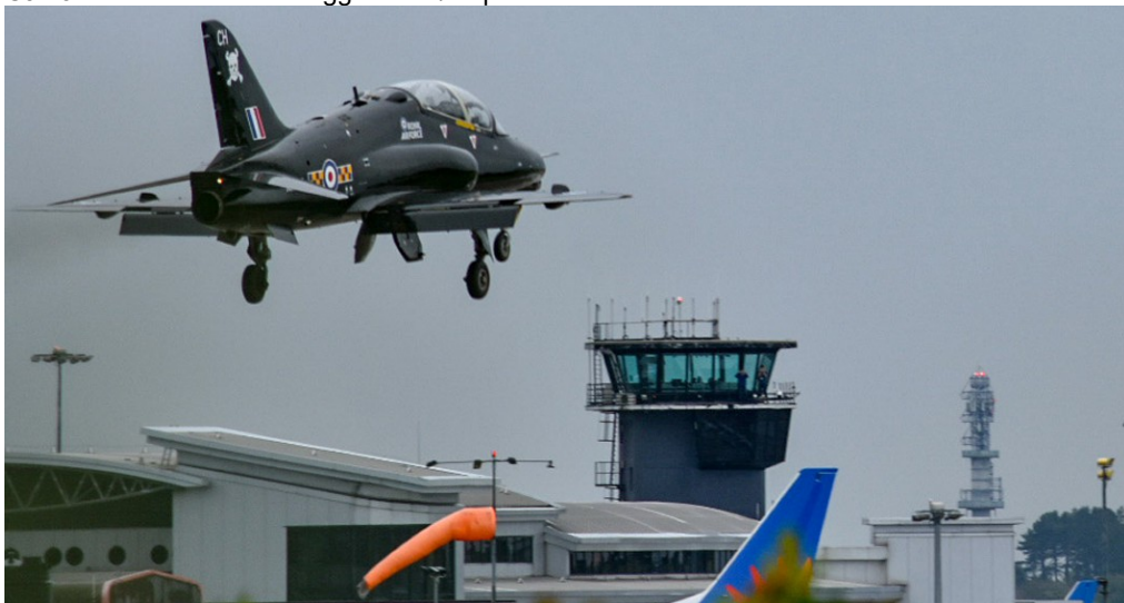
T1 XX198 BAE Hawk 04/08 Claire Issott

BAE Hawk T1 XX198 overshoot at 11:02 c/s Pirate29, Cessna 560 Excel G-OJER f/t Jersey (12:00/14:00), Beechjet 400 SP-TTA arr 13:10 fr Glasgow dep 14:13 to Palma, Cessna 525A CJ2 9H-ALL arr 14:44 fr Biggin Hill n/stop.