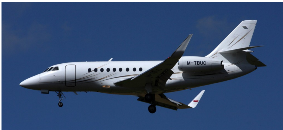
M-TBUC Falcon 2000LX 20/08

20/08 2-SALE Diamond DA62 f/t Liverpool Morson Group Ltd, D-CSCA Ce525B CitationJet CJ3 f Hamburg n/s Silver Cloud Air, OY-JJI Hawker 4000 Horizon f Shannon t Billund Sun-Air, M-TBUC Falcon 2000LX f Exeter t Farnborough Blackthorn Aviation, G-ATSZ Piper PA-30 Twin Comanche f/t Cambridge, G-IRJE Diamond DA-62 n/s t Liverpool Sere Ltd, G-HARG Embraer 550 Legacy 500 f Faro t Bristol Centreline Aviation, G-IRJE Diamond DA-62 f Belfast International n/s Sere Ltd