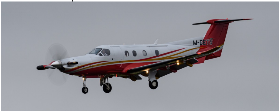
M-GETS Pilatus PC12/47E 16/08

16/08 D-CANG Ce560 Citation Excel S+ f Olbia t Aberdeen Air Hamburg, M-GETS Pilatus PC12/47E f Denham t Southampton 3FS Aviation, G-LAUD Cessna 208A Amphibian f ? n/s Loch Lomond Seaplanes