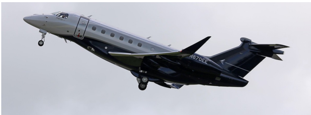
N670E Embraer Praetor 600 E 02/08 Paul Whincup

Monday 3 rd August – no movements to note