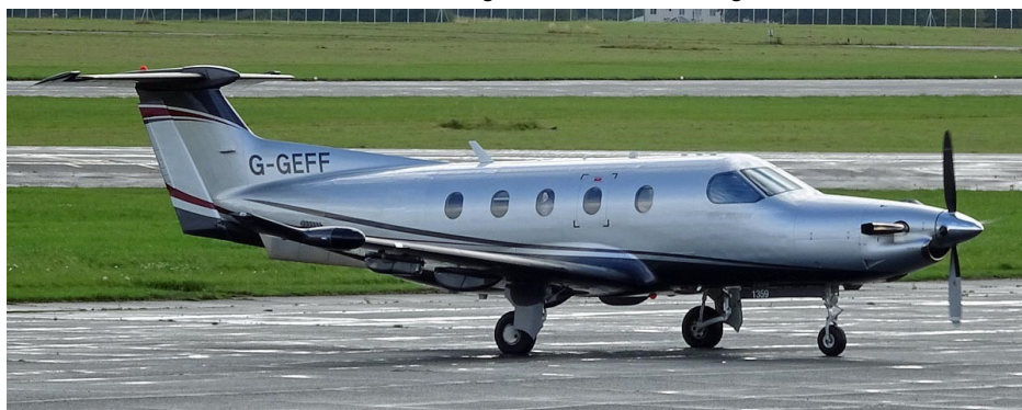
G-GEFF Pilatus PC-12 23/08

21/08 LN-RRN Boeing 737-783 f Oslo n/s Willis Asset Management 22/08 G-CSIX Piper PA32-300 Cherokee Six f Oxford Kidlington n/s, LX-JFQ Pilatus PC-12 f/t Denham Jetfly Aviation, G-ATRM Cessna F150F f/t Eshott North East Aviation 23/08 G-CSIX Piper PA32-300 Cherokee Six n/s t Oxford Kidlington, D-CSCA Ce525B CitationJet CJ3 arrived 20/08 t Hamburg Silver Cloud Air, G-TCUK Agusta A109 Grand f Private site t Biggin Hill Castle Air, G-GCVV Cirrus SR-22T f East Midlands t/f Local flight t East Midlands, G-GEFF Pilatus PC-12 f Cannes t Bagby GT Aviation, OE-FPP Ce510 Citation Mustang f Blackbushe t Glasgow GlobeAir