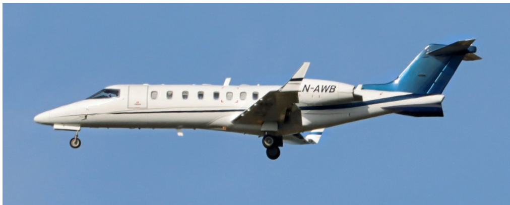
LN-AWB Learjet 45 08/08 Paul Whincup