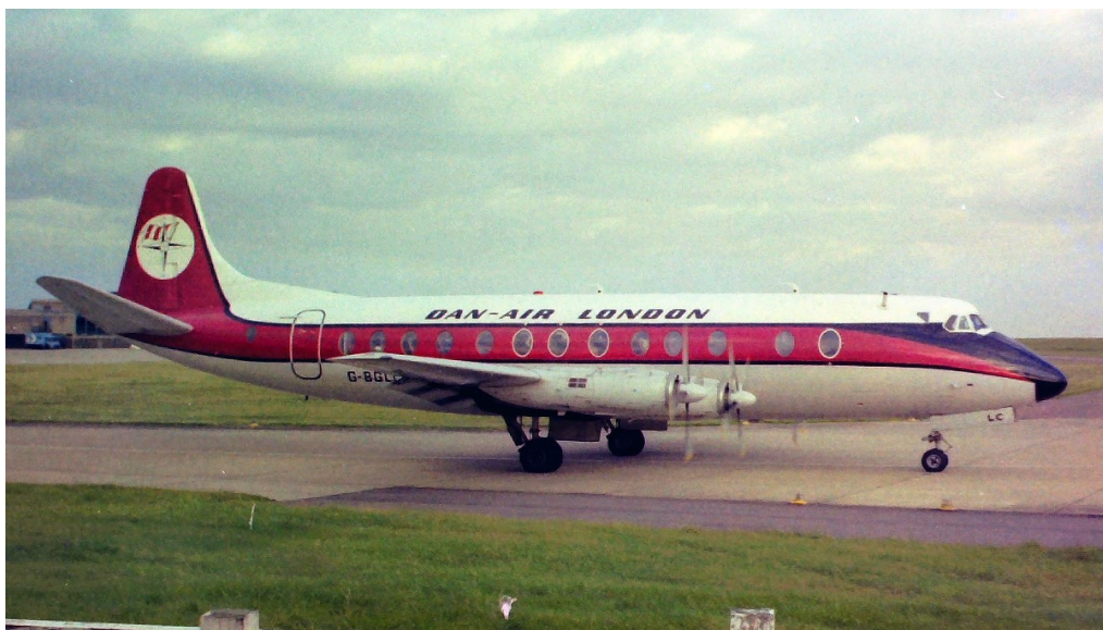
G-BGLC Vickers Viscount Dan Air Approx 1979