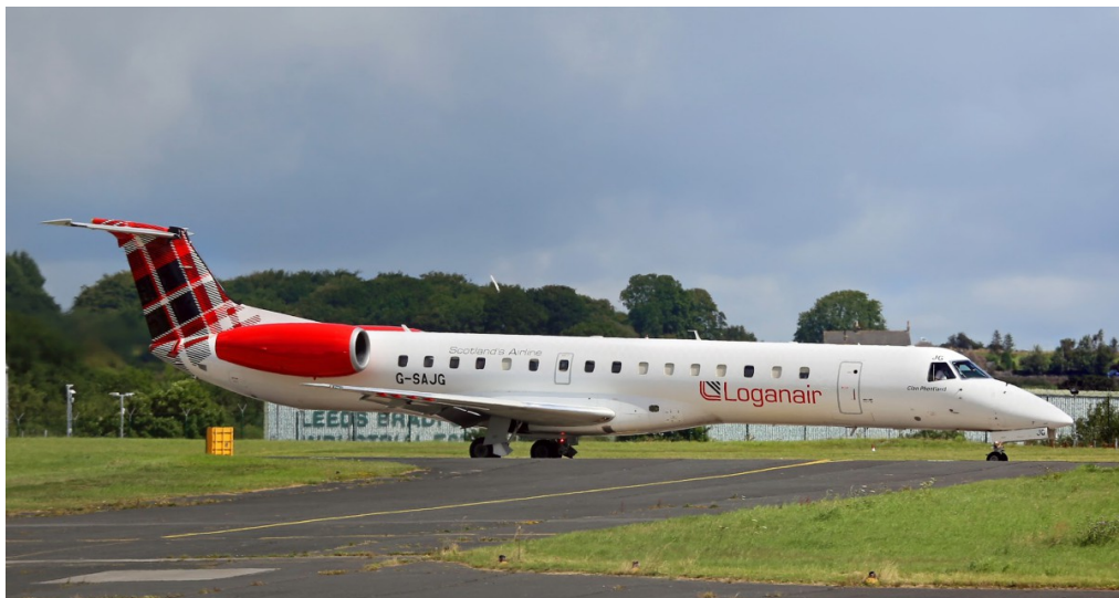
G-SAJG Embraer 145 Loganair 02/08 Paul Whincup

Loganair (LOG/LM, “Logan”):- 2/8 G-SAJG(840/841) operated charter in from/back to Perpignan, 8/8 G-SAJU(841/842) operated charter in from/out to Perpignan,