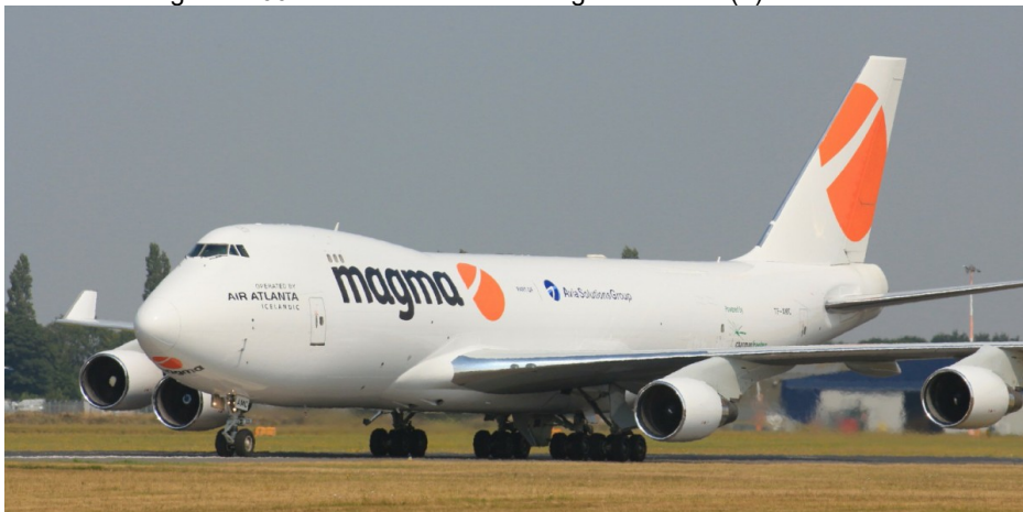
TF-AMP Boeing 747-400 Air Atlanta Icelandic Magma 15/08