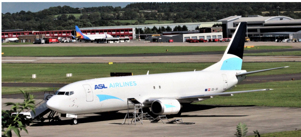
OE-IBI Boeing 737-490SF ASL Airlines 19/08 Mike Storey

ASL Airlines Belgium(TAY/3V, “Quality”):- 19/8 OE-IBI(1476/1477) operated charter flight in from/out to Shannon, 20/8 OE-IBO(1476/1477) operated charter flight in from/out to Shannon,