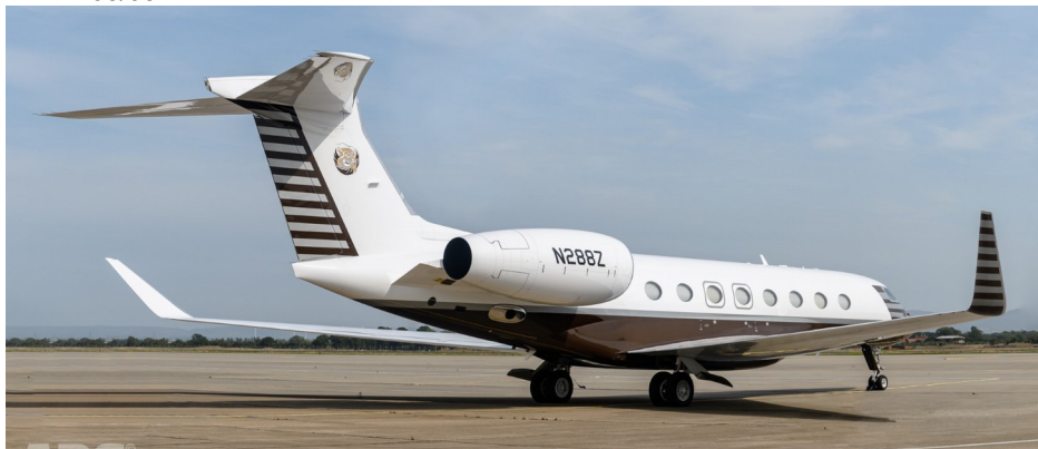
N288Z Gulfstream G650 15/08

15/08 OY-JJI Hawker 4000 Horizon f Billund t Shannon Sun-Air, N288Z Gulfstream G650 arrived 08/08 t North Eleuthera