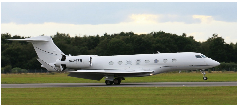
N628TS Teslar Gulfstream VI-G650ER Falcon Landing LLC/ Elon Musk 30/08