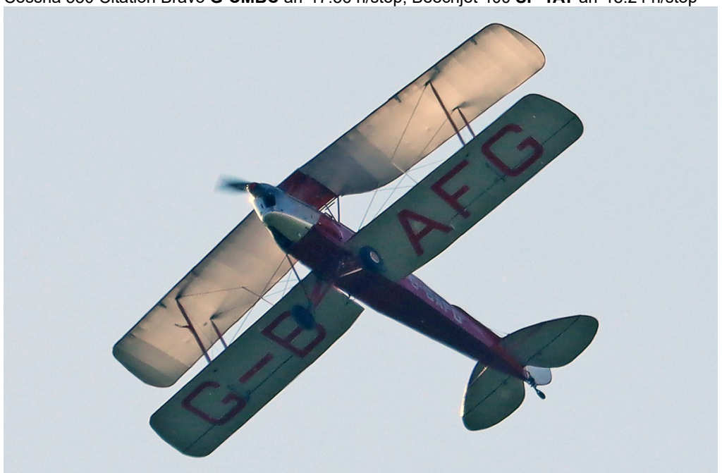
G-BAFG DH82 Tiger Moth LBA Overflight 28/08 Paul Whincup

Cessna 525 CJ1 D-INCS arr 10:16 dep 10:55, AW109SP Grand M-LEOG arr 12:47 dep 13:10, Cessna 525B CJ3 D-CUGF arr 13:45 n/stop, Beechjet 400 OK-IMO arr 15:40 dep 16:38, Falcon 2000EX CS-DLF arr 16:41 dep 18:00, Legacy 600 G-THFC arr 16:55 dep 17:39, Cessna 525A CJ2 OE-FAF arr 17:01 dep 17:34, Challenger 350 G-OOEG arr 17;24 dep 18:10, Cessna 550 Citation Bravo G-CMBC arr 17:36 n/stop, Beechjet 400 SP-TAT arr 18:24 n/stop