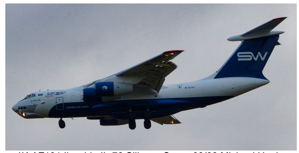
4K-AZ101 Ilyushin IL-76 Silkway Cargo 09/08

9th 4K-AZ101 Ilyushin IL-76 Silkway Cargo (F) D.11th