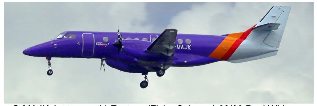
G-MAJK Jetstream 41 Eastern (Flybe Scheme) 08/08 Paul Whincup