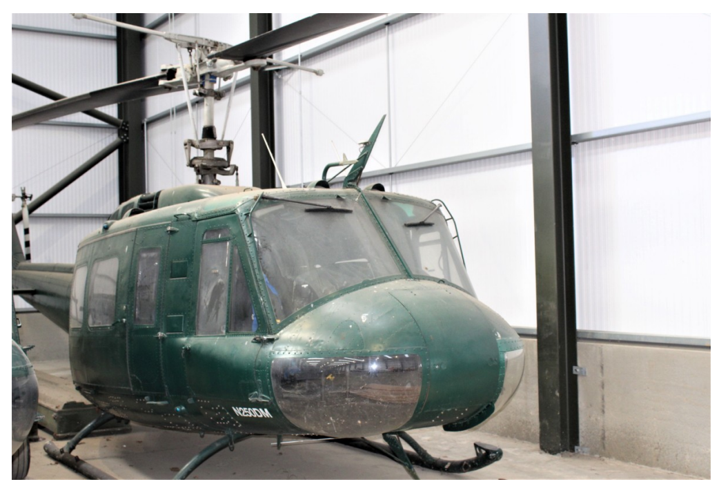
N250DM UH-1D IROQUOIS Leeds East Mike Storey