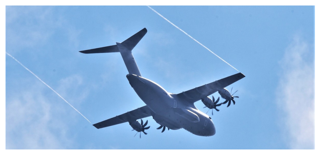
ZM418 Airbus A400M Atlas 10/08 Rod Hudson

Legacy 650 D-ARMY dep 08:13, Cessna 182T Skylane G-SHAR arr 11:03 dep 16:00, Airbus A400M ZM418 3 ILS approaches start at 11:18, Grob G120TP Prefect ZM309 arr 12:03 dep 14:14, Cessna 525A CJ2 D-IOHL arr 19:29 n/stop.