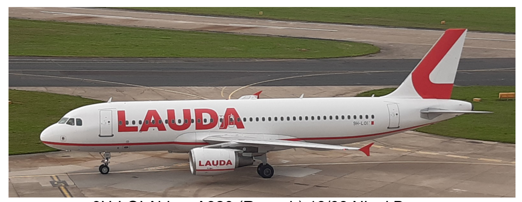
9H-LOI Airbus A320 (Ryanair) 18/08 Nigel Berry

12/8 EI-GXG(50P) positioned in from Stansted then departed to Gdansk(1503), EIDYC(28/68) positioned in from/back out to Brussels, 13/8 SP-RKI(303P) positioned out to Kaunus, 22/8 EI-EFK(20P) positioned in from East Midlands, EI-EKS(21P) positioned out to East Midlands.