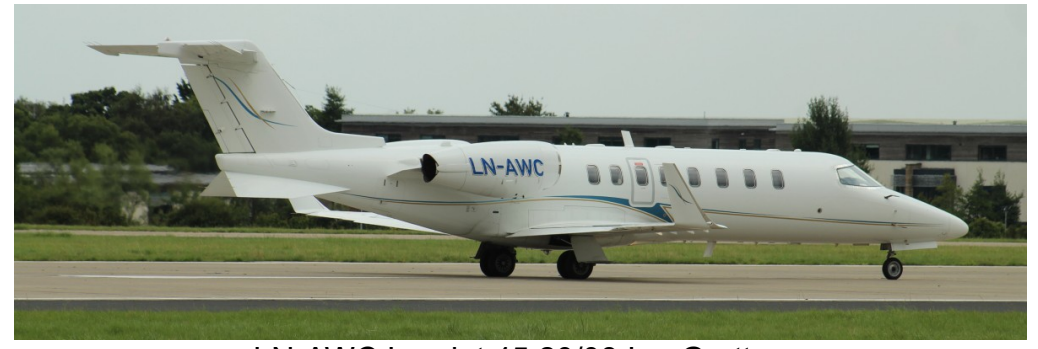
LN-AWC Learjet 45 20/08 Ian Gratton