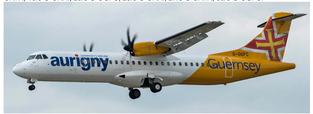
G-OGFC ATR72-600 Aurigny 20/08 Stewart Robertshaw

Guernsey(664/665, "66V/66W", Wed/Sat):-2/8 G-OGFC, 6/8 G-OGFC, 9/8 G-ORAI, 13/8 G-OATR, 16/8 G-ORAI, 20/8 G-OGFC, 23/8 G-ORAI, 27/8 G-OATR, 30/8 G-OGFC.