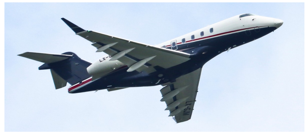
LX-GJM Challenger 350 01/08 Paul Whincup

Cessna 525A CJ2 G-TWOP dep 0800, Challenger 350 LX-GJM dep 11:02,