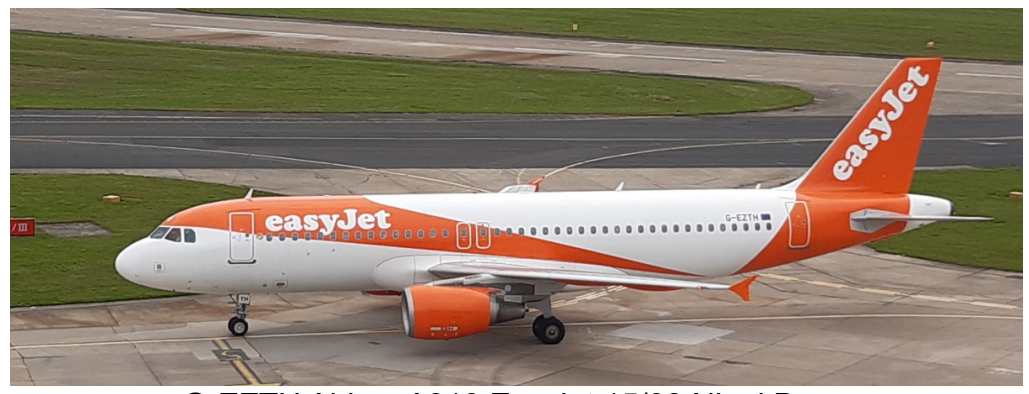
G-EZTH Airbus A319 Easyjet 15/08 Nigel Berry