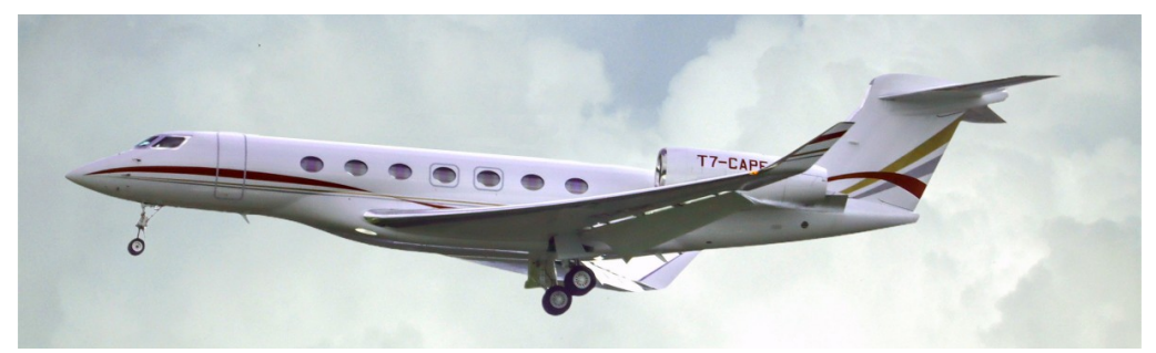
T7-CAPE Gulfstream 6 08/08 Paul Whincup

Gulfstream 200 EC-KRN dep 08:17, Cessna 550 Bravo G-CMBC arr 08:33 dep 09:05, Gulfstream 6 T7-CAPE arr 09:11 dep 09:34 ret LBA at 16:53 and dep 17:17, Global Express CS-RBN dep 09:41, Cessna 525B D-CGER dep 10:56, Challenger 350 CS-CHJ arr 13:45 dep 15:10, Phenom 300 T7-SST arr 20:56 n/stop.