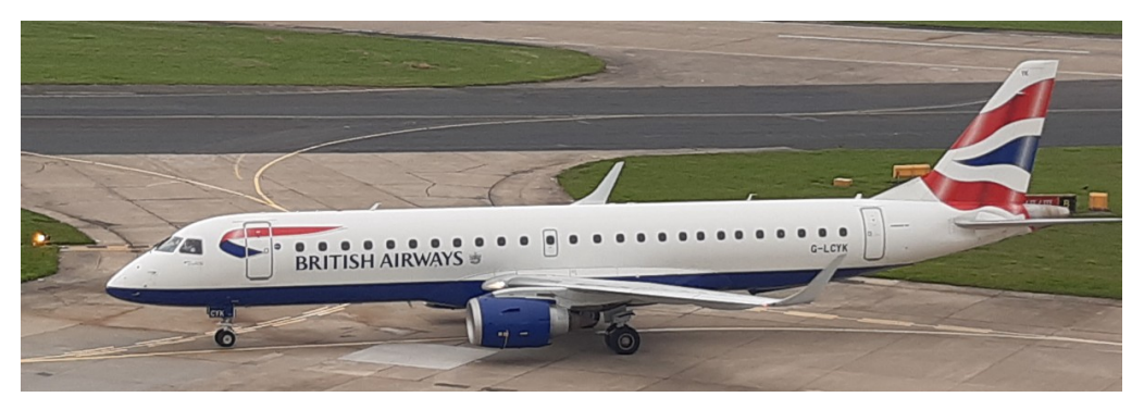
G-LCYK EMB190 BA 18/08 Nigel Berry