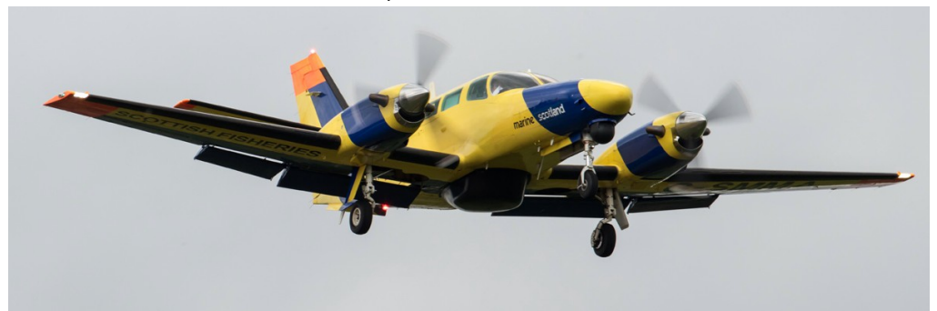
G-SMMA Cessna F406 Caravan 20/08 Stewart Robertshaw

AW109SP Grand G-DAYF arr 08:05 dep 08:51, Legacy 500 G-ESNA arr 08:11 dep 19:01, Phenom 300 CS-PHQ arr 13:02 dep 17:52, Partenavia P68R G-POLV ILS approach at 15:35, AW139 G-LAWA arr 16:47 n/stop, Learjet 31 D-CGGG arr 17:34 dep 18:30, Lockheed C130J ZH889 ILS approach at 17:49, Cessna 421C Golden Eagle G-ISAR arr 18:33 dep 19:03, AW109SP Grand G-DAYF arr 18:41 dep 18:55,