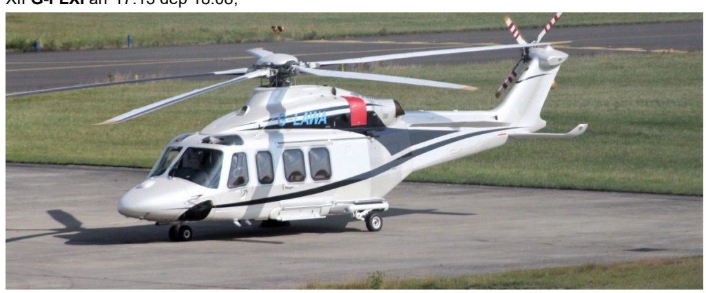
G-LAWA AW139Castle Air 12/08 Mike Storey

Cessna 510 Mustang OE-FZC dep 08:17, Cessna 680 Latittude D-CMDH dep 09:22, MD 902 Explorer N906AF (csn 083), arr 10:19 dep 13:10, Beechjet 400 I-TOPD arr 12:08 n/stop, Cessna 560 Excel CS-DXN arr 12:16 dep 14:02, Glulfstream 4 G-ULFM arr 12:49 dep 13:40, Bae Hawk T1 XX255 ILS approach at 14:10, Challenger 605 9H-VFH arr 1$;33 dep 15:16, AW139 G-LAWA dep 15:09, Aero Commander AC114B 2-LAND arr 16:01 n.stop, Pilatus PC XII G-FLXI arr 17:13 dep 18:08,