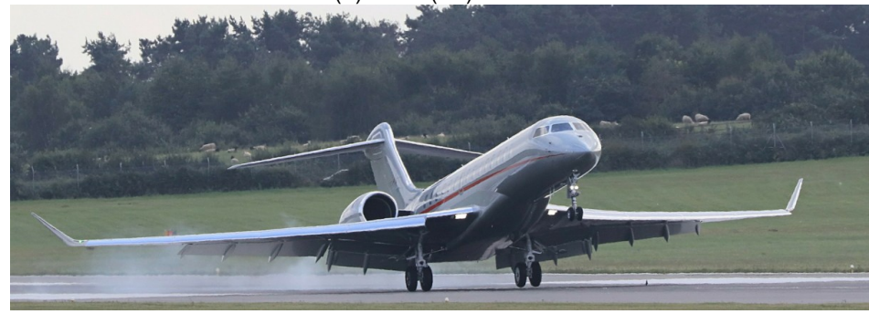
9H-VIC Bombardier Global 7500 Vista Jet 26/08

26th 9H-VIC Bombardier Global 7500 (T) +27th (FV)