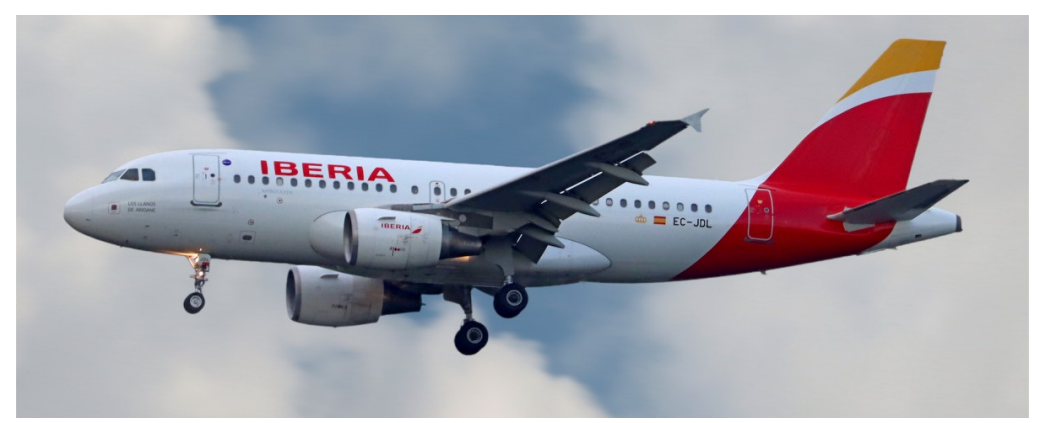
EC-JDL Iberia A320 06/08 Paul Whincup

then positioned out to Madrid, 7/8 EC-JDL Iberia A320 (IB032/2853) positioned in from Madrid, then operated charter back to Valencia, 18/8 OE-IBO ASL Belgium B737 (TAY1476/1477) operated charter in from/out to Shannon, 19/8 OE-IBO ASL Belgium B737 (TAY1476/1477) operated charter in from/out to Shannon.