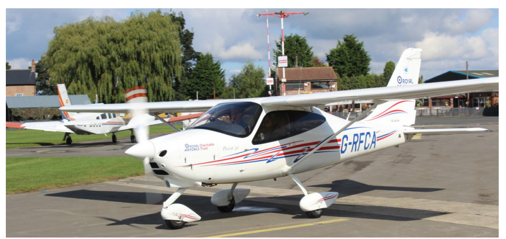
G-RFCA Tecnam P2008 Sherburn Mike Storey

The day started bright with sunny spells and a brilliant visit blue sky, more than we expected. An early arrival at Sherburn allowed us to sample the coffee and to gather the troops. 12pm on the dot we were allowed airside with our 2 escorts from the Operations team who had a quiet day ahead of them apart from us of course. Straight into the maintenance hangar and then next door to hangar 3 with a lot less frames in than I remember and not one helicopter which was unusual. G-WUFF departed and G-DODG taxied for fuel with quite a striking colour scheme even though there wasn't much colour! Hields were operating 2 helis from their pad and I missed one of them. Then into hangar 6 ( what happened to 5?) the new large hangar with several Tiger Moths hibernating inside followed by the long walk down to hangars 1 & 2. By 1:15 PM we were done and our hosts had allowed us full access even pointing out new residents and answering all our queries as best they could.