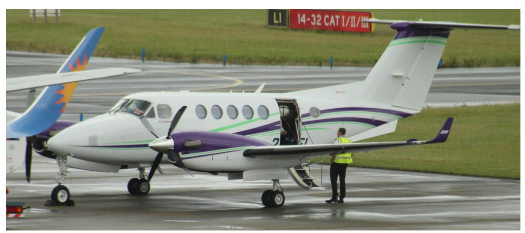
2-FIFI Beech 200 Super Kingair 06/08 Ian Gratton

Cessna 560 Excel D-CAWO dep 08:21 ret at 14:49 n/stop, Cessna 525A CJ2 D-IDWC arr 14:53 dep 16:20, Beech 200 Super Kingair 2-FIFI arr 16:10 dep 17:10, Challenger 350 SE-RNR arr 20:32 n/stop,