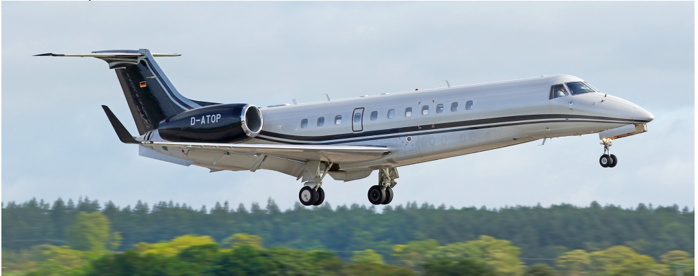
D-ATOP Legacy 650 19/08 Paul Whincup

Gulfstream G550 N613LF dep 07:27 to Athens, Cessna 525 CJ1 D-IHKW arr 09:47 fr Munster dep 10:59 to Aalborg ret LBA at , 15:32 & dep again at 16:44 to Paderborn, Legacy 650 D-ATOP arr 09:50 fr Geneva dep 11:34 to Corfu, Cessna 560 Excel G-SIRS dep 10:03 to Southend, Gulfstream 4 N728LB dep 10:24 to Luton. Hawker 800XB LY-LTA arr 17:13 fr Palma n/stop.