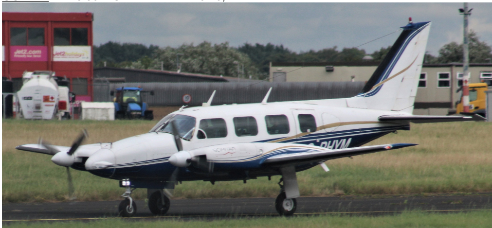
G-RHYM PA31 Turbo Navajo 22/08 Mike Storey

Cessna 560 Excel 9H-IRL arr 08:40 fr Luton dep 10:01 to Faro, Cirrus SR20 N203CD arr 09:43 fr Liverpool ret at 17:41, PA-31 Navajo N3544M dep 10:18 to Perth, Pilatus PC-24 D-CVMS arr 12:57 fr Malaga dep 14:10 to Siegerland, Cessna 525 CJ1 D-IHKW arr 13:17 fr Paderborn dep 14:17 to Munster, R/C F406 Caravan G-MAFA arr 16:09 fr Inverness n/stop, Pilatus PC XII OO-PCC arr 18:56 fr Charleroi ret at 19:43,