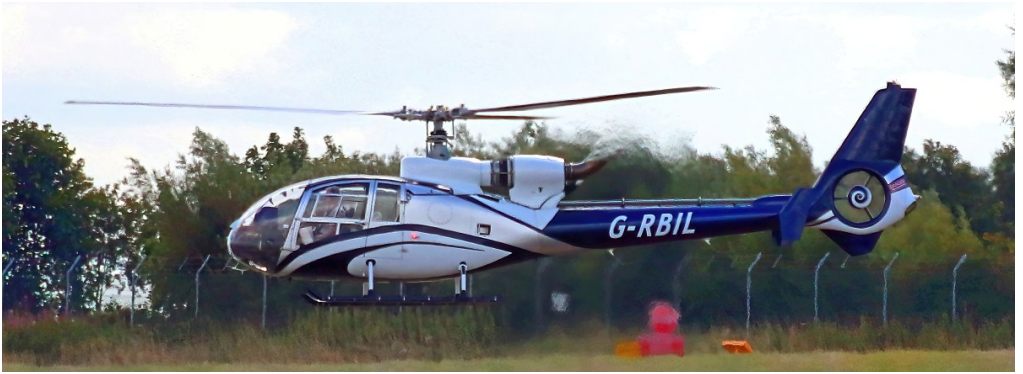
G-RBIL SA341 Gazelle 07/08 Paul Whincup