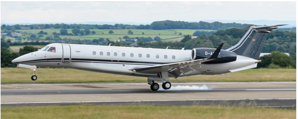
D-ASAP Legacy 650 07/08 Oscar Dell