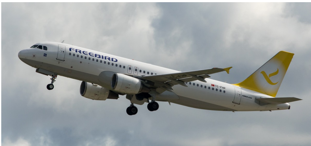
TC-FHP Airbus A320 Freebird 20/08 Stewart Robertshaw

Dalaman (621/622, "621/622", Sun/Wed):-2/8 TC-FBR, 6/8 TC-FBR, 9/8 TC-FBO, 13/8 TC-FBO(621) TC-FHC(622), 16/8 TC-FHC, 20/8 TC-FHC, 23/8 TC-FHC, 27/8 TC-FHC, 30/8 TC-FHN.