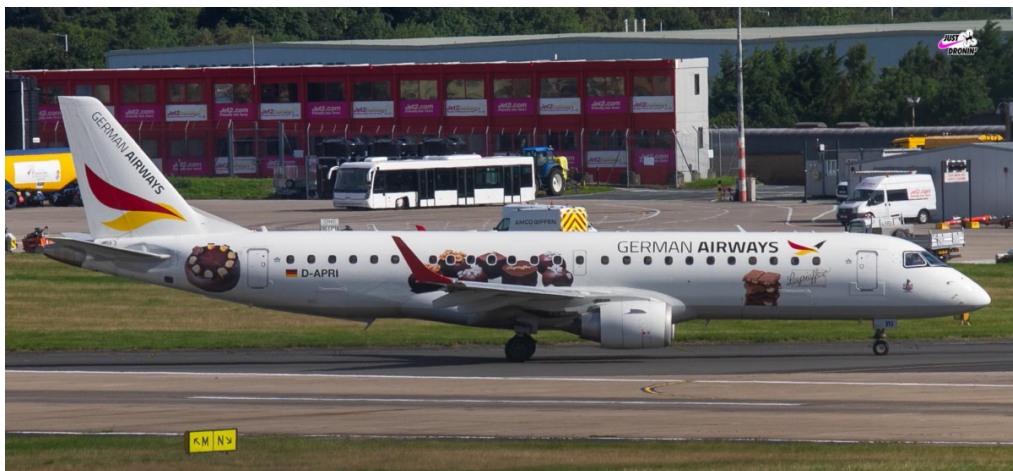
D-ARPI Embraer 190 German Airways (KLM)

Amsterdam (1549/1550, "73E/74F", Sun/Mon/Tue/Wed/Thu/Fri):-1/8 PH-EZW, 2/8 PH-EZU, 3/8 PH-EZN, 4/8 PH-EZW, 5/8 PH-EZR, 6/8 PH-EZY, 7/8 PH-EZE, 8/8 PH-EZP, 9/8 PH-EZO, 10/8 PH-EZE, 11/8 PH-EZZ, 12/8 PH-EZY, 13/8 PH-EZY, 14/8 PH-EZW, 15/8 PH-EZP, 16/8 PH-EZW, 17/8 PH-EZD, 18/8 PH-EZL, 19/8 PH-EZY, 20/8 PH-EXY, 21/8 PH-EZM, 22/8 PH-EXB, 23/8 PH-EZN, 24/8 PH-EXB, 25/8 PH-EZP, 26/8 PH-EXM, 27/8 PH-EXK, 29/8 PH-EZR, 30/8 PH-EZD, 31/8 PH-NXI.