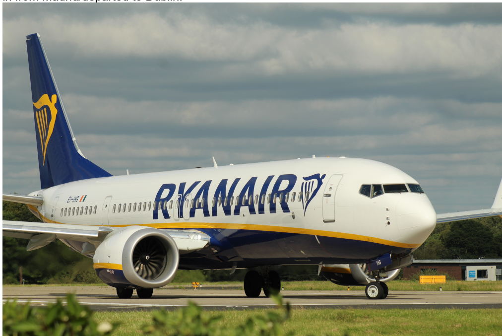
EI-IHG Boeing 737-8200MAX Ryanair 17/08 Ian Gratton

Other flights :-9/8 EI-DWA(277) positioned in from Stansted, 10/8 EI-DWI(069/153) positioned in from Madrid/deperted to Dublin.