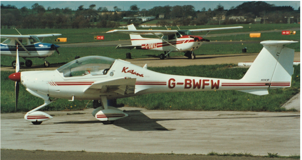
G-BFWW HOAC DV-20 Katana on 14 April 1996. A two seat trainer under evaluation by the then Yorkshire Aeroplane Club. Built in 1995 by Hoffman in Austria. It was destroyed in a crash near Sedbergh on a training flight from Kirkbride to LBA. Pilot and pupil escaped unscathed.