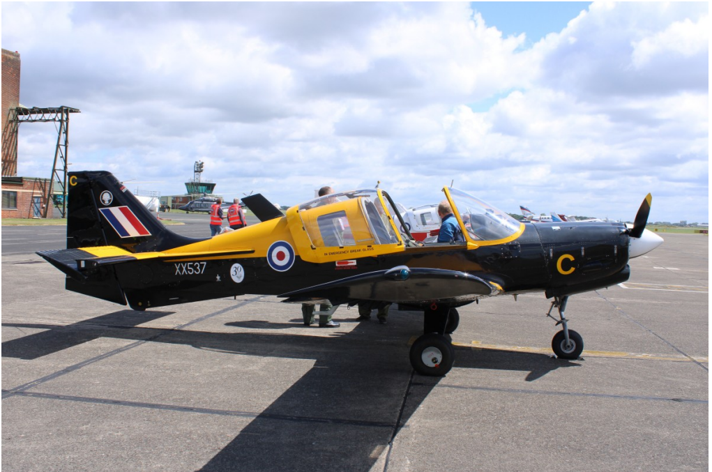
XX537 G-CBCB SA Bulldog