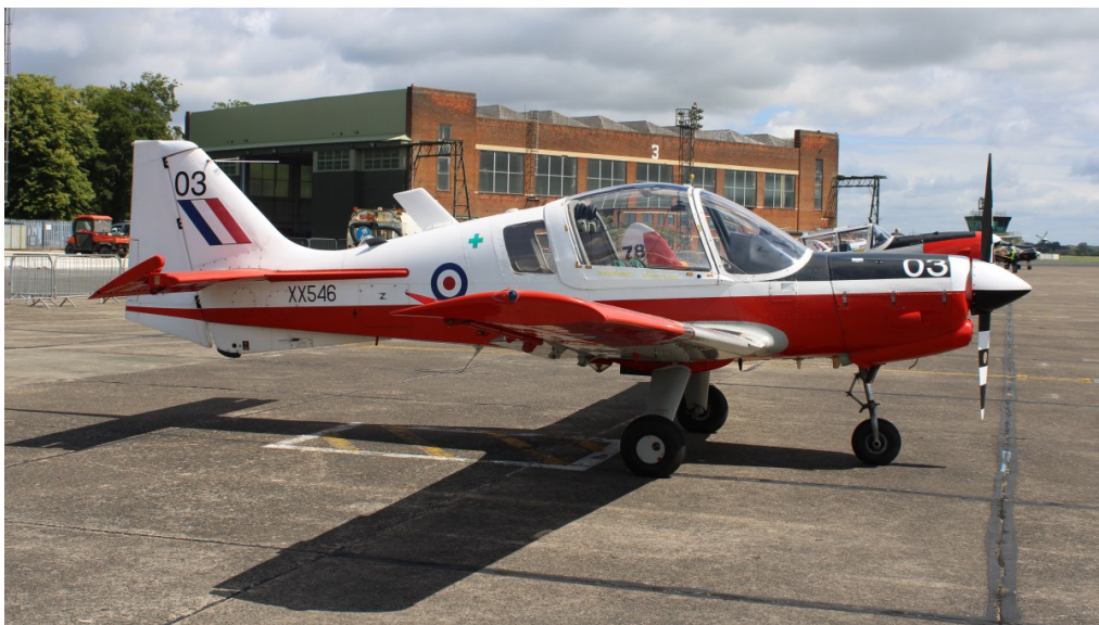
XX546 G-WINI SA Bulldog