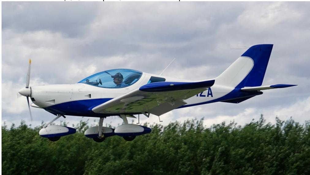
G-CRZA CAW Sportcruiser 19/08

19/08 G-BRIV TB9 f/t Sturgate, G-BBJX F.150L f/t Brighton, G-PGGY R.44 f Doncaster Racecourse, G-CRZA Sport Cruiser f Solent Airport..