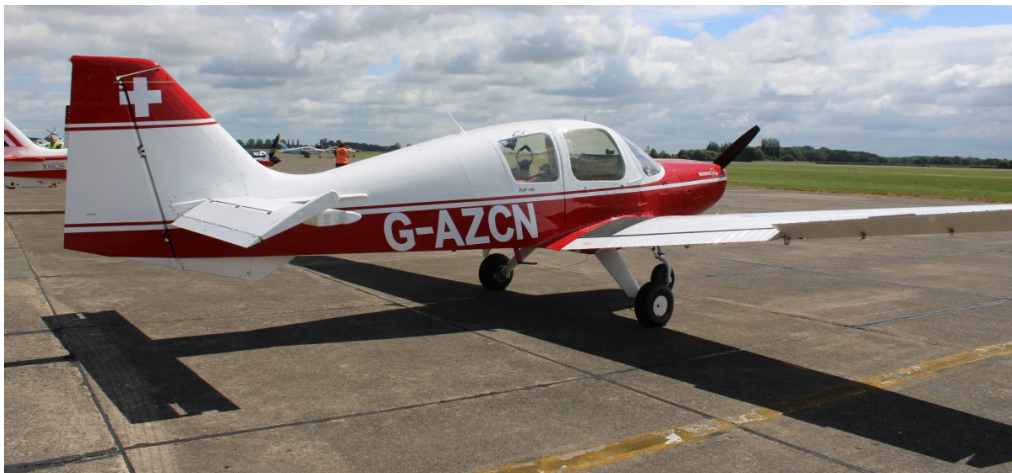
G-AZCN Beagle Pup

Visitors; G-CMNW DA62, G-BPAY PA-28, N10CD Cirrus SR22,, and for me the star visitor of the day N301KL Cessna 208 Grand Caravan. This aircraft was on a delivery flight and was routing Enid, Rochester, Bangor, Fort Wayne, Goose Bay, Narsarsuaq, Reykjavik, Wick, Leeds East, Luxembourg, Belgrade, Heraklion, Cairo, Jeddah, Addis Ababa and finally Nairobi, quite a journey.