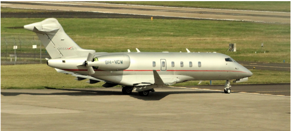
9H-VCW Challenger 350 23/08