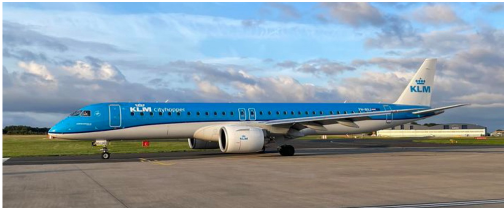
PH-NXJ Embraer 195 KLM 11/08 Matt Barker

Amsterdam (1545/1546, "72K/90B", Sun/Mon/Tue/Wed/Thu/Fri):-29/8 PH-EXD, 30/8 PH-EXI, 31/8 PH-EXT.