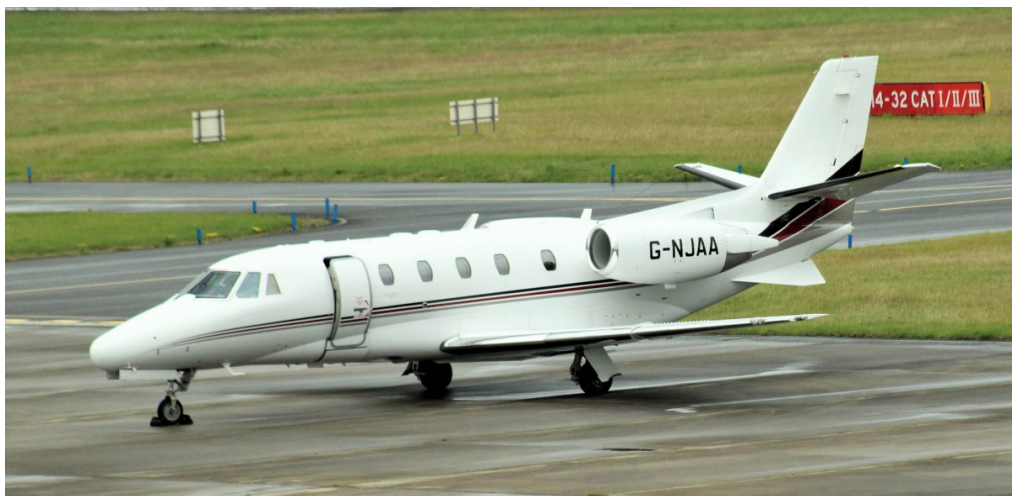
G-NJAA Cessna 560 Excel 01/08 Mike Storey

Beech 200 Kingair G-FLYW arr 08:58 fr Haverfordwest dep 09:49 to Shannon ret LBA at 20:38 n/stop, Cessna 560 Excel G-NJAA arr 09:39 fr Biggin Hill dep 10:42 to Northolt, Cessna 560 Excel OK-CAA dep 10:20 to Murcia, PA-28R Cherokee Arrow G-AZSF 2x ILS approaches at 11:03 fr Church Fenton, PA-28R Cherokee Arrow G-ETLX arr 11:39 fr Cranfield n/stop, Grob G120TP prefect ZM305 f/t Cranwell (11:59/14;45) Cessna 525 Cj1 D-ILHE dep 13:08 to Biarritz, Beech 200 Kingair G-CDZT arr 13:37 fr Biggin Hill dep 14:19 to EMA,