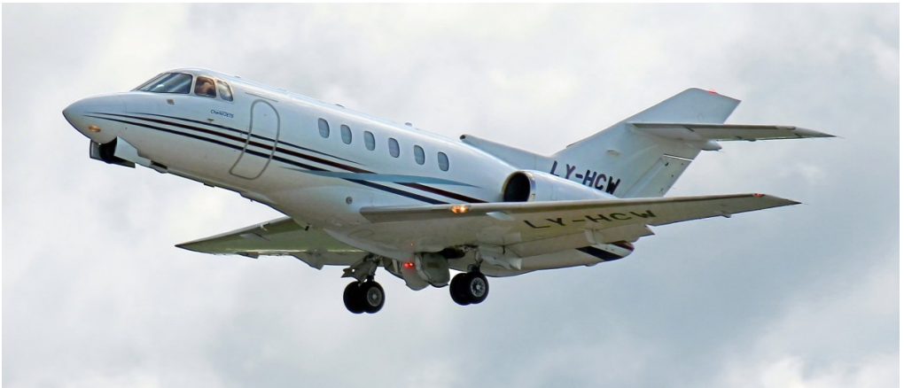
LY-HCW Hawker 800XP 03/08 Paul Whincup