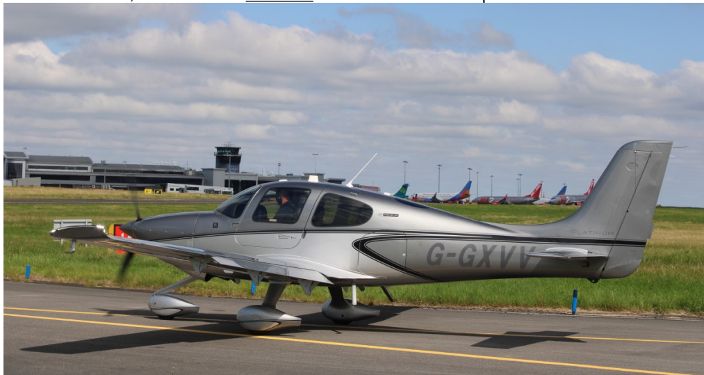
G-GXVV Cirrus SR2-0 17/08 Ian Gratton

Cirrus SR22 N575PW arr 08:35 fr Blackpool ret at 15:13, Gulfstream 4 N728LB arr 08:54 fr Abuja n/stop, Cessna 560 Excel CS-DXF arr 09:38 fr Farnborough dep 11:05 to Faro, Challenger CL605 N949MC dep 10 :14 to Bangor, Cessna 680 Latitude CS-LTX dep 10:20 to London City, Cirrus SR2-0 G-GXVV arr 13L28 fr CH Fenton, dep 15:24 to Sleep, Phenom 100 ZM333 ils approach at 14:58 fr Prestwick c/s CWL46, R/C F182Q Skylane G-CCYS dep 16:00 to Haverfordwest, Pilatus PC-24 D-CPTN arr 16:47 fr Luton n/stop.