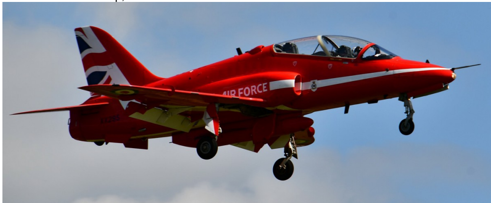
XX310 Hawk T1 10/08

Cessna 525B CJ2 G-TTCK arr 07:44 fr Newcastle dep 09:00 to Barcelona, Pilatus PC XII G-ISJE arr 08:06 fr Dundee ret at 08:47 ret LBA at 16:58 & dep 17:19 to Belfast, Cirrus Sr20 G-JOID dep 08:26 to Lee-on-solent, Cessna 525C CJ4 D-CHRA arr 08:36 fr Stuttgart dep 10:10 to Palma, Hawk T1 XX310 low pass at 10:32 fr Waddington c/s RED7, Cessna 680 Sovereign D-CHRG arr 10:35 fr Dusseldorf dep 12:24 to Faro, Hawk T1 XX295 low pass at 11:07 fr Waddington c/s RED10, Phenom 300 CS-PHK arr 11:44 fr Inverness dep 12:56 to Palma, Diamond Da40 G-SPTT arr 31:20 fr Blackbushe ret at 14:17, Challenger 850 9H-DOM arr 13:25 fr Heraklion dep 14:25 to Nice, Falcon 900EX LX-FMA arr 13:50 fr Nice dep 14:34 to Dusseldorf, R/C F406 Caravan G-MAFA dep 14:30 to Inverness, Phenom 300 D-CSCE arr 15:27 fr Alesund n/stop,