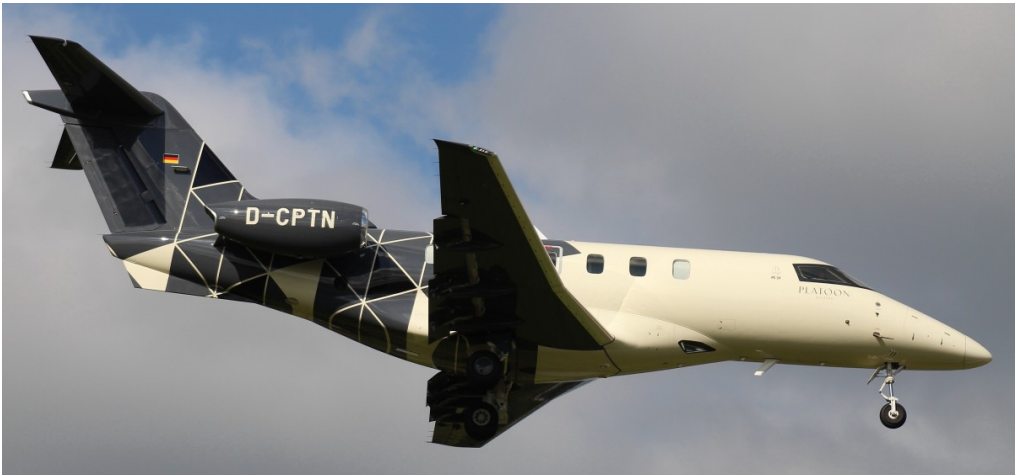
D-CPTN Pilatus PC-24 17/08 Ian Gratton