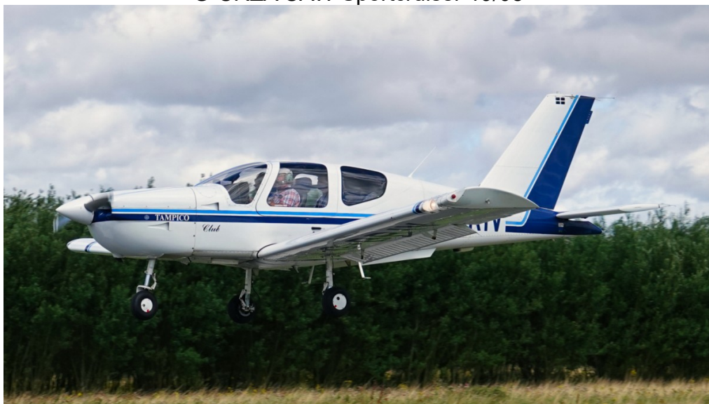
G-BRIV Tampico Club - Lincoln Aero Club 19/08