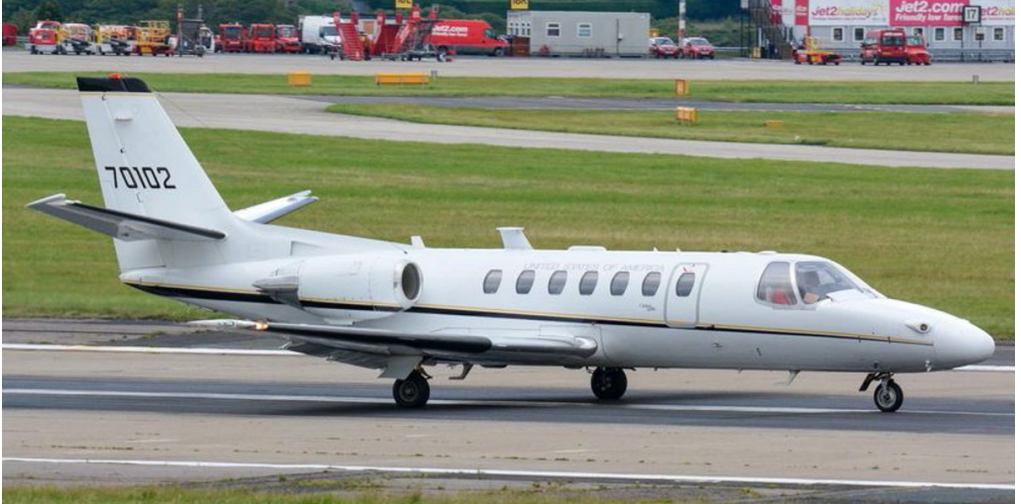
US Army 97-00102 UC-35A Citation V 06/08 Oscar Dell

Phenom 300 D-CDAS dep 08:19 to Biarritz, Gulfstream G550 N613LF arr 08:25 fr Corfu ret at 18:53, Cirrus Sr22 N363KC arr 08:32 fr Cambridge dep 15:55 to Dundee, Global Express EJ-JMMM arr 10:24 fr Farnborough ret at 18:30, Cirrus SR20 G-GXVV dep 10:46 to Church Fenton ret LBA at 15:20, PA-32 Saratoga G-RAMS dep 12:34 to Gamston, US Army 97-00102 UC-35A Citation V arr 13:19 fr Lakenheath dep 17:23 to Glasgow, Legacy 650 D-ASAP arr 14:15 fr Tel Aviv dep 15:14 to Farnborough, Cirrus SR20 G-GXVV arr 15:20 from CH.Fenton dep 15:51 to Birmingham, Cirrus Sr22 G-GCVV dep 15:49 to Birmingham,