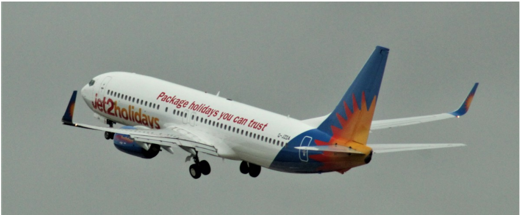
G-JZDA Boeing 737-82R Jet.com 01/08