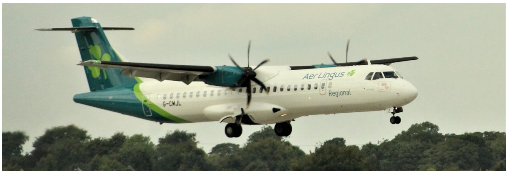
G-CMJL ATR72-600 Aer Lingus 10/08 Mike Storey

Belfast City (3678/3679, "78XT/79PW", Daily except Saturday):-1/8 G-CMJL, 2/8 G-CMJN, 3/8 G-CMMN, 4/8 G-CMJM, 6/8 G-CMMJ, 7/8 G-CMJL, 8/8 G-CMJM, 9/8 G-CMJL, 10/8 G-CMJN, 11/8 G-CMMK, 13/8 G-CMMK, 14/8 EI-GZV, 15/8 G-CMJL, 16/8 EI-FSL, 17/8 G-CMJN, 18/8 G-CMJN, 20/8 EI-FAT, 21/8 G-CMJL, 22/8 G-CMJN, 23/8 G-CMJL, 24/8 G-CMJN, 25/8 G-CMMK, 27/8 G-CMJJ, 28/8 G-CMJN, 29/8 G-CMJL, 30/8 G-CMJL, 31/8 G-CMJL.