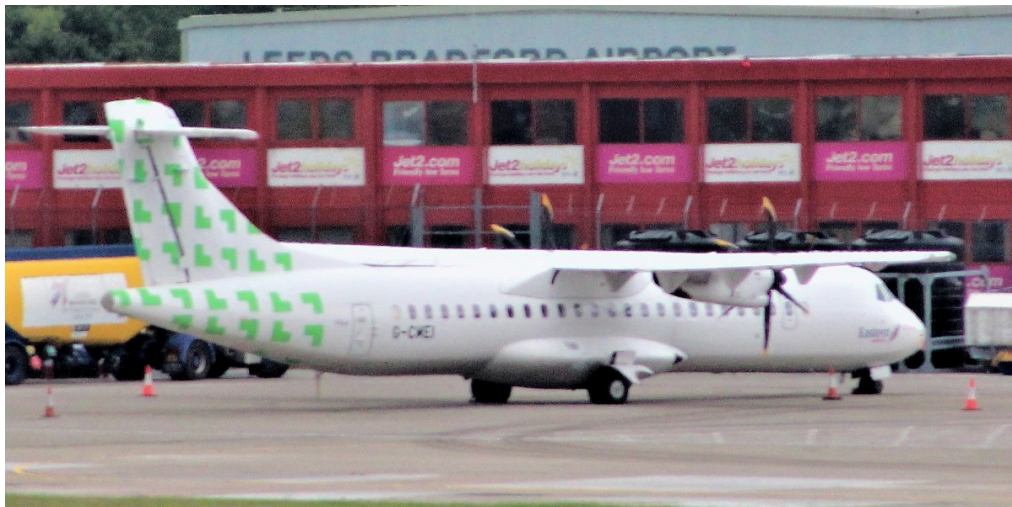
G-CMEI ATR72-600 Eastern 06/08 Mike Storey

Loganair(LM/LOG, “Logan”):- 25/8 G-SAJJ(840P/840) positioned in from Aberdeen, then operated charter to Stansted, 26/8 (841/841P) operated charter back from Stansted then positioned back to Aberdeen.