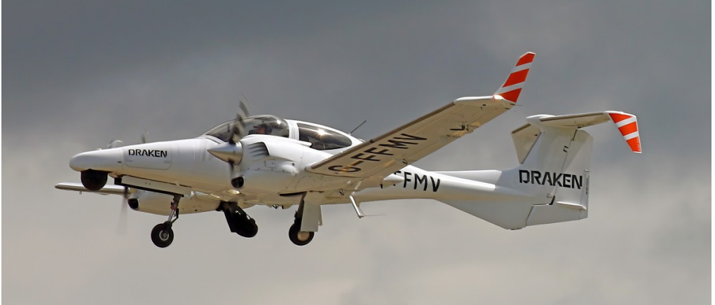
G-FFMV Diamond DA42 03/08 Paul Whincup

14:14, Airbus A400M Atlas ZM420 ILS approach at 12:24 fr Brize Norton c/s COMET454, Cirrus Sr22 N363KC arr 12:35 fr Birmingham dep 14:18 to Church Fenton, Cirrus Sr22 N363KC dep 14:18 to Church Fenton, Cirrus SR22 N842VV dep 14:26 to Birmingham,