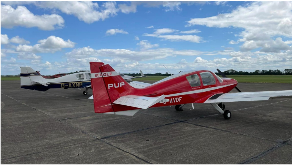
G-AXNP G-AVDF Beagle Pups