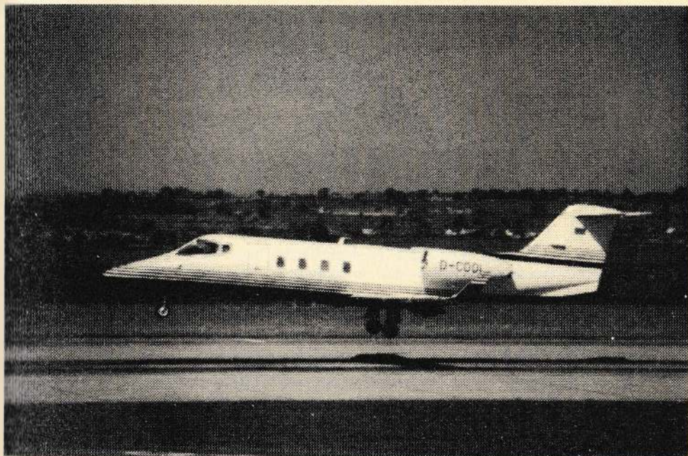
MTM Aviation Learjet 55 D-COOL