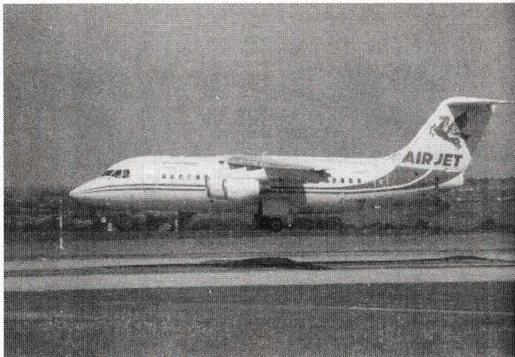
AIR JET 146 F-GOMA