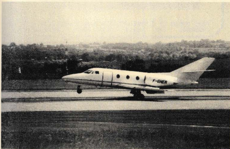
Regourd/THS Helicopters DASSULT Falcon 10 F-GHER