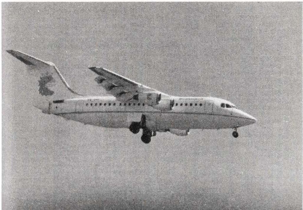
MALMO AVIATION 146 SE DR1