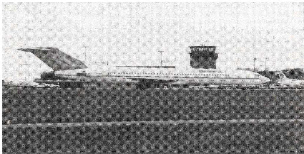
SABRE 727 G-BPND