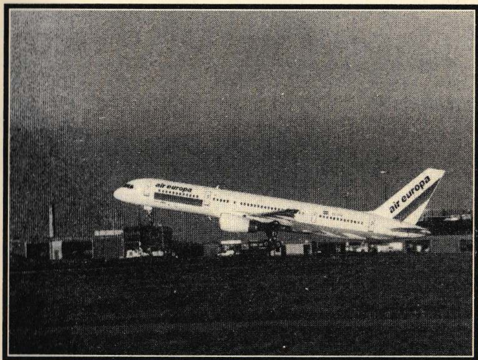
AIR EUROPA B757 - EC FEF Departs 32 L.B.A. (Ken Cothliffe)