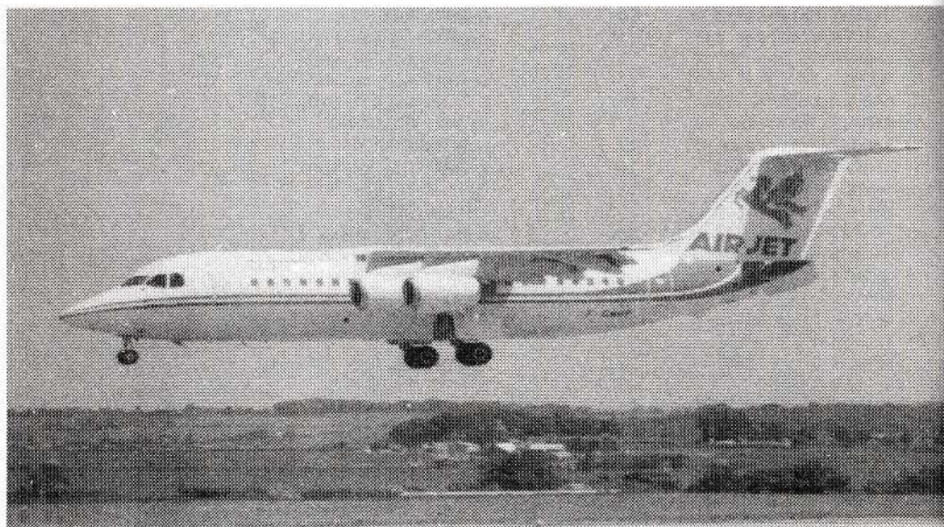
AIR JET F-GMMP