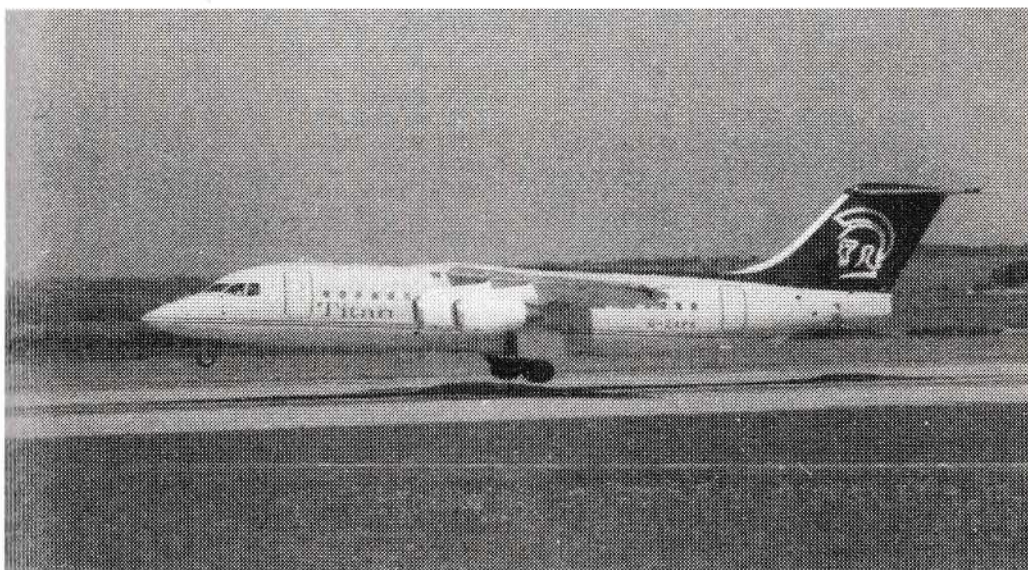
TITAN BA 146 GZAPL