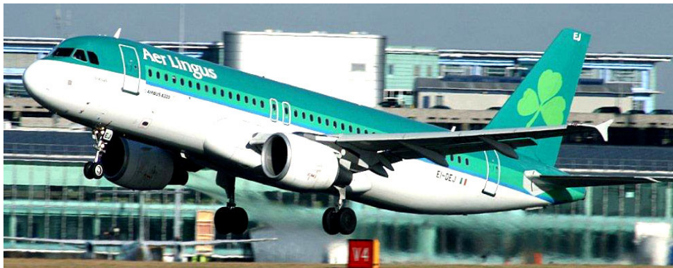
EI-DEJ Airbus A.320, Aer Lingus at Mancehster International 17/8/11(Melvyn Laycock)