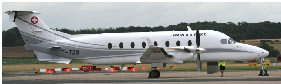
An interesting arrival at Humberside, Swiss Air Force Beech 1900D T-729(Roger Grimley)

Helmsley:- A couple of Swiss registered Twin Squirrels visited the area recently in conjunction with the grouse shooting season, HB-ZPS on 3/7 to Southend and HB-ZOO on 27/8 to Teesside for fuel.