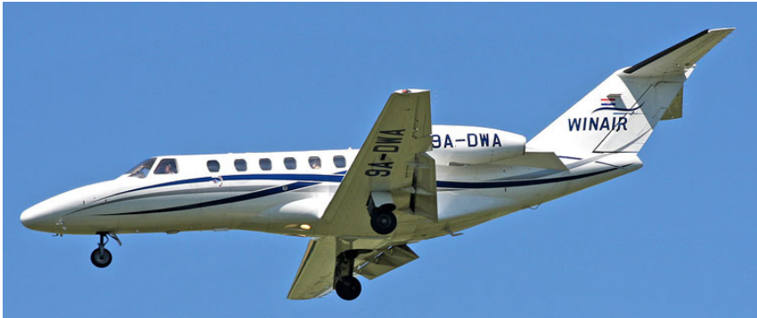
Croatian registered Citationjet 2, 9A-DWA of Winair arriving at Teesside, 3/7

TEESSIDE(Durham Tees Valley)