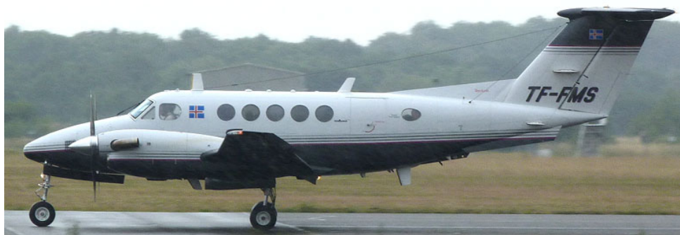
King Air 200 TF-FMS operated an ambulance flight into Doncaster

routing Budapest – Istanbul – Amman); G-USAR Cessna 441(arrived 25/07/11 - undercarriage failure on arrival); G-CJCC Citation Sovereign(arrived 29/07/11 - re-registered N884RS 15/8/11, left on delivery 28/8 via Istanbul to Djakarta, Indonesia); M-PRVT Citation X(arrived 31/07/11); G-WNAA Agusta A.109E(arrived 01/08/11, noted 22/8 with Doctor Heli tiles and registered JA-20K . Left the following day as G-WNAA, taped over Japanese reg); G-LIVY King Air 200(arrived 11/08/11); G-OAMB Citation Mustang(arrived 14/08/11); G-NSJS Citation Sovereign(arrived 22/08/11); G-KDMA Citation Bravo(arrived 23/08/11); G-JBLZ Citation 2(arrived 23/08/11).