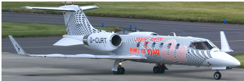
A colourful bizjet! Lear 45 D-CURT taxiing on Multiflight/East, 9/7

GENERAL AVIATION:- Hughes 369E G-JIVE from Shelf(0929) to a private site near Birmingham(0957). Cessna 421C N37VB of Lowndes Aviation Inc, f/t Blackbushe(1308/1540), n/s. Although visiting for the first time in this guise, this aircraft was based at Lbia from 1989 to 1992 when registered G-FWRP. King Air 200 G-ZVIP (Prestige 698) from Ibiza(1901) to Biggin Hill(2002).