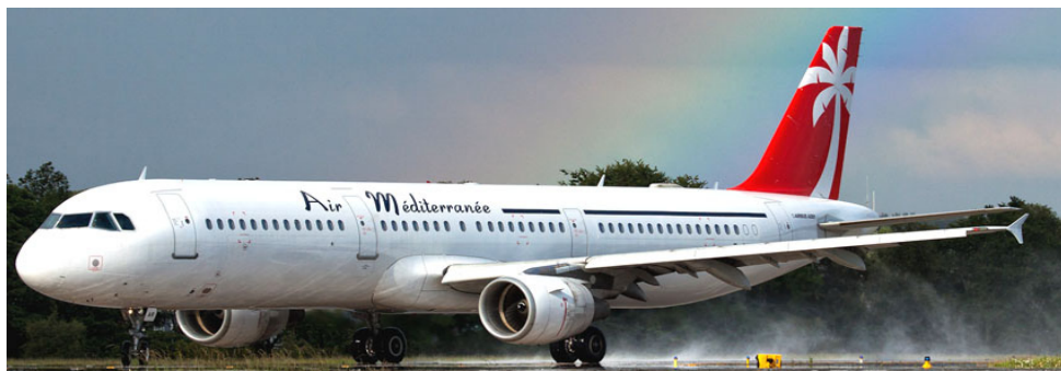
A.321 F-GYAR departing to Lourdes following a heavy downpour, 7/7(Mark Winterbourne)

GENERAL AVIATION:- PA-34 G-RVRB (Ravenair 34T) f/t Liverpool(1223/1439). TB.20 Trinidad G-EGAG f/t Sherburn(1409/1529) to Multiflight engineering, n/s until 14/7.