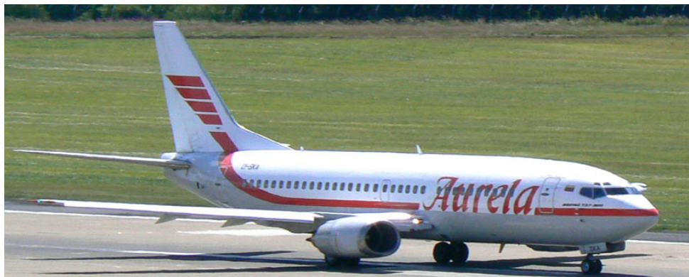
Jet2 sublease 2:- Boeing 737/300 LY-SKA of Aurela, LBIA 23/7.

OY-VKF A332 (309) return to Thomas Cook Scandinavia 05/11/11