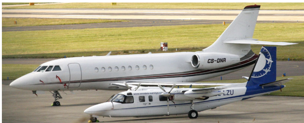
Commander 690 SE-LZU and Falcon 2000 CS-DNR on Multiflight/East, 24/7

GENERAL AVIATION:- Cessna T.210N G-TOTN f/t Ronaldsway(1003/1204).