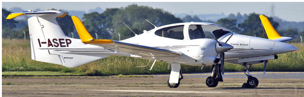
DA-42 I-ASEP was used by "White Knight" for local flying in early July at Teesside

The following aircraft arrived for static display, G-BSXD J-20 Kraguj, G-BZNW Isaacs Fury, Hawks XX280/CM and XX329/CJ(Carbon 1/2), Typhoon T3 ZJ802/QO-B(Razor 61), Typhoon FGR4 ZJ942/DH(Razor 62). The following aircraft, which were enroute for the Sunderland Air Show did fly throughs, Lynx HMA8SRU XZ722/645(Black 1), Hawk XX321(Aztec 2), PB.Y.1A Catalina G-PBYA, Hurricane G-HHII/XPL.