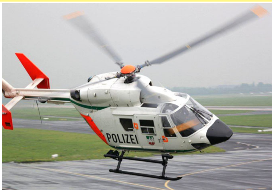
D-HNWO Eurocopter BK.117, Polizei Dusseldorf, 21/8/11