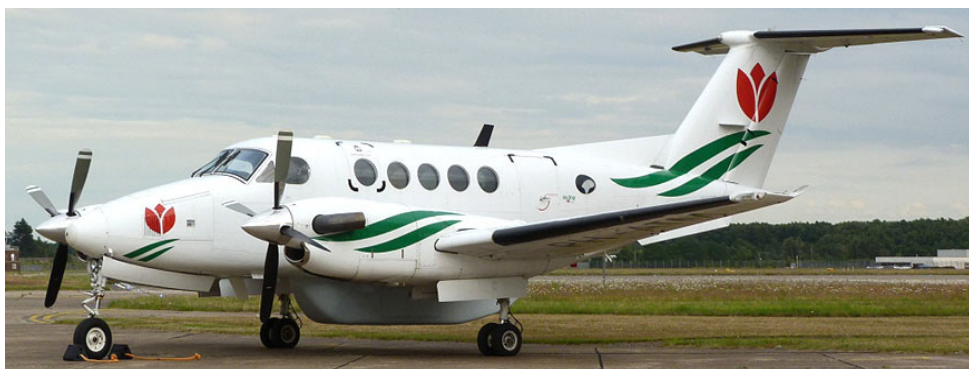
PH-ATM King Air 200 of Tulip Air, Doncaster/Robin Hood 14/8/11