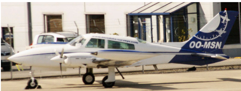
Cessna T.310R, survey aircraft OO-MSN visited LBIA on 24/7(Mike Storey)

MILITARY:- King Air 200 ZK458 (Cranwell 73) ILS and overshoot x2(1610/1616).