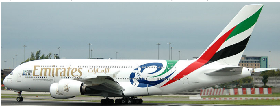
A380 A6-EBN has been adorned with logos for the upcoming Rugby Union World Cup