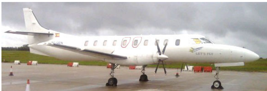
Metroliner EC-GEN of Let's Fly, operated an inbound charter on 15/7(Geoff Ward)

MILITARY:- Islander ZF573 (Ascot 7949) from Wittering(1117), departed 1311 for local patrol.