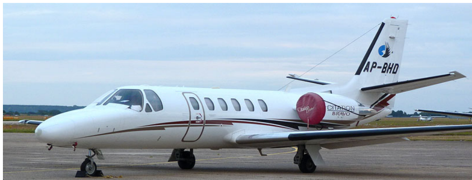
The cause of all the fuss at Doncaster, Citation Bravo AP-AHD

Devonshire Arms:- Teesside based R.44 G-CJLL was noted on 2/7, while the following day EC.120B G-JJFB paid a visit. Long Ranger G-PWIT arrived from Sherburn on 29/7 and stayed until 31/7 when it departed to Fenland. Gazelle HA-LFH was also logged on 31/7.