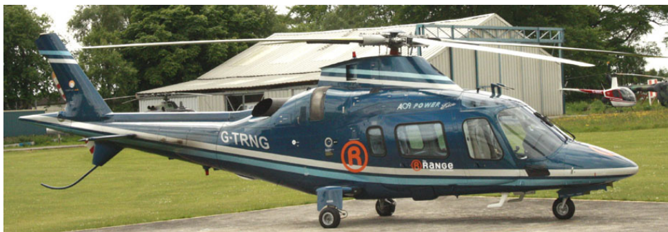
G-TRNG Agusta A.109S of Castle Air, Coney Park, 29/6(Mike Storey)