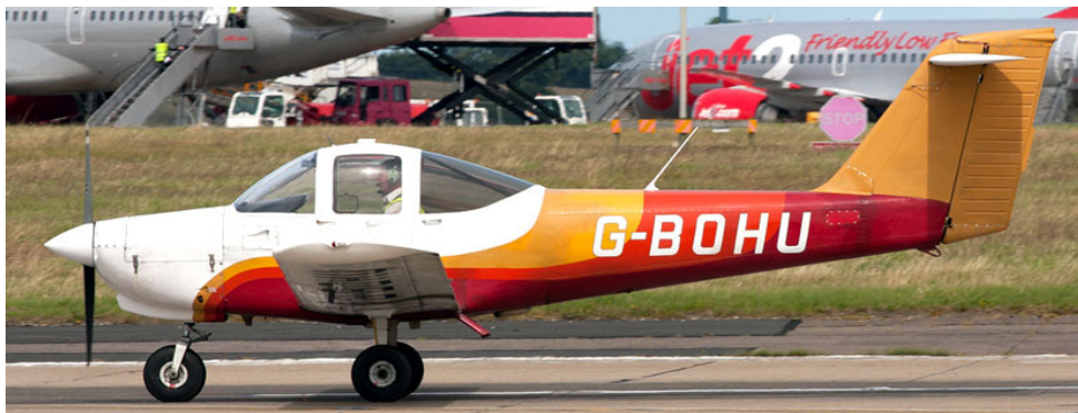
Based at Swansea, Tomahawk G-BOHU paid a visit on 30/7(Robert Burke)

GENERAL AVIATION:- King Air C90 M-TSRI (Ambassador 924B/C) from Oxford(1300) to Hawarden(1743). PA-31 Navajo G-GURN (Neric 02) from Guernsey(1317), n/s to Fowlmere(1607). King Air 200 G-FPLD (Calibrator 659) from Teesside(1345), calibrating 32 ILS 1452/1755 and home to Teesside(1837). TB-10 G-VMJM from Sandtoft(1443), n/s until 27/7, to Sherburn(1113).