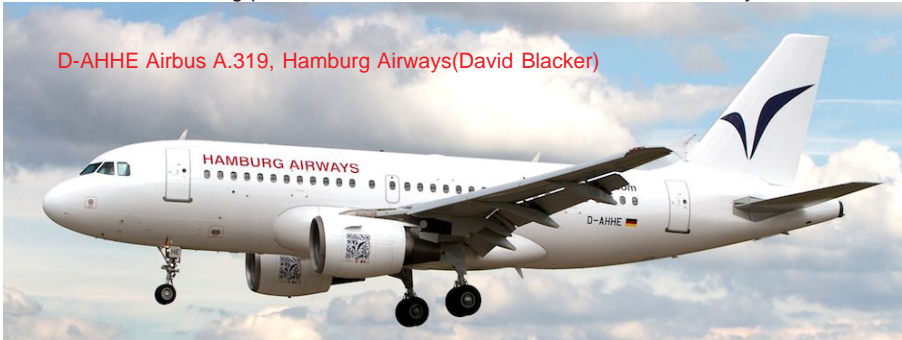
D-AHHE Airbus A.319, Hamburg Airways(David Blacker)

Jet 2 have provided LBIA enthusiasts with a varied selection of aircraft leased in to cover for out of service aircraft. The following photos, all taken at LBIA, show some of the variety seen.