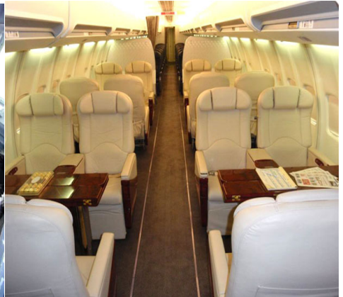
The cockpit and VIP interior of Boeing 737/300 SX-MTF