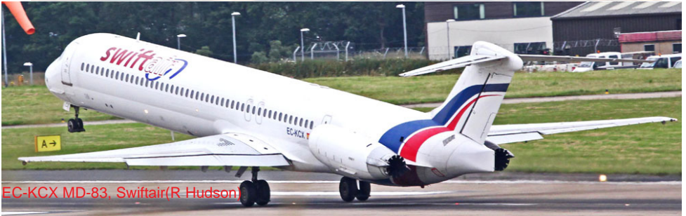
EC-KCX MD-83, Swiftair(R Hudson)