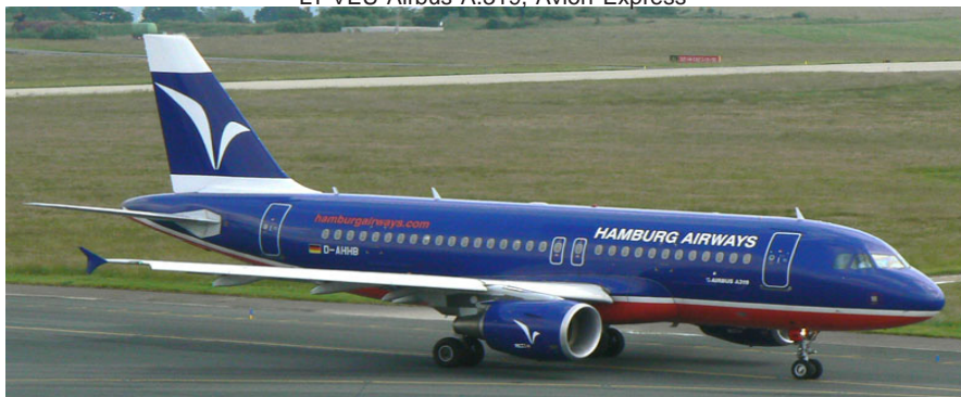
D-AHHB Airbus A.319 Hamburg Airways