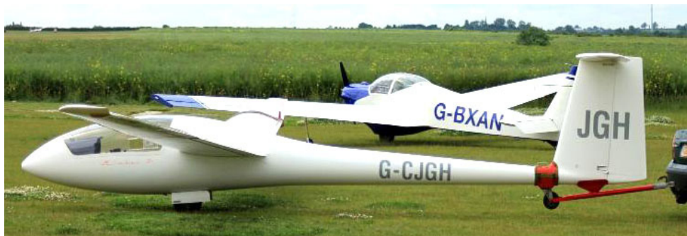
Pictured on a recent visit to Darlton Gliding Club near Newark by Alan/dsaf, G-CJGH Nimbus 2 and G-BXAN Scheibe SF.25B

CONINGSBY:- 12.7 26109 and 26208 both HH.60G's of 56 RQS, 48 th FW Lakenheath plus G-MAJ Jetstream Srs.4102.