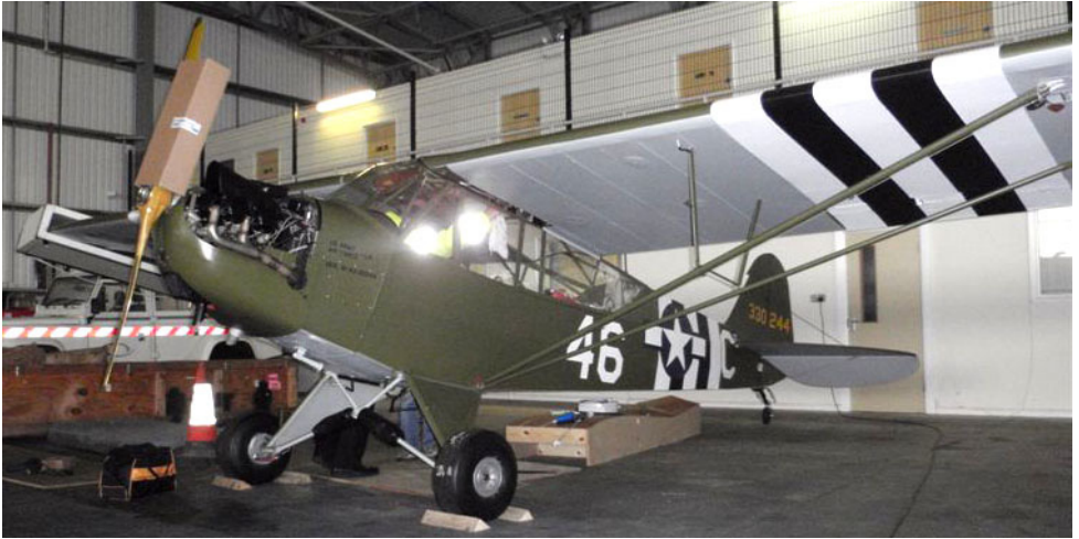
G-CGIY J-3C CUB, is still awaiting its first flight following restoration