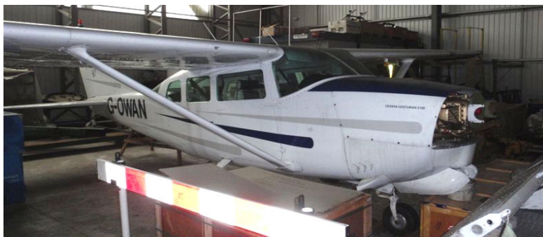
G-OWAN Cessna P.210D under maintenance

Parked out SX-MTF B737-300 Gain Aviation SA , operated by Multiflight in VIP config. Yorkshire Air Ambulance G-SASH MD Explorer on its stand between H1 and Engineering Hangar