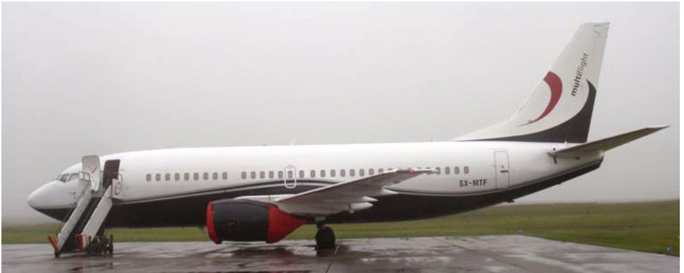
Pride of the fleet! Boeing 737/300 is operated in conjunction with Gain Jet Aviation