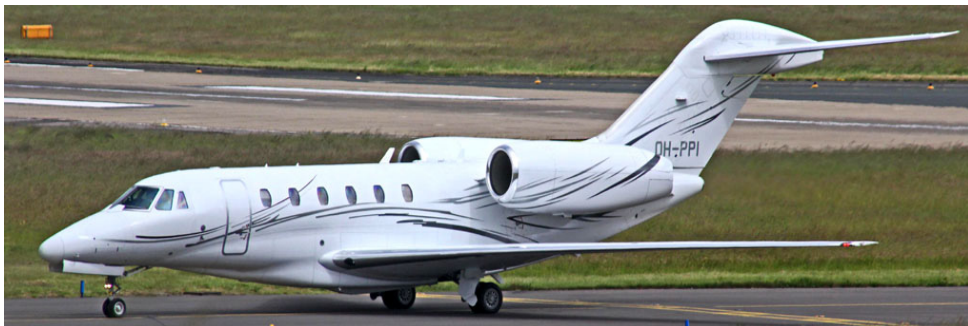
Finnish registered Citation X taxiing on Multiflight/East apron, 1/7

GENERAL AVIATION:- The German quartet that arrived on last day of last month all departed to Oban, TB.10 D-ECJP at 1110, Piaggio FWP.149 D-EHVR at 1117, TB.10 D-ESDJ at 1120 and Tecnam P.2006T D-GMUP at 1125. PA-46T Malibu N1RQ f/t Antwerp(1102/1501). PA-28 Warrior G-OWAP f/t Teesside(1257/1646). Cessna T.206H G-NIME from Kingsmuir(1429), n/s until 11/7 to Carlisle(1342).