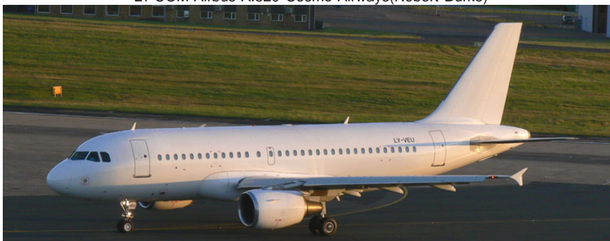
LY-VEU Airbus A.319, Avion Express