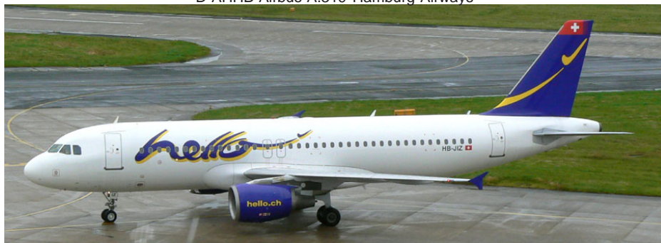
HB-JIZ Airbus A.320, Hello AG