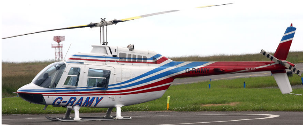
Humberside based Jet Ranger G-RAMY, a temporary resident at LBA in July

Over at the Southside very little changes. Citation Bravo N425ST, however has left for Doncaster where it is being offered for sale by Kinch Aviation.