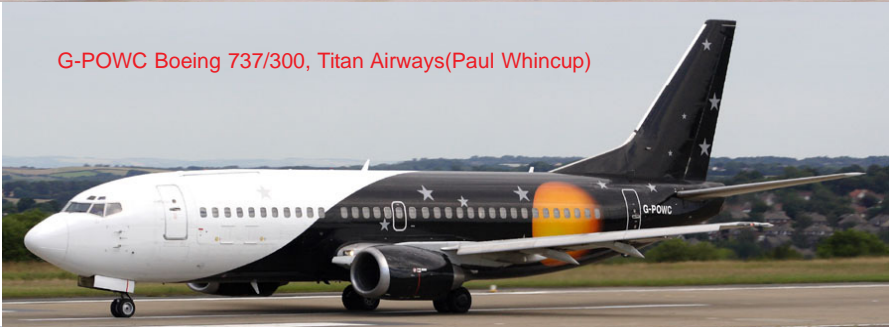
G-POWC Boeing 737/300, Titan Airways