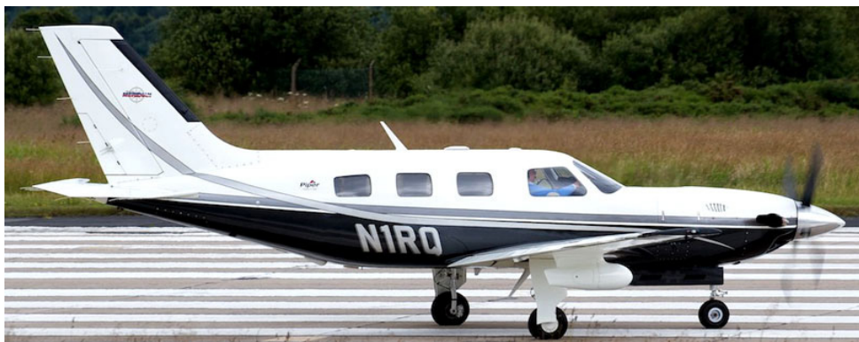
Malibu N1RQ turning on 32 threshold ready for departure to Antwerp, 1/7

GENERAL AVIATION:- Cirrus SR.22 G-OOEX f/t Peterborough/Connington(0845/1545). King Air 200 G-WNCH (Synergie 515) from Fair Oaks(0919) to Exeter(1520). King Air 90GT M-TSRI (Ambassador 903A/B) from Prestwick(1543) TO Hawarden(1559).