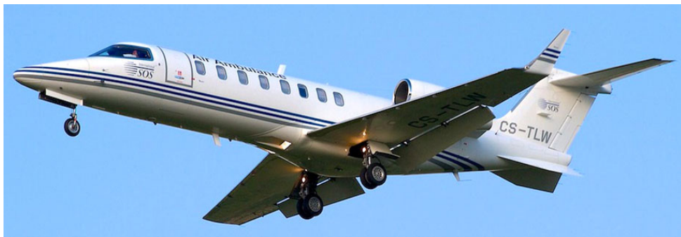
Lear Jet 45 CS-TLW riving from Morocco on an ambulance flight, 24/7(David Blacker)

MILITARY :- Tutor G-CGKB (Cranwell 90) f/t Cranwell(1258/1534).