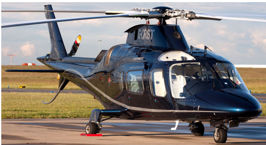
"Rocket 1", Agusta A.109S G-CRST parked on Multiflight/East apron, 4/7(Robert Burke)

GENERAL AVIATION:- PA-34 Seneca G-GFEY (Equity 07) ILS and overshoot(1310), f/t Ronaldsway.