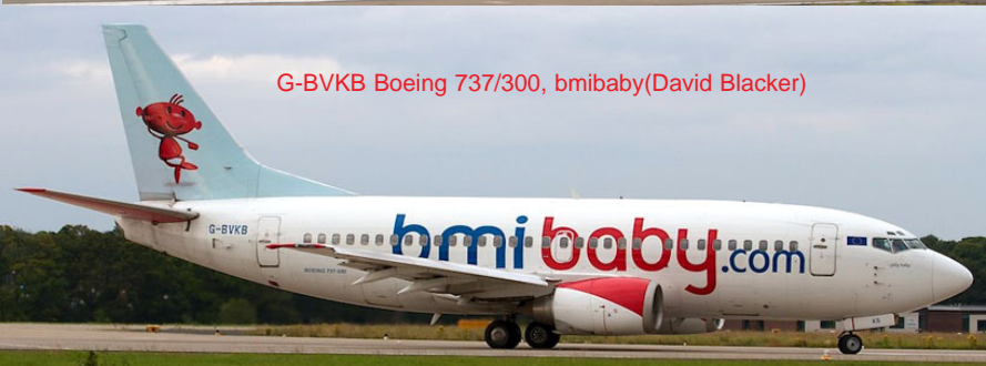
G-BVKB Boeing 737/300, bmibaby(David Blacker)