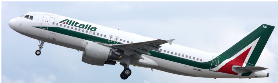
A.320 EI-IKU departing home to Rome following a student charter, 8/7(Paul Whincup)

GENERAL AVIATION:- King Air 200 G-IMEA (BRO31) f/t Lasham(1055/1458). Following engineering at Multiflight A.109S G-USTS carried out an Air Test 1232/1243 and again 1354/1404 before heading home to Newcastle(1815). Hungerford based PA-16 Clipper G-BIAP arrived at 1337, departing at Kirkbride at 1451.