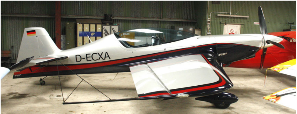
ExtremeAir Sbach 312 D-ECXA, in the hangar at Brighton(Mike Storey)

BEVERLEY/LINLEY HILL:- A visit 14.7 for the Hull Aero Club Fly-in noted the following residents AVXD T.66, G-AWUN F.150H, G-BAXV F.150L, G-BBxB FRA.150L, G-BDJD D.112, G-BFIG FR.172K (shares time with Hollym), G-BGCM AA-5A, G-BGSV F.172N, G-BIDH 152, G-BIOC F.150L, G-BPJW A.150K, G-BSCE R.22B (shares time with Humber side), G-BTHE 150L, G-BTMR 172M, G-BZBX Rans S.6, G-BZRB Blade, G-CCCJ HN.700, G-CCZM Skyranger 912S, G-CFIA Skyranger 912S, G-CGWT Skyranger 912, G-CSAV T.600N, G-HULL F.150M, G-IFLI AA-5A, G-MCJL Quantum 15-912, G-MGIC Cyclone, G-MITE X'Air Falcon, G-MTEU Pegasus XL-R (new resident), G-MVGY Hybred 44XLR, G-MYCS Gemini Flash 2A, G-MYXF Air Creation Fun, G-MYXX Quantum 15, G-MZHK Quantum 15 (usually at Rufforth), G-MZHW T.600N, G-ORUG T.600N and G-TEWS PA-28. Visitors noted were G-AWOT F.150H, G-AXTC PA-28, G-AZLV 172K, G-BLRL CP.301-C1, G-BRBA PA-28, G-BZUL Jabiru UL, G-CGJP RV.10, G-CGRL R.44 Raven, G-CGSH EV.97, G-DOTW MXP.740, G-JBSP Jabiru SP, G-RIVT RV.6, G-RIXS Europa XS-TG and G-XLAM Skyranger 912S.