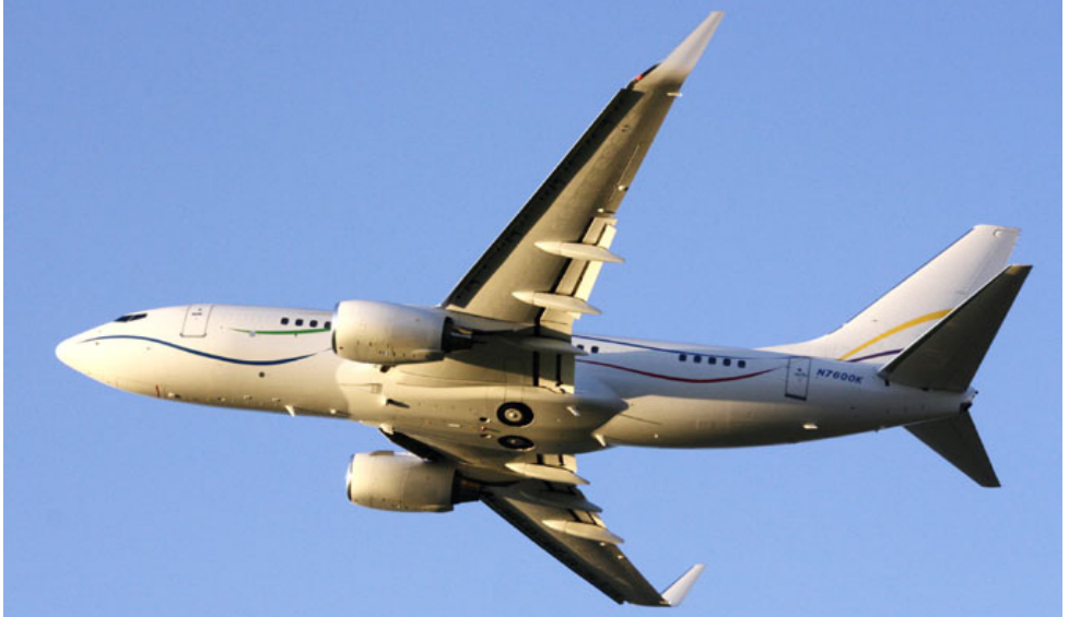
N7600K Boeing 737/700BBJ, departing LBIA, 28/06/12(Mike Storey)