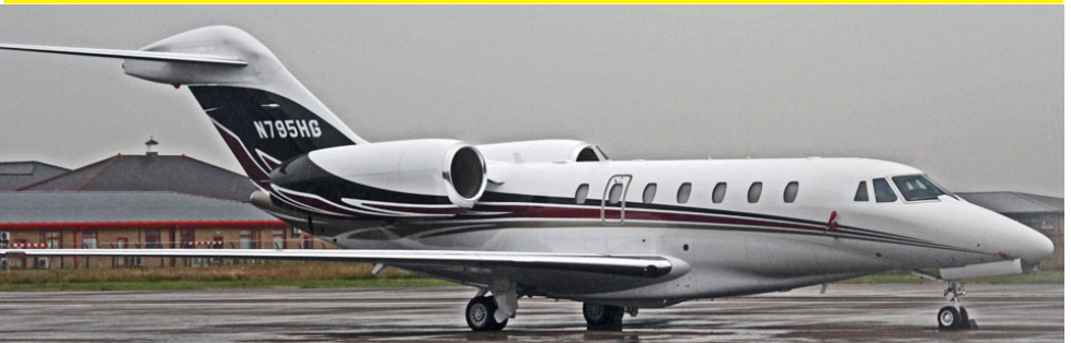
N785HG Cessna 750 Citation X, Blackpool, 16/07/12(Rod Hudson)