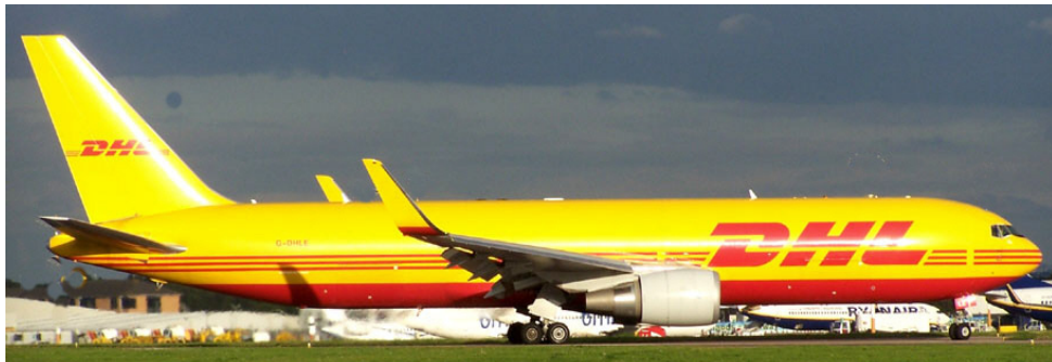
G-DHLE taxis in evening sunshine after landing at East Midlands

Your intrepid spotters were by this hour ready for refuelling and on our way to East Midlands we stopped for coffee and homage to Hunter (WT680) in the car park of the Anglia Motel, Holbeach. The Hunter is one of the last F.1s built and appears to be surviving quite well. One sip of the coffee was enough and a safer option was selected in the form of a Cornetto. We were intrigued to find Herman's Hermits advertised as a future attraction at this venue.