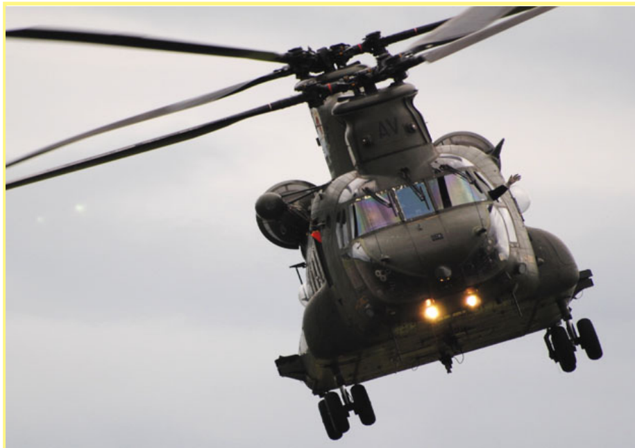
ZA714/AV Chinook HC2, RAF Waddington Air Show, 30/06/12 Steve Lord