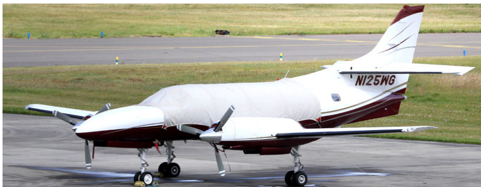
European based Merlin N125WG, wrapped up for the night on the apron, 27/7

GENERAL AVIATION:- DA-42 G-DJET (White Knight 06) from Denham(1210) to Gamston(1231). PA-32 N808CA from Full Sutton(1513) to Le Touquet(1600).