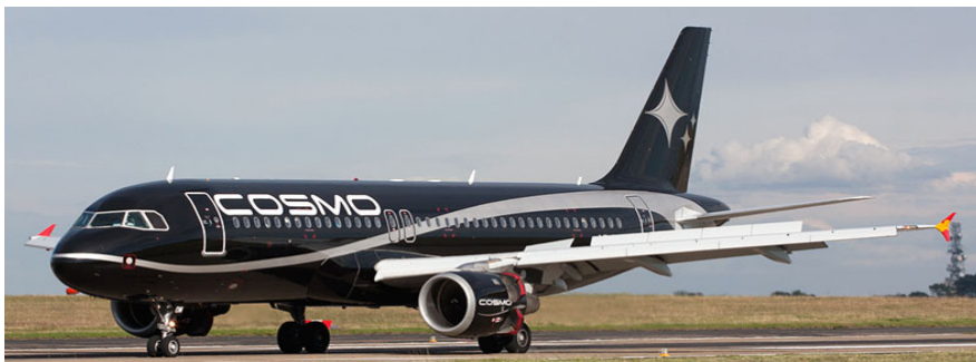
LY-COM Airbus A.320 Cosmo Airways(Robert Burke)