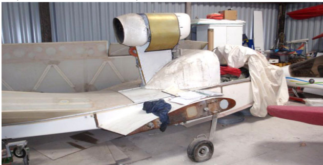
The unique Coot Seaplane stored dismantled at the airfield, believed to be G-BPMN