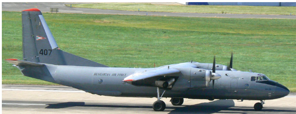
Hungarian Air Force AN-26 "407" taxiing for departure home to Kecskemet AFB, 19/7