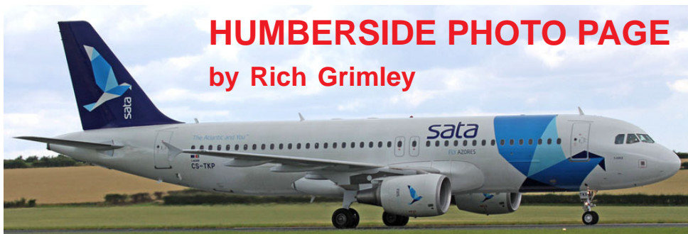
A.320 CS-TKP of SATA Air Azores arriving for an outbound flight to Madiera, 29/7