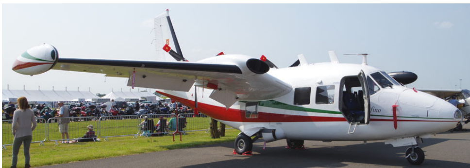
I-FENI Piaggio P-166C, rebuilt by Piaggio, at Waddington Air Show, 06/07/13