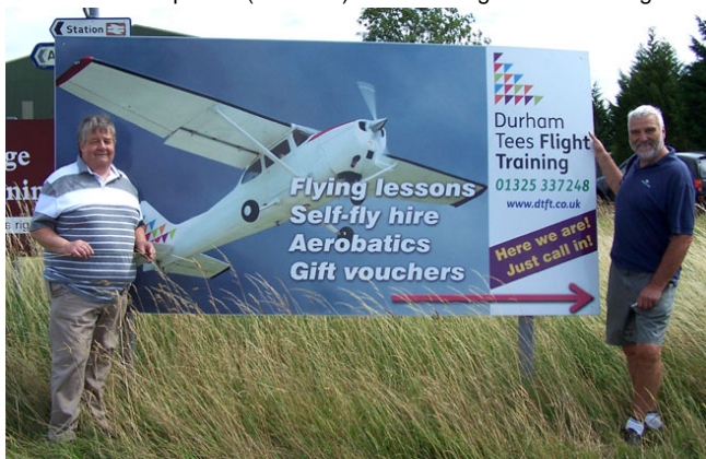
"Two men hiding in the long grass"