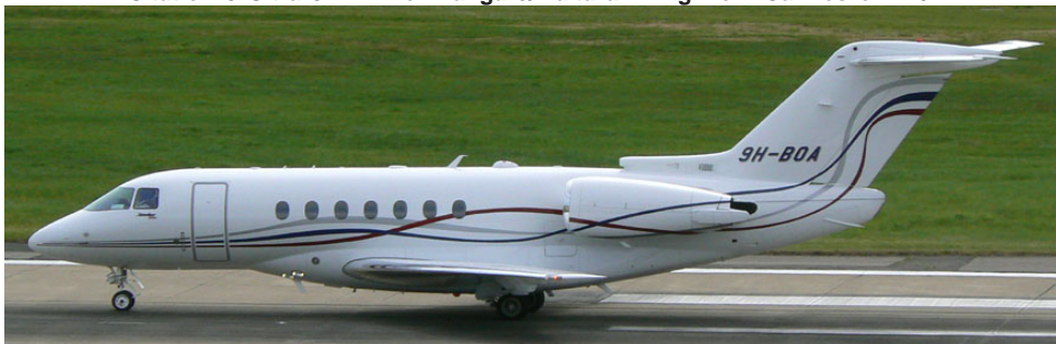
Hawker 4000 9H-BOA operated by Orion(Malta) Ltd made two visits to LBIA in July