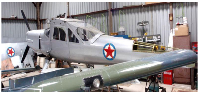
Former Yugoslav Air Force UTVA 66 YU-DLG/51 109 which is under restoration