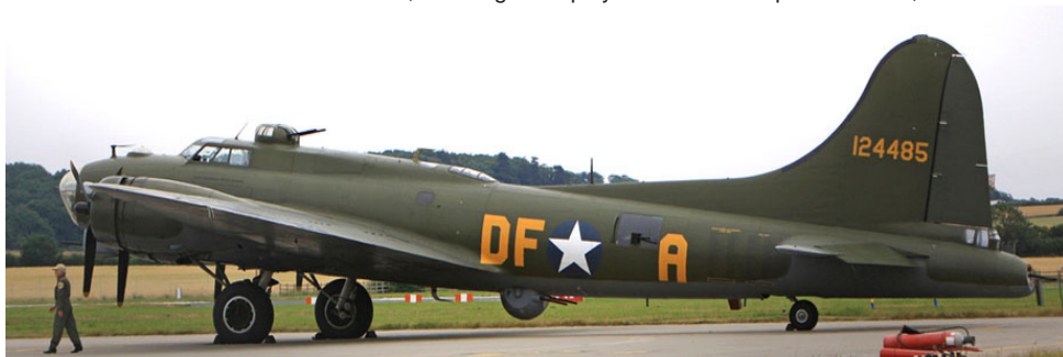
Also based for the Air Show, 27th/28th July, was Boeing B-17D G-BEDF "Sally B"