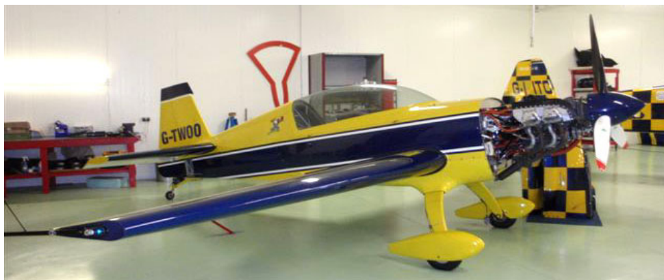
Pictured at its home base by David Thompson, Extra EA.200 G-TWOO visited LBIA on 6/7