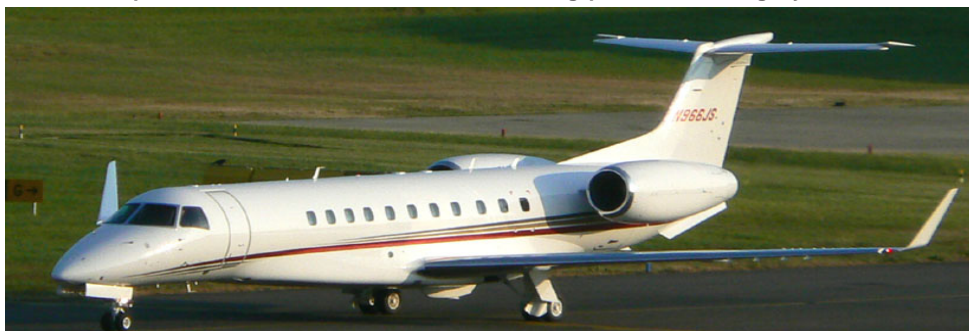
Legacy N966JS of Pebuny Inc arrived at LBIA on 23/7 and was due to depart to Moscow on 25/7. However the aircraft became unservicable and was replaced by Global HB-JFB