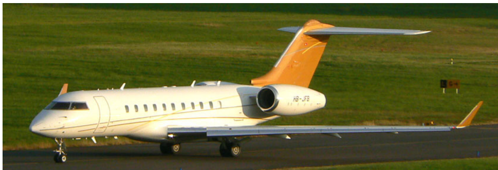
Global Express HB-JFB of Nomad Aviation rescuing pax from u/s Legacy N966JS, 25/7