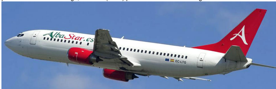
Boeing 737/300 EC-LTG of Alba Star operated a pilgrim charter f/t Lourdes on 5/7

positioned out to Blackpool, G-CELA(033E) positioned out to Newcastle, 23/7 G-CELF(041A) positioned out to Manchester, G-GDFN(031E/035E) positioned out to/in from Edinburgh, 24/7 G-GDFN(042A) positioned out to Bergerac, G-CELF(041A/44A) positioned in from Manchester/out to Edinburgh, G-CELG(043A) positioned in from Bergerac, 25/7 G-GDFN(042A/043A) positioned out to/in from Manchester, G-CELF(041A) positioned in from Edinburgh, 27/7 G-CELR(033E) positioned in from Edinburgh, G-GDFN(041A/042A) positioned out to/in from Belfast, G-CELF(043A) positioned out to Manchester, 28/7 G-GDFN(041A/043A) positioned out to/in from Manchester, G-CELR(034E) positioned out to Edinburgh, G-GDFT(045A) positioned out to Newcastle, G-CELJ(049A) positioned in from Newcastle, 29/7 G-CELB(041A) positioned out to Venice, 30/7 G-CELB(043A) positioned in from Edinburgh, G-GDFG(041A) positioned out to Jersey, G-CELF(049A) positioned in from Manchester, G-CELE(042A) positioned in from Jersey, G-LSAN(044A) positioned out to Glasgow, 31/7 G-GDFG(031E) positioned out to Alicante, G-CELV(032E) positioned in from Alicante, G-CELP(049A) positioned out to Edinburgh, G-GDFG(048A) positioned in from Edinburgh.