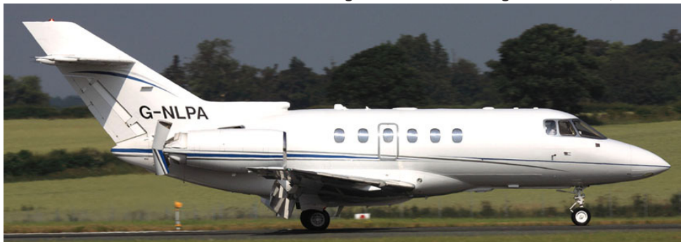
Operated by Hangar 8, Hawker 750XP is seen arriving for a visit on 17/7