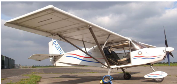
Skyranger Swift 912S G-CETU based at Rufforth (David Thompson)

WICKENBY:- G-BZHL AT.16 has moved to Hibaldstow to continue its rebuild.