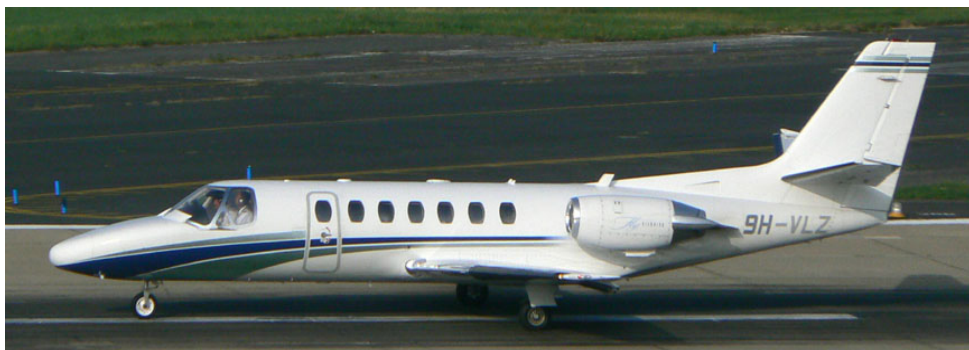
Citation 5 Ultra 9H-VLZ of Hangar8/Malta arriving from Cannes on 12/7