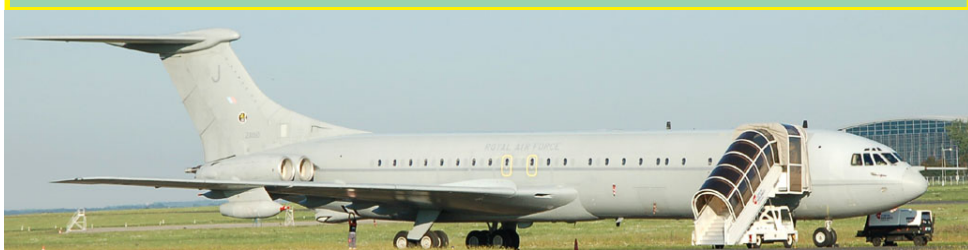
ZA150 VC-10 K3, RAF, Prague/Ruzyne International, 14/08/13(Martin Zapletal)