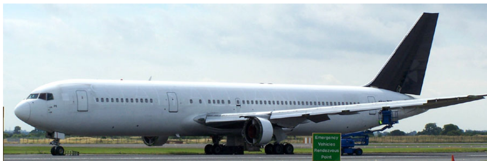
“B767 SP-LPE awaiting its fate”

Our most northerly visit was to Newcastle Airport, which we approached through the Tyne Tunnel complex. In a previous life this Airport boasted excellent spectator facilities, but the same terrorist paranoia has changed it to an airport almost impossible to view as a spectator. I am sure someone will be proud of this achievement, but it was a great disappointment. There were plenty of aeroplanes, but nothing to set an avid's pulse racing. To cap it all we got stuck in a Western By Pass traffic jam and had to peel off to port and wend our way through the north east rush hour and Gateshead, before emerging just north of Washington Services. We took refuge here in Costa Coffee to re-plan the remainder of the day. The new plan that emerged over a “flat-white” involved a late call at Bagby followed by Leeming. However, by the time we reached the “circuit” for Bagby we decided the airfield would be closed and so continued our progress. The next target was Leeming. As we sped south on the A.1 a discussion ensued about the 50 th Anniversary calendar. Such was the intensity of the debate that we missed the turn for Leeming. With the day drawing to a close we elected to take refuge in a Yorkshire pub garden near Knaresborough and view the sinking sun through the bottom of a welcome glass of the amber liquid, on a lovely warm summer evening. Happy birthday Ed.