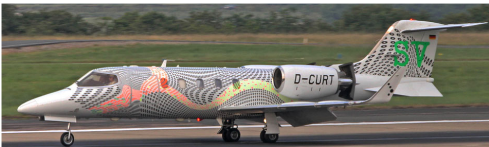
Colourful Lear Jet 31 D-CURT opearted a charter f/t Ibiza on 12/7(Rod Hudson)