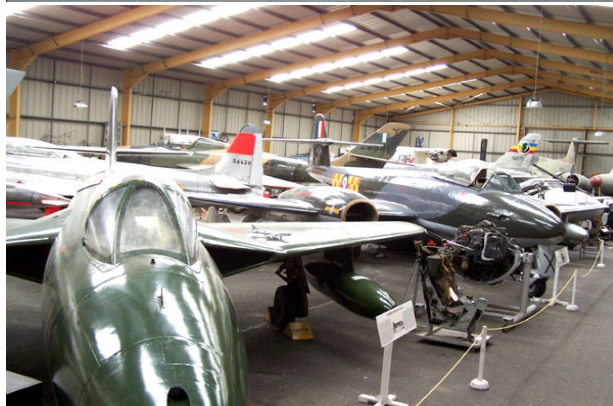
“NEAM Hangar 3 - all a bit cramped”