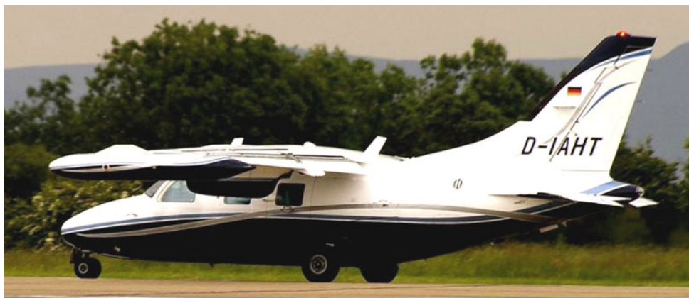
Mu.2B D-IAHT of Fly-Point Flugservice taxiing for departure at Teesside on 17/6

16/6 D-IFEY Citationjet 2(Air Bremen 316A), G-AZTS Cessna F.172N 17/6 D-IAHT Mitsubishi Mu-2B, G-OMSV King Air 200GT, XZ612 Lynx(Armyair 965, overshoot) 19/6 D-CNAF Metroliner(Bid 9A), CS-DKI Gulfstream 550(NJE 144A), EC-GFK Metroliner 20/6 D-CPSW Metroliner(Bid 6B), CS-DQB Citation XL(NJE 079D), ZJ236/X Griffin(Shawbury 123) 21/6 F-GTJM TBM-700, ZD620 BAe.125(Northolt 30), EI-GJL Dauphin, G-ZVIP King Air 200 23/6 G-GDEZ Hawker 1000B, G-JMED Lear Jet 35(Air Med 057), G-BPRI Twin Squirrel 24/6 G-CBNG Robin R.2112, Tucanos ZF347/ZF269(LOP70/64 training), G-MPLB Cessna 182T 25/6 D-ICCC Cessna F.406(Twin Goose 200), Tucanos ZF287/ZF142(LOP03/65, training) 26/6 G-MAFF BN-2T Islander(Rushton 66), G-BURD Cessna 162P 27/6 N288Z Global Express, ZA400 Tornado GR4A(MRH 03, o/s), ZK459 Typhoon(Chaos, o/s) 29/6 LY-FLH Boeing 737/300(Skypol 842P), G-FBJH Embraer 170(Jersey 5DA) 30/6 D-CHAT Citationjet 3(EFD 555), G-ZVIP King Air 200(Prestige 67F), G-MOGY R.22B