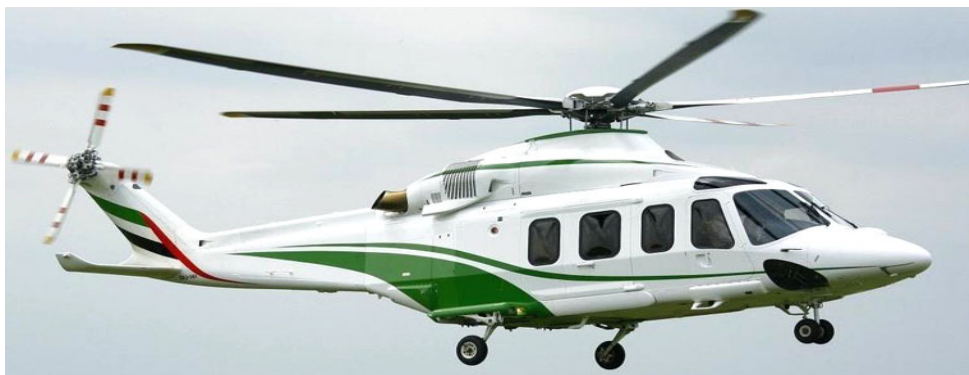
Agusta AW139 of the Dubai Air Wing which called at Coney Park for fuel on 15/7