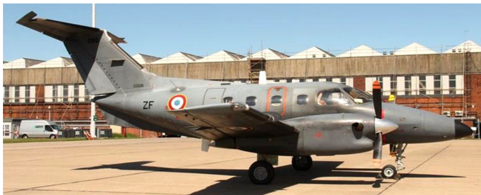
French Air Force EMB,121 Xingu 090/ZF basking in the sunshine at Teesside on 4/6

TEESBAY:- Crossing the bay at 1610/1622 respectively on 10/6 were a pair of Super Pumas VP-CHC/VP-CHE routing from Aberdeen to Norwich. Also at 1610 flying over was Italian Air Force Boeing 767/2ER tanker MM62227(IAM 1433) with Typhoons in tow, heading for the USA. Earlier in the day MM62228(IAM 1432) followed the same route again escorting Typhoons. On 24/6 a pair of CV-22 Ospreys 12-0057/12-0058(Sway 31/32) flew over at 1525 on delivery to Mildenhall. They were accompanied by a pair of MC-130H Hercules 88-0195/88-1803(Rule 31/32) acting as support ships.