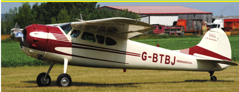
G-BTBJ Cessna 195 Businessliner(built 1952), Brighton, 13/07/13(Steve Lord)