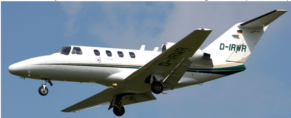
Citationjet D-IRWR of Bizair on final approach to Runway 32, 13/7(David Blaker)