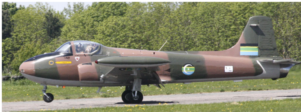
This aircraft visited Lbia on 10/7 using call-sign "Sword 8"

North Weald is fast becoming the 'mecca' for vintage jets with Gnats,Vampire,Hunter and other JP'S all operating from the former Battle of Britain airfield.