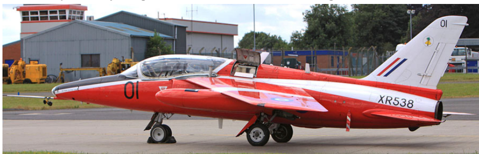
Folland Gnat G-RORI/XR538, awaiting to display at the Cleethorpes Air Show, 28/7