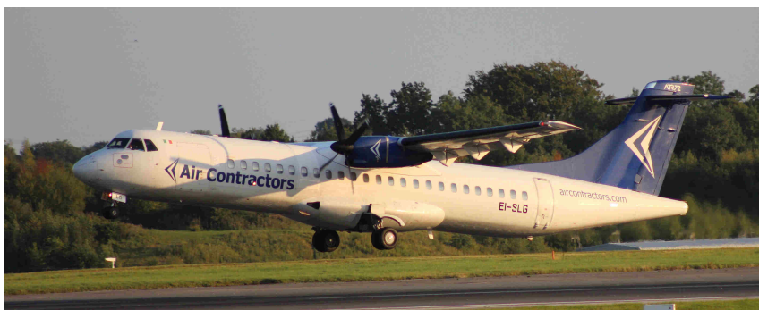
Air Contractors ATR-72 EI-SLG (Jim Stanfield)