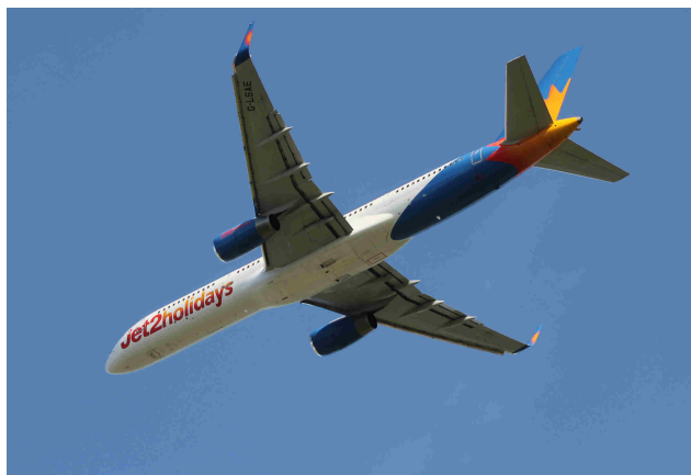
Jet2.com Boeing 757 G-LSAE (Alan Sinfield)