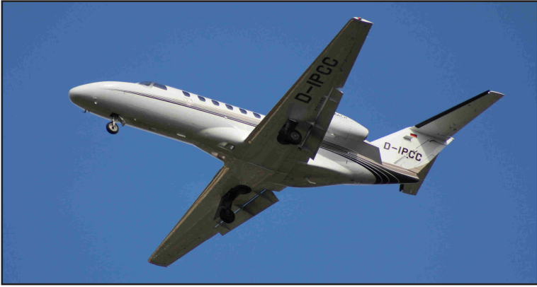
D-IPCC Citation CJ2 LBA (Jim Stanfield)