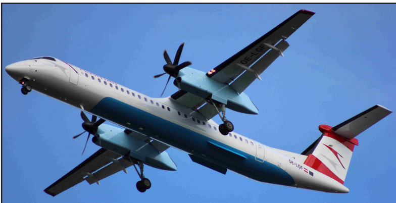
OE-LGF Bombardier Dash 8 Q.400 Austrian LBA (Jim Stanfield)