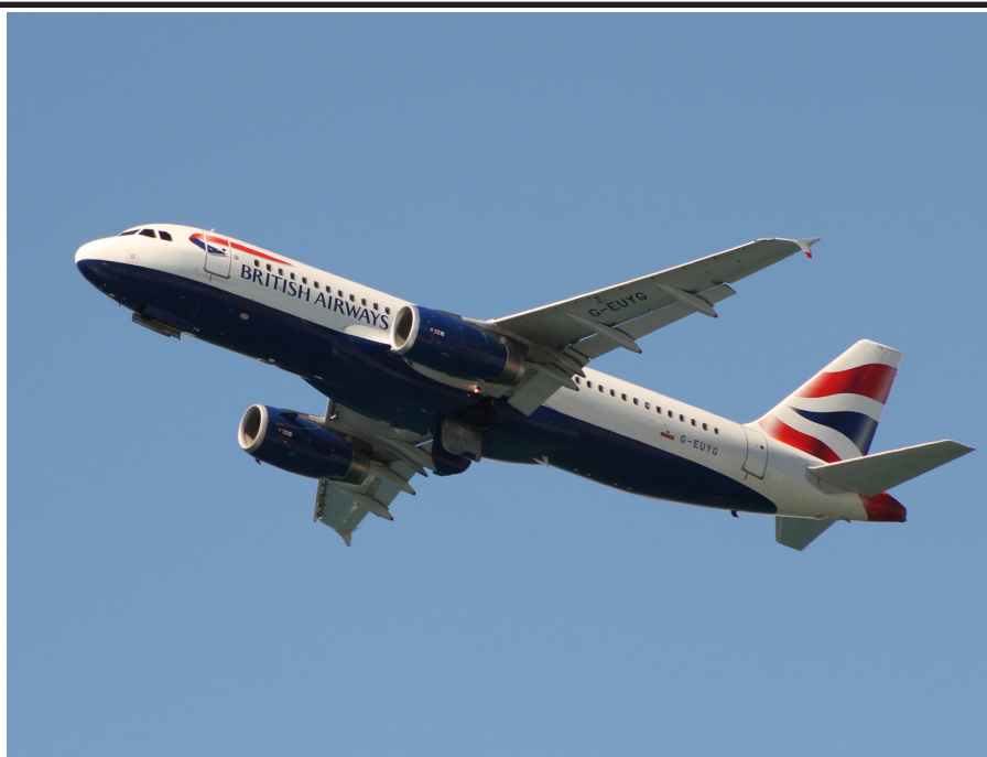
G-EUYG Airbus A320 British Airways Gibraltar 30 July 2015 Alan Sinfield