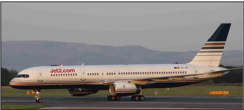
EC-ISY Boeing 757 Privilege Style Manchester (Alan Sinfield)