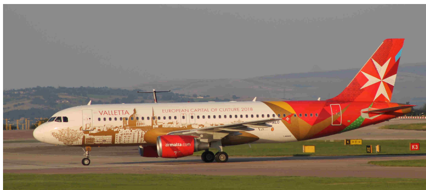
Air Malta Airbus A320 9H-AEO (Alan Sinfield)