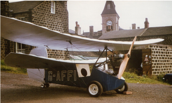
Just completed G-AFFI standing in front the garage in Yeadon where it was built with Yeadon Town Hall clock in the background.

Three members of Air Yorkshire came together 40 years ago this year to build a Flying Flea, now recognised as the first homebuilt aeroplane which for a brief moment was all the rage in the mid 1930's. It was designed to be made by anyone capable of knocking a wooden box together and they were built in their 100's around the world. Then, disaster as crash after crash revealed that in certain conditions it was incapable of being pulled out a dive and they were banned. The dream of universal light aircraft ownership was over.