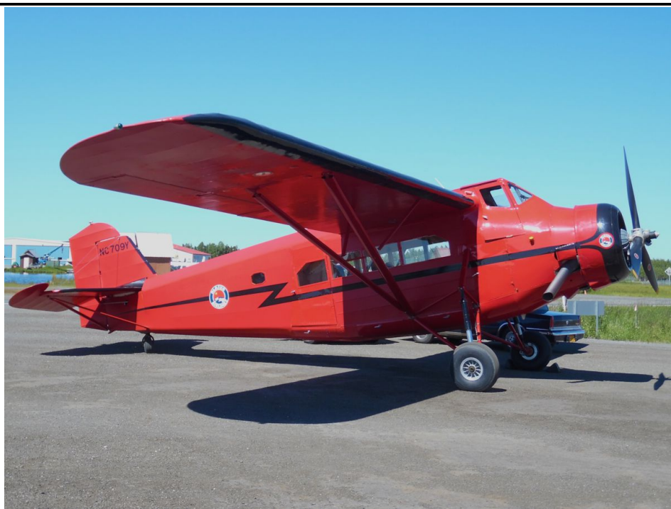
NC709Y Fairchild Pilgrim 100B Alaska Aircraft Museum Keith Manning