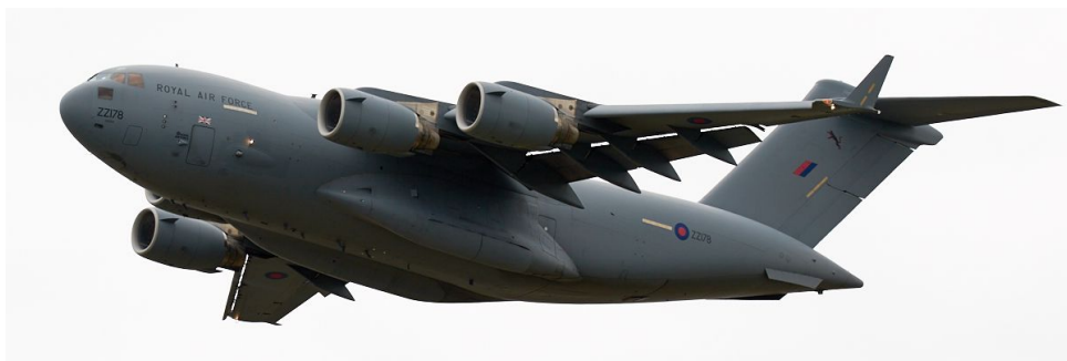
ZZ178 Boeing C17 Globemaster III 26/07

PA-28 Cherokee Warrior G-BPMF dep 08:17 to Barrow-in-Furness, Aerospatiale AS355 G-PIPB arr 11:16 from Denham dep 12:49 c/s Whisper41, Cessna 650 Citation VII 9H-WII arr 12:08 from Palma dep 13:32 to Dublin.