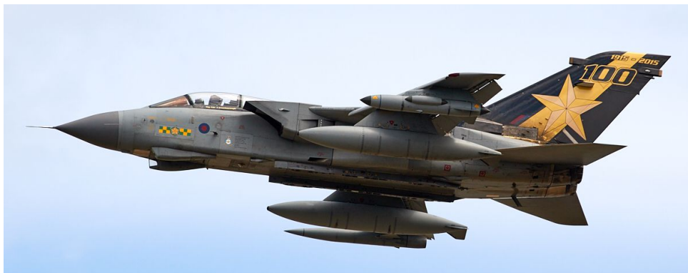
ZA548 Tornado GR4 05/07