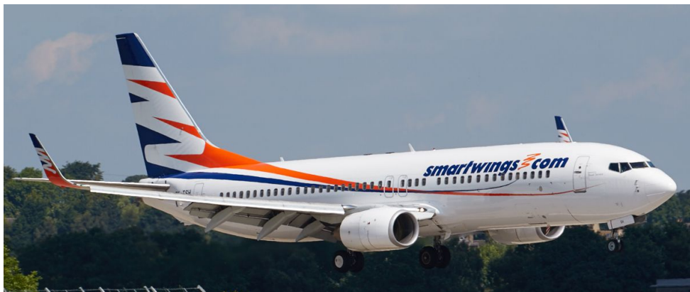
OK-TSH Boeing 737-800 Smartwings/Travel Srv 19/07

The company operate a twice weekly (Fri/Mon) service from/to Barcelona using A319/320 aircraft.