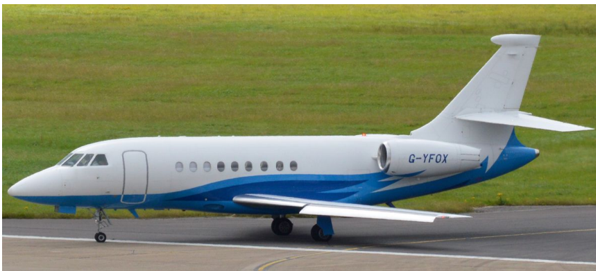
G-YFOX Falcon 2000EX 30/07

Cessna 560 Excel CS-DQA dep 08:39 to Le Bourget, Cessna 750 X D-BEEP dep 08:45 tpo Tenerife, Falcon 2000EX G-YFOX arr 10:17 from Vnukovo dep 10:57 to Riga c/s Lynx18YF. PA-28 Cherokee Warrior G-BPMF t/f Sandtoft (13:27/15:32).