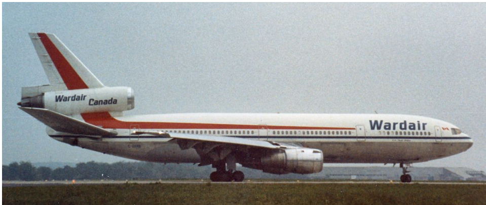
C0GXRB DC-10 28 May 1987