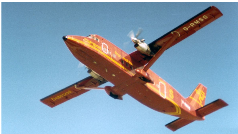
G-RMSS Shorts SD.360 31 October 1985