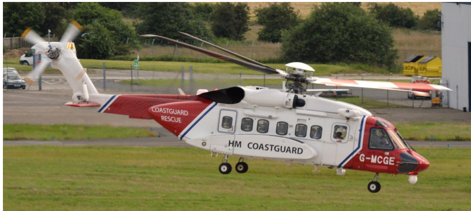
G-MCGE Sikorsky S92 12/07

Beech C90 Kingair F-GEXV dep 00:12 to Le Havre, Saab SF340 SP-MRB dep 08:52 to Dublin as Iguana 731, Phenom 100 9H-FGV arr 09:48 from Southend dep 12:24 to Frankfurt arr back 19:13 n/s, SOCATA TBM 850 N989PR (cn 467) f/t Cranfield (11:42/13:54), Cessna 152 G-WACT f/t Teeside 14:36/15:26), Sikorsky S92 G-MCGE arr 15:37 dep 16:16 to Humberside c/s Rescue 912, Gulfstream 200 OE-HAS dep 18:08 to Barcelona, Beech 200 Kingair ZK452 overshoot at 21:47 c/s Cranwell 82.