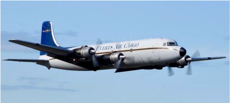
Everts Air Cargo DC-6 Clive Grant

The next morning found the 24 tour participants boarding a coach, for a ramp tour of Anchorage Airport. This was comprehensive, lasting around five hours and included every area. The freight operations of the major companies, FedEx, DHL and UPS were impressive, as were the many air taxi and freight operators, with their variety of aircraft. A highlight was a visit to Everts Air Cargo, to inspect their fleet of DC-6s and DC-9s. These are in regular operation, hauling all manner of items to remote parts of Alaska.