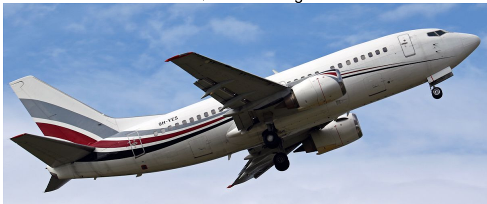
9H-YES Boeing 737-500 Air X Charter 10/07