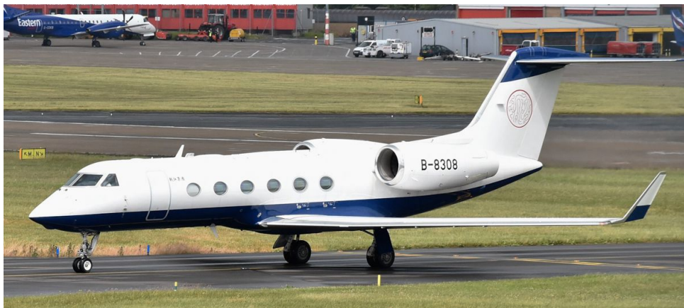
B-8308 Gulfstream G450 02/07 Rod Hudson

Cessna 560 Excel G-XLTV c/s Arena 22 dep 07:50 to Ibiza, learjet 60 D-CNUE arr 10:37 from Rhodes n/s, Robinson R22 G-BTDI arr 11:27 from Prestwick dep 12:16 to Conington, Piper PA-28 G-BOKA arr 11:27 from Fair Oaks until 4 th , Aerospatiale As355 N799AM arr 13:28 dep 16:12, Cessna 525 CJ2 N902MZ arr 14:10 from Doncaster dep 15:49 to Bordeaux.