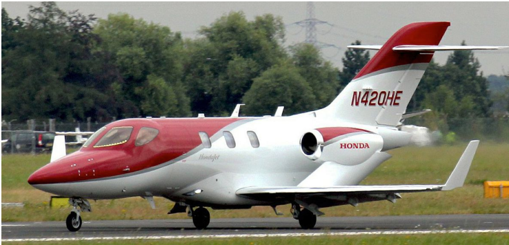
N420HE Hondajet 26/07

11th ZZ504 Beech 350 King Air +15th (T) 11th ZD709 Tornado (T) (FV) 14th G-BYVM Grob Tutor (T) 18th ZJ807 Eurofighter Typhoon (T) (FV) 19th ZA710 Boeing CH-47 Chinook (Fuel-stop)? (FV) 20th ZJ228 Westland/MDD WAH-64 Apache AH.1 Army Air Corps (Fuel-stop) 21st ZJ690 BD-700 Global Express/Sentinel (T) 25th ZF264 + ZF205 Tucano (T) 27th ZA675 Boeing CH-47 Chinook (Fuel-stop)? (FV) (FV) First Visit. (T) Training. (H) Helicopter. (F) Freighter. (M) Maintenance (RTB) Return to Base