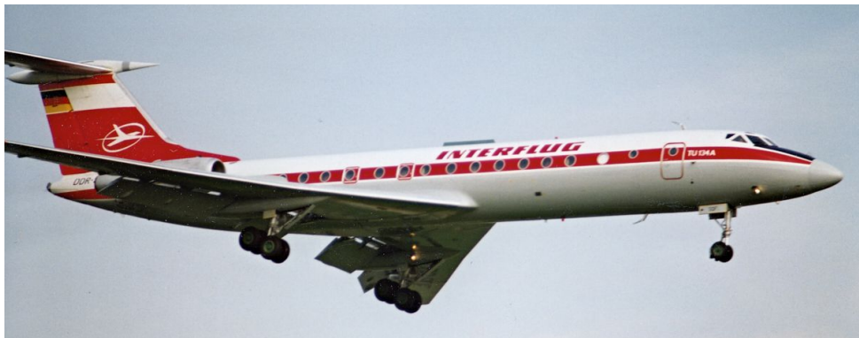
DDR-SDF TU.134A 3 October 1988