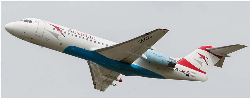
OE-LFQ Fokker 70 Austrian 23/07 Stewart Robertshaw

Innsbruck "2587/2588":-2/7 OE-LFP, 9/7 OE-LFP, 16/7 OE-LFQ, 23/7 OE-LFQ, 30/7 OE-LFP.