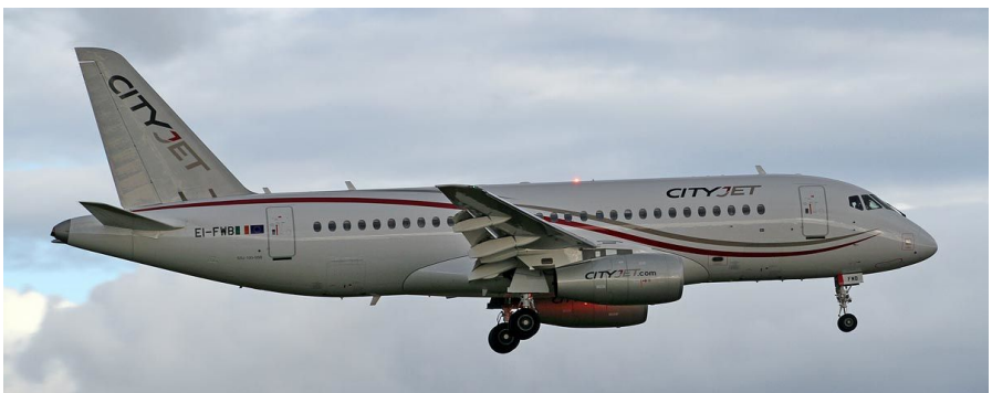
EI-FWB Sukhoi Superjet 100/95B 25/07

31/07 G-GHZJ Socata TB9 Tampico n/s t ?, G-POWC Boeing 737-300 f Friedrichshafen t Stansted Titan Airways