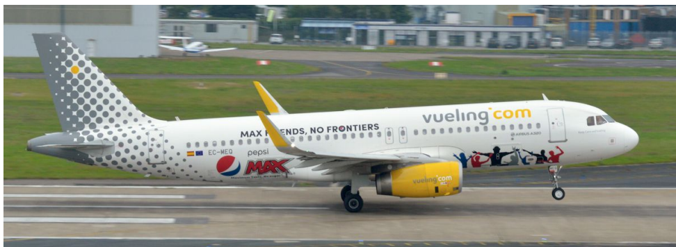
EC-MEQ A320 Vueling 18/07

Barcelona (8794/8795) :-1/7 EC-LVS, 4/7 EC-MFL, 8/7 EC-MDZ, 11/7 EC-LZF, 15/7 EC-LQJ, 18/7 EC-MEQ, 22/7 EC-HTD, 25/7 EC-MBF, 29/7 EC-LRG.