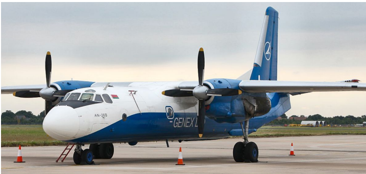
LZ-FLA AS-26 Bright Flight 22/07