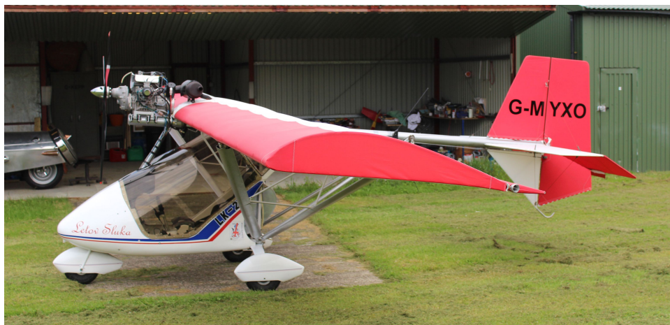
G-MYXO Letov LK-2M Sluka

G-STRG Cyclone AX2000 G-CCVN Jabiru SP-470 G-MYXO Letov LK-2M Sluka G-BPVZ Luscombe Silvaire G-JWCM S/A Bulldog