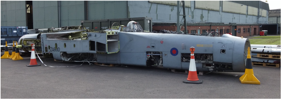
ZA600 Tornado GR4