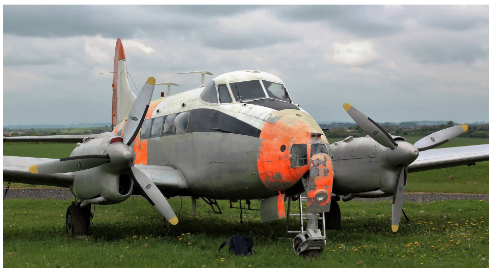
DH Dove ex-D-IFSB

Definitely on my list for future visits!!