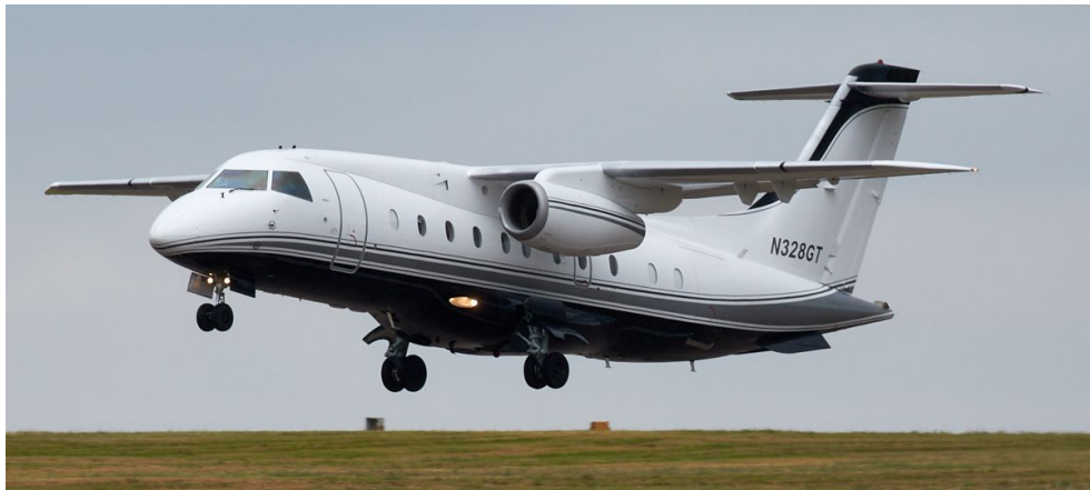
N328GT DornierJ328 29/07 David Blaker

Cessna 560 Excel CS-DXU arr 06:38 from Luton as NJE754H dep 08:00 to Cork as NJE549N, Dornier 328 Jet N328GT arr 10:30 from Dubrovnik dep 12:02 to Keflavik (fuel stop), Learjet 35 D-CCCB arr 13:32 from Geneva dep 16:07 to Soellingen (ambulance flight), Cessna 525A CJ2 M-ICRO arr 14:36 from Gamston dep 15:06 to Rotterdam, Cessna 750 X D-BEEP arr 15:39 from Lisbon n/s, PA-32R Saratoga G-BJCW dep 16:12 to Fairoaks, Cessna 560 Excel CS-DQA arr 17:48 from Cork as NJE355K n/s.