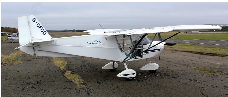
G-CFCD SKY RANGER

G-AZTS Cessna 1729 minus prop) G-HARL IKARUS G-MRSS IKARUS C42 G-SJES EV97 EUROSTAR G-GIAS IKARUS C42 G-TSKS EV97 EUROSTAR G-POLL SKY RANGER G-COPE SKY RANGER G-CFCD SKY RANGER G-BAJR PA28 CHEROKEE