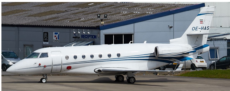
OE-HAS Gulfstream G200 12/07