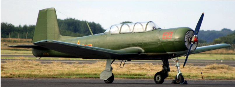
G-BCCG/68 Nanchang CJ-6A Chujiao 26/07

26/07 G-LAUD Cessna 208 Caravan Amphibian n/s t Firth of Clyde Laudale Estate LLP, N95GT Cirrus SR22 ?/? , G-BVVG/68 Nanchang CJ-6A Chujiao n/s t ? Nanchang CJ6A Group, G-OGGM Cirrus SR22 f Gloucester t Blackpool Morson International, G-IASM Beech 200 Super King Air f Prestwick t Doncaster Broadsword A.P.