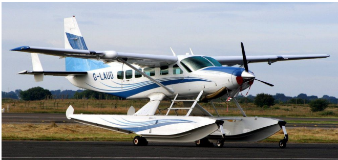
G-LAUD Cessna 208 Caravan Amphibian 25/07

27/07 G-DMPP Diamond DA42 f Edinburgh t Gamston Diamond Executive Aviation, 9H-SSG Dassault Falcon 100 f Valencia n/s Hyperion Aviation