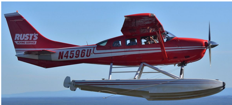
Cessna 206 Trevor Davies

Another floatplane ride with Rust's Flying Service was next on the agenda. I chose the Cessna 206 this time. Today's trip took us out over the marshy wilderness, that lies beyond Anchorage. As our party were flying in two aircraft, the pilots obligingly flew in formation for a while, to provide extra interest. They also touched down on a rather choppy lake. We felt the bump, bump, bump of the floats on the water, before taking off again.