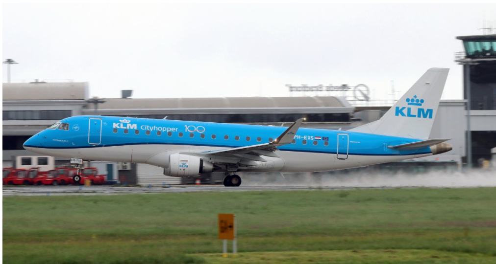
PH-EXS Embraer 175 KLM 04/07 Paul Whincup