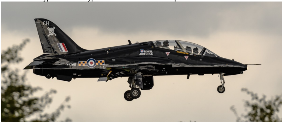
XX198/CH Hawk T1 02/07

02/07 G-BYWK Grob G115E Tutor T1 f Leeming o/s RAF - NUAS/11 AEF, G-BYWA Grob G115E Tutor T1 f Leeming o/s RAF - NUAS/11 AEF, N120MX Cirrus SR20 f Retford Gamston t Blackpool, G-BYWA Grob G115E Tutor T1 f Leeming c/t RAF - NUAS/11 AEF, XX198/CH Hawk T1.A n/s t Leeming RAF - 100 Sqdn, EI-XHI Eurocopter EC155B Dauphin 11 f/t Leeds Bradford Exec Helicopter Mtce 03/07 ZK381/381 Typhoon T3 f Typhoon T3 o/s RAF - 29 Sqdn