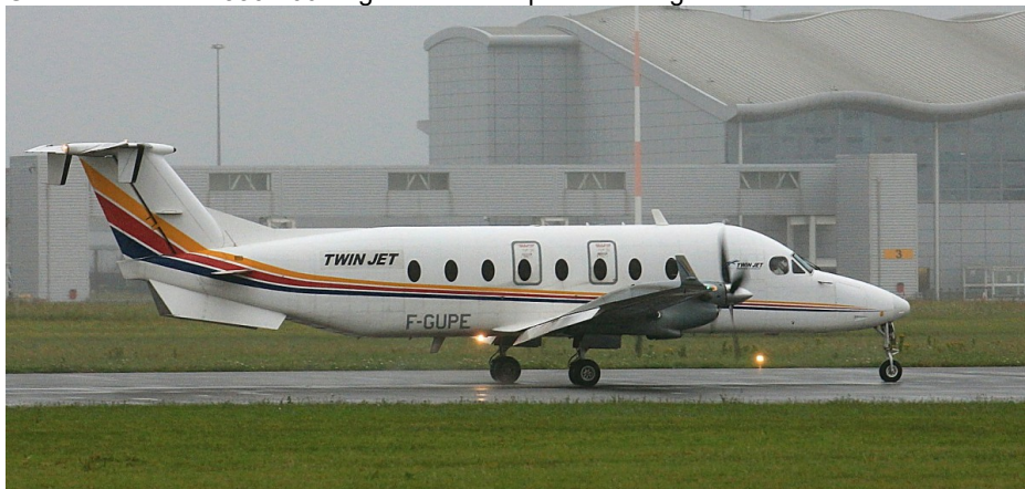
F-GUPE Beech 1900D Twin Jet 02/07