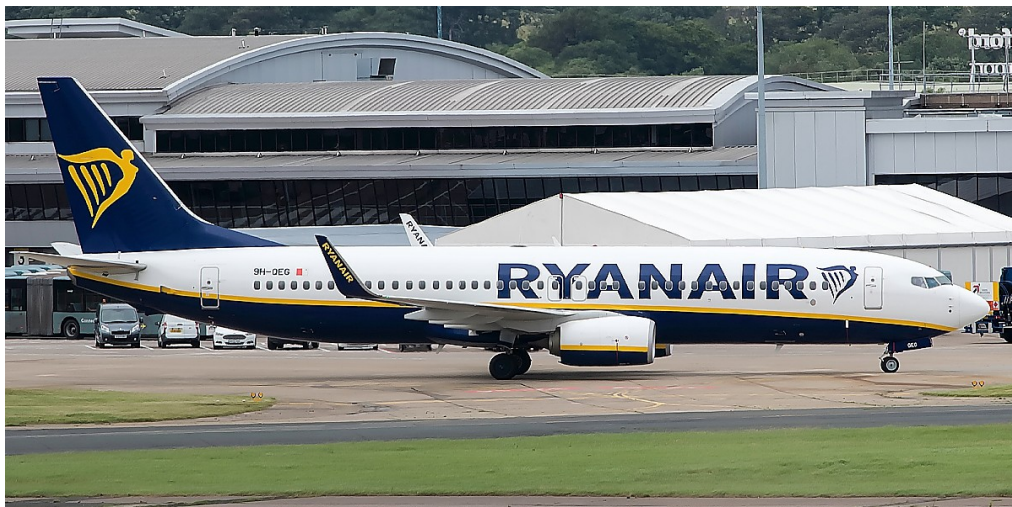
9H-QEG Boeing 737-800 Ryanair 05/07 Stewart Robertshaw

Based aircraft:- EI-DHR(1/7-3/7), EI-DHE(3/7-19/7), EI-DCF(19/7-24/7), EI-DHG(24/7-26/7), EI-DYV(26/7-31/7).