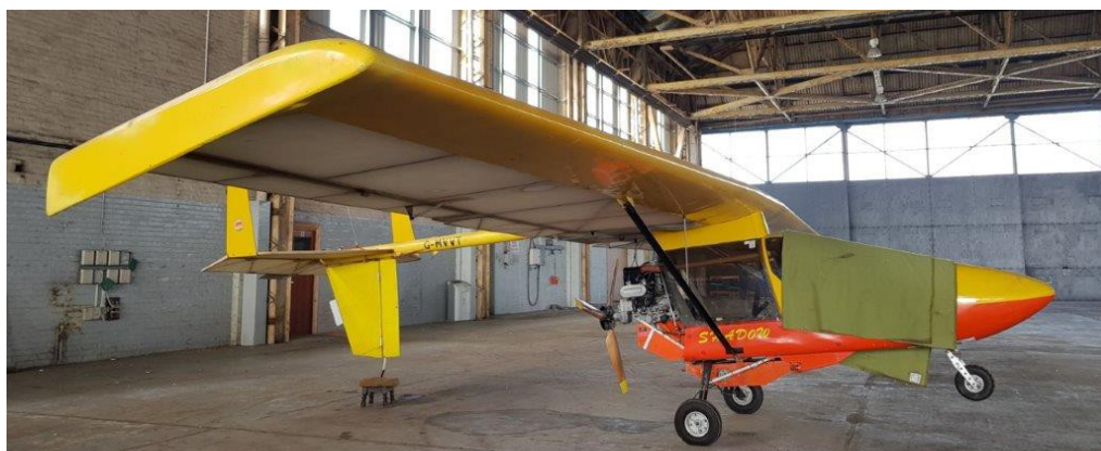
G-MVVT Metal-Fax Shadow CD