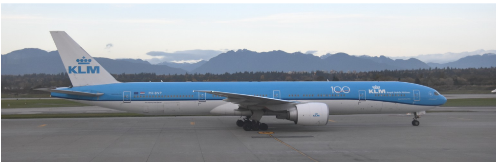
PH-BVP KLM B777-300

After a very enjoyable 12 day trip it was time to return home. A KLM B777-300 PH-BVP was assigned for the trip; only seemed about half full. One final bonus was that during online check-in; I was offered an upgrade to Business class for £348. As this seemed a good deal and I had only flown Economy on previous trips I took up the offer. After an 8 1/2 hr flight back to Schiphol; I then took the usual E175 for the final flight to Humberside.