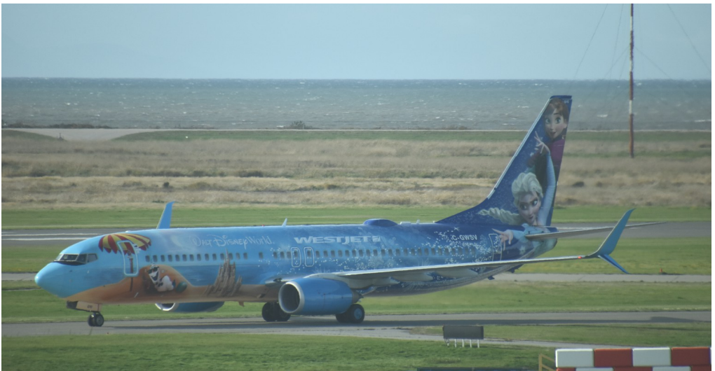
C-GWSV Boeing 737-800 Westjet

After 5 days I took a Westjet flight to Calgary as I had always wanted to do a tour of the lakes in the Canadian Rockies. My flight was operated by a B737-800 in the Disney Frozen livery which is certainly different from the standard colours. A very enjoyable trip was made to Banff, Lake Louise and Emerald lakes; I would highly recommend a visit as the scenery was impressive. Calgary airport was (as expected) dominated by Westjet operations. Highlights were a new B787 on a Toronto service and several SF340s. Also seen was a Flair B737-400; I believe this is a new low cost carrier.