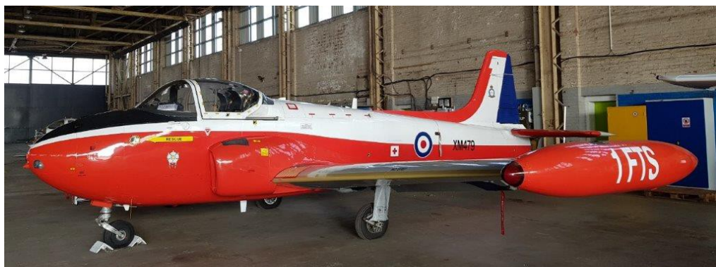
XM479 Jet Provost T3A