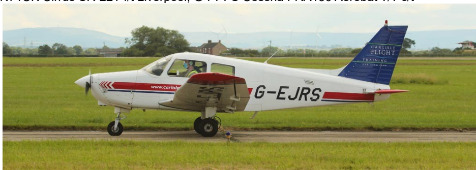
G-EJRS Piper PA28-161 Warrior II 24/07