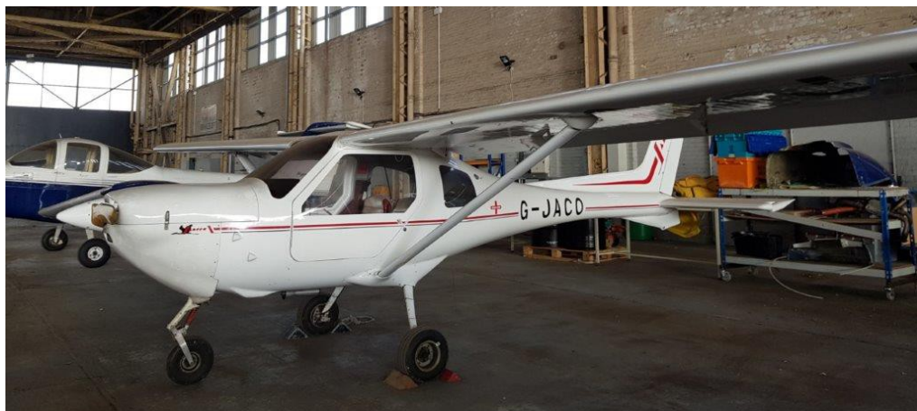
G-JACO Jabiru UL