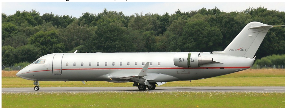
9H-ILI Canadair Regional Jet 200 25/07