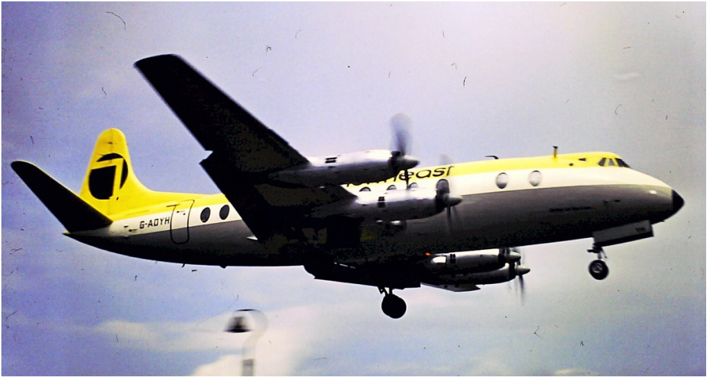
G-AOYH LBA over Victoria Avenue North East Viscount G-AOYH landing on R.10 Yeadon c. 1960s