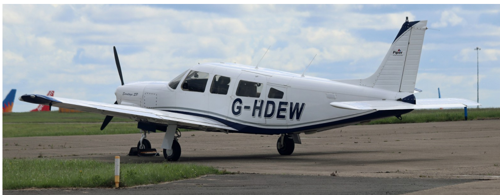
G-HDEW PA-28 13/07 Paul Whincup