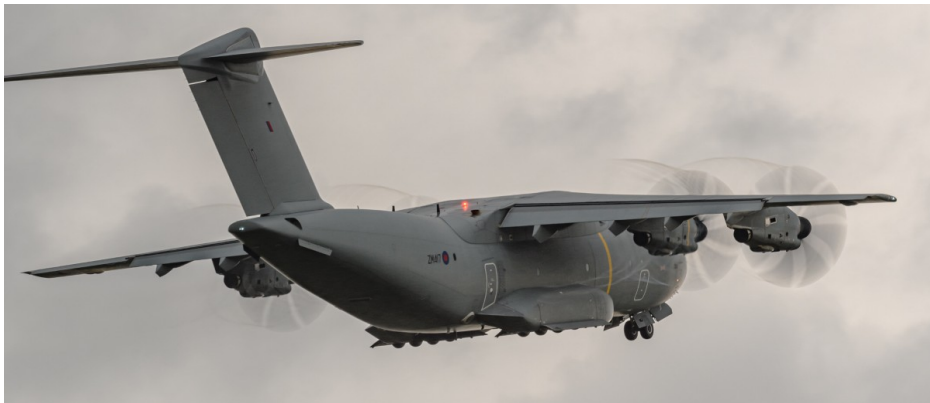
ZM417 Airbus A400M Atlas C1 01/07

01/07 G-SNDS Cirrus SR20 f Leeds East o/s, ZM417 Airbus A400M Atlas C1 f Brize Norton RAF - 70 Sqdn, XX198/CH Hawk T1.A f Leeming RAF - 100 Sqdn, G-NHAD Airbus Dauphin AS.365 N3 f Leeds Bradford t Uraly Nook Heliport GNAA, G-HEMN Eurocopter EC135 f Gloucestershire f Aberdeen via Dundee Babcock MCS Onshore