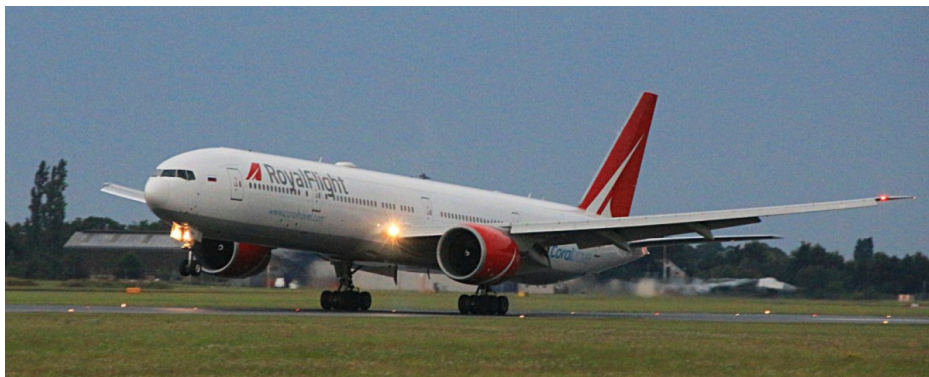
VP-BGK Boeing 777-300 Royal Flight 31/07

1st G-SPRE Cessna 550 Citation Bravo 4th OY-WET Cessna 680 Citation Sovereign (M) (FV) 4th N116MZ Textron Aviation Cessna 525 Citation M2. 7th VP-BCW Hawker 800XP Dep. (M) but diverted back to D.S.A. tech Dep. 10th 10th D-ILOU CitationJet 525 CJ2+ (FV) 10th OY-VAY Bombardier Challenger 605 (T) (FV) 10th CS-CHJ Bombardier Challenger 350 (FV)