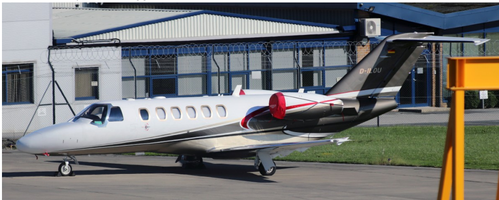
D-ILOU Citation 525 SYLT Air 11/07 Paul Whincup

Phenom 300 CS-PHN arr 09:40 from Brno dep 11:21 to Southampton, Cirrus SR20 N369AL arr 10:05 dep 13:01, Cessna 525A CJ2 D-ILOU dep 10:32 to Palma, Piper PA-28-181 Archer G-BSKW arr 11:51, Airbus A400M Atlas ZM402 arr 17:26 fr RAF Akrotiri dep 17:42 to RAF Brize Norton c/s Ascot 4495..