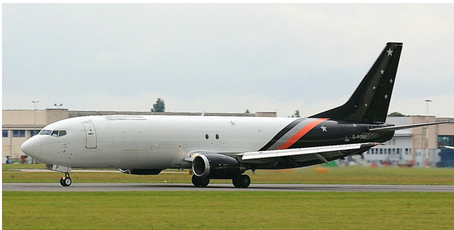
G-POWP Boeing 737-400F Titan Airways 01/07

1st G-POWP Boeing 737-400F Titan Airways (F) (T) (FV)