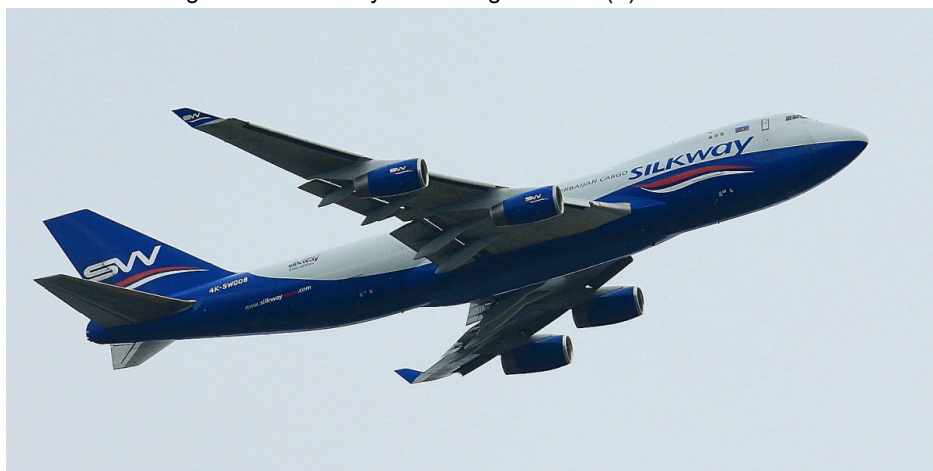
4K-SW008 Boeing 747-400 Silkway West Cargo Airlines 01/07

1st 4K-SW008 Boeing 747-400 Silkway West Cargo Airlines (F)