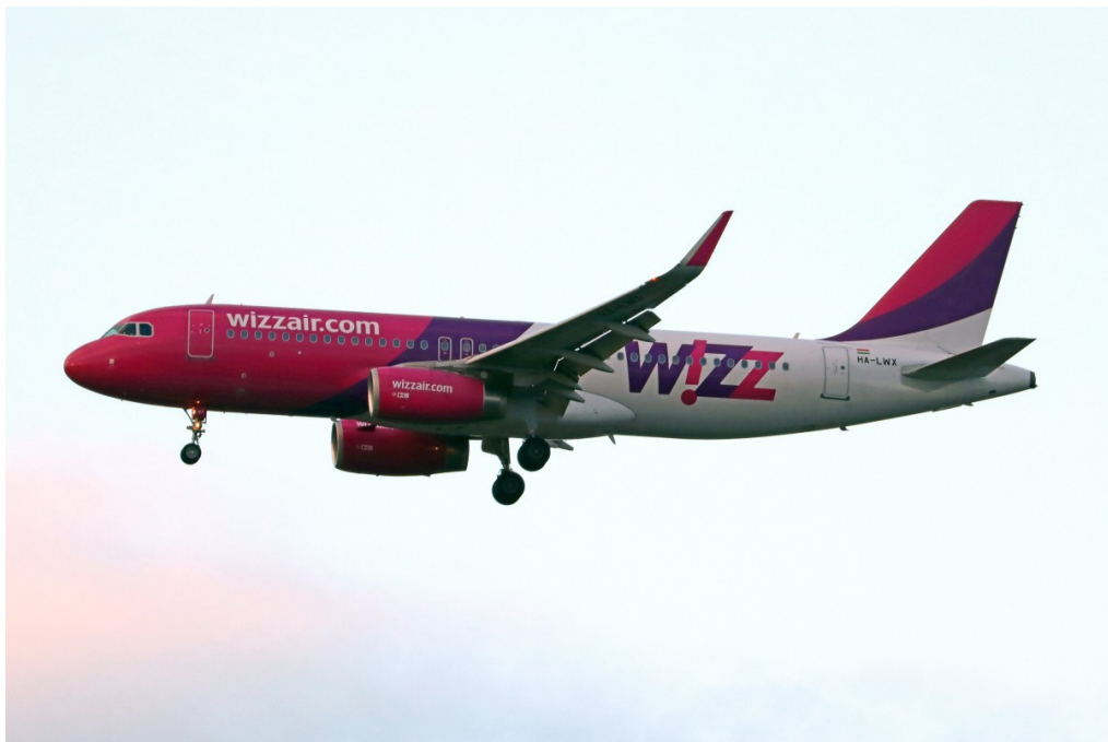
HA-LWX Airbus A320 Wizz 14/07 Paul Whincup

Following a B747 running off the runway at Doncaster on 14/7, we received the following Wizz diverts (all A320):-HA-LYN(5911/60WT) arrived from Katowice/departed to Poznan, HA-LWX(949/2297) arrived from/departed to Gdansk, HA-LPW(623/54) operated in from Poznan/departed to Katowice.