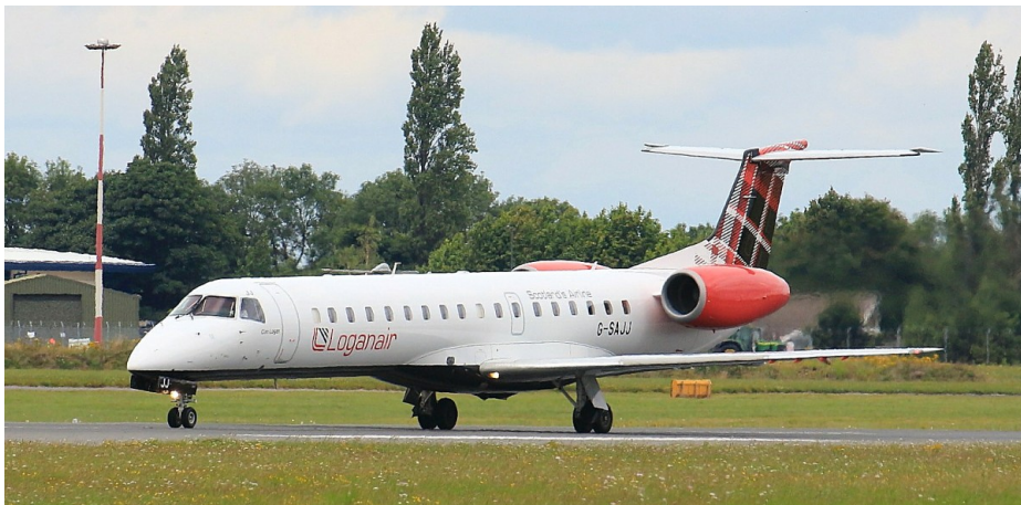
G-SAJJ Embraer 145 Loganair. 25/07

25th G-SAJJ Embraer 145 Loganair. To take S.U.F.C. to Portsmouth but went tech. (FV)